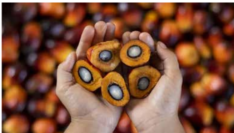
Palm oil is made from these nuts and the concern is that other manufacturers might use more of this product if animal fats are used in aviation.

"So if you put on a massive extra demand source from anywhere from aviation, in this case, the indus-