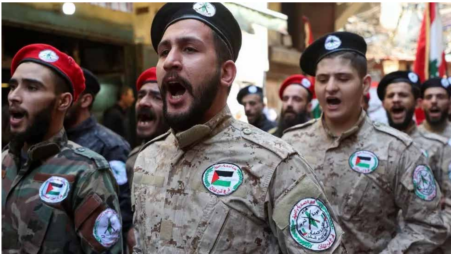
The PFLP-GC is estimated to have several hundred members operating in Syria, Lebanon and the Gaza Strip.