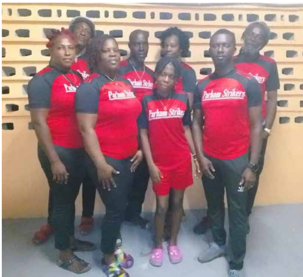
The Parham Strikers team is one of the strong contenders for the Team Three-Hand title in the ABNDA's domino league competition.

Bolans Revellers and Legacy with 290 points apiece. The Bolans Revellers C Team gained 64 points while Legacy scored 74 points in their latest matches.