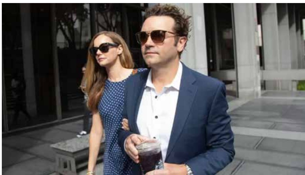
Masterson arrives at the Los Angeles court to learn his fate with his wife, Bijou Phillips.

vestigation by the Los Angeles Police Department. Prosecutors did not file charges in two other cases because of insufficient evidence and the statute of limitations expiring.