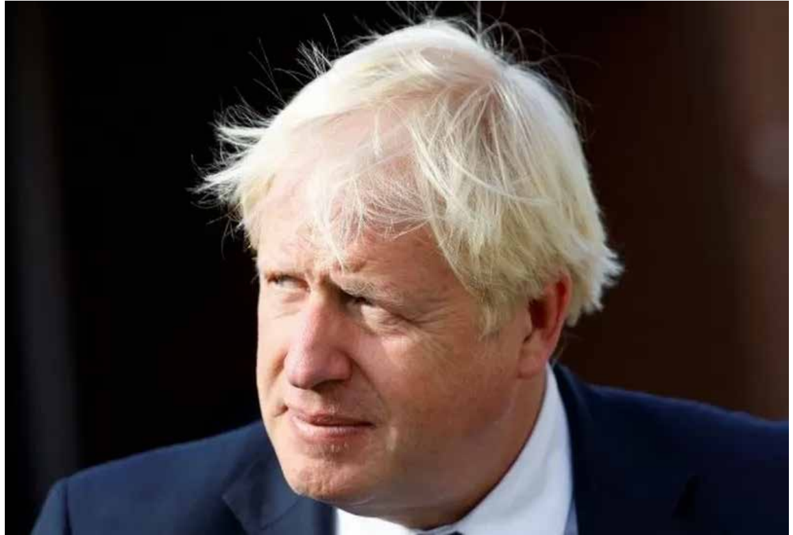
Former UK Prime Minister Boris Johnson.

The standoff could lead to a legal battle between the Cabinet Office and the inquiry, with the courts deciding what material is made