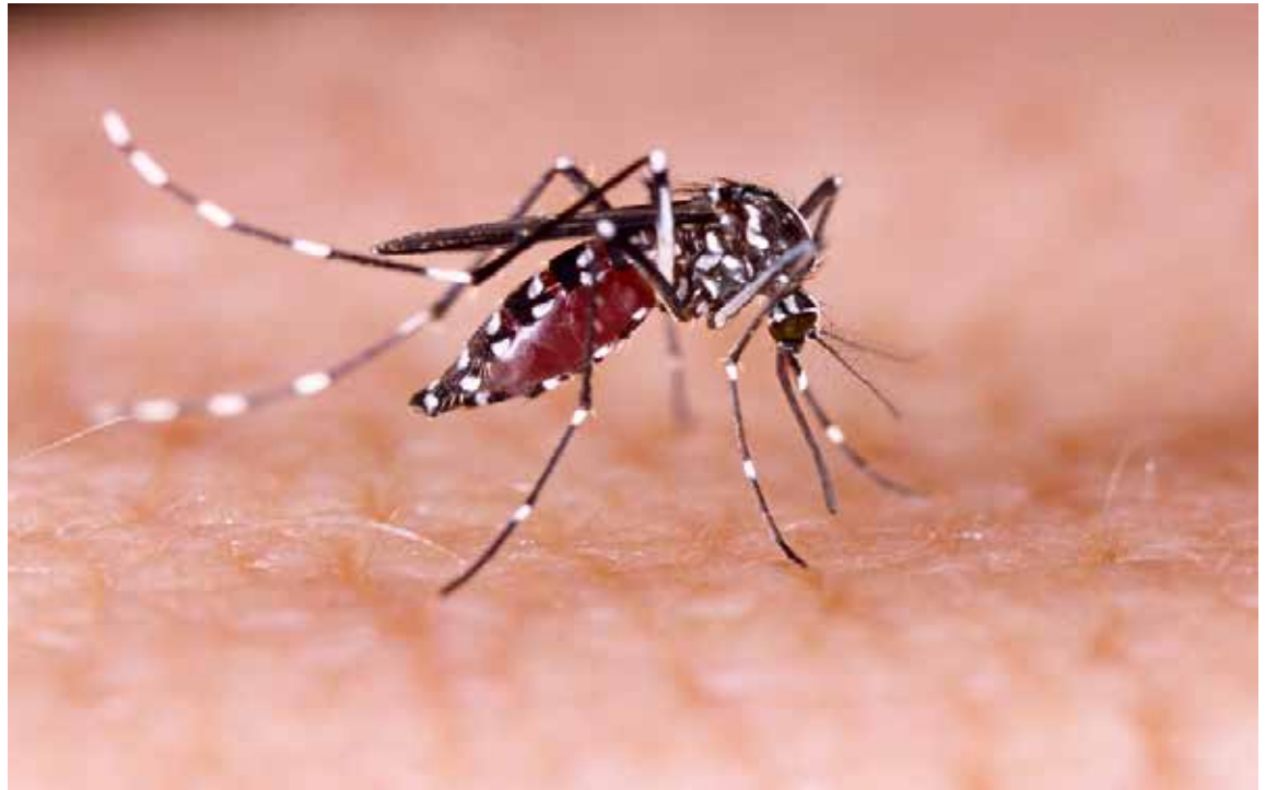
Aedes Aegypti Mosquito.

The CMO added that while there have been intensified public education and vector control measures to assist with the control and prevention of further in-