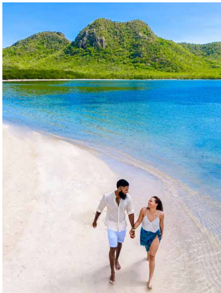
During Antigua and Barbuda's Romance Month in June, couples arriving in Antigua for a romantic getaway will be whisked through the 'Love Lane' at the V.C. Bird International Airport.