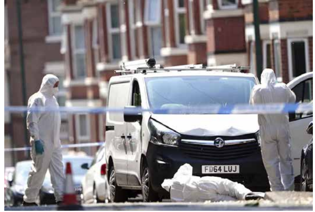
Police forensics officers search a white van on the corner of Maples Street and Bentinck Road in Nottingham, as three people have been found dead in the city in what police described as a "horrific and tragic incident".