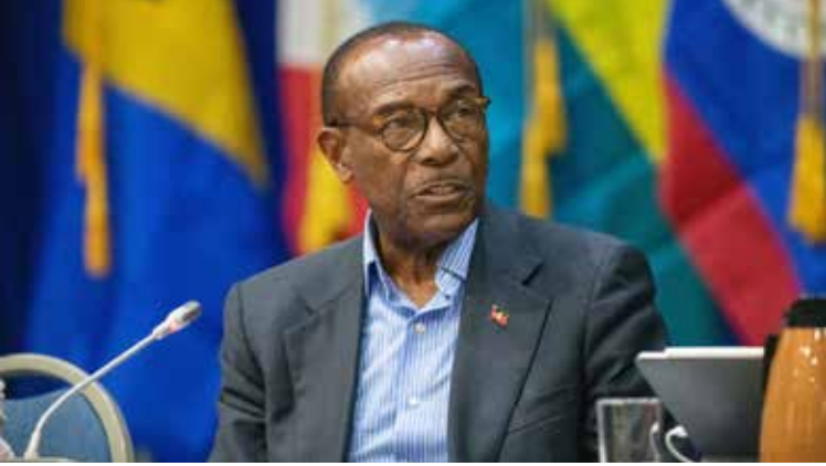
Health Minister Sir Molwyn Joseph in Bridgetown, Barbados," W a conference statement ex- D plained. m

"In recognition of the high burden of non-communicable diseases (NCDs) and mental health in SIDS countries, as well as the impact of climate change coupled with the impact of COVID-19 on health and economies in these particularly vulnerable states, WHO, PAHO, and the Government of Barbados are convening ministers from SIDS countries and partner organizations at the SIDS Ministerial Conference to be held on 14–16 June 2023