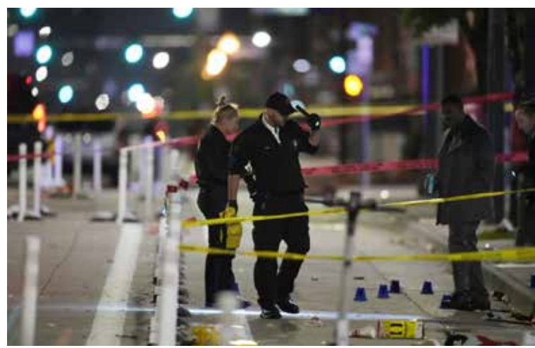
Denver Police Department investigators work the scene of a mass shooting along Market Street between 20th and 21st avenues during a celebration after the Denver Nuggets won the team's first NBA Championship early Tuesday, June 13, 2023, in Denver.