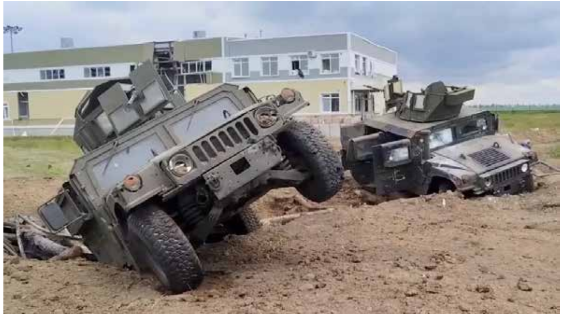
The Russian defence ministry released photos of abandoned or damaged Western military vehicles, including US-made Humvees.

In a news briefing on Tuesday, Matthew Miller added: “it is up to Ukraine to decide how to conduct this war.”