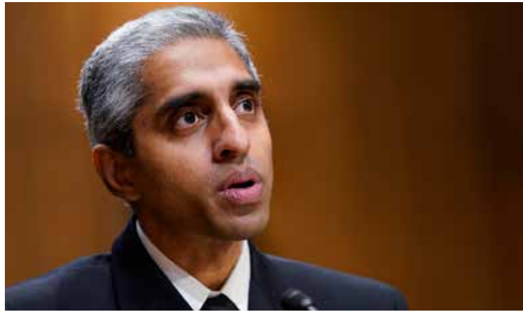
US Surgeon General Dr Vivek Murthy testifies before the Senate Finance Committee on Capitol Hill in Washington, on February 8, 2022. The Surgeon General is warning there is not enough evidence to show that social media is safe for young people — and is calling on tech companies, parents and caregivers to take “immediate action to protect kids now.”

— Create boundaries: Limit the use of phones, tablets, and computers for