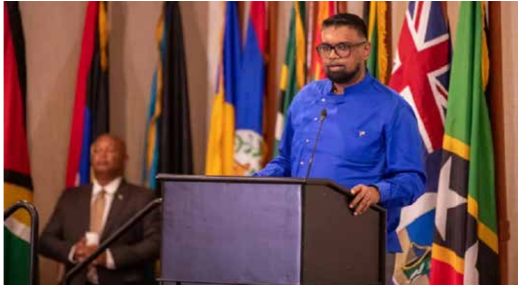
President of Guyana Dr Irfaan Ali.

Due to the severity and nature of the deaths, DNA analysis is needed to