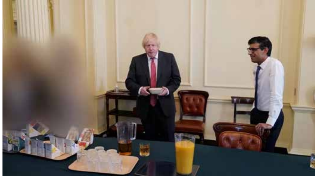
Both Boris Johnson and Rishi Sunak were fined for attending a birthday party in Downing Street.

ment have decided to make unfounded suggestions both to the police and to the Privileges Committee - many will conclude that this has all the hallmarks of yet another politically motivated stitch up.