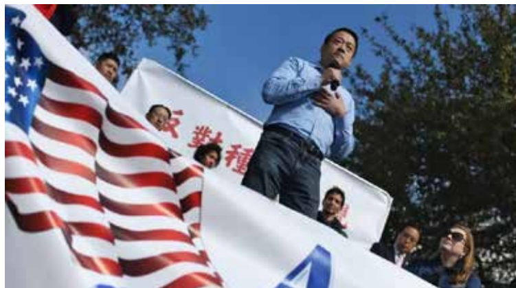
Similar bills in other parts of the country have drawn protests from Asian Americans.

The plaintiffs, represented by ACLU and two other groups, say that in practice, Florida's law will lead to broad discrimination