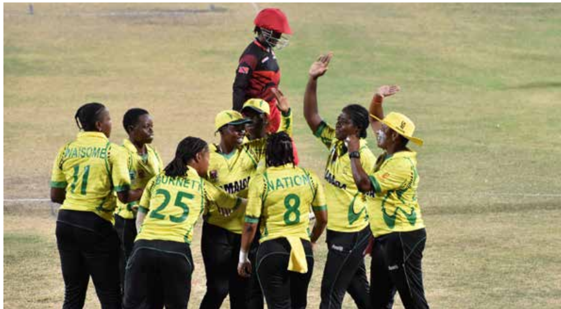
Defending champions Jamaica celebrate a dismissal of a Trinidad and Tobago Red Force batsman during their West Indies Women's T20 Blaze match at Warner Park in St Kitts on Sunday, 21st May, 2023.