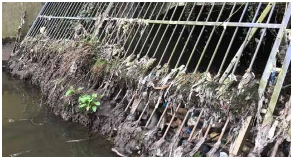
Campaigners say sewage overflows are discharging much too often.

In March a House of Lords committee said water bosses should not receive bonuses while targets were be-