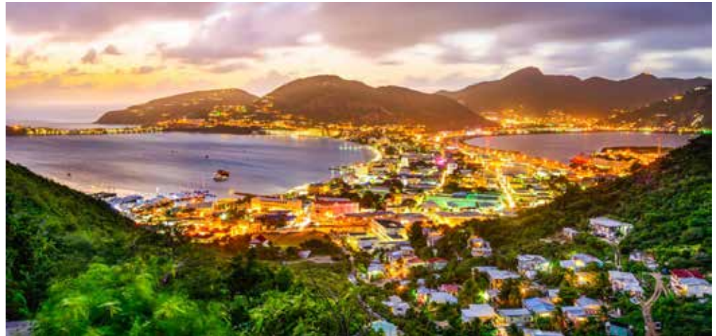
Sint Maarten

Since 2014, there have been disagreements related to the border on the island. These disagreements came about when the French contested the Dutch claim over all the water in Oyster Pond. This led to several instances of direct confrontation between authorities from both sides of the island and unfortunately strained the long-standing relationship between both governments.