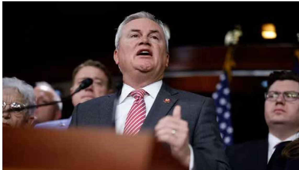
James Comer and House Republicans unveil a report into Biden family financial transactions.

The roughly 30-page report detailed what lawmakers say are various companies and financial records