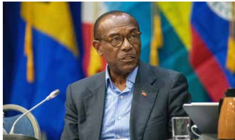
Health Minister, Sir Molwyn Joseph

However, the Cabinet has reiterated its assertion of a few weeks ago; as the largest employer, the Government of Antigua and Barbuda can provide only mod-