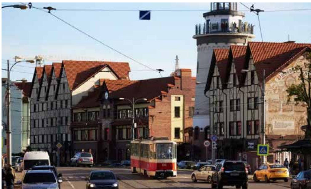
Kaliningrad is home to one of Russia's only ice-free European ports - the other is on its Arctic coast.

On Tuesday, Poland's Committee on Standardisation of Geographical Names Outside the Republic of Poland said it was recommending with immediate effect that the city be known in Poland as Królewiec and the exclave's