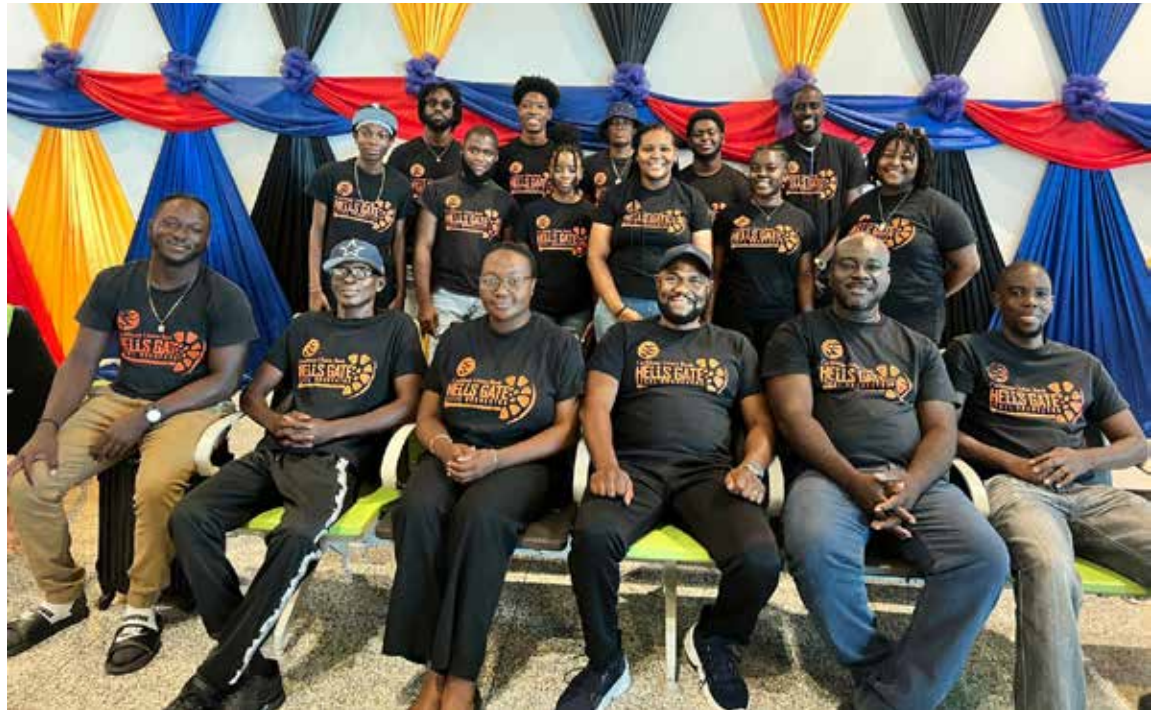
Caribbean Union Bank Hells Gate Steel Orchestra

The spokesman described the Virginia International PANFest as a celebration of Caribbean Culture