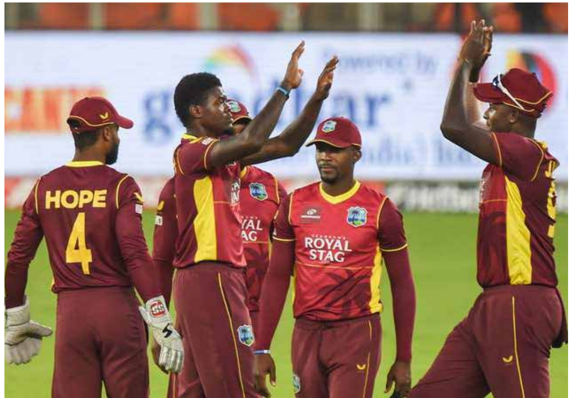
Members of the West Indies team celebrate taking a wicket during a one-day match.

"In recent months, our team has produced some sensational performances in the ODI format which