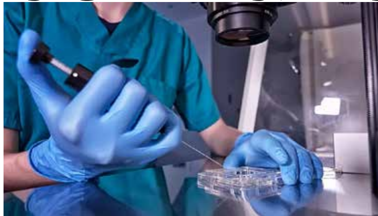
The World Health Organisation is calling for better access to fertility care around the globe.

WHO defines infertility as a failure to achieve a pregnancy after 12 months or more of regular unprotected