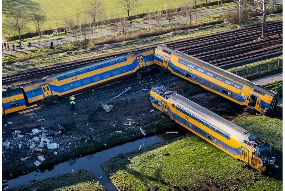
Several investigations are underway following Tuesday morning's crash.

One of the passenger carriages careered down the grassy slope, while another remained on the tracks. Most of the dou-