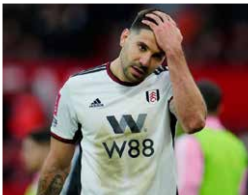
Fulham striker Aleksandar Mitrovic.

LONDON - Fulham striker Aleksandar Mitrovic has been handed an eight-match ban and a 75,000 pounds ($94,000) fine for shoving the referee during their FA Cup loss at Manchester United last month, the Football Association said yesterday (Tuesday).