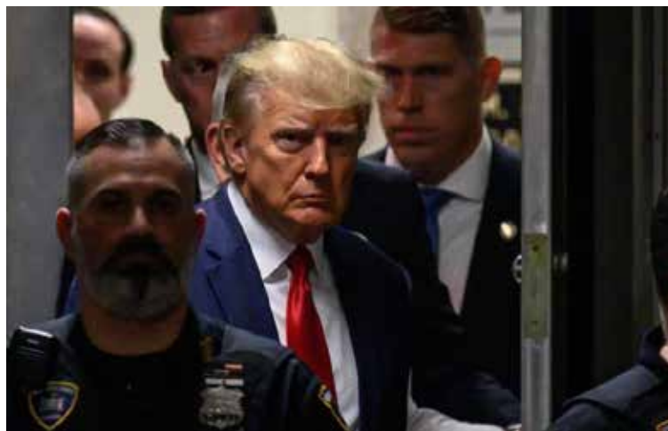
Former US President Donald Trump

Even so, the indictment amounts to a remarkable reckoning for Trump after years of investigations into his personal, business and political dealings. It shows how even as Trump is looking to reclaim the White House in 2024, he is shadowed by investigations related to his behavior in the two prior elections, with prosecutors in