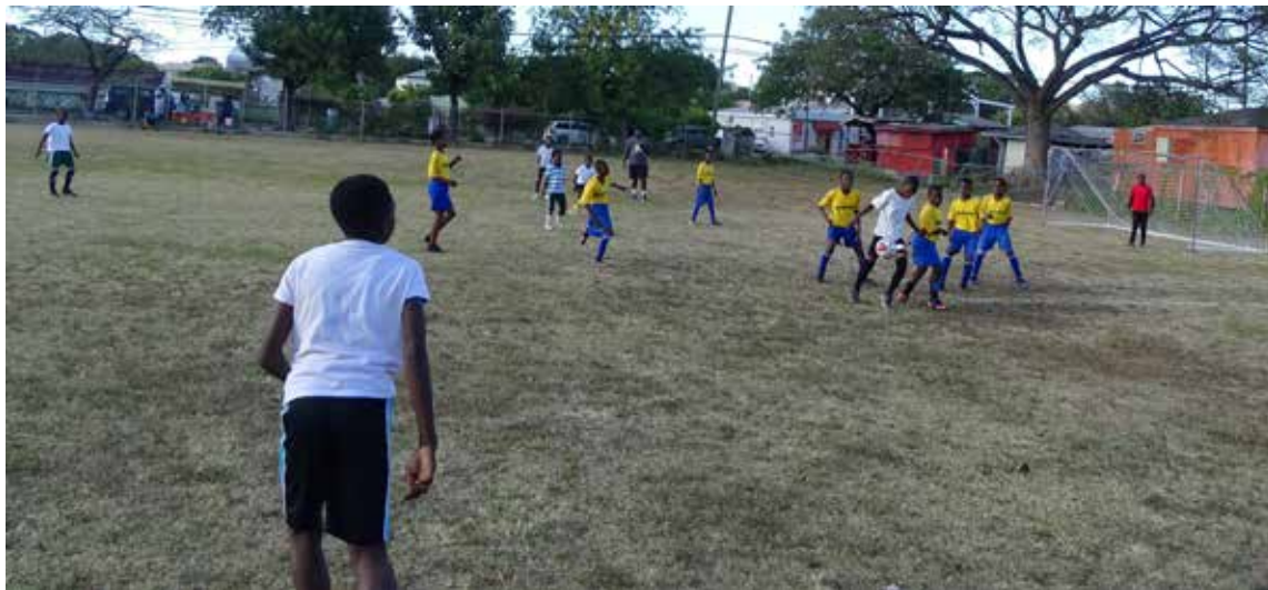
A player of Villa Primary (white and black uniform) wins control of the ball against Cedar Grove Primary during their encounter in the Primary School Cup Football Championship at the TN Kirnon School playing field on Friday, 31st March, 2023.

Old Road rebounded from their loss to Golden Grove in their previous outing to prevail 2-1 against the Foundation Mixed School while Jennings and Greenbay Primary cancelled out each other in battling to a 2-2 draw.