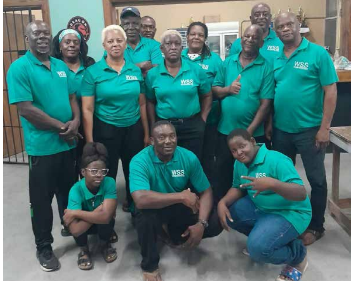
The Willikies Superstars domino team.

Eagle Warriors chalked up 78 points to clinch a narrow one-point win over Ramplers, who secured 77 points and the B Team of Willikies Super Stars with 72 points during the 9th round of matches last weekend.