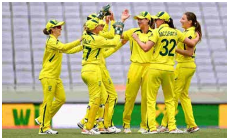
Members of the Australian women's cricket team.

"Cricket now clearly offers the best earning opportunities of any team sport