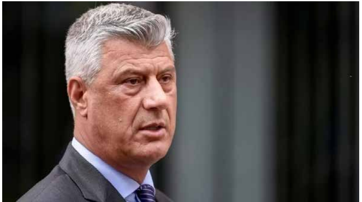
Hashim Thaci and his co-defendants have denied any wrongdoing.

Victims and human rights groups hope his trial - at a special court known as the Kosovo Special-