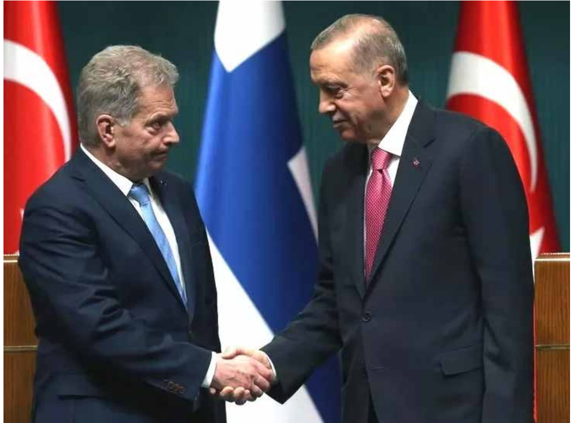
Finland's President Sauli Niinisto met with his Turkish counterpart, Recep Tayyip Erdogan, last month.

Finland's membership is one of the most important moments in Nato's recent history.