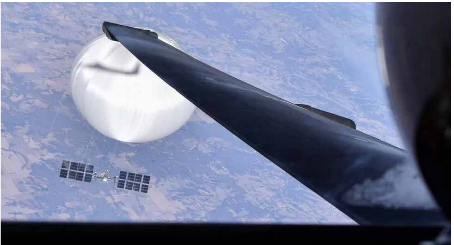
An overhead view of the Chinese balloon on 3 February, shown in a photo provided by the US department of defence.