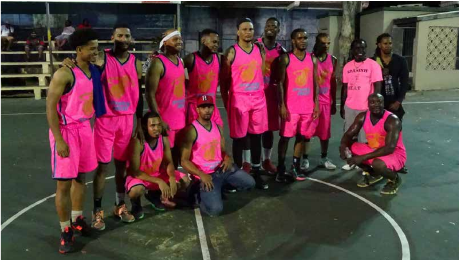
The Spanish Heat basketball team. (File photo)