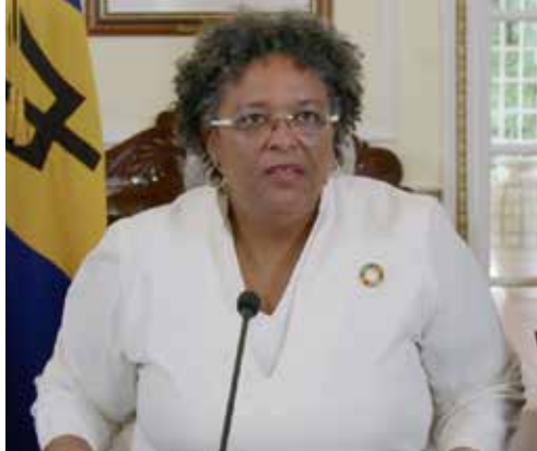
Prime Minister of Barbados, Mia Mottley.

Late last month, Trudeau and United States President Joe Biden both expressed concern about the deteriorating situation in the French-speaking CARICOM country and in a joint statement, pledged to increase community support to the people of Haiti,