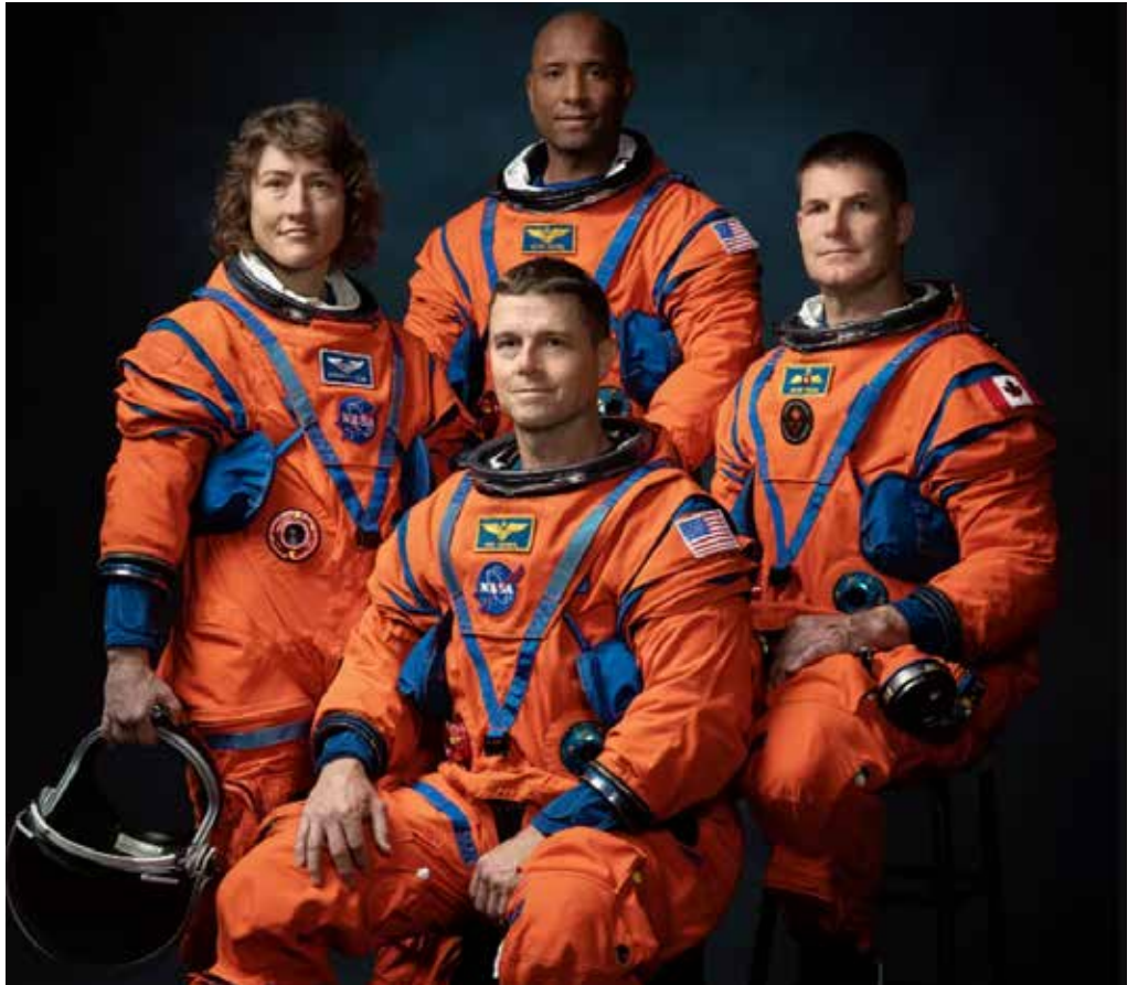
Koch, Glover (rear), Hansen and Wiseman (seated) were unveiled at the Johnson Space Center.

joining the Canadian Space Agency, he was a fighter pilot with the Royal Canadian Air Force. He has yet to fly in space.