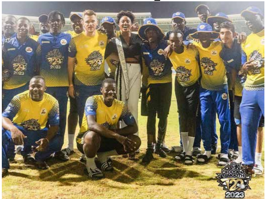
The Bolans Blasters celebrate reaching the semis after beating the New Winthorpes Lions in their last preliminary round encounter in the Cool and Smooth T20 Explosion at the Sir Vivian Richards Stadium on Tuesday, 25th April, 2023.

The Blasters became the third team to qualify for the semi-finals with identical records of four wins and three losses as they finished in