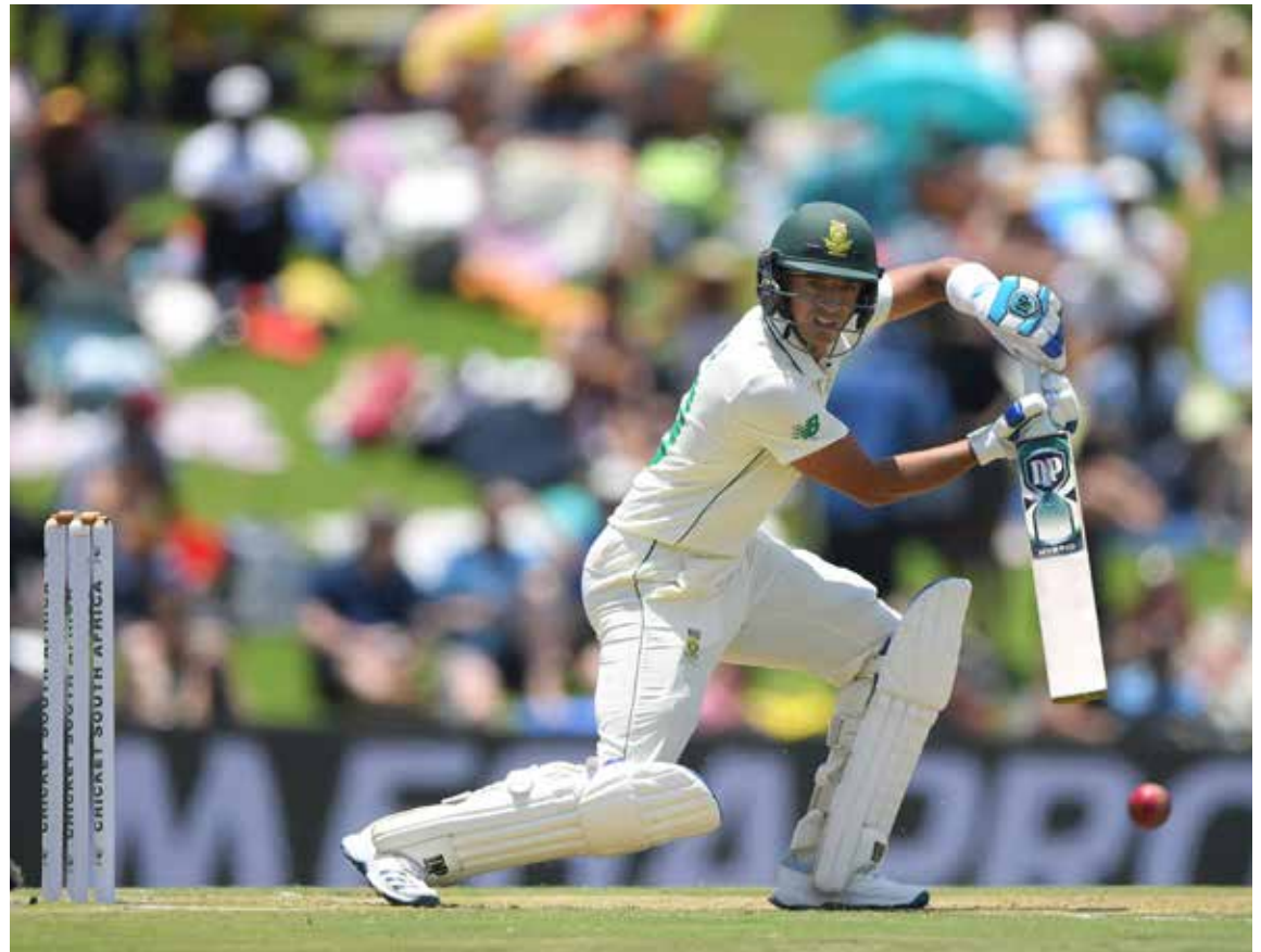
South Africa's Test batsman Zubayr Hamza is to return to international cricket in June following a doping suspension.

Former vice-captain Rahane played the last of his