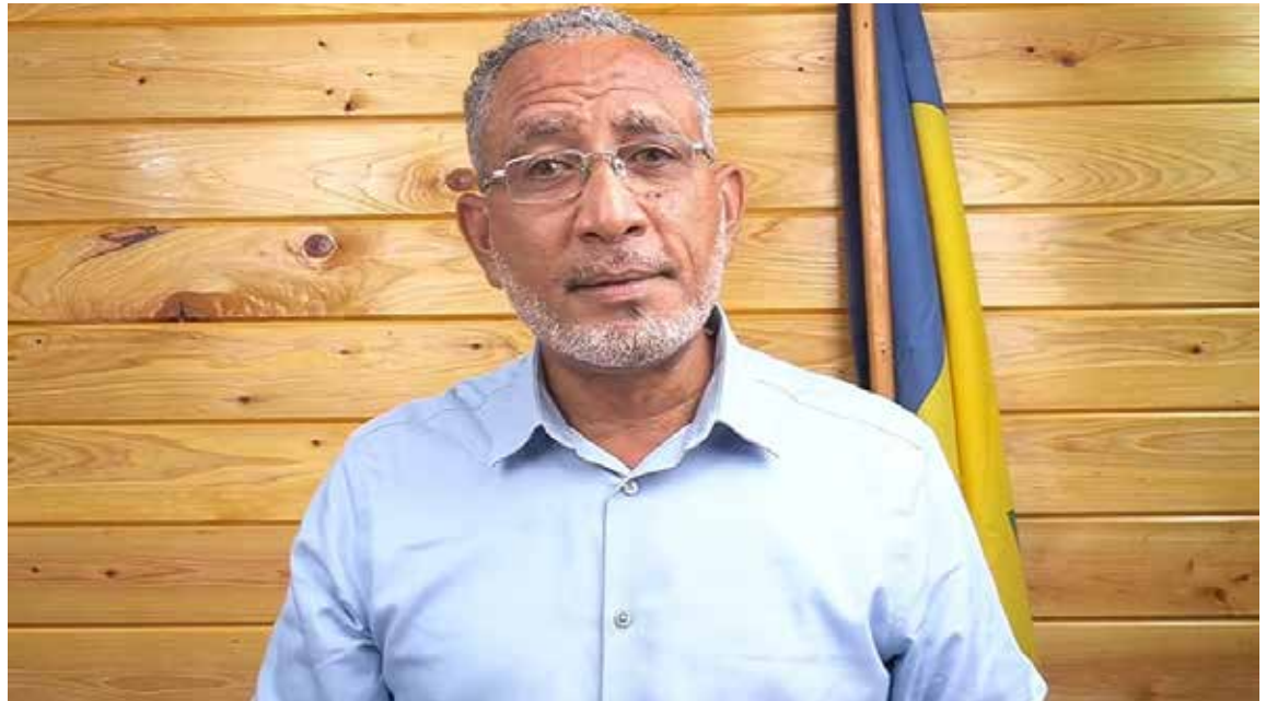
Dr Godwin Friday, Opposition leader, St Vincent and the Grenadines.

Gonsalves, who is due to inform Caribbean Community (CARICOM) leaders on Thursday regarding his meeting with the Rus-