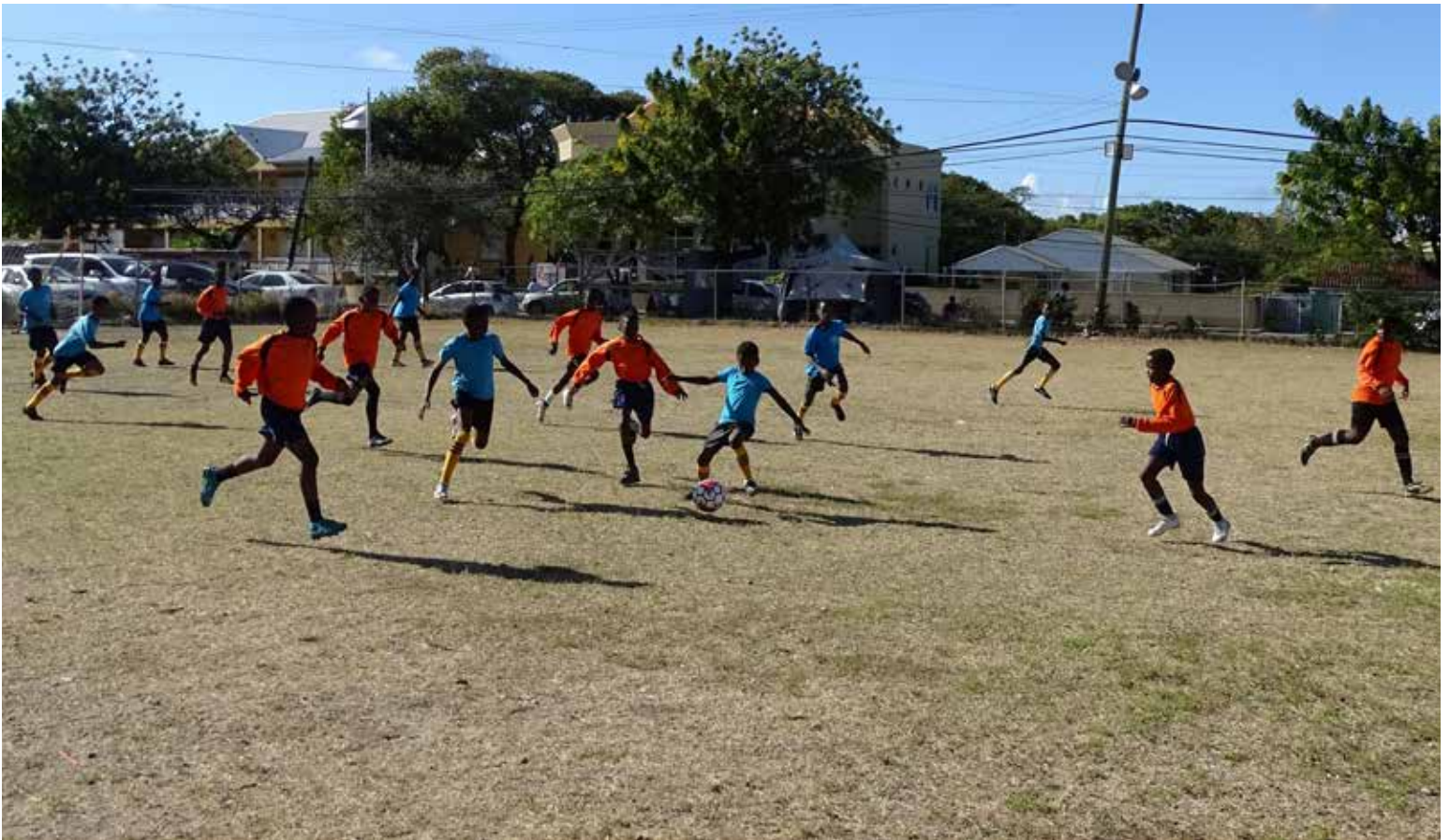
TN Kirnon Primary (orange and black uniform) remain unbeaten after the latest round of matches in the Primary School Cup Football Championship.