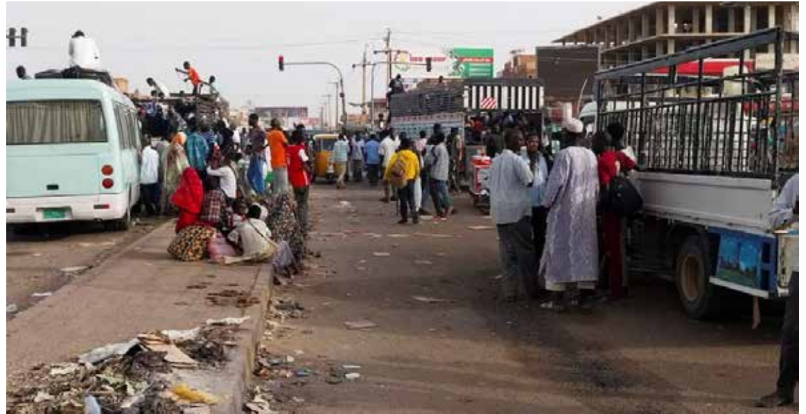
People gather in Khartoum on Wednesday.

People in Khartoum and Omdurman are finding it difficult to find clean water