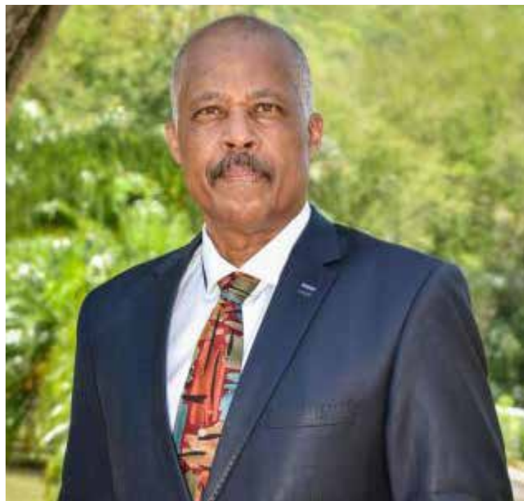
Sir Hilary Beckles

He added that while the UWI FIC is primarily a campus for the OECS, like all other UWI campuses,