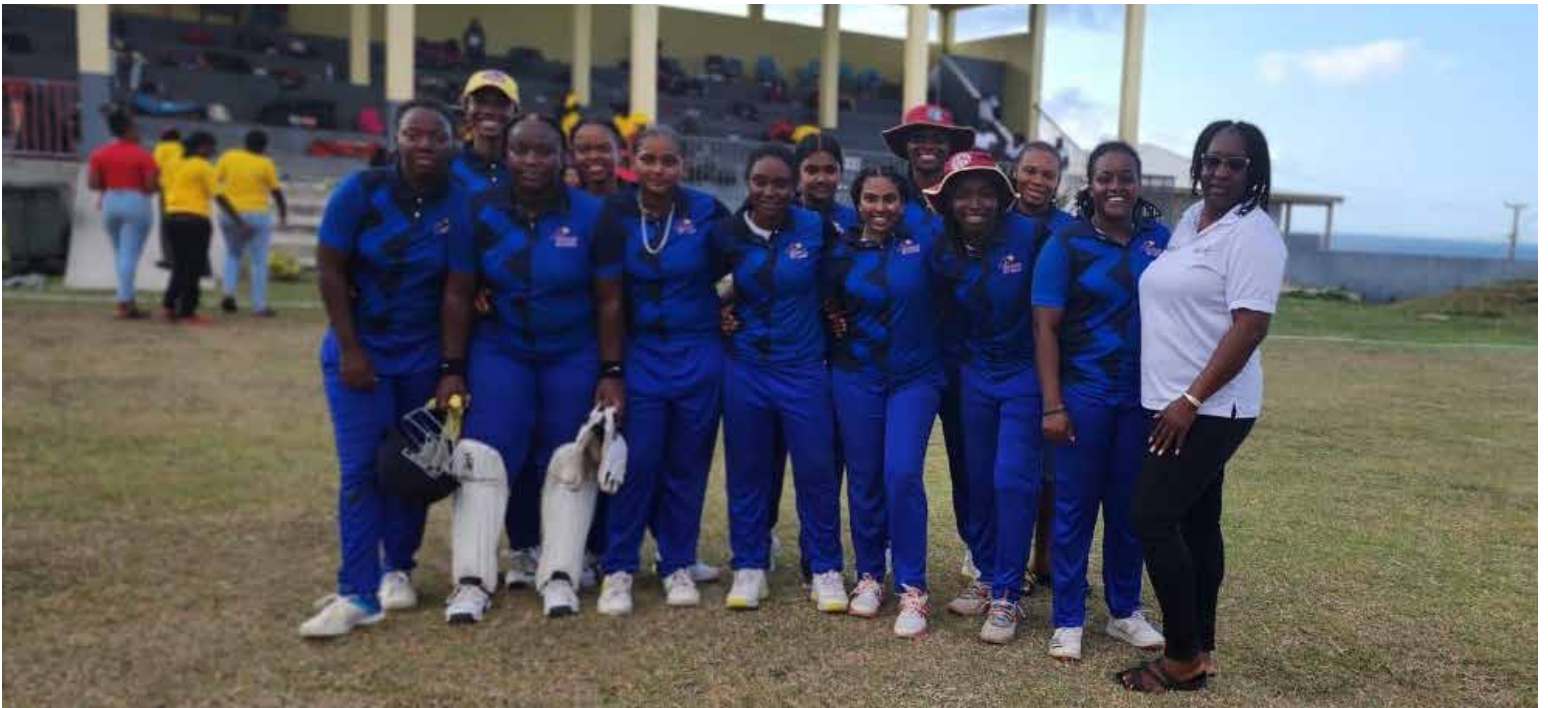
The Nevis Team which defeated Antigua and Barbuda in their LICB Women's 50-Overs Championship match at the Elquemedo Willett Park in Nevis on Tuesday, 25th April, 2023.