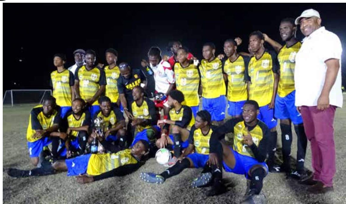
The Jennings United football team celebrate with their championship trophy after winning the second division title at the Jennings playing field on Tuesday, 18th April, 2023.

ed the coaching and managerial units for their work and the commitment and praise the effort produced by the players in a commendable display throughout their unbeaten season in which Jennings United soared to the title by winning 16 and drawing two of their 18 matches.