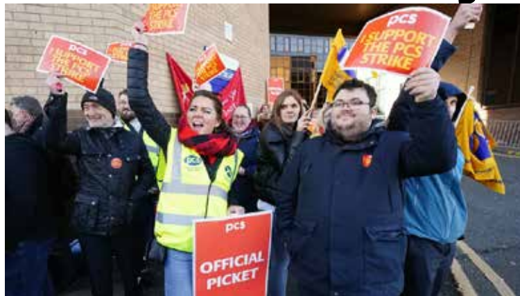
PCS members on the picket line outside the Glasgow Passport Office earlier this month.

Almost 2,000 PCS members working as passport examiners in offices in Bel-