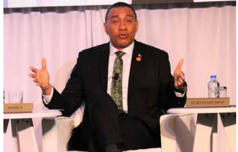
Andrew Holness, Prime Minister of Jamaica.

Speaking about the illegal flow of guns into the region, Holness said in Jamaica they seized 8,036 il-