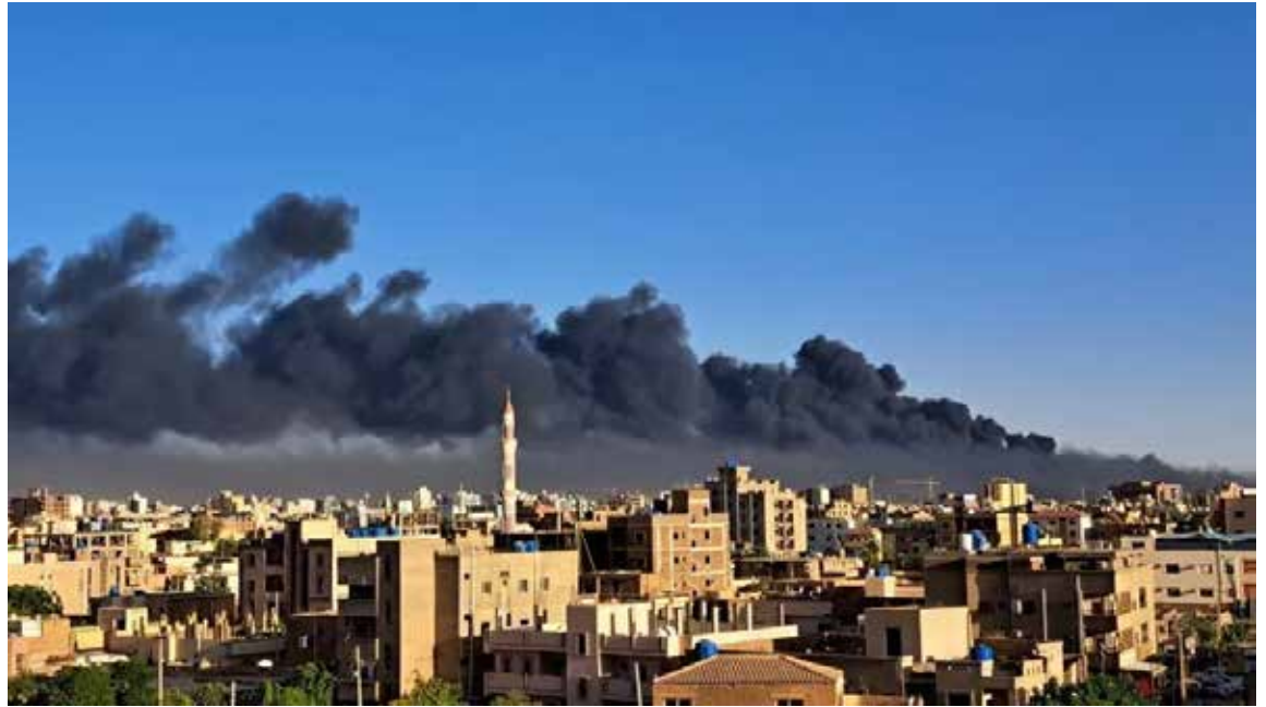
Smoke billows over the Sudanese capital Khartoum.