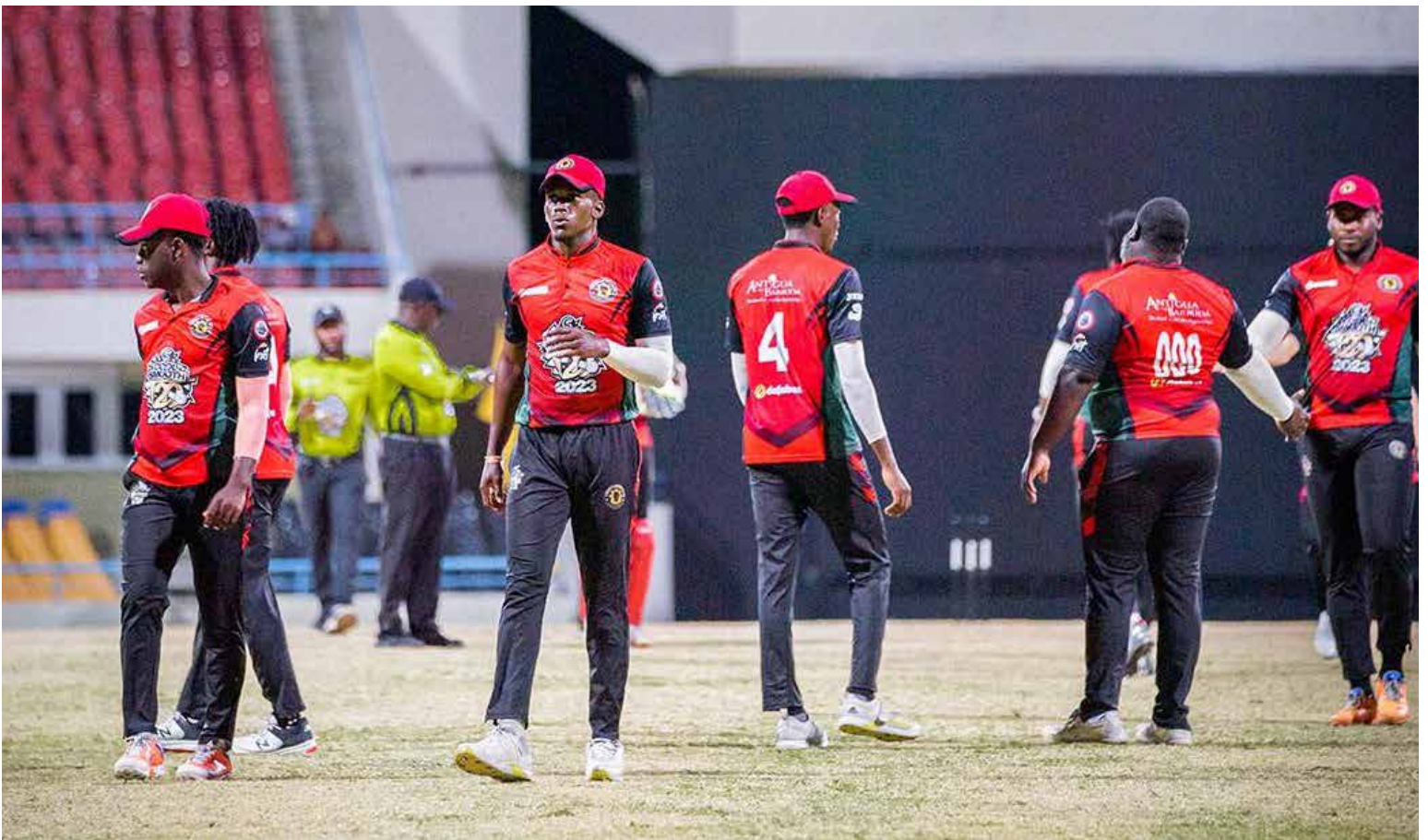
The players of the Liberta Black Hawks leave the field following their victory over Pigotts Crushers in the Cool and Smooth T20 Explosion Tournament at the Sir Vivian Richards Stadium on Tuesday, 18th April, 2023.