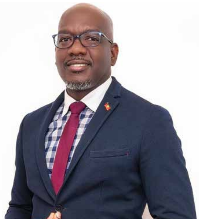
cont’d on pg 5 Education Minister Daryll Matthew

“Firstly, we must weld our ideas, our knowledge, our experiences, our values, and our resources to transform the future of this region. Welding results in oneness, it makes for stronger structures and, if done properly, the result is permanent. After seven meetings of the OECS Council of Ministers, we have made significant strides, but we have