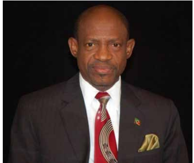
Foreign Affairs Minister Dr Denzil Douglas.

Douglas echoed the call of his small island counterparts for climate, environmental and reparatory justice since they are the ones significantly affect-