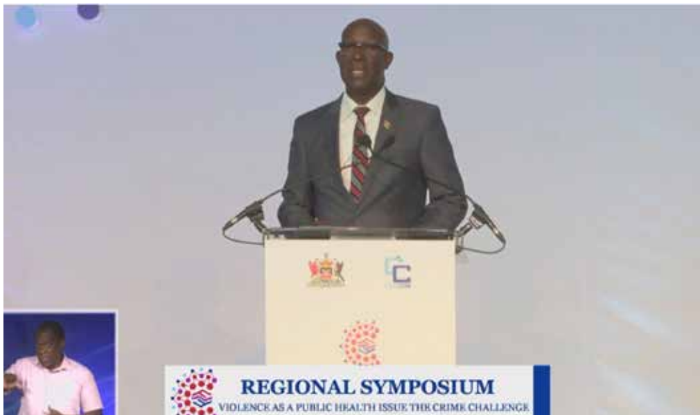
Dr Keith Rowley, Prime Minister of Trinidad and Tobago.

"Today we are saying to the United States the same way we fought with you to prevent the powder (cocaine)