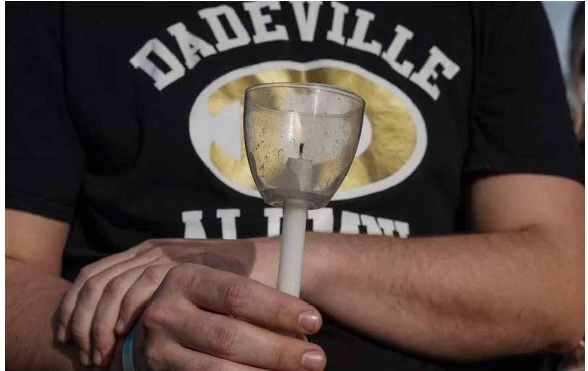
Mourners attend a vigil at the First Baptist Church of Dadeville following the mass shooting at the Mahogany Masterpiece dance studio on 16 April in Dadeville, Alabama.

“We are going to make sure every one of those