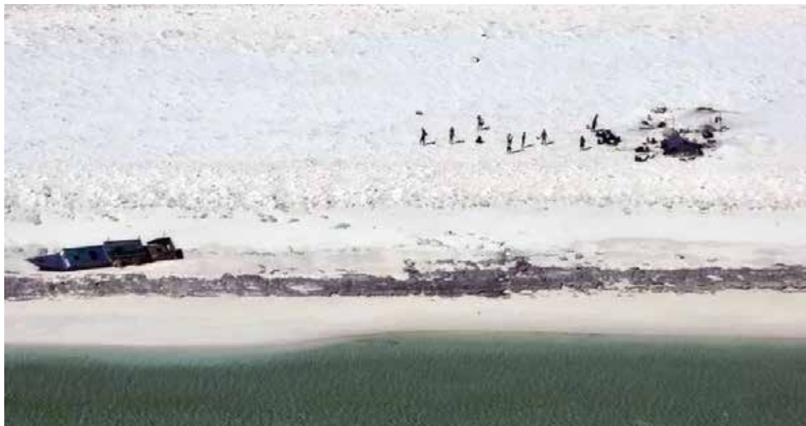
One of the two fishing boats was washed ashore on Bedwell Island.

The sole survivor is reported to have been in the ocean for hours, clinging onto a jerry can, before be-