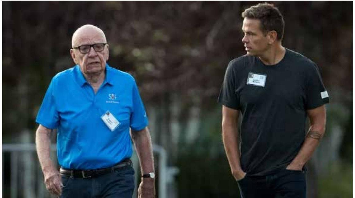
Fox chairman Rupert Murdoch (left, with son Lachlan).