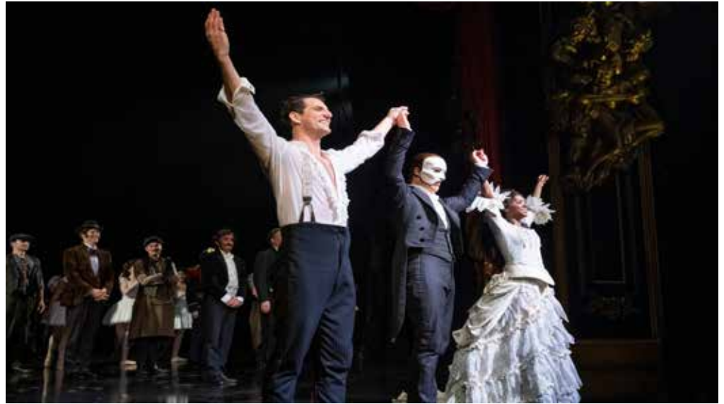
"The Phantom of the Opera" cast appear at the curtain call following the final Broadway performance at the Majestic Theatre on Sunday, April 16, 2023, in New York.

The musical — a fixture on Broadway since opening on Jan. 26, 1988 — has weathered recessions, war, terrorism and cultural shifts. But the prolonged pandemic may have been the last straw: It's a costly musical to sustain, with elaborate sets and costumes as well as a large cast and orchestra.