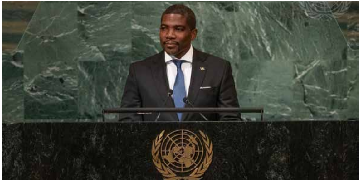
Prime Minister Dr Terrence Drew.

"We are still gathering information and so far as we are concerned there has been no loss of life and we continue to work. But at this time, we