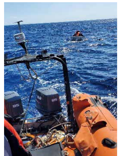
Members of the Royal Montserrat Police Service's Marine Unit rescuing two fishermen, who drifted out to sea on Saturday.

The marine unit advised fishermen and other seafarers to take precautions when going out to sea.