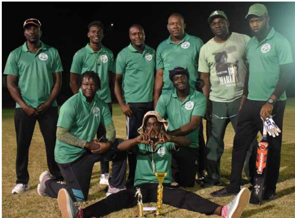
The Marko Inc/Grill Box Buckleys 3J's softball cricket team. (File photo)

Old Road then tumbled to 113 all out in 15 overs with