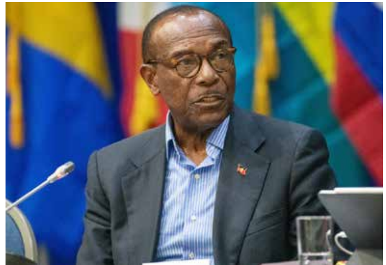
Health Minister Sir Molwyn Joseph

“The clinical operations for the Cancer Centre will be effectively suspended or terminated. In light of this, and effective immediately, no further patients will be accepted for treatment especially if their anticipated