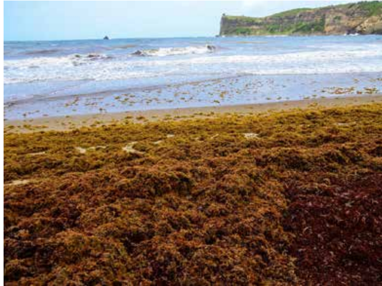
Example of Sargassum landings (Photo credit: iStock).

The outlook states the level of sargassum arriving now is already severe and is not expected to let up in the