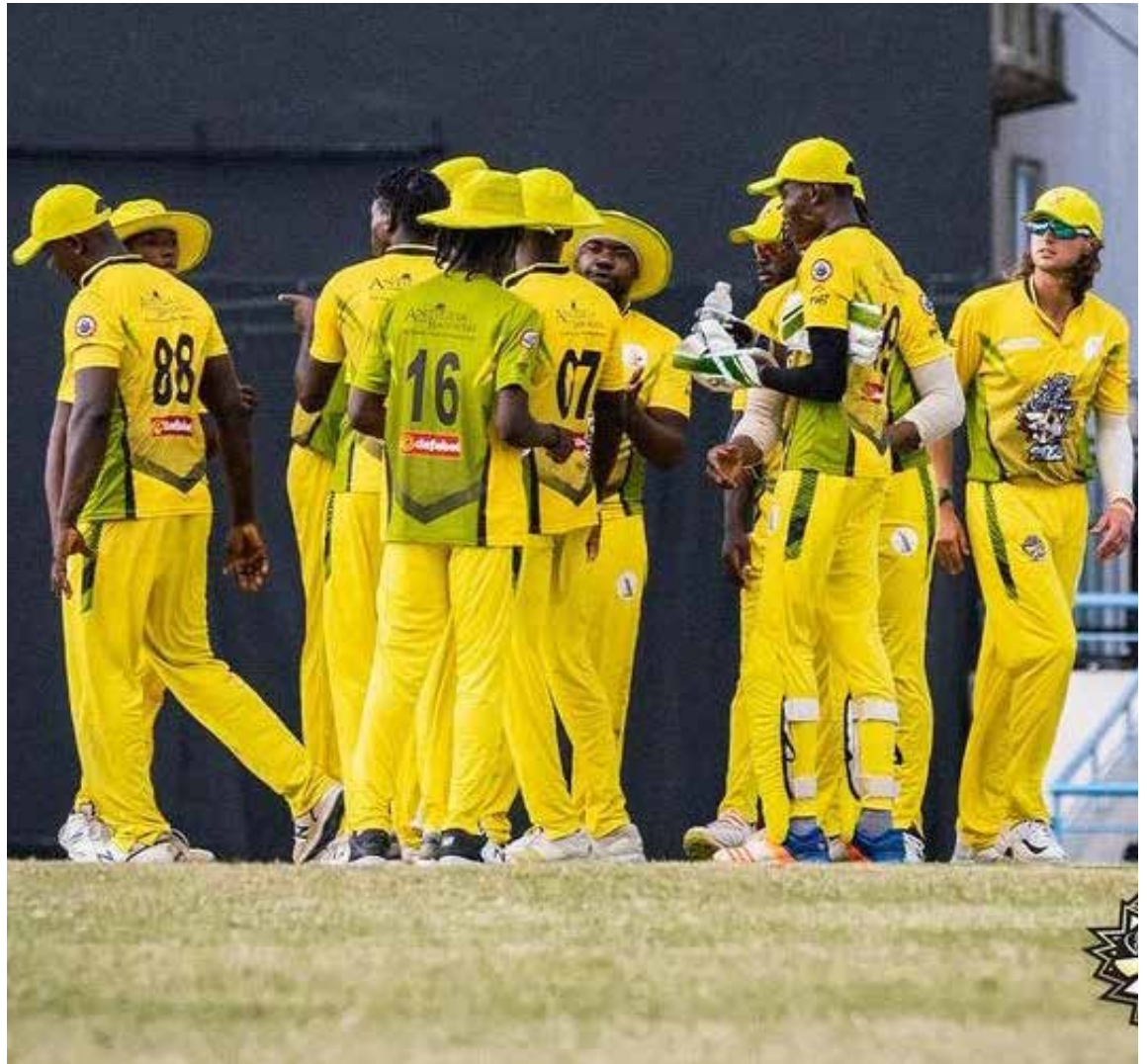
The Jennings Tigers team celebrate after picking up a wicket during their match against Bolans Blasters in the Cool & Smooth T20 Explosion at the Sir Vivian Richards Stadium on Monday, 17th April, 2023.

Jennings Tigers beat Bolans Blasters by 34 runs in the opening match on