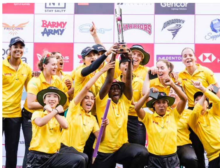
Warriors Women celebrate after winning the FairBreak Invitational title at the Kowloon Cricket Club in Hong Kong on Sunday, 16 April, 2023.

It was the second time in less than one month that Matthews was part of the winning side in a global women's Twenty20 tournament.