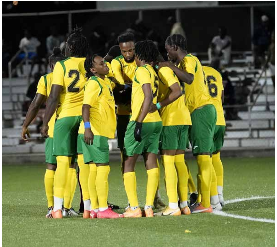
The Swetes FC team in a huddle before the start of a premier division league match at the ABFA Technical Center earlier this season.

The Blue Jays have avoided automatic relegation