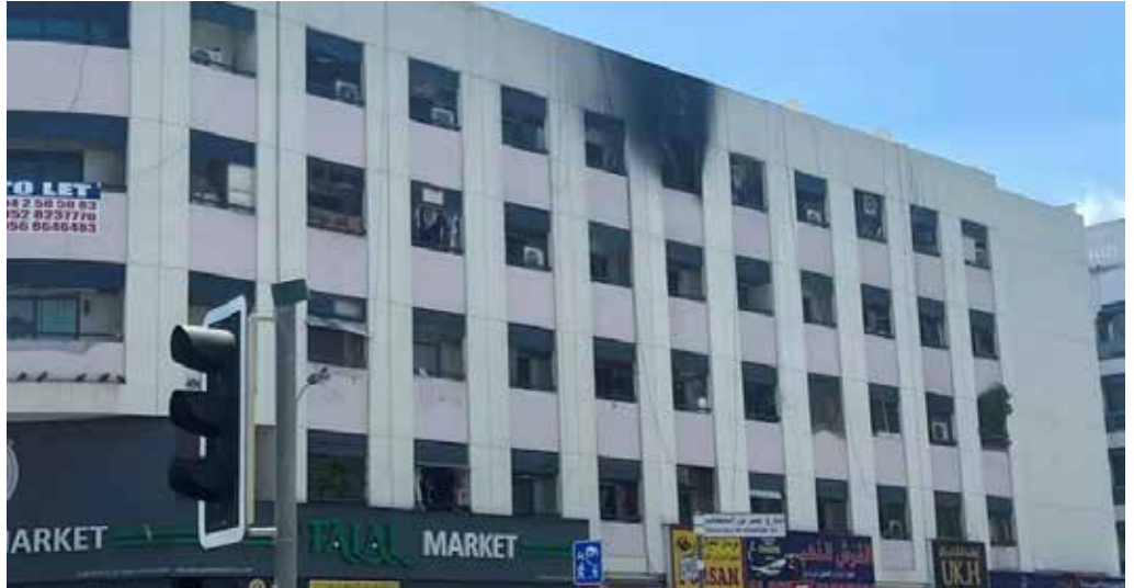
The fire happened near the Dubai Creek in one of the oldest parts of the city.

Dubai Civil Defence told UAE newspaper The National that an investigation into the deadly blaze was under way.