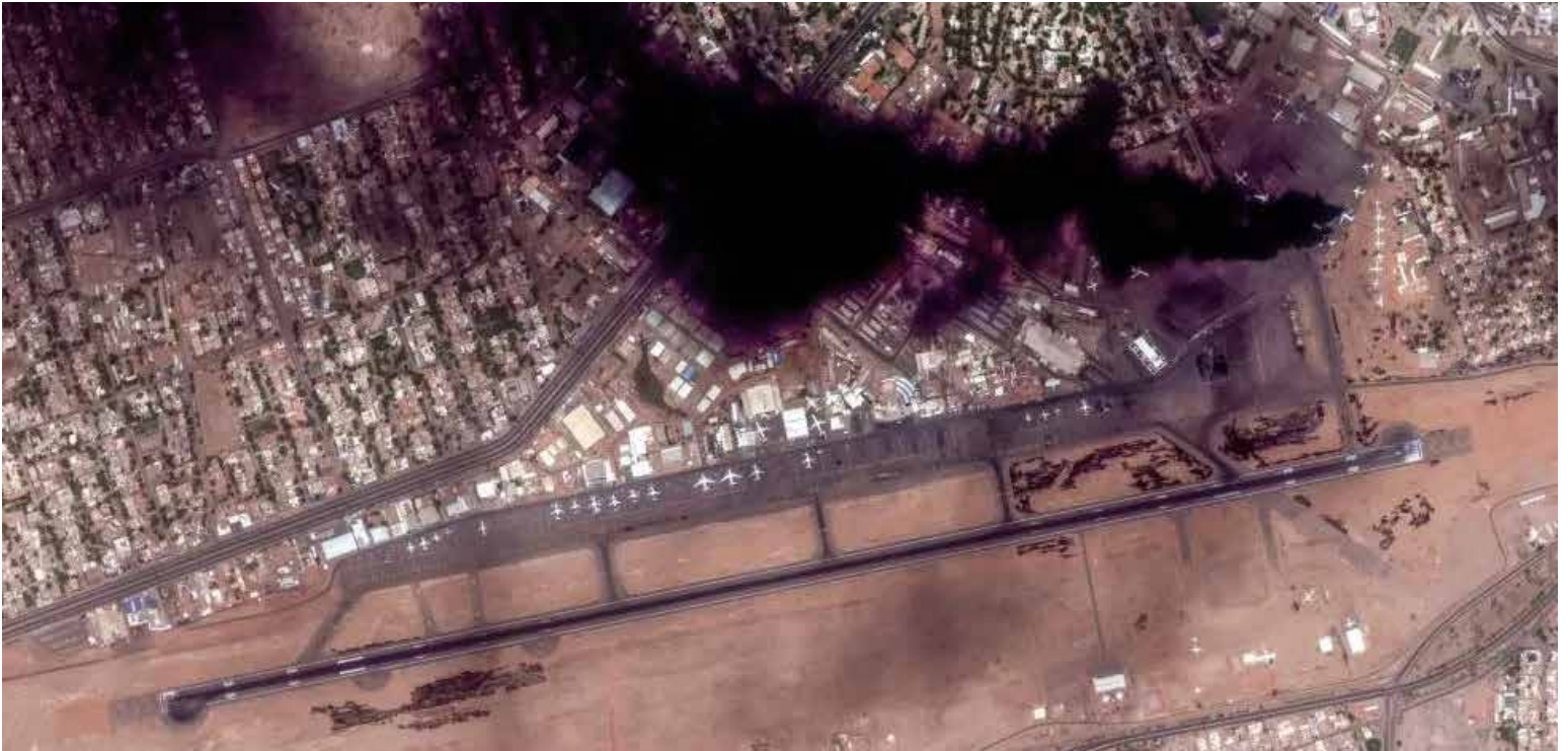
Thick black smoke was seen over Khartoum (satellite image ©2023 Maxar Technologies)