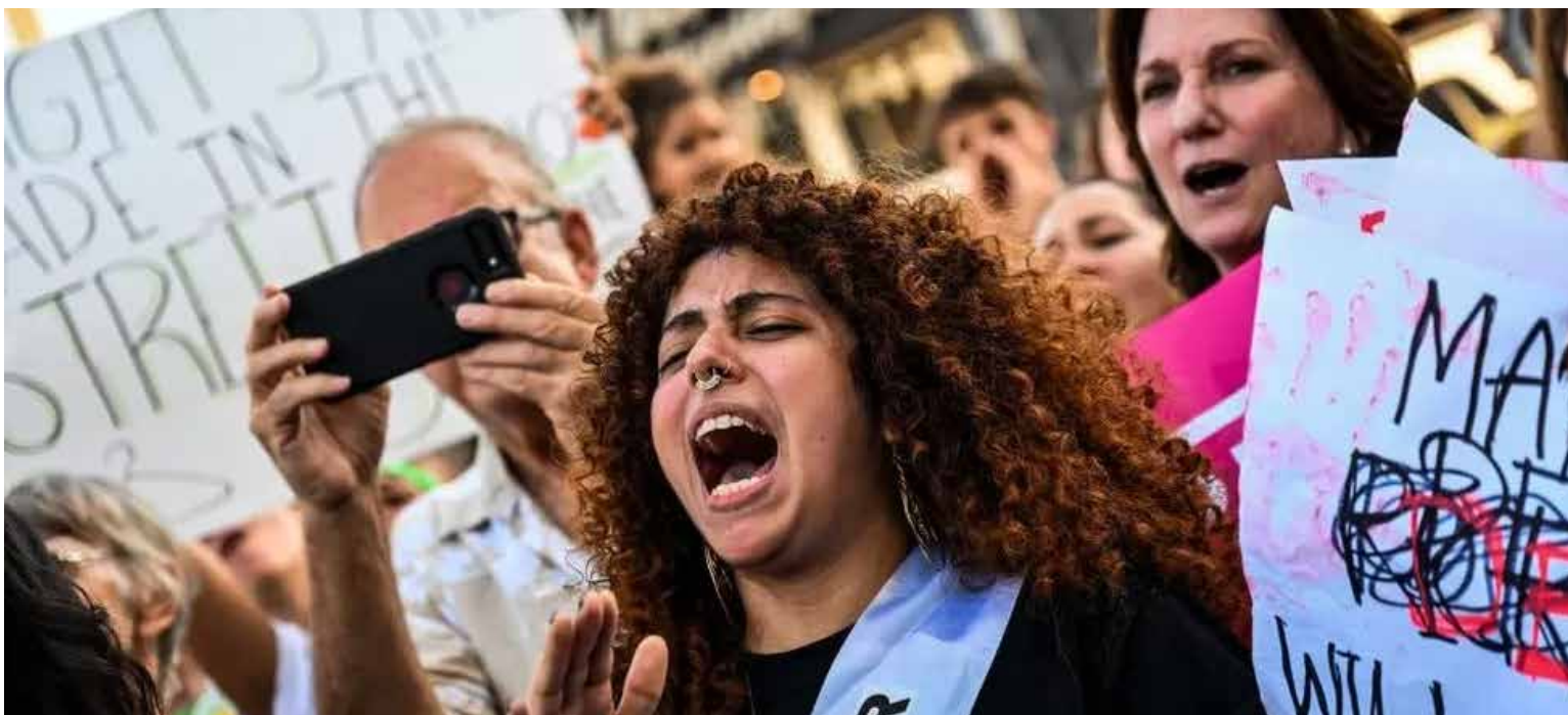
Pro-choice activists marching in Miami, Florida on 24 June.