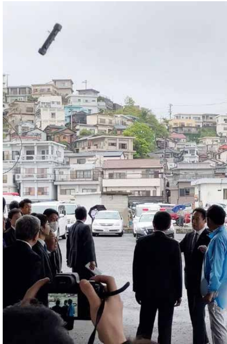
The moment the smoke bomb flew towards PM Kishida, who has his back turned.

Video from Japan's public broadcaster NHK