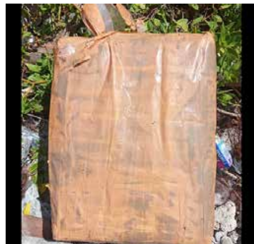
Drugs found along the Southeast Peninsula in St Kitts and Nevis.

Investigations into the matter are ongoing.