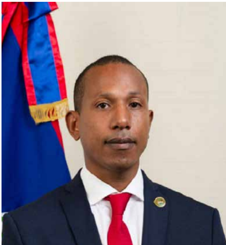
Opposition Leader of Belize, Shyne Barrow.

The opposition said the Briceno Administration must not lead Belize down a path of whimsical deci-