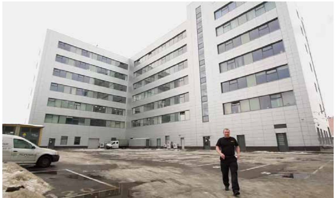
Accounts meddling into the Brexit debate and US selections were in part managed from this office building in St Petersburg, Russia.

We approached Twitter for comment but received no response other than a poo emoji - the standard auto-reply from the company to any press enquiry.