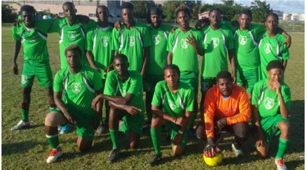
The Lion Hill football team. (File photo)