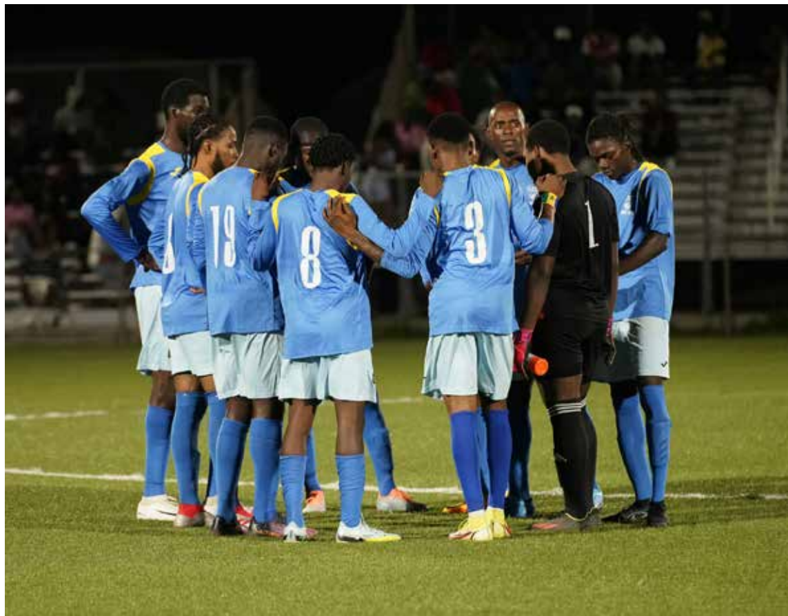
The SAP FC starting X1 in one of their premier league encounter earlier this season. SAP stunned Villa Lions 4-3 in their encounter at the ABFA's Technical Center on Saturday, 15th April, 2023.

But SAP held on to secure their 8th win in 17 matches to advance to 26 points with one game re-