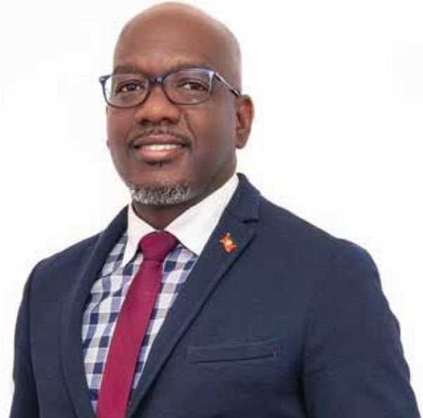
Education Minister Daryll Matthew

However, the prime minister seemed willing to look at other ways to increase the salaries of teachers and other special groups