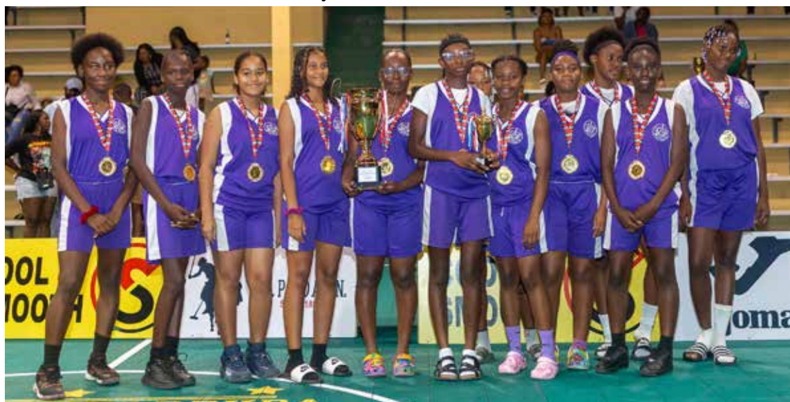
Senior Girls Division champions, the All Saints Secondary School with medals and trophies during the Inter-Schools' Basketball Night of Champions at the JSC Sports Complex on Sunday, 9th April, 2023.