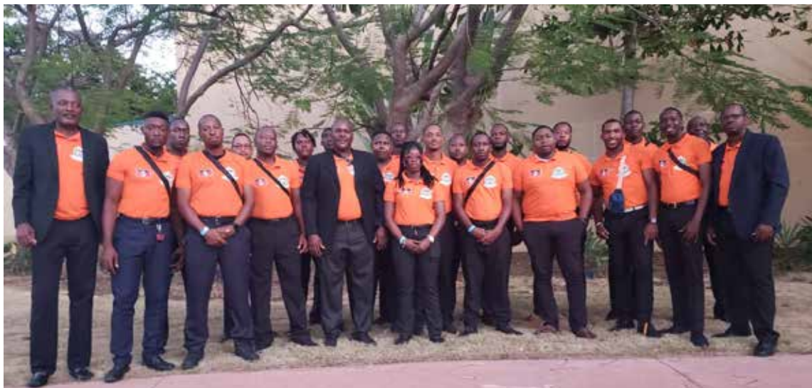
The Royal Police Force of Antigua and Barbuda cricket team which participated in the 2023 Regional Police Twenty20 Tournament in Barbados from 1st to 10th April.