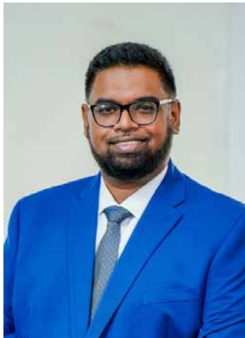
President of Guyana, Dr Irfaan Ali.

CMC - Police in Guyana said a woman has been arrested in connection with a threat made on the life of President Dr Irfaan Ali.