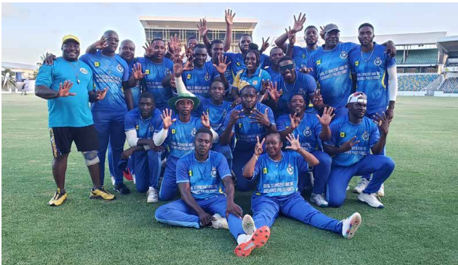
The St Vincent and the Grenadines Police cricket team celebrate after beating Grenada Police in the final to win the 2023 Regional Police Twenty20 Tournament at the Kensington Oval in Barbados on 10th April.