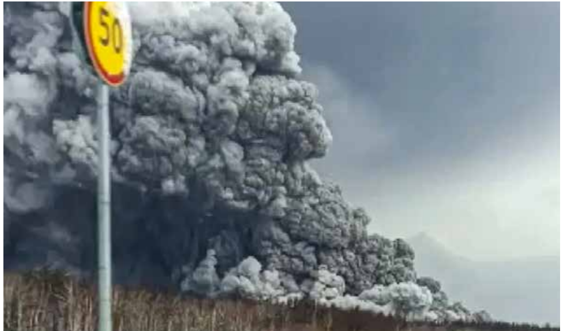
Smoke and ash are visible during the the Shiveluch volcano's eruption on the Kamchatka Peninsula in Russia, Tuesday, April 11, 2023.

Ash fell on 108,000 square kilometers (41,699 square miles) of territory, according to the regional branch of the Russian Academy of Sciences Geophysical