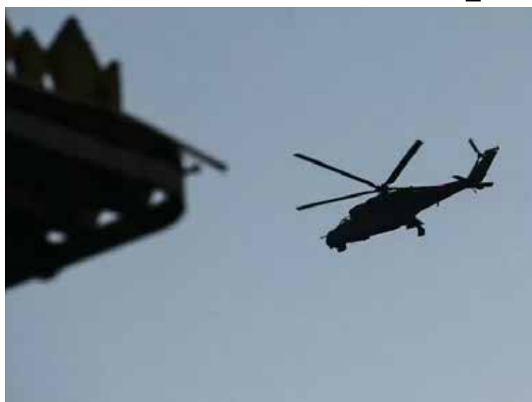
Eyewitness say the attack in Pa Zi Gyi was carried out by a jet and a helicopter gunship.

"Please call out if you are still alive, we are coming to help you," they can he heard shouting as they walked through Pa Zi Gyi