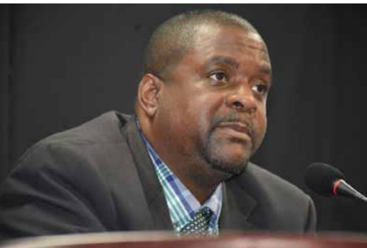
Former British Virgin Islands Premier Andrew Fahie

Former British Virgin Islands Premier Andrew Fahie, who is facing charges of drug smuggling and money laundering, has filed a motion before a Florida court to receive more flexible bond conditions ahead of his trial.