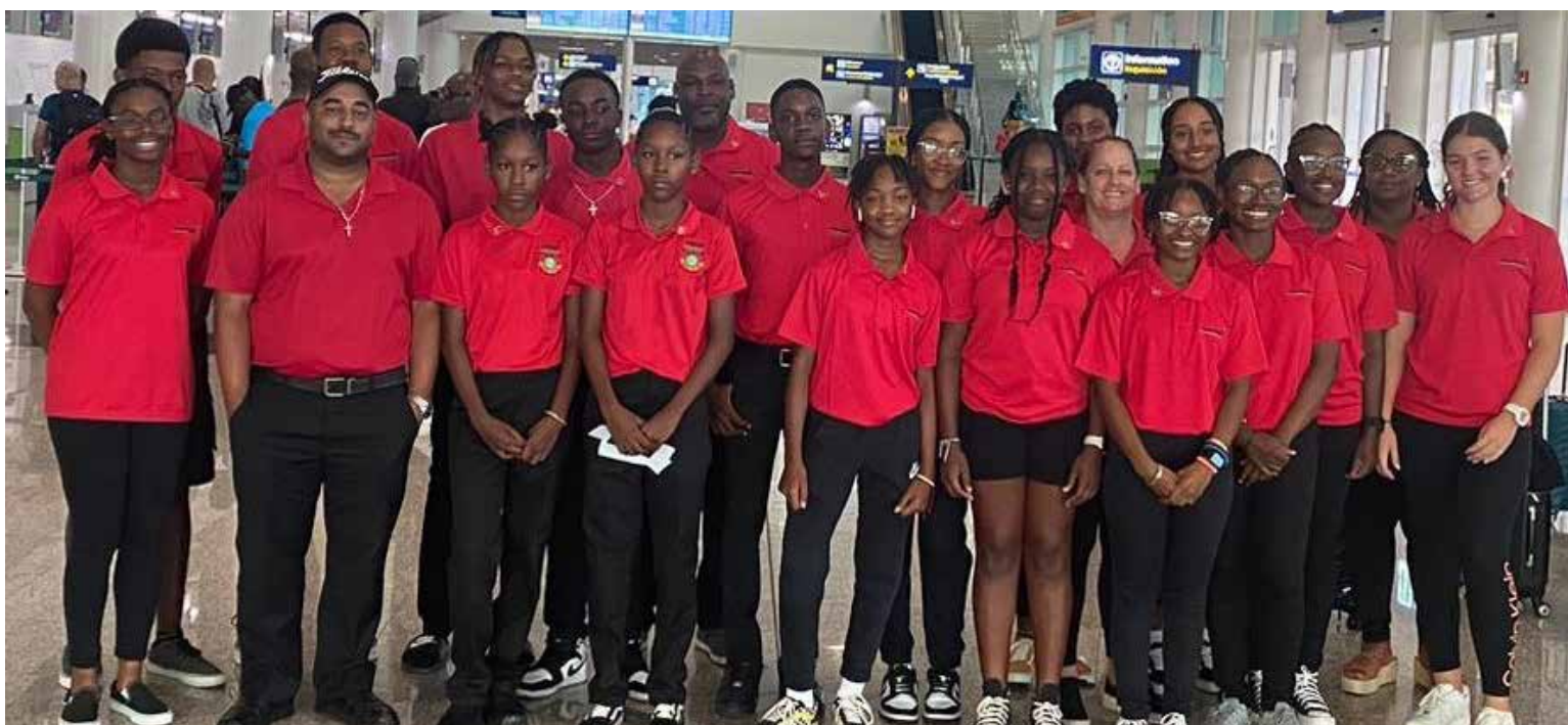
The Striving for Excellence contingent at the VC Bird International Airport prior to departing for Barbados to participate in the Annual Optimist Barbados Golf Classic on Monday, 10th April, 2023.