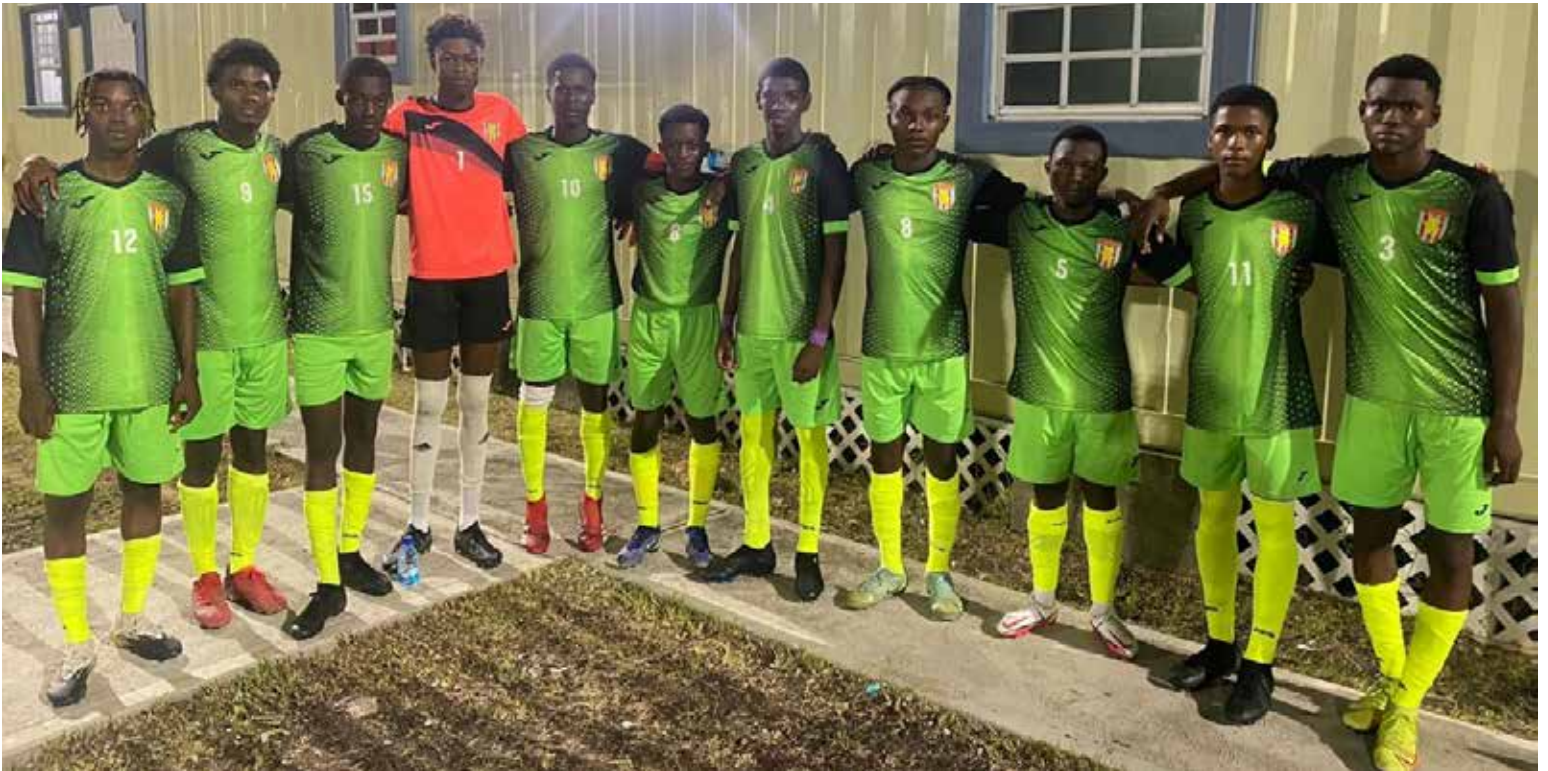
The Villa Lions football team. (File photo)