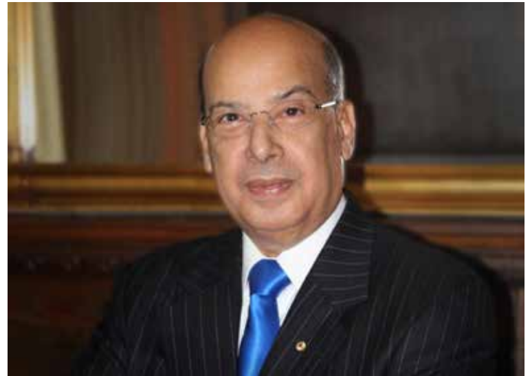
Sir Ronald Sanders

An important aspect of the 1966 Geneva Agreement was that, as the Court put it, "Guyana and Venezuela could submit the dispute to one of the means of settlement set out in Article 33 of the Charter of the United Nations, without the involvement of the United Kingdom." Article 33