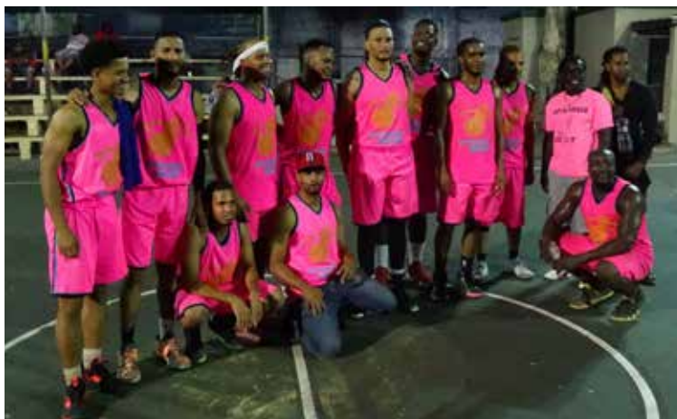
The Spanish Heat basketball team. (File photo)

Spanish Heat will enter tonight's game with a 2-0 lead after snatching an 80-78 victory against Ottos Coolers in Game Two of the finals on Saturday night.