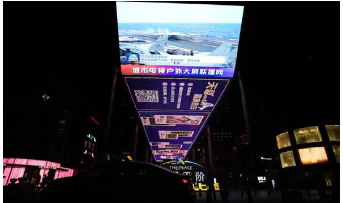
The evening news broadcast shows Chinese fighter jets on an aircraft carrier with the Chinese subtitles "Eastern Battle District successfully concludes the patrol exercise around the taiwan island and Joint Sword exercise" on an outdoor screen in Beijing, Monday, April 10, 2023. China's military declared Monday it is "ready to fight" after completing three days of large-scale combat exercises around Taiwan that simulated sealing off the island in response to the Taiwanese president's trip to the U.S. last week.

The exercises were similar to ones conducted by China last August, when it launched missile strikes on targets in the seas around Taiwan in retaliation for then-Speaker Nancy Pello-