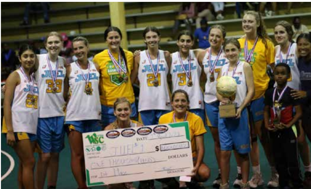
Juel 1 of Canada are the champions of the 17th Gillian Brazier Basketball Shoot-Out.

Another Canadian team, Juel 3 captured the bronze medals. Juel 3 trounced Antigua and Barbuda's Island Original Cyclones 70-32 in play-