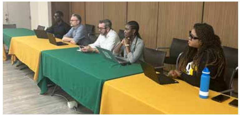
Representatives of UNHCR, IMO and PAHO