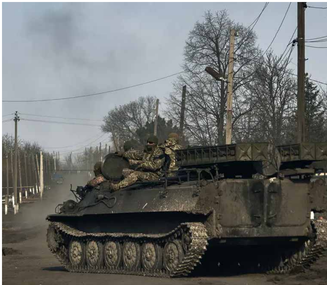
Ukrainian soldiers ride atop an APC in the heaviest battles with the Russian invaders in Bakhmut, Donetsk region, Ukraine, Sunday, April 9, 2023.