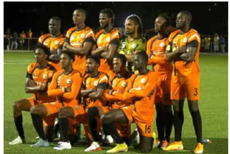
The Jennings Grenades football team.