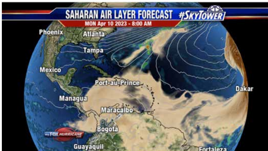
Saharan air layer forecast (Photo credit: myfoxxhurricane).

"Sensitive groups such as the elderly, children, and those with respiratory and cardiovascular ailments should take the necessary precautions," Montserrat's Disaster Management Coor-