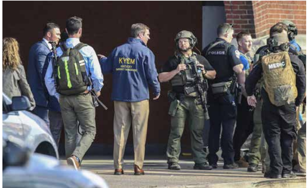
Kentucky Gov. Andy Beshear arrives at the scene of a shooting in Louisville, Ky., Monday, April 10, 2023.