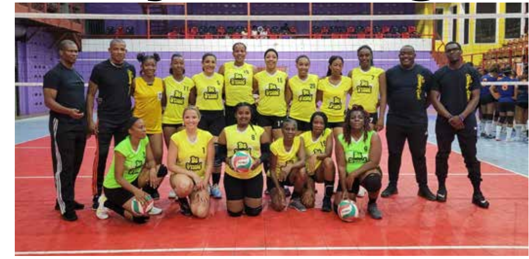
Reigning national female volleyball club champions Caribbean Alliance Insurance Da Squad. (File photo)

Reigning men's division champs Stoneville claimed their third win in four games, prevailing 3-1 against