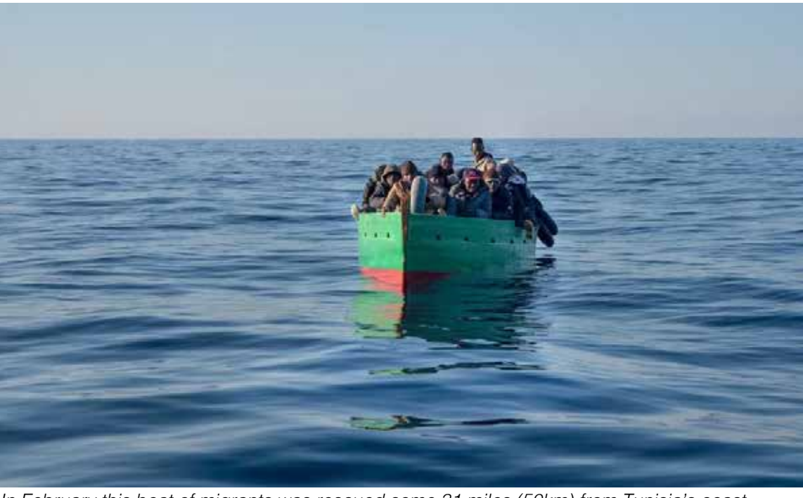
In February this boat of migrants was rescued some 31 miles (50km) from Tunisia's coast.

Tunisia has become a hub for migrants who wish to make it to Europe, with UN figures showing at least 12,000 migrants who land-