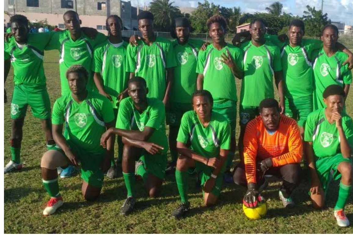
The Lion Hill Football Team.

West Ham will remain second from bottom of the 12-team competition with nine points after losing