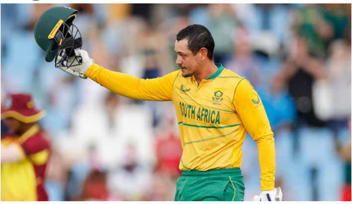
South Africa's batsman Quinton de Kock celebrates after reaching his century during the second T20 International against the West Indies at SuperSport Park Cricket Stadium, Centurion, South Africa, 26th March, 2023.

In the process, De Kock struck South Africa's quickest 50, from just 15 balls – the fifth-fastest half-cen-