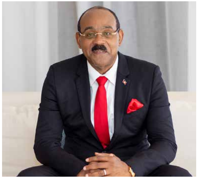
Prime Minister Gaston Browne

However, it was evident from the statements and behaviour of some of the opposition representatives, that they have failed to make the transition from political hustings to parliamentary responsibility. Yet, this transition is necessary if they wish to be seen as capable of being part of a government in the future, and if they are to engage meaningfully and construc-