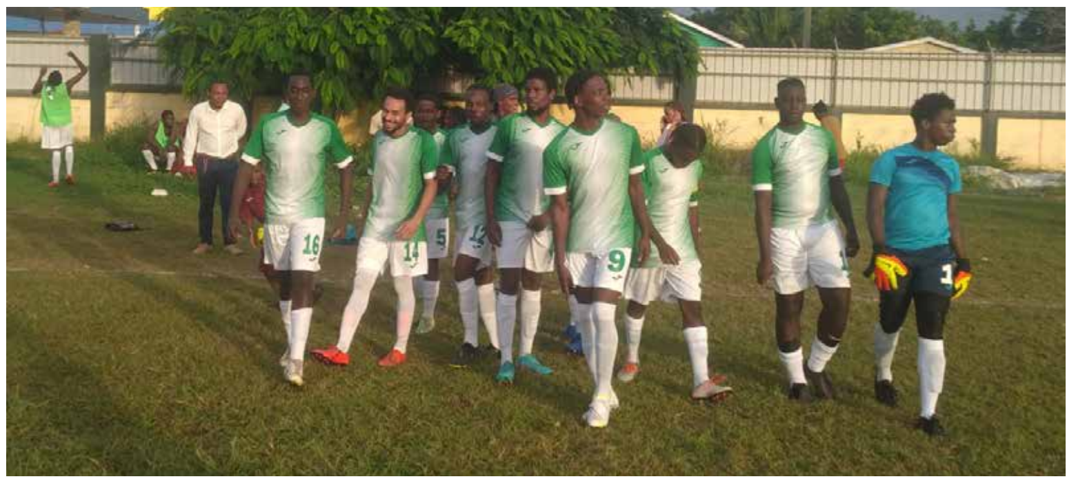
The Blackburn Palace team walk on to the field for one of their games in the second division earlier this season. Palace won their third match this season at New Winthorpes on 23rd March, 2023.