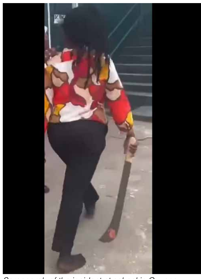
Screengrab of the incident at school in Guyana.

Loop - The Guyana Teachers' Union is calling on the Ministry of Education and Guyana Police Force to protect teachers following an incident on a school compound.