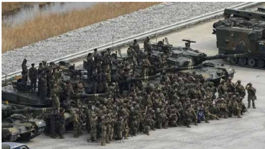
U.S. and South Korean, top, army soldiers gather before a combined live fire exercise between South Korea and the United States at Rodriguez Live Fire Complex in Pocheon, South Korea, Wednesday, March 22, 2023. North Korea launched multiple cruise missiles toward the sea on Wednesday, South Korea's military said, three days after the North carried out what it called a simulated nuclear attack on South Korea.

The Joint Chiefs of Staff said the South Korean military will maintain a firm readiness and successfully complete the rest of the drills with the