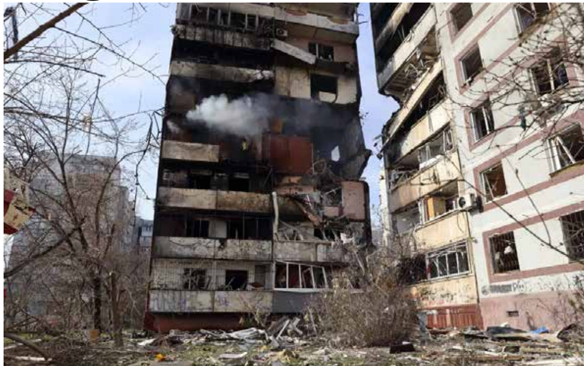
A residential multi-story building is seen damaged after a Russian missile hit it in southeastern city of Zaporizhzhia, Ukraine, Wednesday, March 22, 2023.

“Russia is shelling the city with bestial savagery,” President Volodymyr Zelenskyy wrote in a Telegram post accompanying video showing what he said was a Russian missile striking a nine-story apartment building on a busy road in the southeastern city of Zaporizhzhia. “Residential areas where ordinary people and children live are being fired at.”