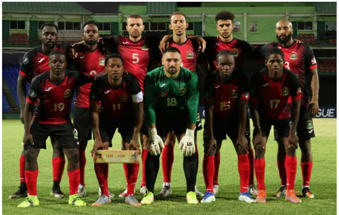
The Antigua and Barbuda Benna Boys team that beat Guadeloupe 1-0 when both sides met in the Concacaf Nations League at Warner Park in Basseterre, Saint Kitts and Nevis, on 5th June, 2022.

Victory for the Benna Boys against Guadeloupe and a win over bottom team Barbados in their final League B preliminary group match at the Sir Vivian Richards Stadium in Antigua on Sunday, 26th March,