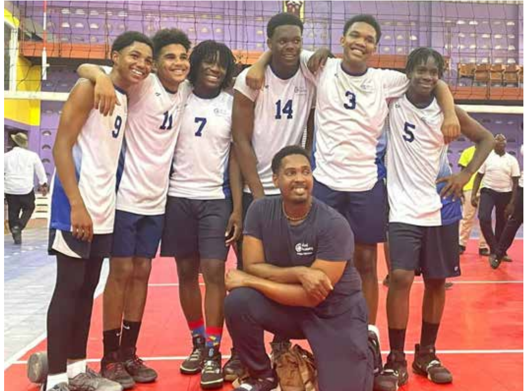
The Island Academy 2023 School boys' volleyball champions

"In terms of the level of play on the female side, we did a beginners' league for the female teams because most of them are new players. But the guys, they were a little more advanced