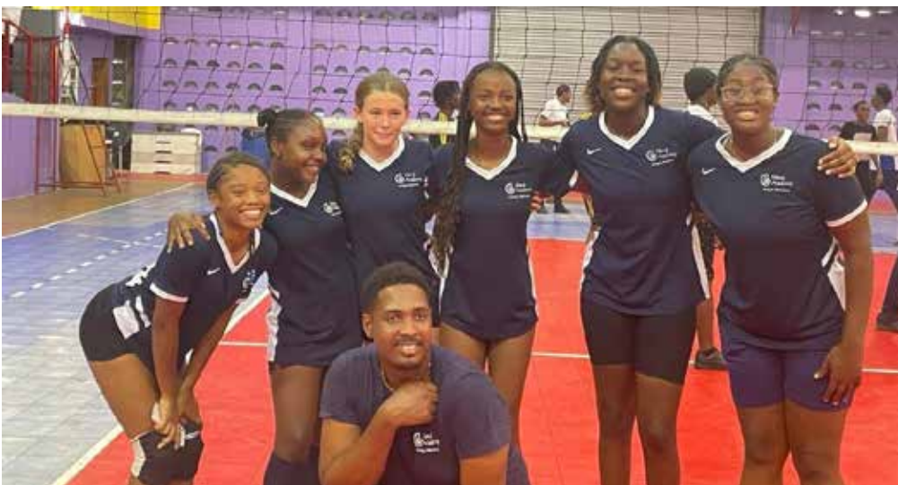
The Island Academy 2023 School girls' volleyball champions