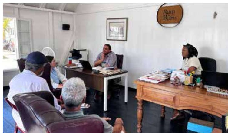
Members of the National Parks’ Heritage team in discussion with UNESCO officials.