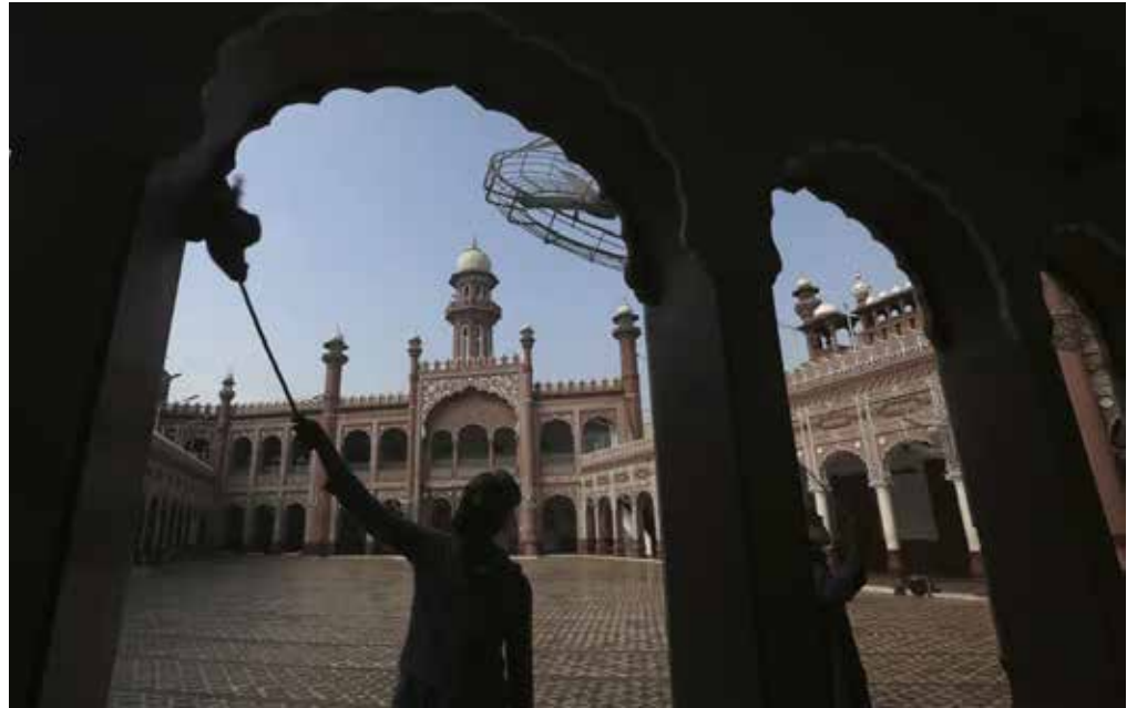
A worker cleans an area in the historical Sunehri mosque, ahead of the upcoming Muslim fasting month of Ramadan, in Peshawar, Pakistan, Wednesday, March 22, 2023. Muslims across the world will be observing the Ramadan, when they refrain from eating, drinking and smoking from dawn to dusk. Ramadan is expected to officially begin Thursday or Friday in Pakistan, though the timing depends on the alignment of the moon.