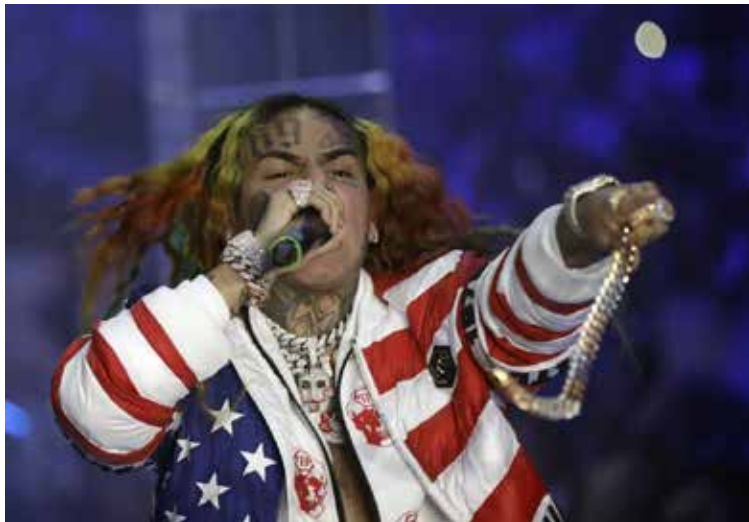
Rapper Daniel Hernandez, known as Tekashi 6ix9ine, performs during the Philipp Plein Women’s 2019 Spring-Summer Collection, unveiled during Fashion Week in Milan, Italy, Sept. 21, 2018. Palm Beach County, Fla., Sheriff’s investigators said an altercation occurred Tuesday night, March 21, 2023, between Hernandez and several people. Hernandez’s injuries were not considered life-threatening.

The assault left the rapper, whose real name is Daniel Hernandez, with several injuries. He was taken to a hospital but his injuries were not considered life-threatening, officials