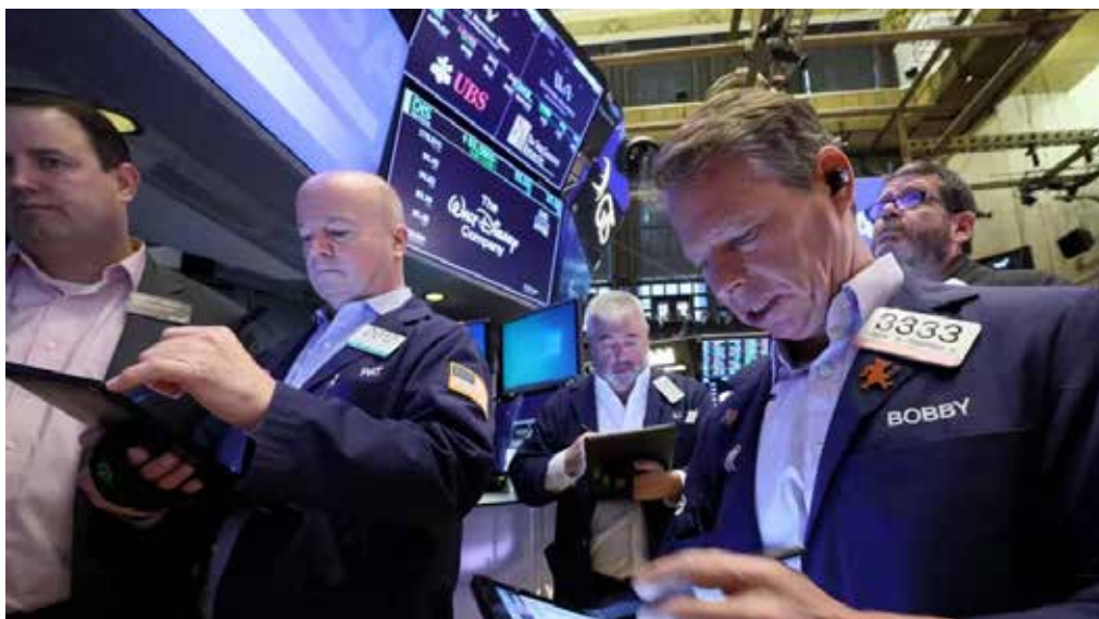
Traders work on the floor of the New York Stock Exchange this week.

Meanwhile, in the UK Chancellor Jeremy Hunt told MPs that the UK's financial system is "fundamentally strong" after facing questions from Labour's shadow chancellor Rachel