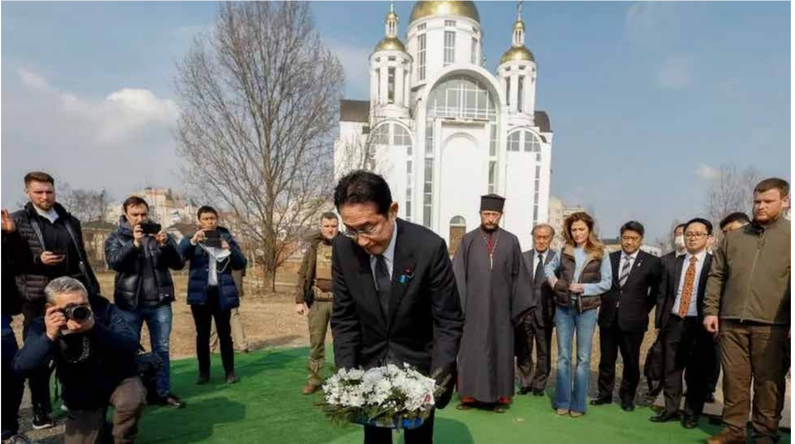
Fumio Kishida visits the site of a mass grave in Bucha, near Kyiv.

BBC - If ever you needed a demonstration of how the war in Ukraine is echoing in Asia, the schedule of the Japanese and Chinese leaders offers a prime example.