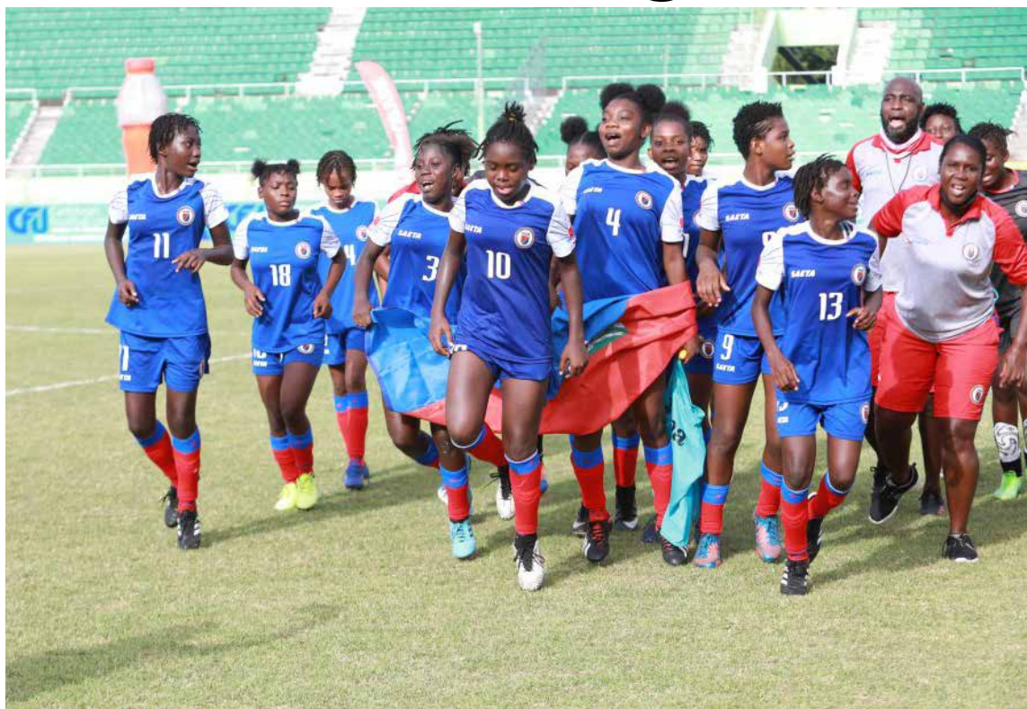
Haiti's girls celebrate victory in the 2021 CFU Girls' U-14 Challenge Series.

The series is also a breeding ground for match and venue coordinators. The teams are divided in Tier I