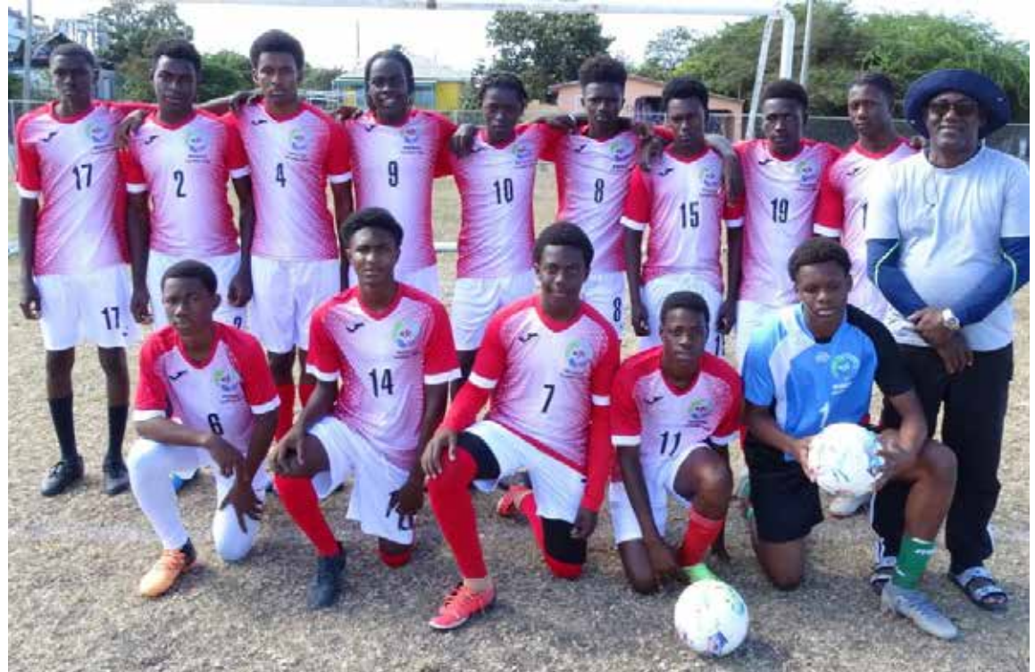
The Willikies Warriors Team that played in the Under-17 Boys Division of the Gomez/Netherlands Insurance Youth Football League at the Fort Road playing field on Saturday, 18th March, 2023.

their second win in as many appearances by grabbing a 4-2 victory over the Generation Next FC (GNFC) Rebels in the Under-15 Boys Division at the St. Anthony's Secondary School's playing field.