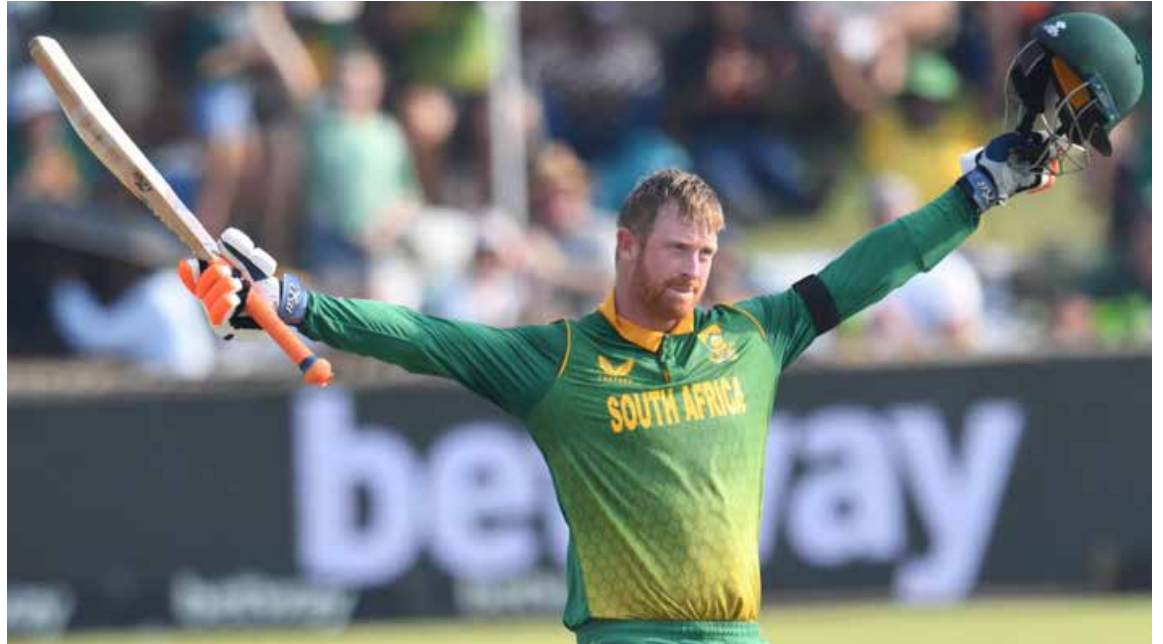
South Africa's Heinrich Klaasen celebrates after reaching his century during the Third ODI against the West Indies at Senwes Park, Potchefstroom, South Africa, 21st March, 2023.

without in-form captain Temba Bavuma due to a hamstring injury, and they rested regulars Quinton de Kock, Kagiso Rabada and Anrich Nortje.