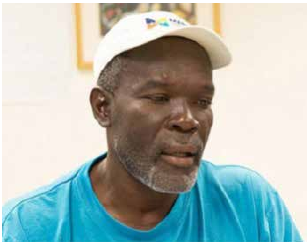
Former West Indies fast bowler Winston Benjamin.

"It's a chance for me to not only teach them a thing or two about our conditions, but also expand my own knowledge base and experience. As a part of the camp, young Antiguan players will get an opportunity to play against