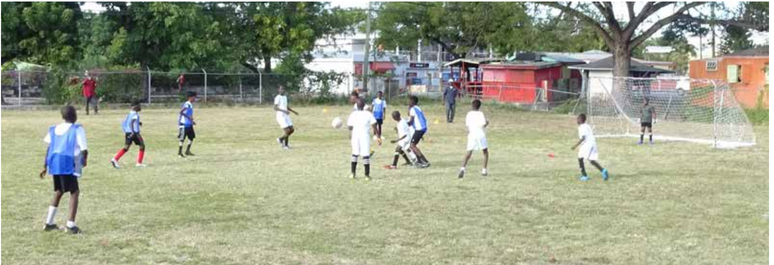
Players of the Villa Primary School (blue and black uniform) compete against their peers from Gospel Light Elementary during their encounter in the Primary School Cup Football Championship at the TN Kirnon School's playing field on Friday, 17th March, 2023.