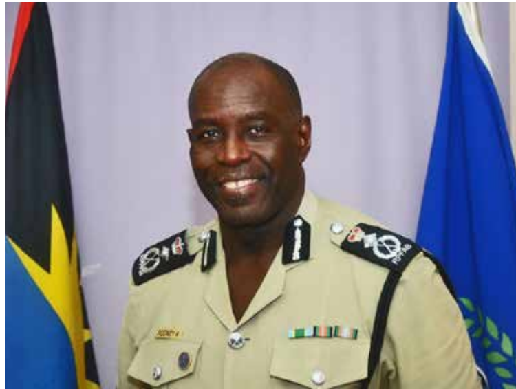
Commissioner of Police Atlee Rodney

The grounds for the affidavit filed in the court are that the actions by the police violated the provisions of the Criminal Prosecutions Act of 2017.