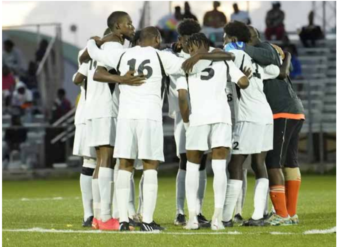
The players of the Ottos Rangers team converge in a huddle prior to the start of one of their matches in the premier division league at the ABFA's Technical Center at Paynters earlier this season.

The other two matches ended in draws. Bottom team Liberta Black Hawks continued their mini resur-