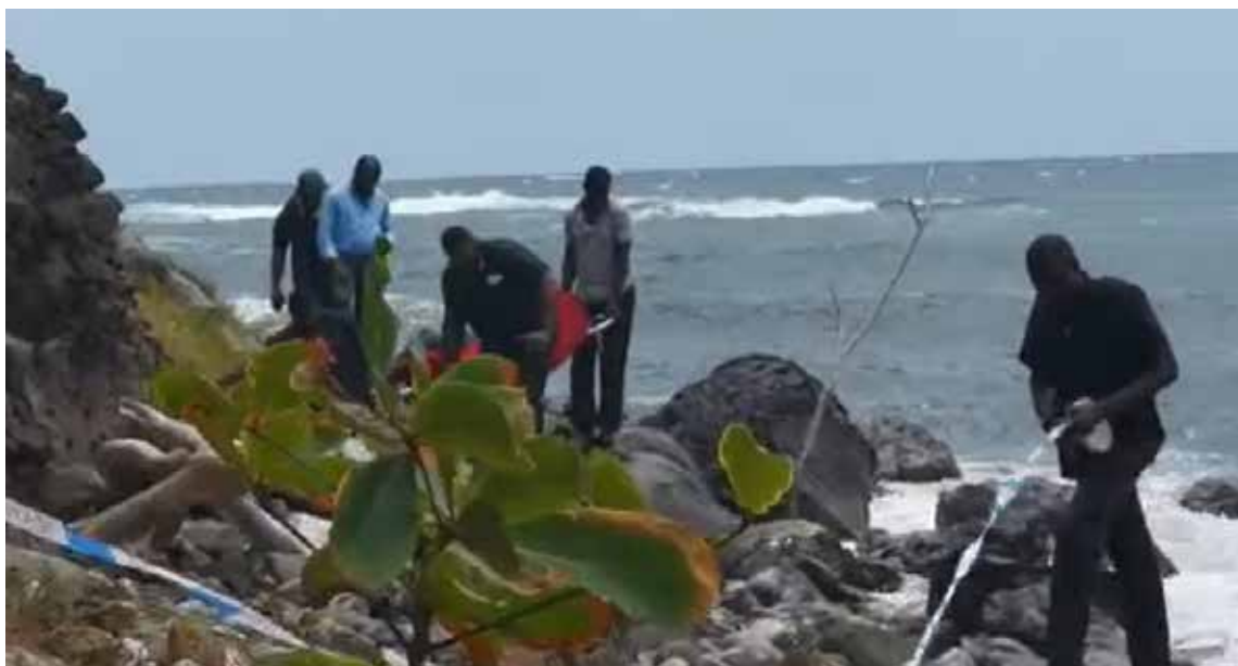
Screengrab of La Tante Bay, Grenada.

A postmortem will be conducted to determine the cause of death.