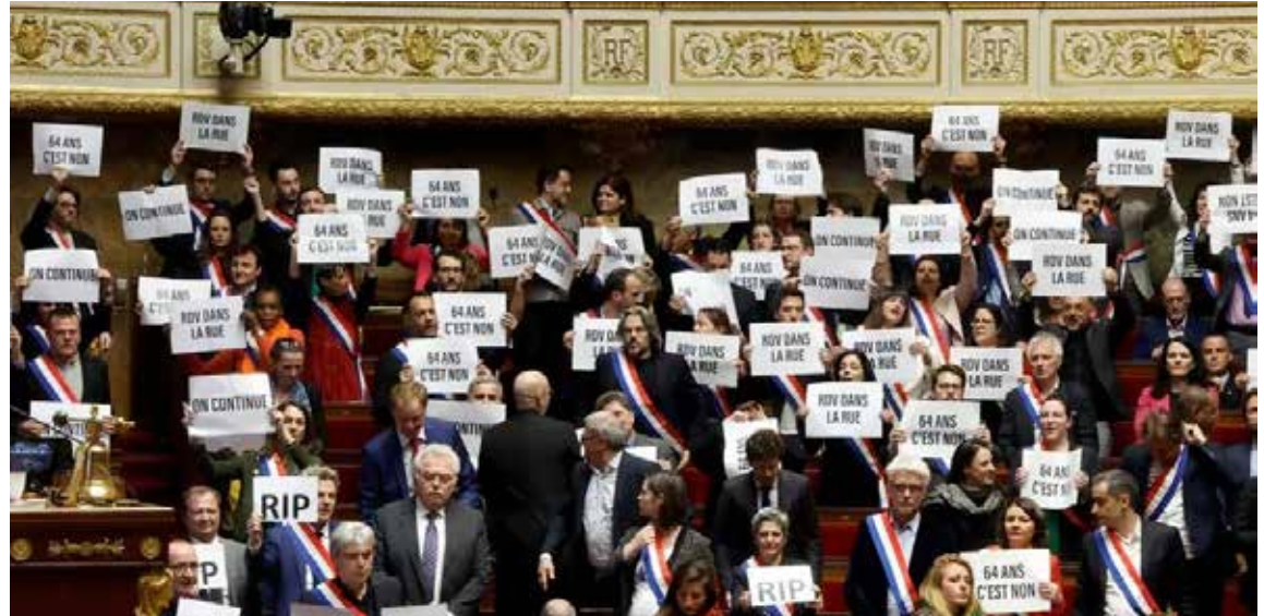
Opposition MPs held up signs protesting the government's pension age increase after the no-confidence vote.

It sparked angry protests at the weekend, with some demonstrators clashing with police and blocking streets with debris fires in central Paris, as well as cities