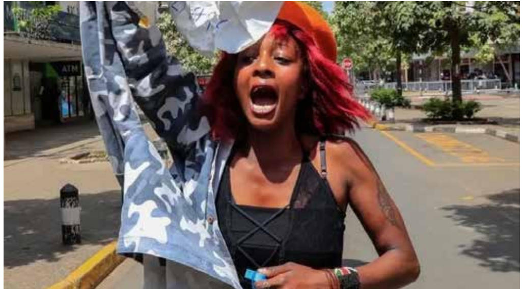
Opposition supporters are demanding the resignation of the president.

Police said demonstrators threw stones and injured six officers, prompting security forces to fire live