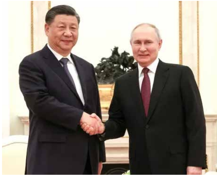
Vladimir Putin, right, has said he will discuss Xi Jinping's 12-point plan to "settle the acute crisis in Ukraine", during a highly anticipated visit to Moscow by the Chinese president.

Instead, it talked of "respecting the sovereignty of all countries", adding that "all parties must stay rational and exercise restraint"