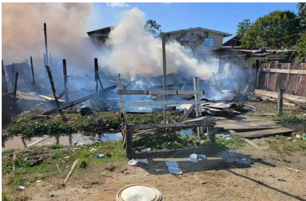
The aftermath of yesterday's fire in Agricola.

GFS issued a plea to Guyanese to take steps to avoid fires in their homes.