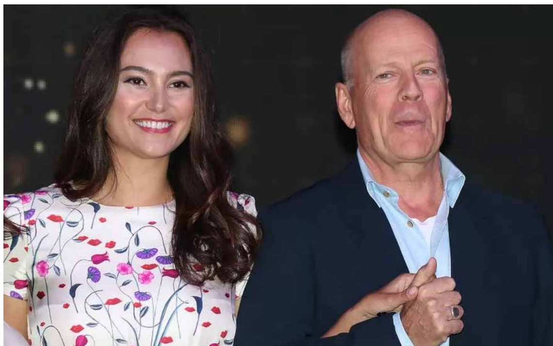
Emma Heming Willis and Bruce Willis have two daughters together.

sage where people always tell me, 'Oh you're so strong. I don't know how you do it'," she said.