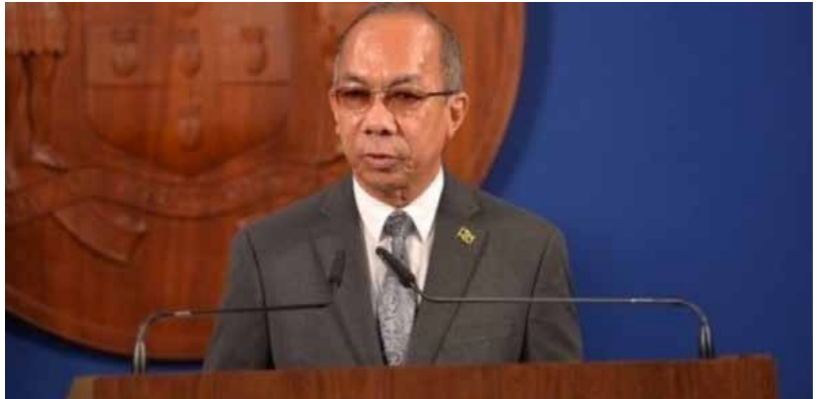
National Security Minister, Horace Chang.

“We need to pull all the statistics together. [We are] collaborating with the Min-