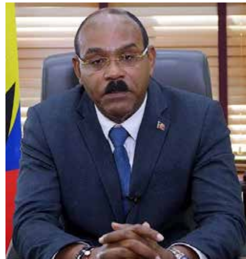
Prime Minister and Minister of Finance, Gaston Browne

The vessel is among dozens sanctioned around the world believed to be owned by a Russian Oligarch. The remaining crew members indicated that they are nearing the end of their food