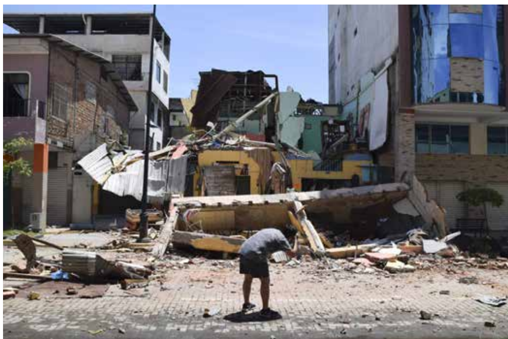
A man takes a photo of a building that collapsed after an earthquake shook Machala, Ecuador, Saturday, March 18, 2023. The U.S. Geological Survey reported an earthquake with a magnitude of about 6.8 that was centered just off the Pacific Coast, about 50 miles (80 kilometers) south of Guayaquil.