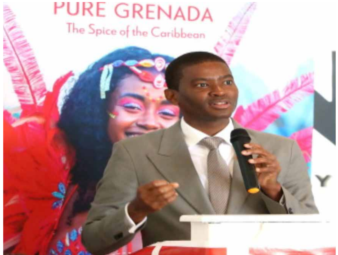
Grenada Prime Minister Dickon Mitchell addressing business leaders.

"In Antigua, if you go sometimes they tell you 'come back next week'. In Grenada, we are beginning to make significant adjustments to ensure the fund itself isn't bankrupt in 10 years' time. It amazes me that we have all these individual funds and we have not consolidated as a region so that we can get more