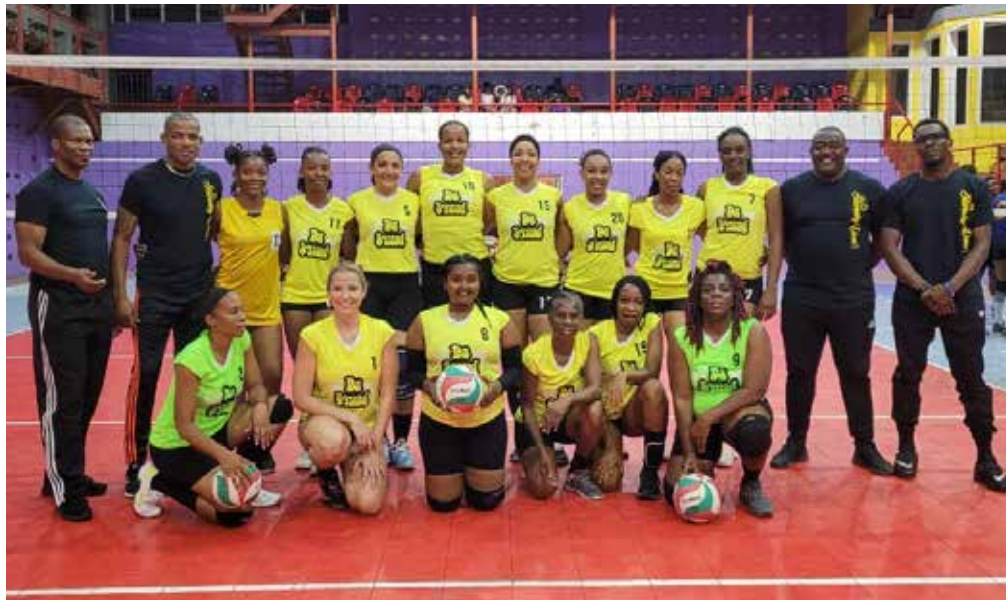
Reigning national female volleyball club champions Caribbean Alliance Da Squad.

North Coast Hardware Starz Seniors claimed their second win in the