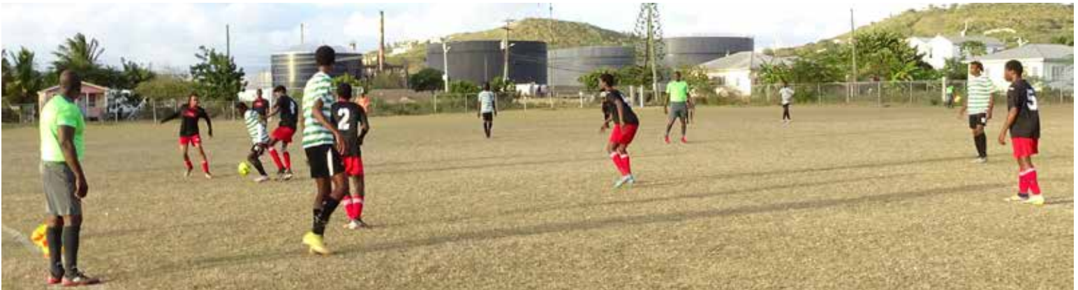
Players of Blackburn Palace (green and white shirts) compete against Young Warriors (red and black uniform) during their second division football league match at the Fort Road playing field on Friday, 17th March, 2023.