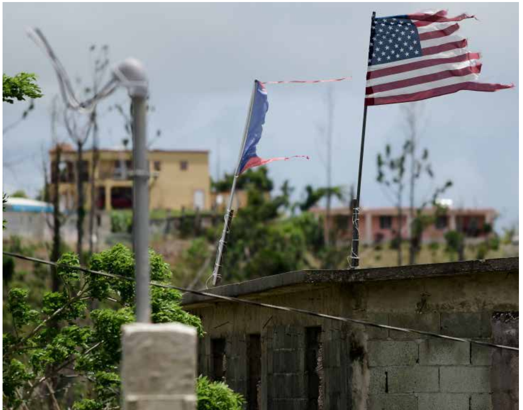
Deteriorated US and Puerto Rico flags fly on a roof eight months after the passing of Hurricane Maria in the Barrio Jacana Piedra Blanca area of Yabucoa, a town where many continue without power in Puerto Rico, May 16, 2018.

100 years to complete the reconstruction of the Puerto Rico electric grid," the centre said in an analysis published Thursday.