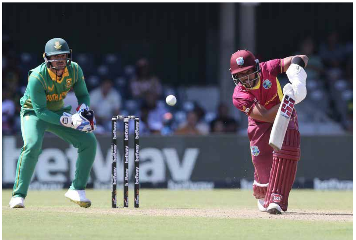
West Indies captain Shai Hope, right, plays an attacking shot during the Second One Day International against South Africa at Buffalo Park, East London, South Africa, Saturday, 18th March, 2023.

"I thought it (the pitch) was a difficult to start on," Hope said at the post-match presentation. "Once you get