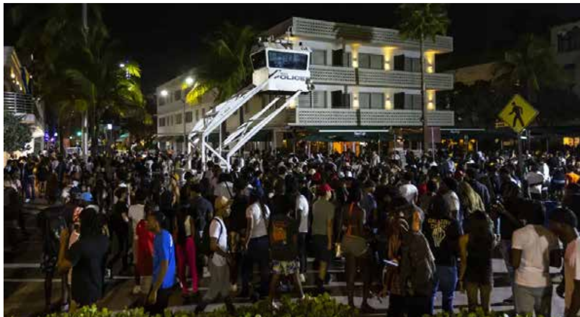
Crowds gather at Ocean Drive and 8th during spring break on Saturday, March 18, 2023, in Miami Beach, Fla. Miami Beach officials imposed a curfew beginning Sunday night, March 19, after two fatal shootings and rowdy, chaotic crowds that police have had difficulty controlling.