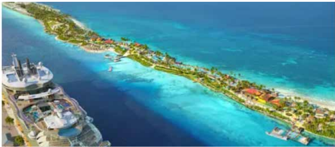
The proposed Royal Caribbean Beach Club.

"The Grand Bahama component was that hotel and the cruise port. There would be a new and expanded cruise port, which would represent an increase in visitors to Grand Baha-