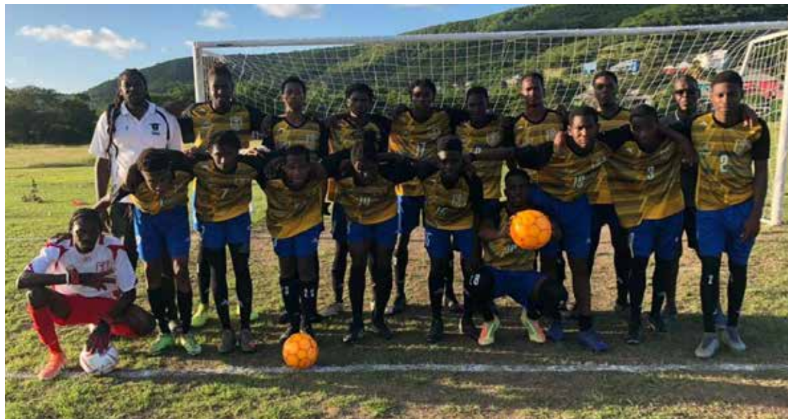
The Jennings United Football Team.

Black Hawks came from behind to claim their first win in this season's premier league by pulling off a 2-1 win over Cedar Grove Blue Jays at the ABFA's Technical Center.