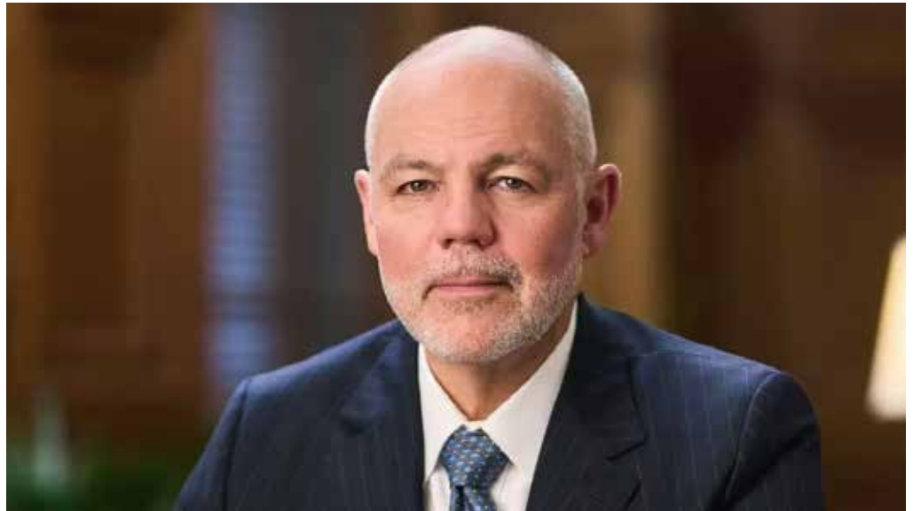
Canadian Supreme Court Justice Russell Brown is on leave while an investigation looks into a physical altercation at an Arizona hotel.