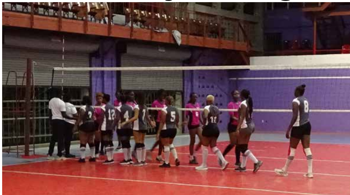
The players of Paragons (pink and black uniform) and Stoneville exchange handshakes at the end of their female division encounter in the Antigua and Barbuda Amateur Volleyball Association's Local League at the indoor stadium at the YMCA Sports Complex on Wednesday, 15th March, 2023.