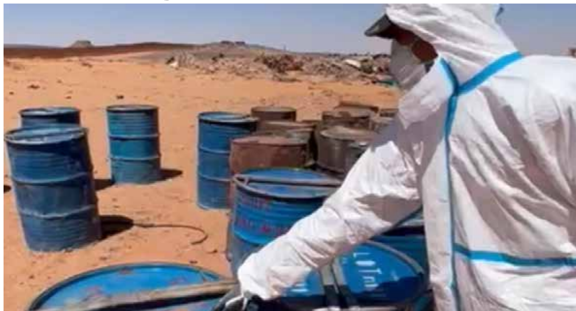
An official inspecting drums said to contain uranium ore.

But since Col Gaddafi was deposed in 2011, the country has been divided