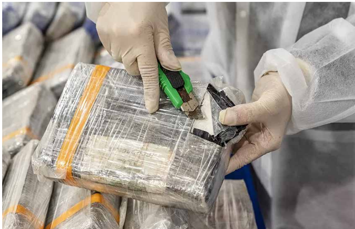
Doctors have warned cocaine is often mixed with other harmful substances.

While the report said the markets in Africa and Asia were “still limited”,