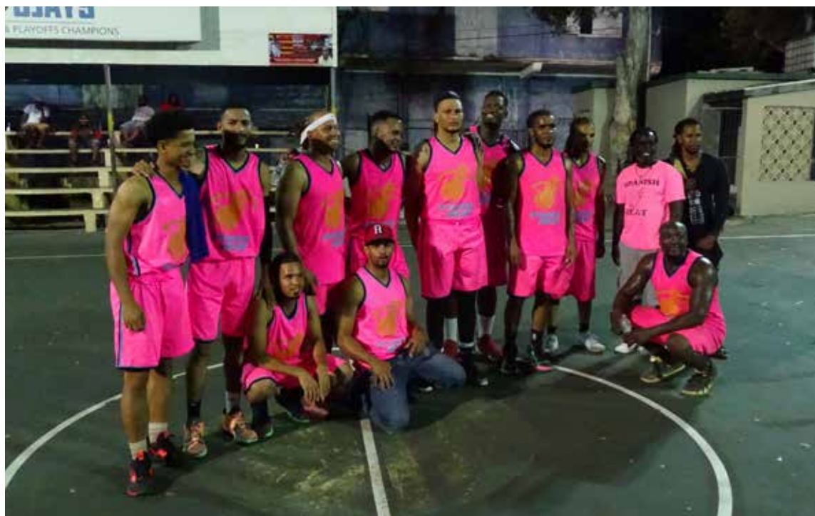
The Spanish Heat team following their win over Ottos Coolers in the Second Division basketball league final at the court in Ovals on Wednesday.