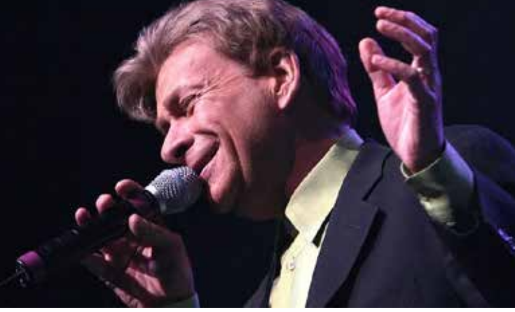
R&B singer Bobby Caldwell in 2006.

Caldwell's Open Your Eyes for a collaboration with Common to produce the song, The Light. Questlove led tributes to Caldwell on Instagram, lamenting the fact that he never got to meet Caldwell in person.