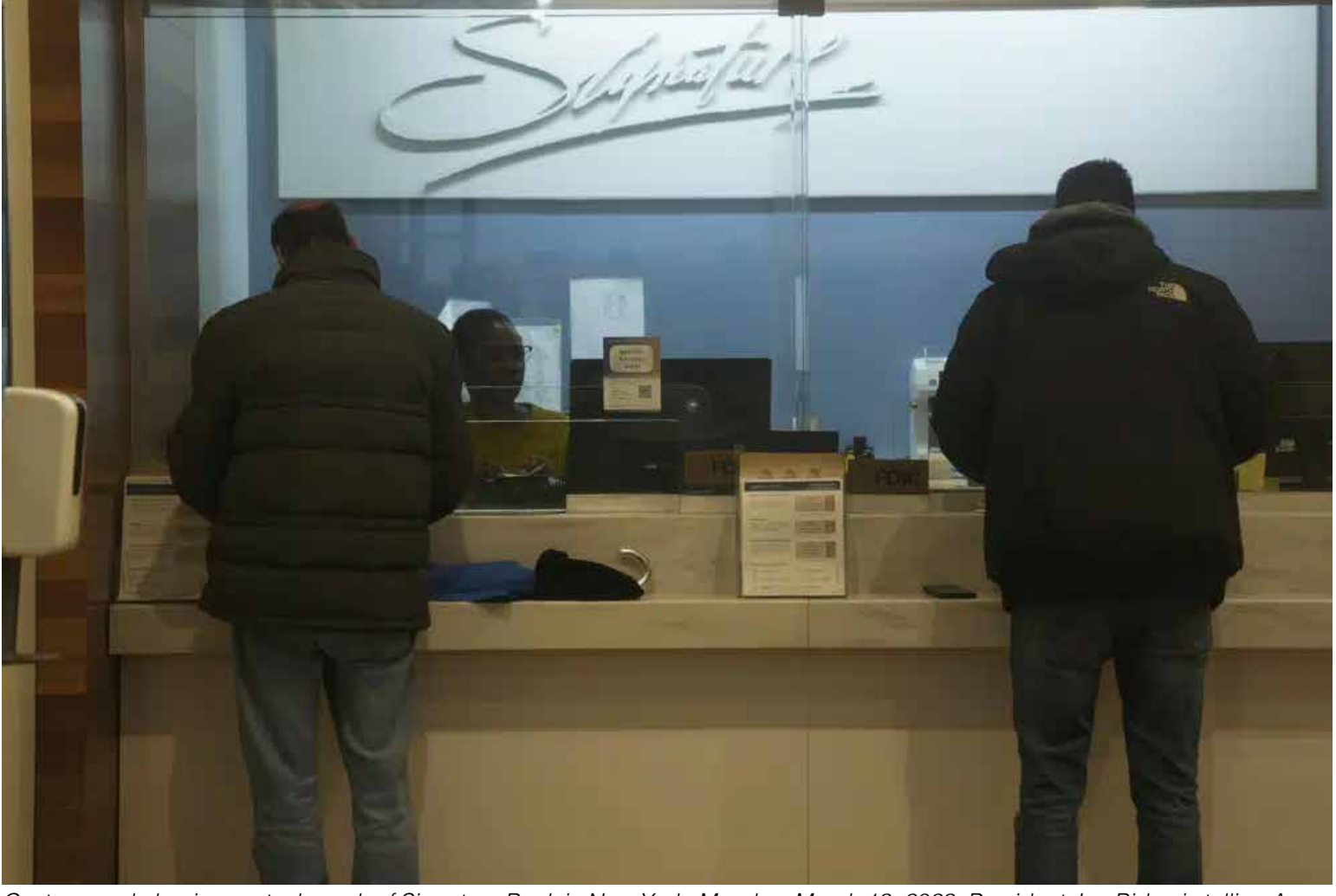
Customers do business at a branch of Signature Bank in New York, Monday, March 13, 2023. President Joe Biden is telling Americans that the nation's financial systems are sound. This comes after the swift and stunning collapse of two banks that prompted fears of a broader upheaval.