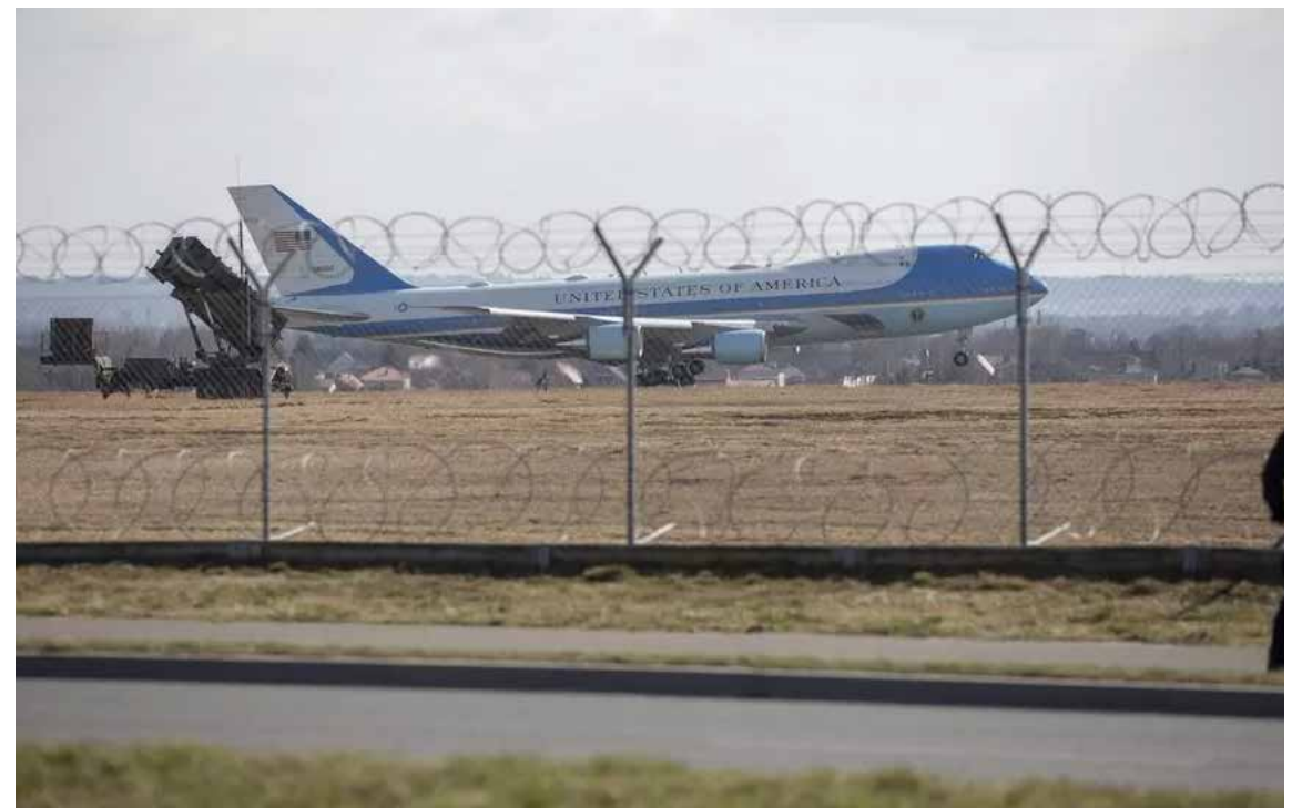
The group reportedly installed cameras at places including Rzeszow-Jasionka airport, where Joe Biden flew into.

Some of them were found close to a small regional airport that has been converted into an international logistics hub delivering military and humanitar-