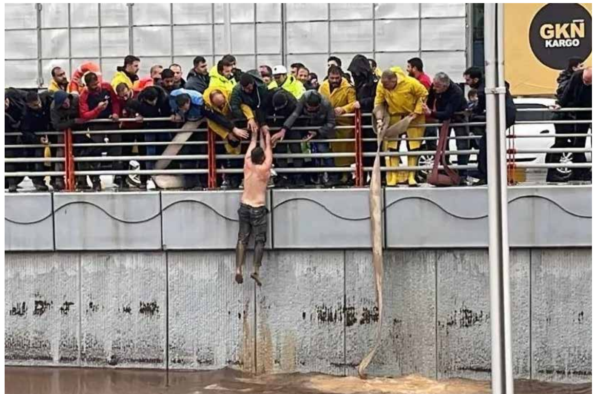
This man was pulled to safety from the underpass at the Abide junction.

Search and rescue organisation Afad said that in one 24-hour period, 136mm (5.4in) of rain had fallen in one area of Adiyaman province and 111mm (4.4in) in