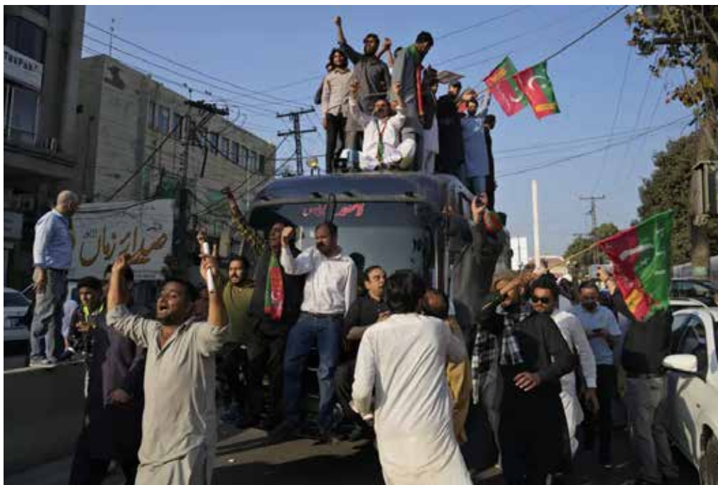
Supporters of Pakistan's former prime minister Imran Khan's 'Pakistan Tehreek-e-Insaf' party climb on a police van and chant anti-government slogans during a rally, in Lahore, Pakistan, Wednesday, Feb. 22, 2023. Hundreds of supporters of Pakistan's former prime minister on Wednesday defied a ban on rallies in a commercial area of the city of Lahore, taunting police and asking to be arrested en masse.

Khan was ousted from the premiership in April through a no-con-