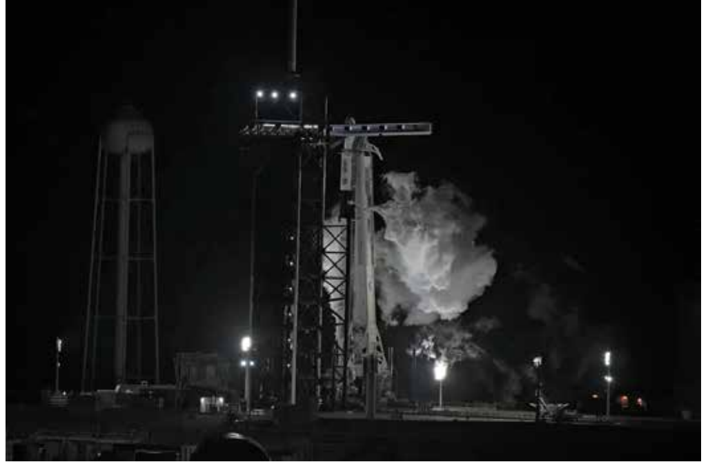
Fuel vents from a SpaceX Falcon 9 rocket as she sits on Launch Complex 39-A Monday, Feb. 27, 2023, after the launch was scrubbed at the Kennedy Space Center in Cape Canaveral, Fla.

“We’ll be sitting here waiting,” commander Stephen Bowen assured everyone. “We’re all feeling good.”