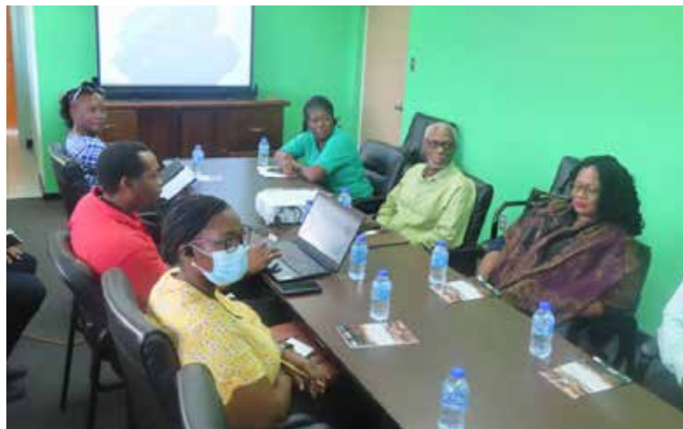
Ministries of Agriculture and Education officials meet to strategise on making the teaching of science more attractive.

She further added that the project has two overall aims; 1. To stimulate the interest of young people in forestry and biodiversity. 2. To launch a public education forum for students and adults alike, on the importance of bats in a country. These will eventually lead to the inclusion of science and related issues