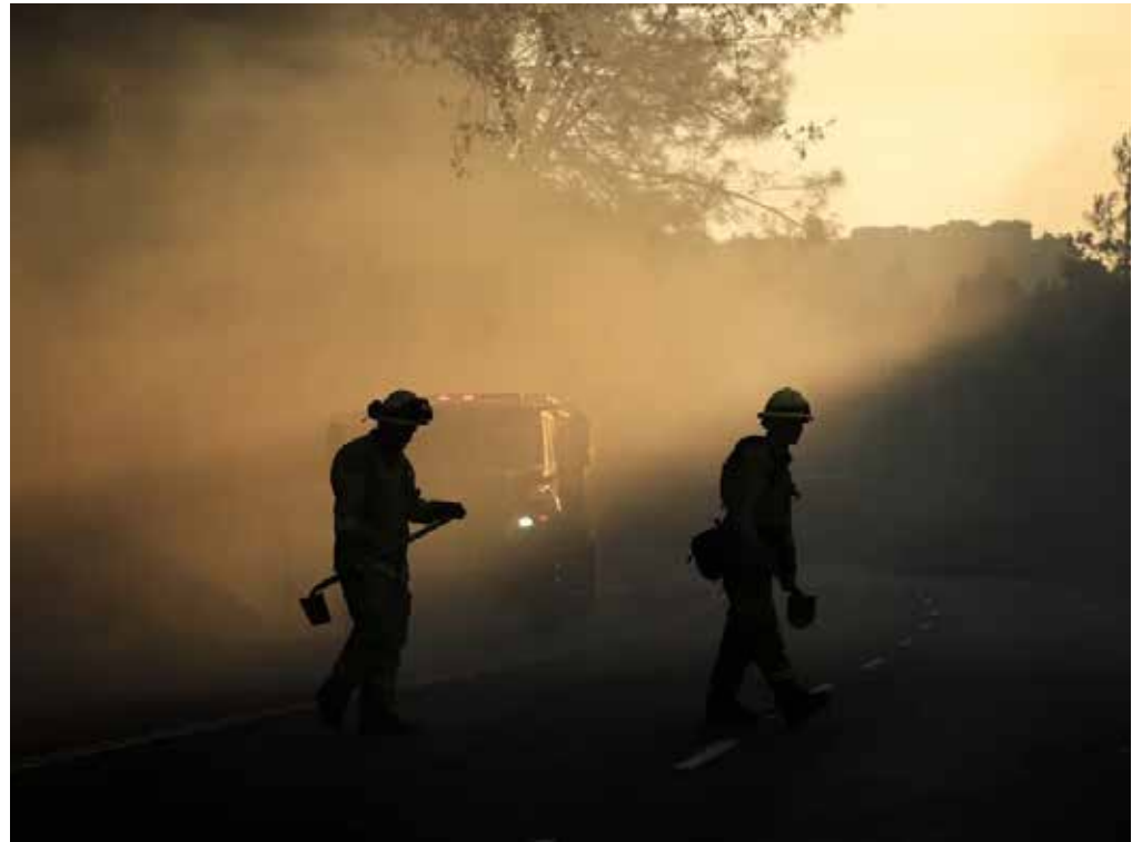
Two firefighters watch for spot fires, Oct. 13, 2017, near Calistoga, Calif.