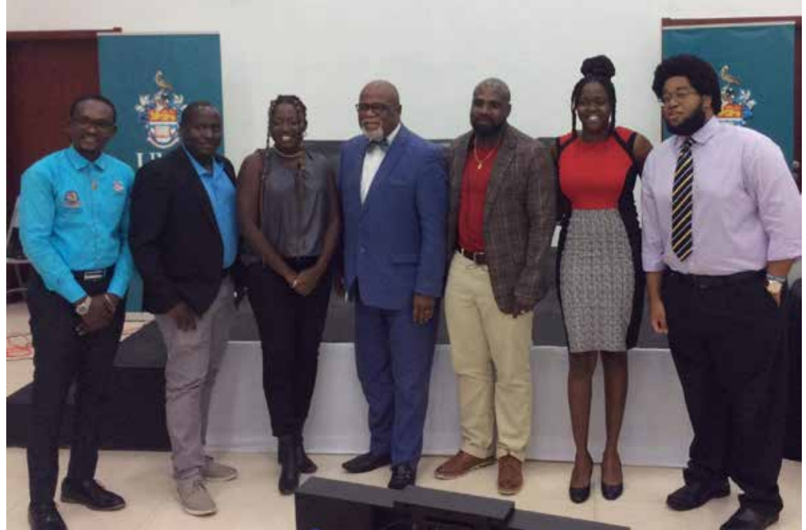
A number of youths let their voices be heard on Monday evening during the Advocacy Series.

Imhoff suggested that education needs to begin at an earlier stage within the schools and communities. She mentioned that youth sometimes tend to take a back seat when it comes to politics and the parties need