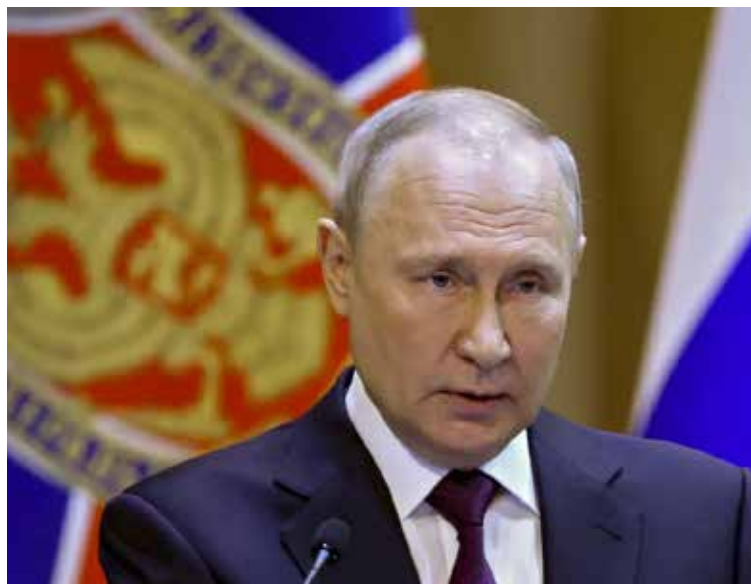
Russian President Vladimir Putin delivers his speech during a meeting of the Federal Security Service (FSB) board in Moscow, Russia, Tuesday, Feb. 28, 2023.

Both houses of parliament quickly ratified Putin's bill on the pact's suspension last week. On Tuesday, Putin signed it into law, effective immediately. The document says that it's up to the president to decide whether Moscow could return to the