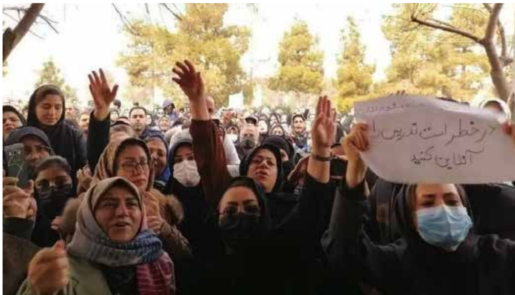
Parents are afraid to send their girls to school and are calling for online lessons.

“You are obliged to ensure my children’s safety! I have two daugh-