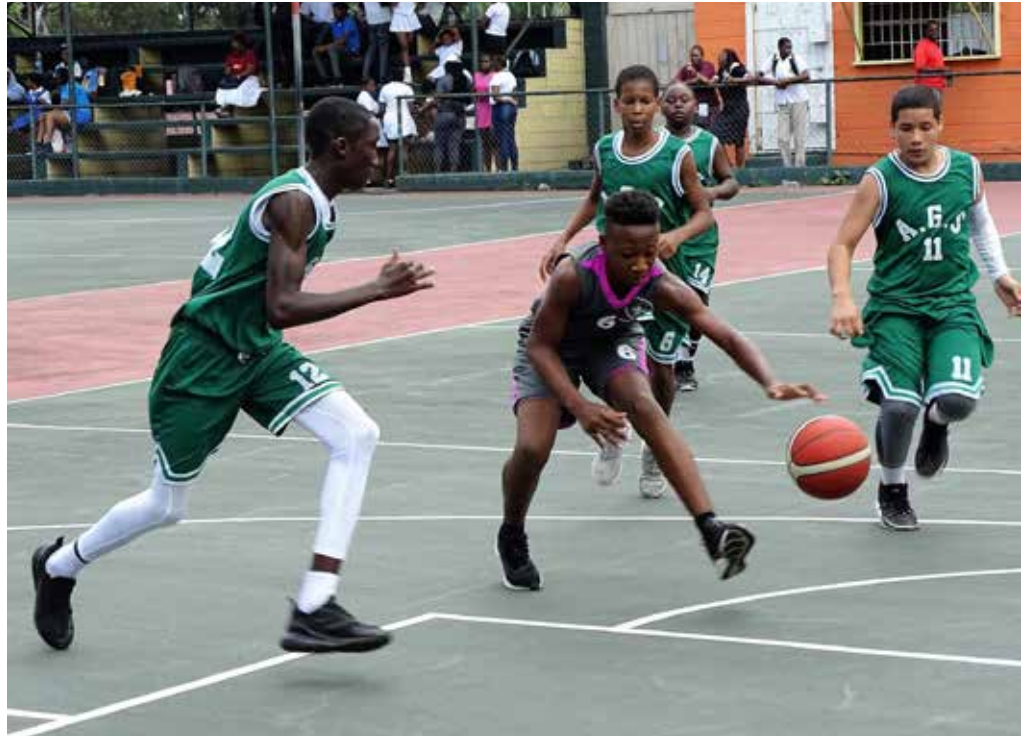
Players of Antigua Grammar School (green uniforms) compete against their peers from Princess Margaret School in the Inter-Schools' Basketball Competition at the YMCA Sports Complex on Monday, 27th February, 2023.