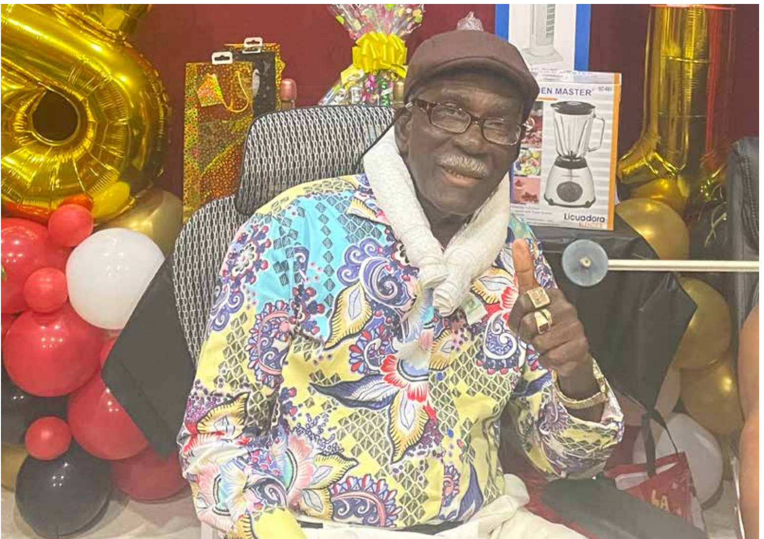
Calypso legend Sir McLean "King Short Shirt" Emanuel celebrated his 81st birthday yesterday. He spent some time in the studio of POINTE FM engaging with fans, who called the special show that was planned in his honour to offer him best wishes.