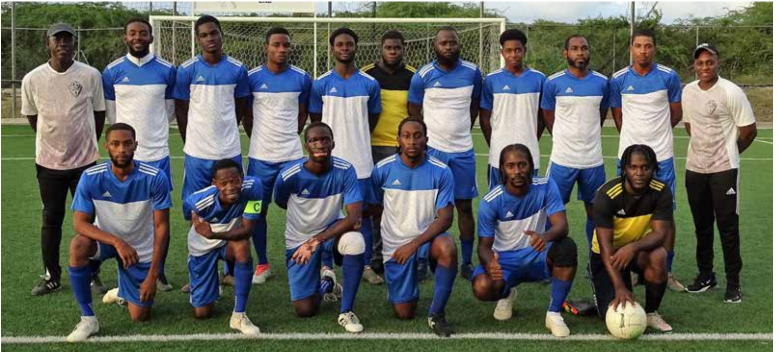
Sea View Farm football team