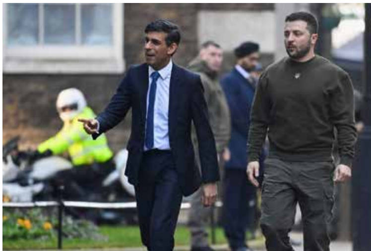
Ukraine's President Volodymyr Zelenskiy and British Prime Minister Rishi Sunak walk outside Number 10 Downing Street in London, Britain, February 8, 2023.

Earlier, Britain announced an immediate surge of military deliveries to Ukraine to help it fend off an intensifying Russian