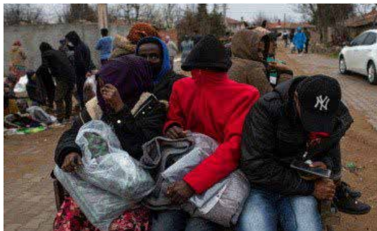
Haitian nationals stranded in Turkey where an earthquake on Monday killed thousands of people

FOLONHA, which was formed after the deadly Jan- cont'd on pg 13