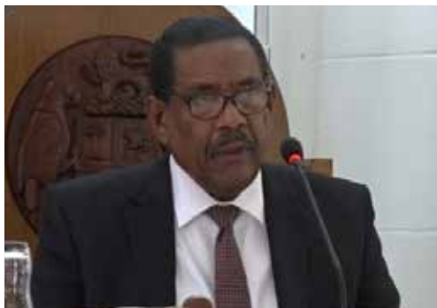
President Charles Savarin addressing the first sitting of the new Parliament on Tuesday

“The issue of electoral reform has loomed over us for several election cycles. Government has played its part in facilitating this initiative through the provision of technical and financial support to the responsible authority and more recently the engagement of a prominent and high profile legal mind in the person of Sir Dennis Byron to review the existing electoral legislation and processes and to submit recommendations for reform”.