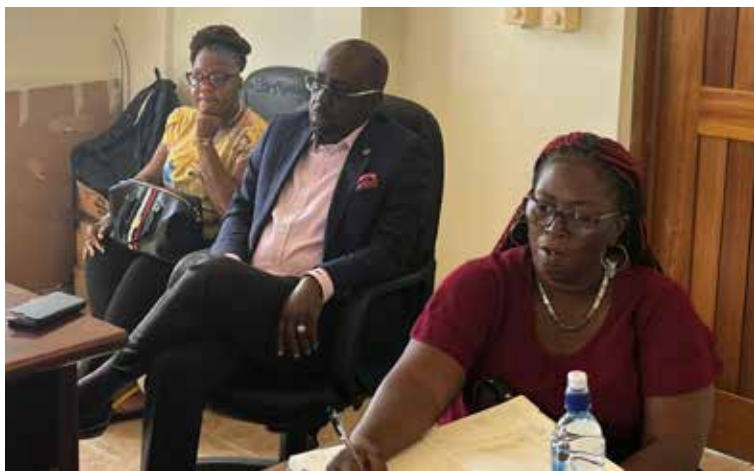
Barbuda Affairs Minister, E.P. Chet Greene (centre) listening attentively at the meeting with the Barbuda Council in Codrington.