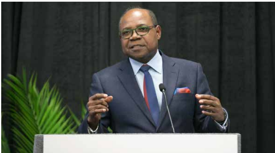
Jamaica's Minister of Tourism, Edmund Bartlett.

"This is a signal honour for Jamaica which highlights the fact that our nation continues to have such significant influence on the international stage. This is very timely as the devastating impact of the COVID-19 pandemic is still being felt and is causing a strain on many tourism-dependent states as they struggle to recover," said Tourism Minister, Edmund Bartlett.