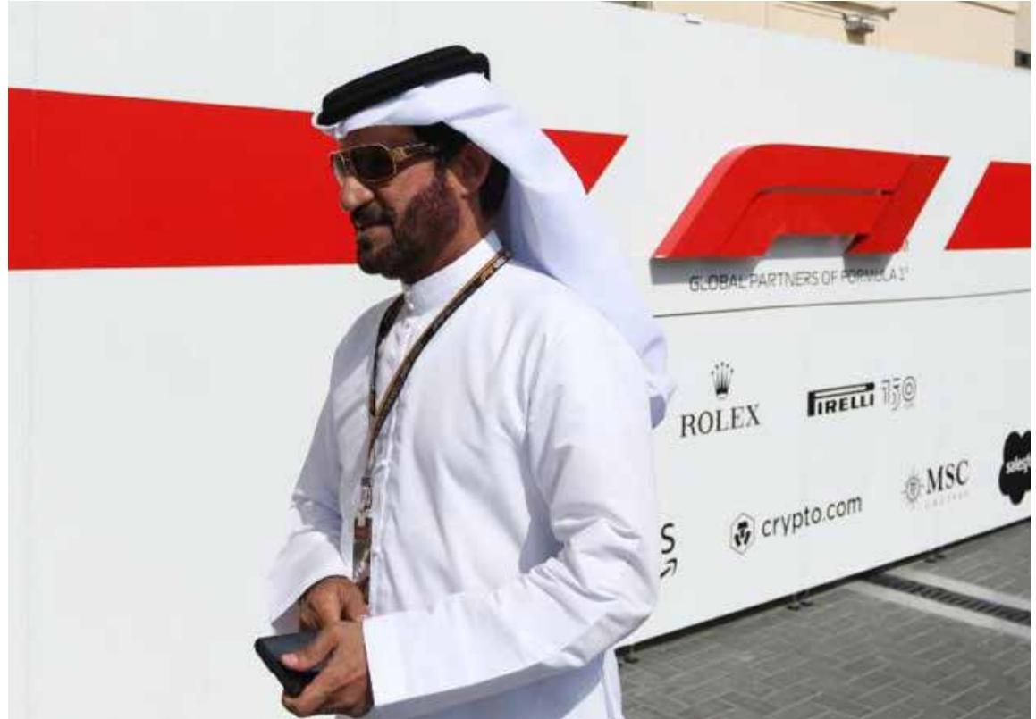
Mohammed Ben Sulayem was elected president of the FIA in December 2021

Receiving a "cease-and-desist" letter from F1's lawyers following his reaction