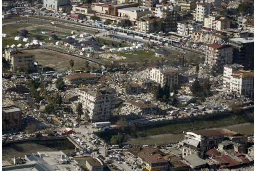
Collapsed buildings are seen in Antakya, southern Turkey, Wednesday, Feb. 8, 2023. Nearly two days after the magnitude 7.8 quake struck southeastern Turkey and northern Syria, thinly stretched rescue teams worked to pull more people from the rubble of thousands of buildings.

in their searches and picked gingerly through debris at other points to locate survivors or the dead. With thousands of buildings toppled, it was not clear how many people might still be caught in the rubble.