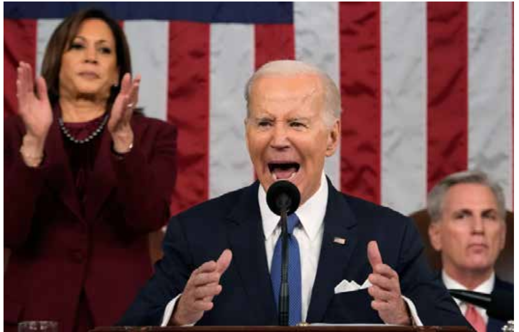
President Joe Biden delivers the State of the Union address to a joint session of Congress at the U.S. Capitol, Tuesday, Feb. 7, 2023, in Washington, as Vice President Kamala Harris and House Speaker Kevin McCarthy of Calif., applaud.

“Some of my Republican friends want to take the economy hostage - I get it - unless I agree to their economic plans. All of you at home should know what those plans are. Instead of making the wealthy pay their fair share, some Republicans ... want Medicare and Social Security to sunset,” he said,