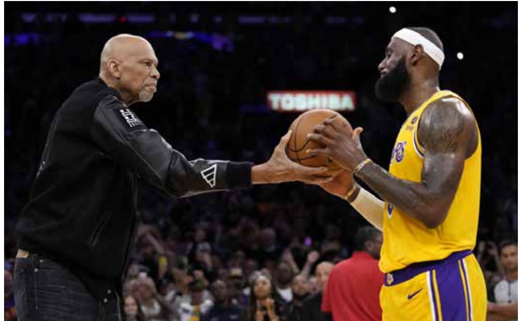
Kareem Abdul-Jabbar, left, hands the ball to Los Angeles Lakers forward LeBron James after passing Abdul-Jabbar to become the NBA's all-time leading scorer during the second half of an NBA basketball game against the Oklahoma City Thunder Tuesday, Feb. 7, 2023, in Los Angeles.

Abdul-Jabbar — a longtime Laker and one of many celebrities and sports stars who made sure they were there to see history — became the league's all-time leading scorer on April 5, 1984 and wound up retiring in 1989 with 38,387 points. It was a record that some thought would last forever, with very few even coming close. Karl Malone retired 1,459 points behind