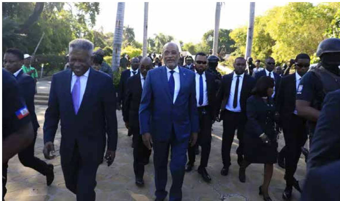
Haitian Prime Minister Ariel Henry leaves at the end of a ceremony marking the anniversary of the Battle of Vertieres, the last major battle of Haitian independence from France at the National Pantheon Museum, in Port-au-Prince, Haiti, Nov. 18, 2022. Henry on Monday, Feb. 6, 2023 formally appointed a transition council charged with ensuring that general elections are held, which would make them the first elections since the July 2021 assassination of President Jovenel Moïse. Henry assumed power shortly after Moïse's murder.

The High Transition Council, as it's known, also