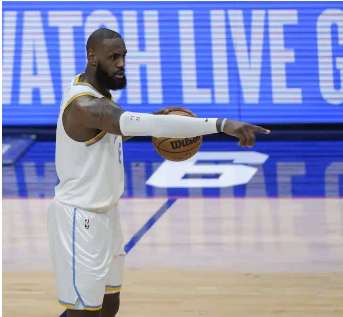
Los Angeles Lakers forward LeBron James moves the ball up court in the second half of an NBA basketball game against the New Orleans Pelicans in New Orleans, Saturday, Feb. 4, 2023. The Pelicans won 121-136.

Which is why those same seats are even pricier Thursday for the Lakers' next game against the Milwaukee Bucks — the two teams Abdul-Jabbar played for during his Hall of Fame career. For that game: $242,000, including the fees. But history suggests prices will come down; industry experts have long said extravagantly priced tickets rarely fetch the giant number listed.