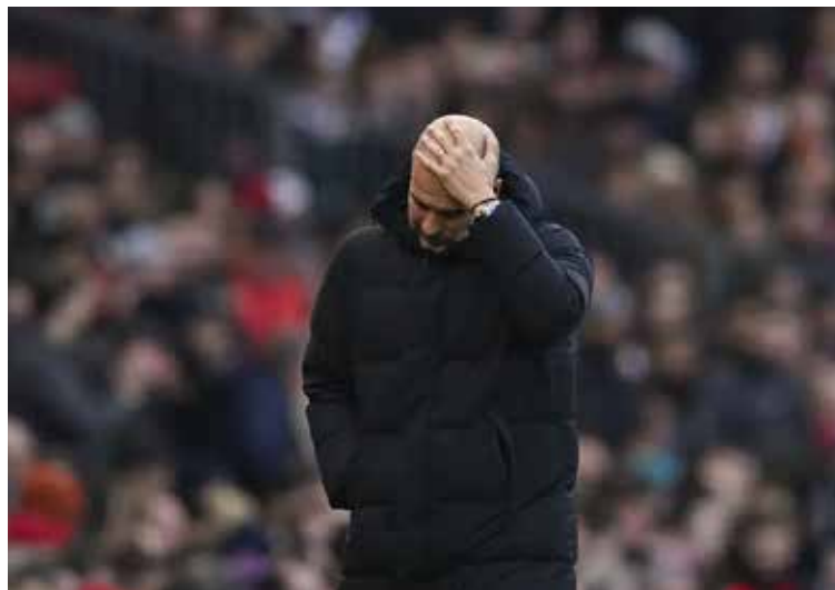
Manchester City's head coach Pep Guardiola reacts during the English Premier League soccer match between Manchester United and Manchester City at Old Trafford in Manchester, England, Saturday, Jan. 14, 2023.

Walker has a point, but his comments also suggest