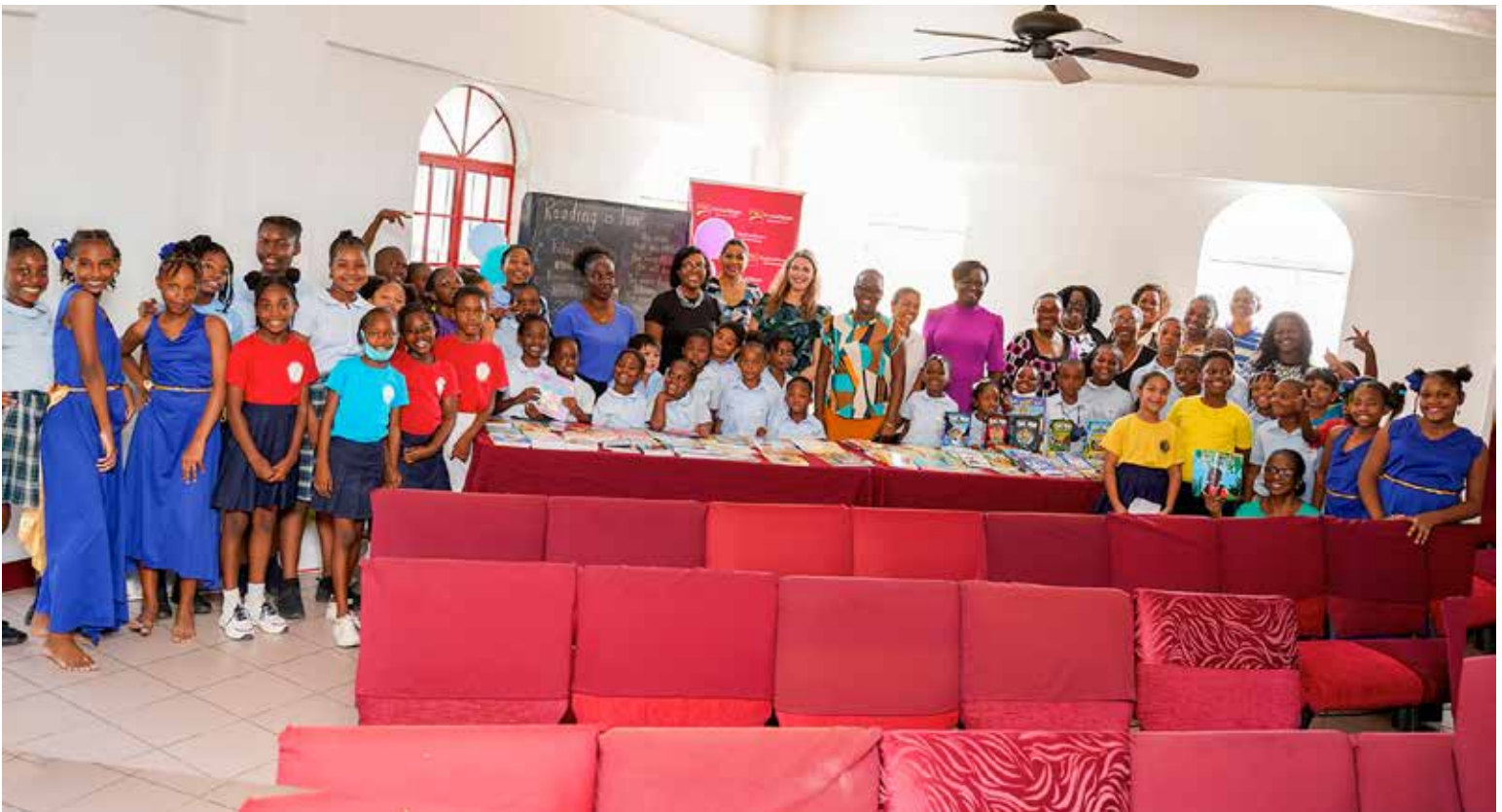
Presentation at Christian Union Junior Academy.