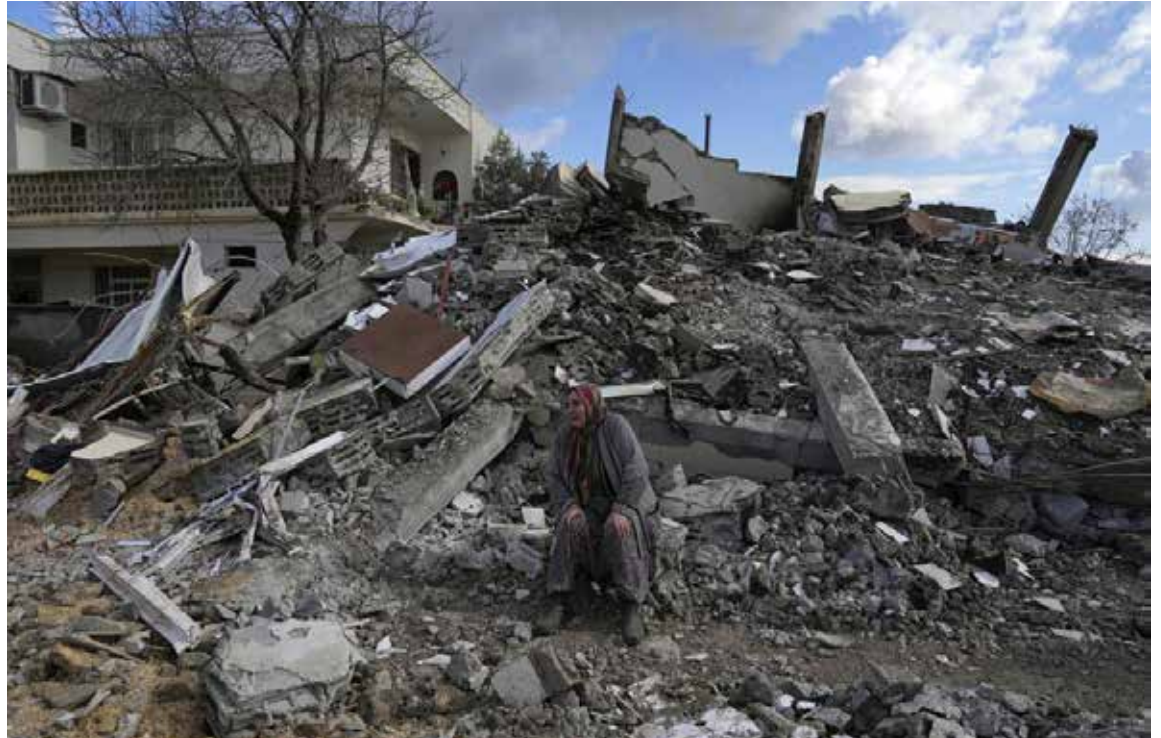
A woman sits on the rubble as emergency rescue teams search for people under the remains of destroyed buildings in Nurdagi town on the outskirts of Osmaniye city southern Turkey, Tuesday, Feb. 7, 2023. A powerful earthquake hit southeast Turkey and Syria early Monday, toppling hundreds of buildings and killing and injuring thousands of people.

Aftershocks then rattled tangled piles of metal and concrete, making the search