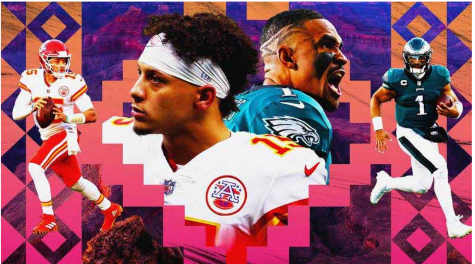
Patrick Mahomes and Jalen Hurts face each other on Sunday in Arizona at Super Bowl 57