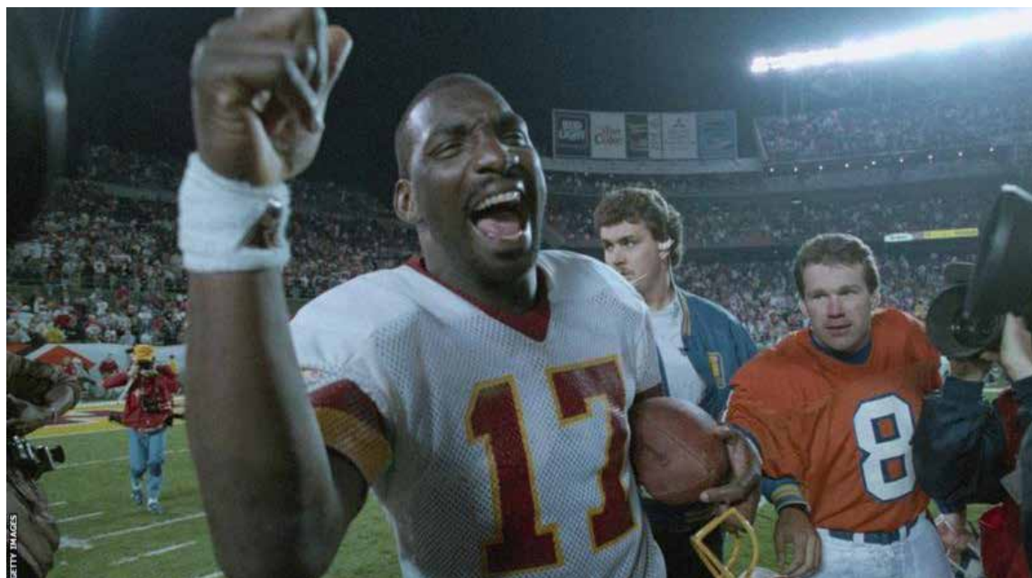
Doug Williams celebrates winning the Super Bowl - and being named the game's MVP

"If we can continue to show that we can consistently be great, I think it'll just continue to open doors for other kids growing up to