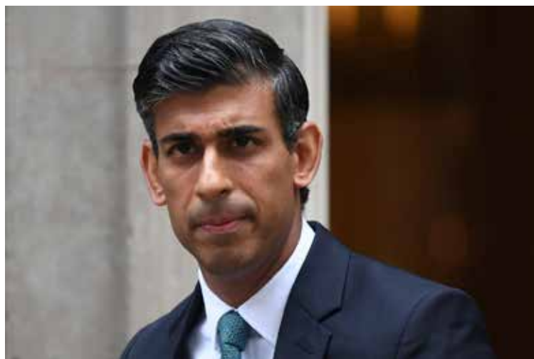
Britain's Prime Minister Rishi Sunak reacts as he leaves Teesside University in Darlington, Britain, January 30, 2023.

He hailed the standalone energy and net zero ministry as one that would help