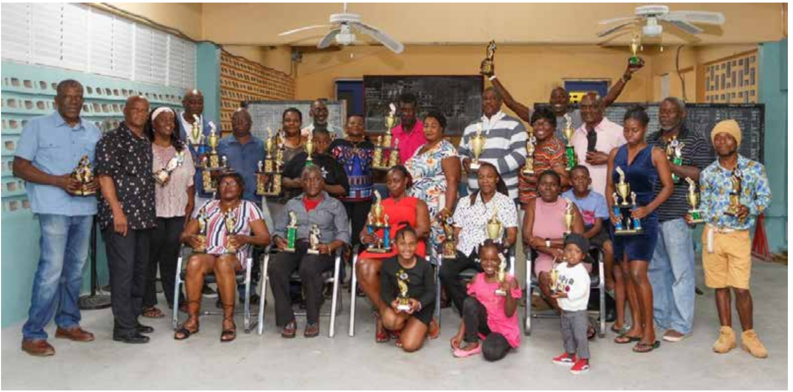
The various winners pose with their prizes during the National Domino Association's Awards and Appreciation Ceremony at its headquarters in Ottos on Saturday, 25th February, 2023.