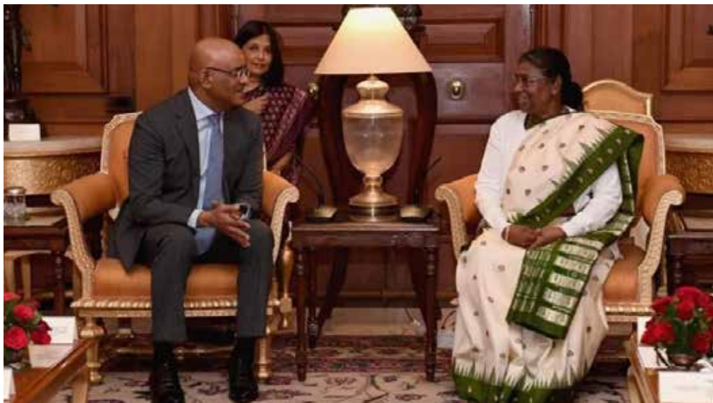
Vice President Hon. Dr Bharrat Jagdeo during his meeting with President Droupadi Murmu at Rashtrapati Bhavan, India.

14 oil blocks offshore Guyana are being auctioned.