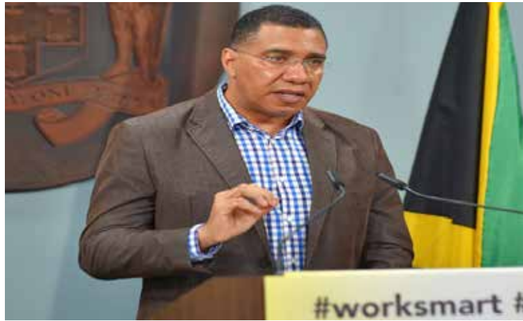
Prime Minister Andrew Holness.

return to the island later in the evening.