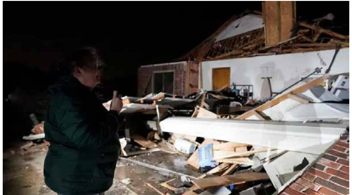
Tornadoes in Oklahoma destroyed several homes and knocked down power lines on Sunday.

In Oklahoma, seven tornadoes were reported to have hit the state late on Sunday. Footage emerged showing overturned cars and homes