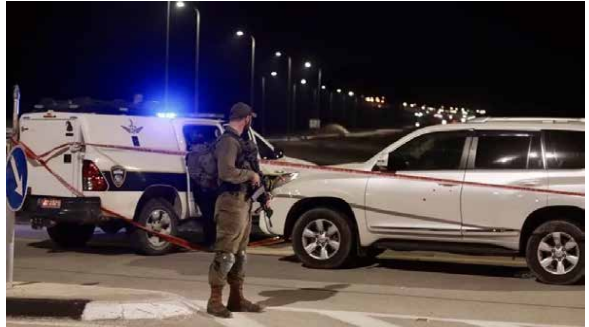
Israeli police by the Israeli man's car attacked near Jericho on Monday.

The incidents came after Israeli and Palestinian officials had pledged to