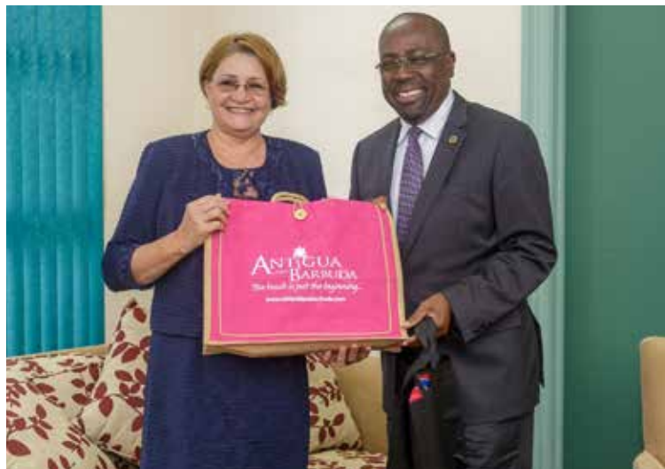
Foreign Minister, E.P Chet Greene, presents a souvenir to Ambassador Esther Fiffe Cabreja.

The prime minister noted that at that time, there was a scarcity of nurses, yet, Antigua and Barbuda was able to get the additional health personnel because of the efforts of the ambassador. He added that Cuba has always stood with the people of Antigua and Barbuda, even immediately after the devastation caused by Hurricane Irma in 2017,