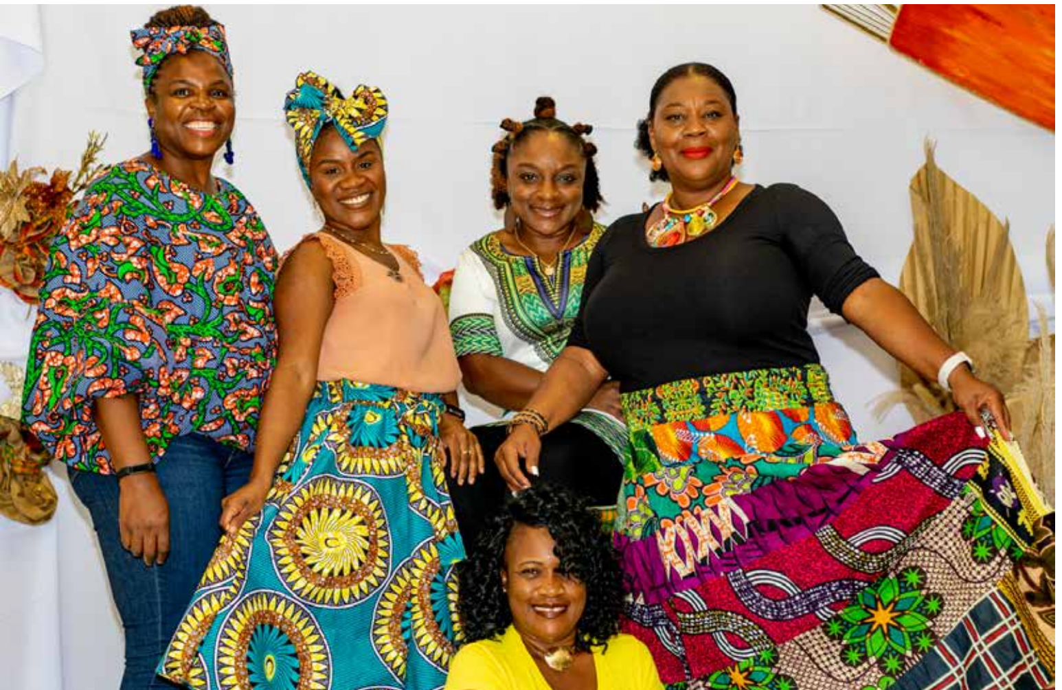
Medical Benefits Scheme (MBS) staff celebrate Black History Month.