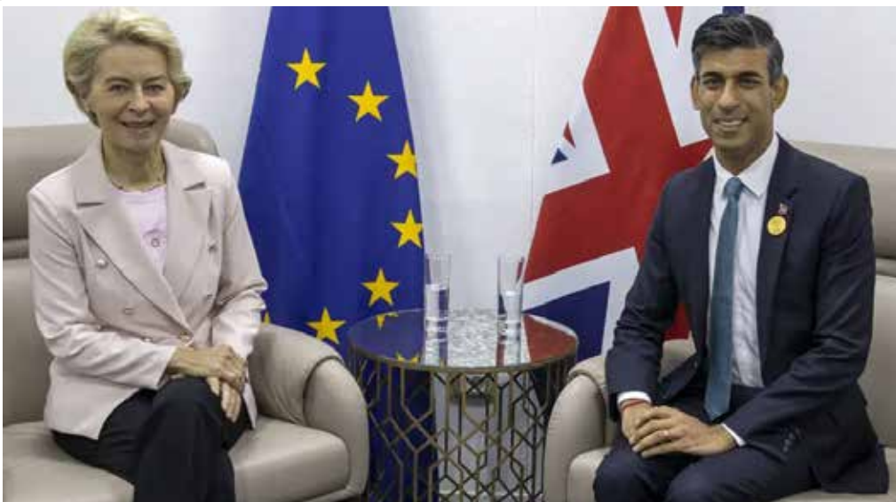
European Commission President Ursula von der Leyen, left, and British Prime Minister Rishi Sunak meet during the COP27 climate summit in Sharm el-Sheikh, Egypt, Nov. 7, 2022. British Prime Minister Rishi Sunak and European Union leader Ursula von der Leyen are due to meet, the two sides said Sunday Feb. 26, 2023, with expectations high they will seal a deal to resolve a thorny post-Brexit trade dispute.

Instead there are checks on some goods entering Northern Ireland from