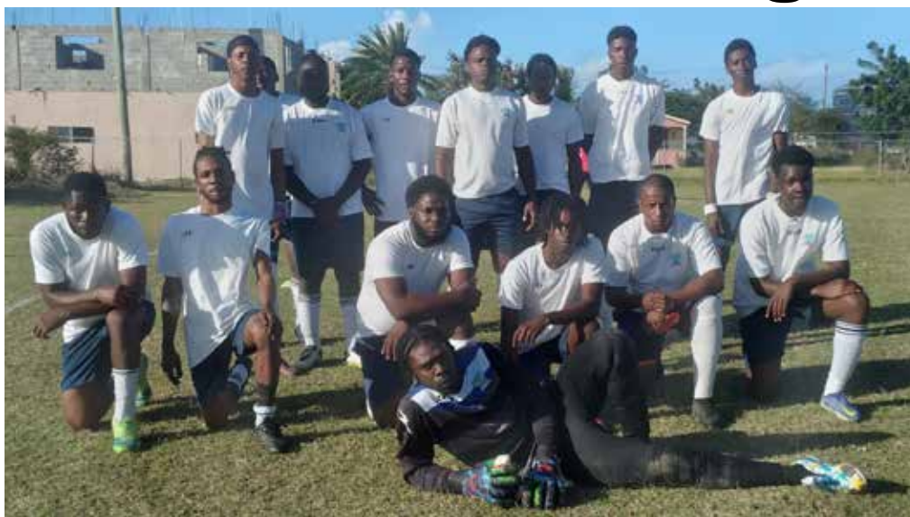
The Fort Road Football Team. (File photo)

The fourth win in 12 matches lifted Fort Road to 14 points and 9 th in the standings, while Potters slipped to