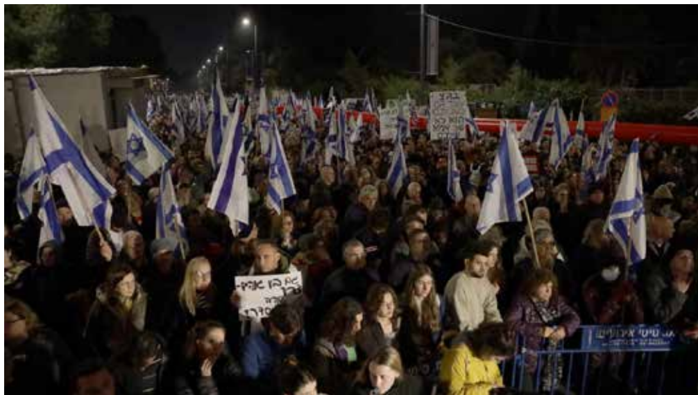
People demonstrate in Jerusalem on Saturday against the Israeli government's plans to weaken the country's judicial system.

Four legislative clauses that are part of the overhaul took steps for-