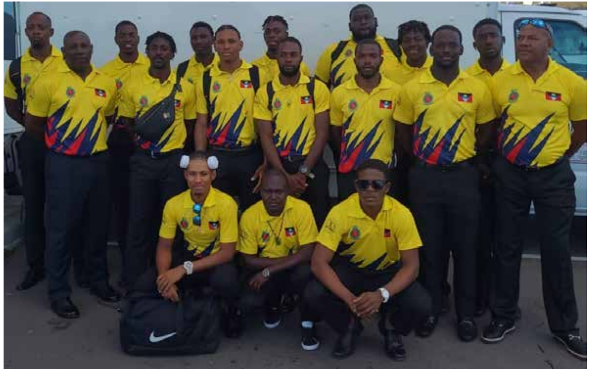
The Antigua and Barbuda Senior Men's Squad on arrival in St Kitts for the Leeward Islands Three-Day Cricket Tournament on 18th February, 2023.

Antigua and Barbuda had made 214 off 59.4 overs