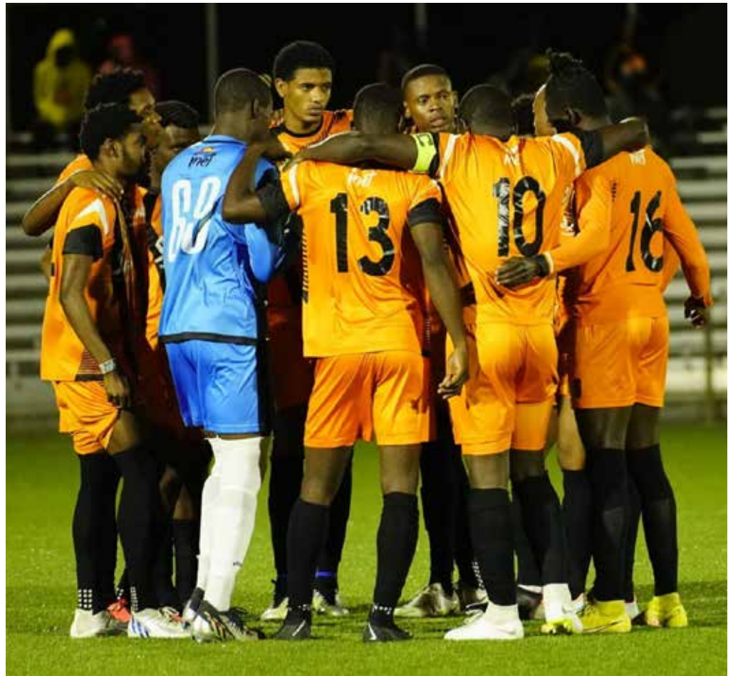
Players of Jennings Grenades huddle prior to kick-off of their premier division encounter against Swetes at the ABFA's Technical Center at Paynters on Saturday, 25th February, 2023.