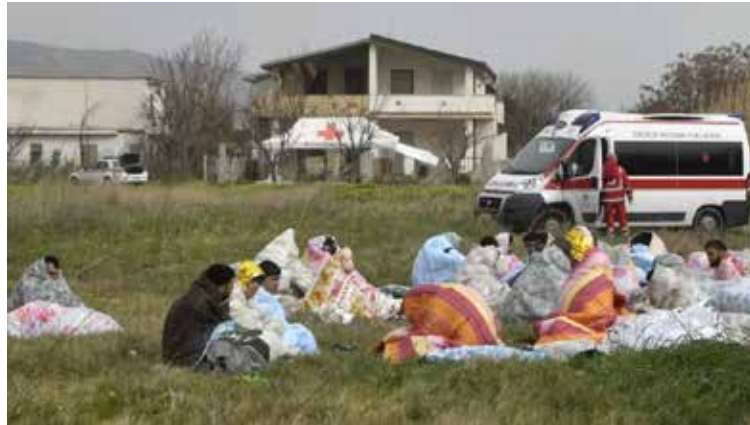
Dozens of people managed to survive the boat's sinking.

The boat, which sailed from Turkey several days ago, was carrying passengers from Afghanistan, Pakistan, Somalia and Iran.