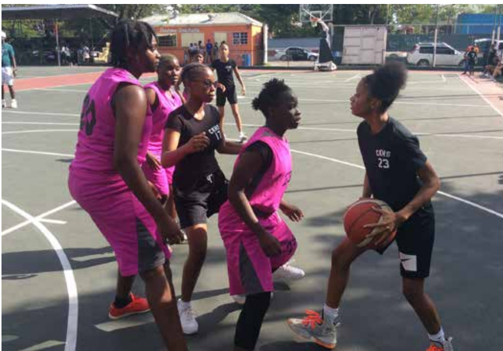
Players of the Princess Margaret School (pink uniform) compete against Christ the King High School (black uniform) in the Cool & Smooth Inter-Schools' Basketball Competitions at the YMCA Sports Complex on Friday, 24th February, 2023.

Clare Hall Secondary beat St Anthony's Secondary twice on Thursday.