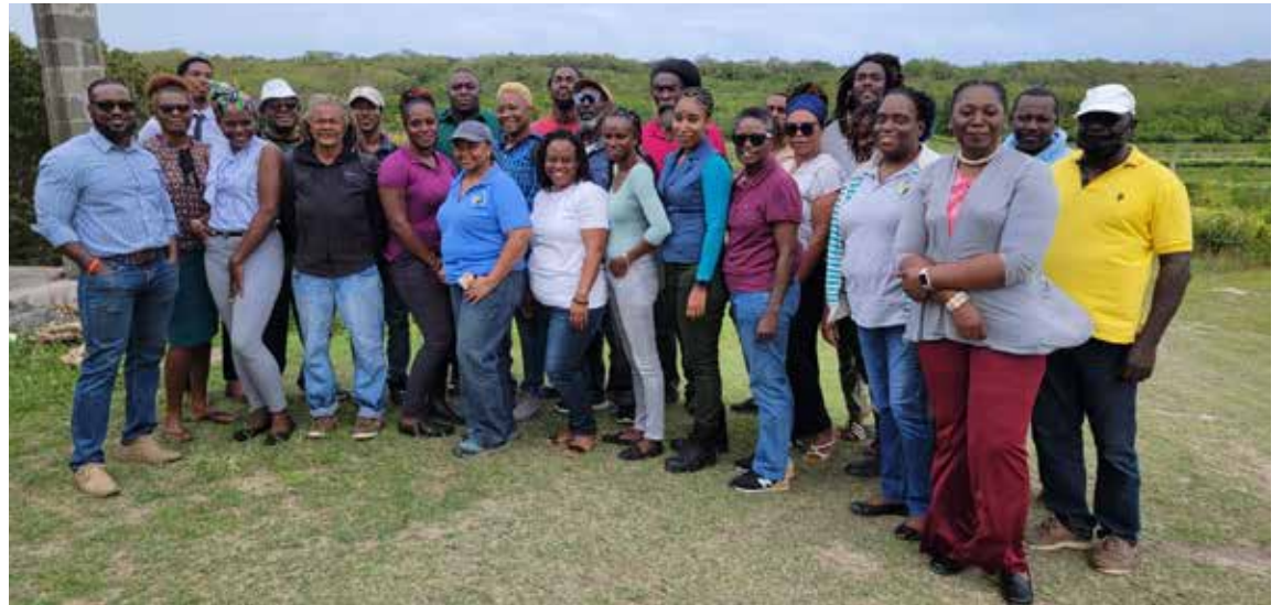
Shown here are some of the more than thirty participants, along with the organisers, who engaged in the Sustainable Agriculture workshop hosted by the FAO and CARDI