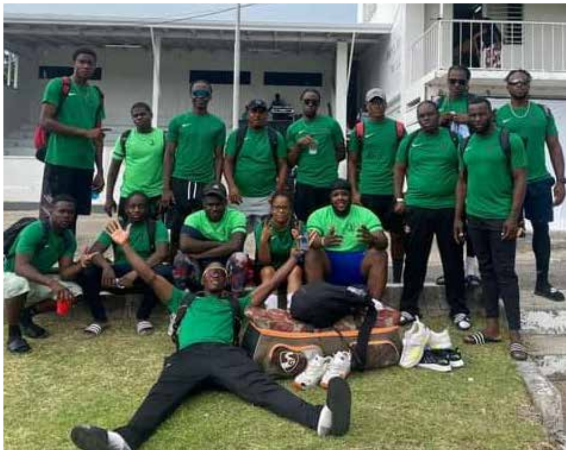
The Montserrat team celebrate after beating Nevis in their opening round match in the Leeward Islands Senior Men's Three-Day Tournament at the Elquemedo Willett Park in Nevis on Tuesday, 21st February.