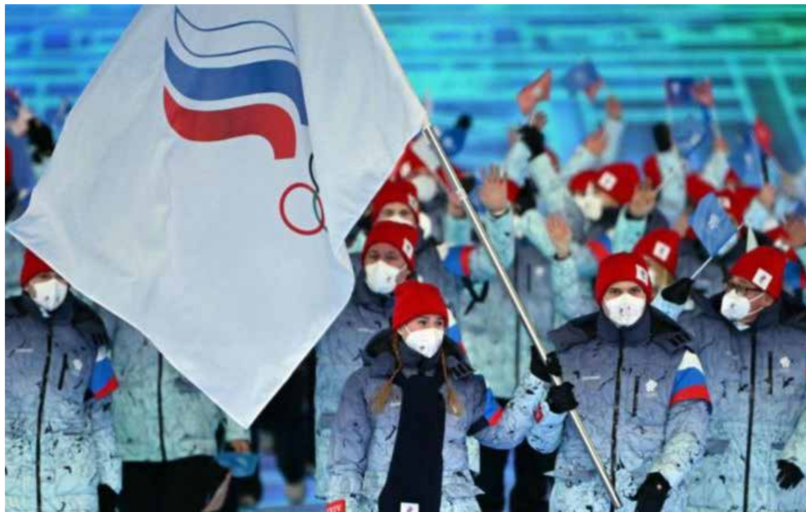
Russian and Belarusian athletes were allowed to compete under a neutral flag at the Winter Olympics in Beijing last year

it described as a “grim anniversary”, the IOC said it “re-affirms its unwavering solidarity with the Ukrainian athletes”, adding: “We all want to see a strong team from the National Olympic Committee of Ukraine at the Olympic Games Paris 2024 and the Olympic Winter Games Milano Cortina 2026”.