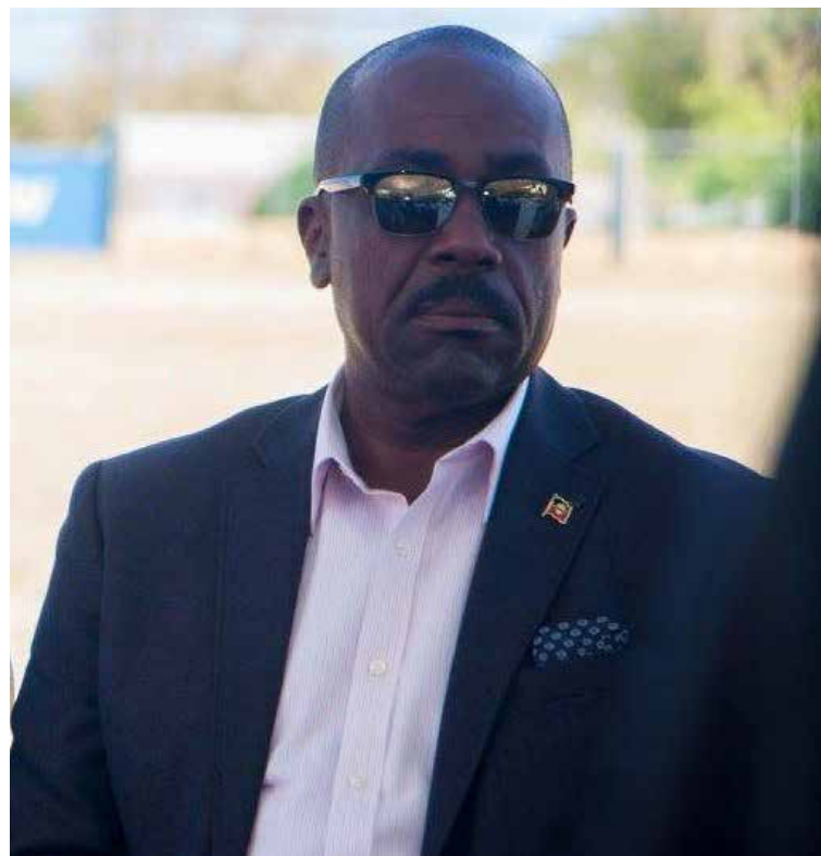
Minister of Agriculture, E. P. Chet Greene

The next meeting will involve farmers from the