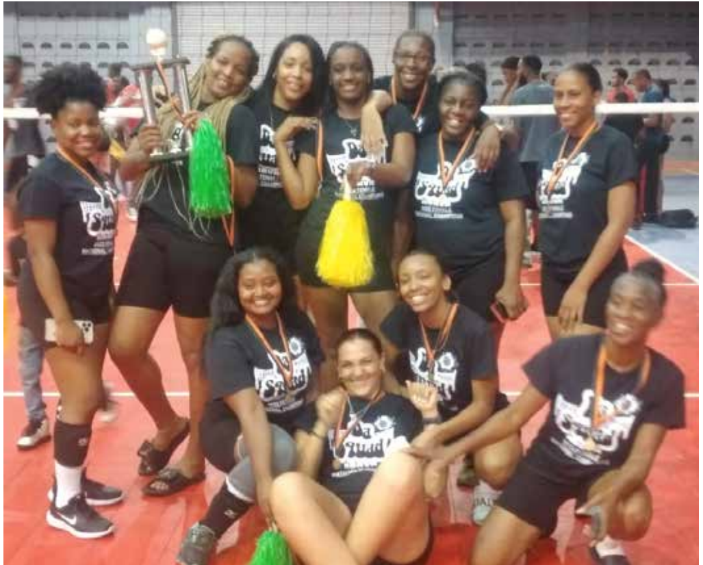
Last year's first time champions Da Squad will be defending their national female division title in the 2023 Antigua and Barbuda Amateur Volleyball Association's local club championships. (File photo)

“On this painful one-year mark, the entire Olympic Movement reiterates the call we made one year ago to all the political leaders of the world: “Give Peace a Chance.”