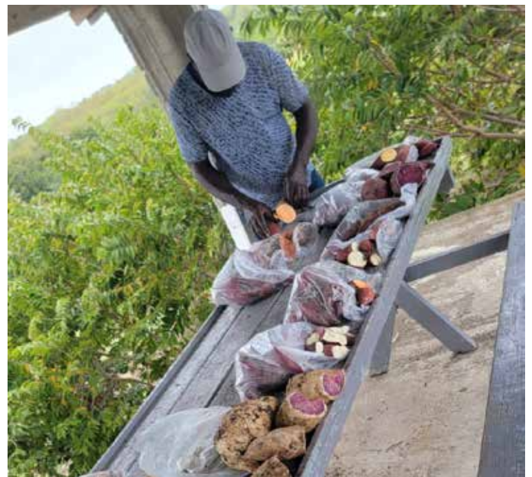
Samples of drought resistant sweet potato varieties

The workshop series continues on 27th and 28th February and will culminate with a final training session in Barbuda on 6th March.