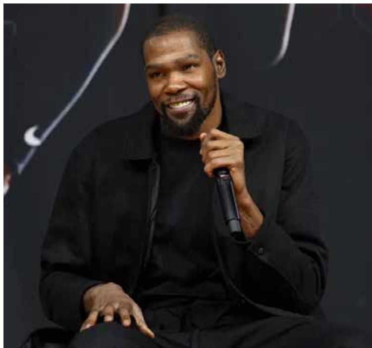
Phoenix Suns forward Kevin Durant, speaks to the media after being introduced during an NBA basketball team availability, Thursday, Feb. 16, 2023, in Phoenix.

But starting with the Kings, there are 11 teams in the standings — Sacramento, the Los Angeles Clippers (who just got Westbrook, after he was bought out by Utah following a trade with the Lakers), Phoenix, Dallas (now with Kyrie Irving alongside Luka Doncic), New Orleans, Minnesota, Golden State, Oklahoma City, Utah, Portland and the Lakers — separated by just