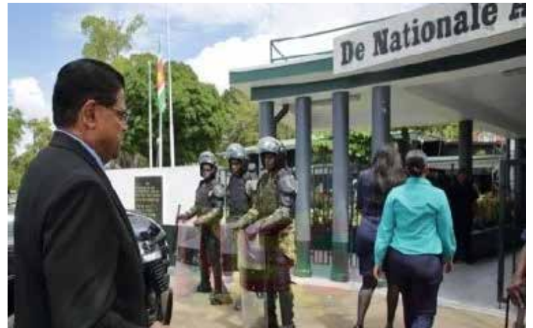
The National Assembly is heavily guarded as legislators resume deliberations on the budget following last weekend's violent protest.

"Citizens have the democratic right to express their dissatisfaction, because of the deteriorating living conditions of large parts of so-