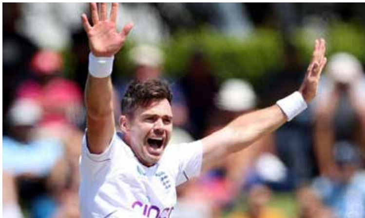
James Anderson is the fifth-oldest bowler to be ranked Test number one

has been number one, most recently in 2018.