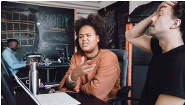
Understaffing can create stress, anxiety and burnout for employees