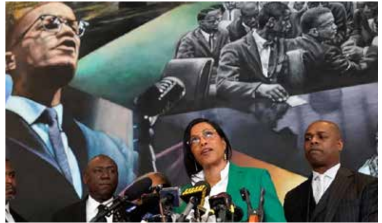
His family announced the lawsuit at the memorial where he was killed 58 years ago.

Mr Crump said Malcolm X's family intends to