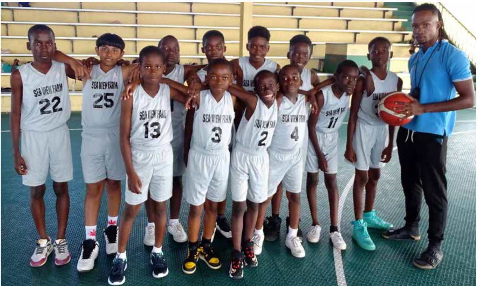
Sea View Farm Primary was among the winners in the Mini Boys Primary Division in the Inter-Schools' basketball league at the YMCA Sports Complex on Monday, 20th February.