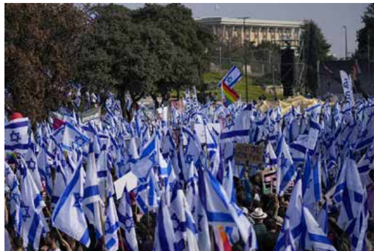
Israelis protest against plans by Prime Minister Benjamin Netanyahu's new government to overhaul the judicial system outside the Knesset, Israel's parliament in Jerusalem, Monday, Feb. 20, 2023. Israel's government is pressing ahead with its contentious plan to overhaul the country's legal system. A vote in parliament on Monday is due despite an unprecedented uproar that has included mass demonstrations, warnings from military and business leaders and calls for restraint from the U.S.

children's future, for our country's future. We don't intend to give up," opposition leader Yair Lapid told a meeting of his party in the Knesset as protesters amassed outside.