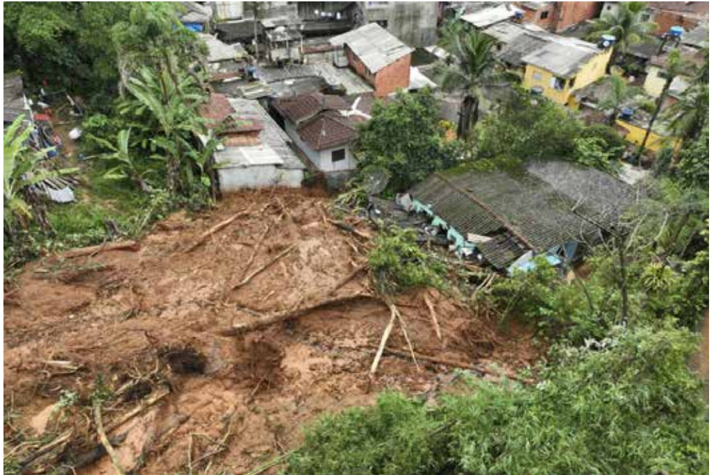
Mud covers an area after flooding triggered deadly landslides near Juquehy beach in Sao Sebastiao, Brazil, Monday, Feb. 20, 2023.

Members of the armed forces joined the search and rescue efforts, aggravated by poor access to many areas after landslides blocked the snaking roads in the region's highlands and floods washed away chunks of pavement in low-lying and oceanfront areas.