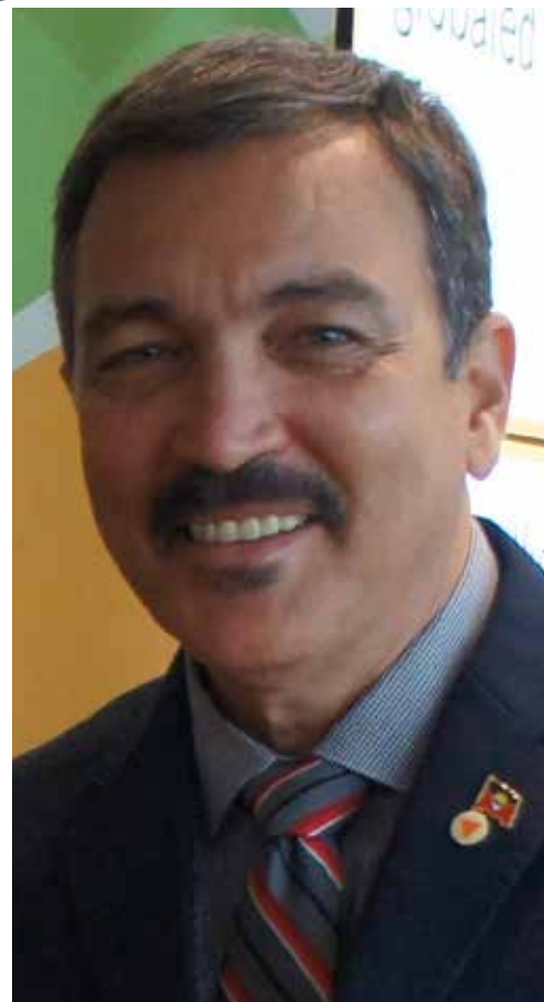
Tourism Minister Charles Fernandez

He also noted that the cabinet has given its approval for a percentage of the funds reserved for marketing to be spent on enhancing the local visitor experience.