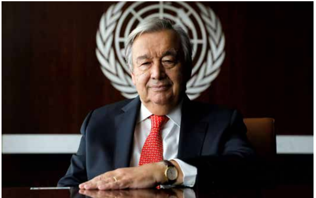
UN Secretary General, António Guterres.

Guyana considers that no greater homage can be paid to it by our sister Republic than full compliance with its terms, including Article IV paragraph 2, pursuant to which the Secretary General of the United Na-