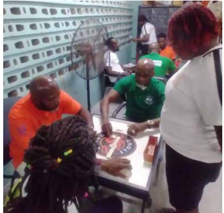
Players compete in the in the Antigua and Barbuda National Domino Association's League at the ABNDA's headquarters in Ottos over the weekend.

However, no games were played in the Team Three-Hand competition last