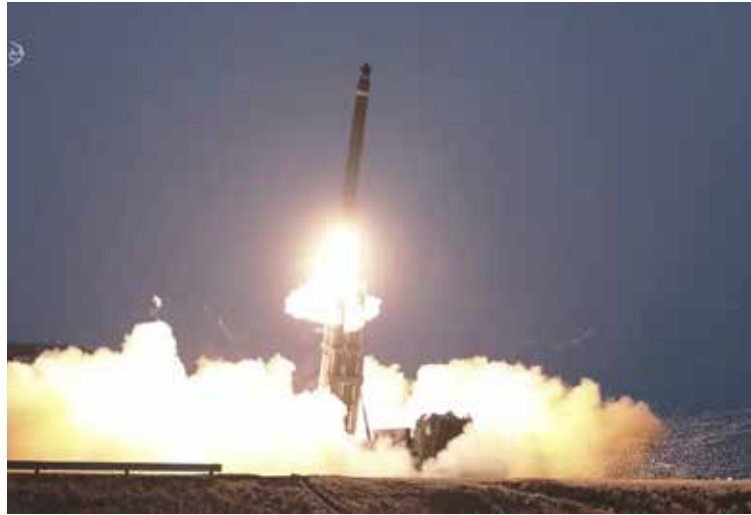
This image made from video broadcasted by North Korea's KRT shows what it says is a ballistic missile being launched from an undisclosed location in North Korea, Monday, Feb. 20, 2023.

Both South Korea and Japan condemned recent North Korea launches as threats to international peace