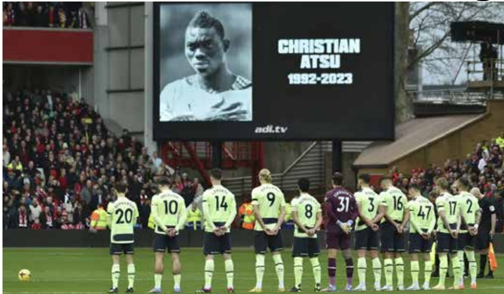
Players pay a minute of silence as tribute to Christian Atsu who died in the Turkey earthquake ahead the English Premier League soccer match between Nottingham Forest and Manchester City at City ground in Nottingham, England, Saturday, Feb. 18, 2023.

The 31-year-old Atsu, who played for Premier League teams Chelsea and Newcastle, had joined Turkish club