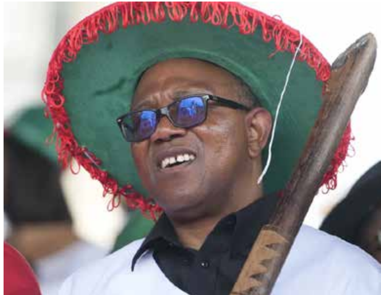
Nigeria's Labour Party's Presidential Candidate Peter Obi, attends an election campaign rally at the Tafawa Balewa Square in Lagos Nigeria, Saturday, Feb. 11, 2023. The leading contenders in Nigeria's presidential election have made their last push for support as the campaign period nears its end. The ruling party's Bola Tinubu, the main opposition's Atiku Abubakar and third-party candidate Peter Obi appealed for votes from the 93 million people registered to vote in the Feb. 25, 2023 election.

with a worsening security crisis that has killed thousands in the past year, an ailing economy that has made citizens poorer, and growing separatist agitations in the southern region that have left the country more divided along ethnic lines.