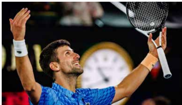
Djokovic returned to the world number one position after winning the Australian Open in January

Djokovic first became world number one in 2011