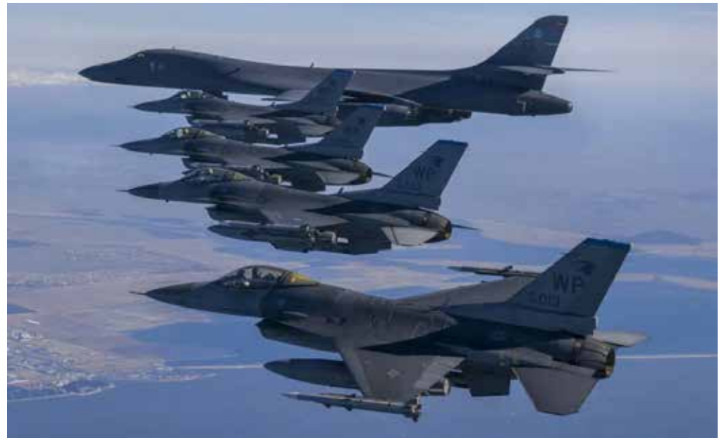
In this photo provided by South Korea Defense Ministry, a U.S. Air Force B-1B bomber, top, flies in formation with U.S. Air Force F-16 fighter jets over the South Korea Peninsula during a joint air drill in South Korea, Sunday, Feb. 19, 2023. (South Korea Defense Ministry via AP)

The Hwasong-15 launch demonstrated the North's "powerful physical