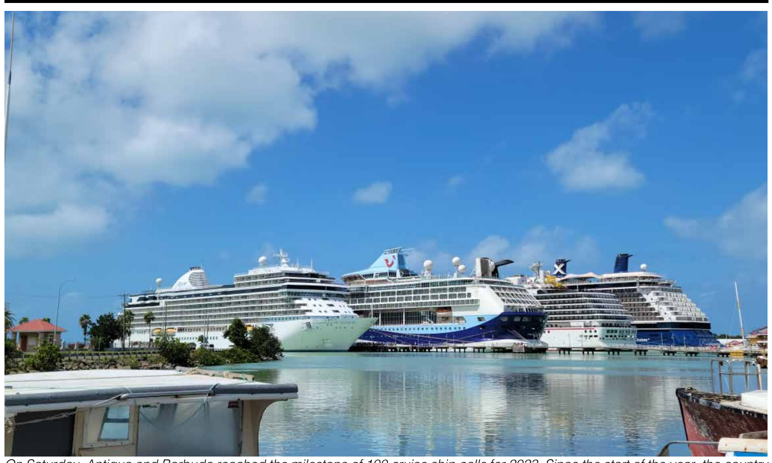
On Saturday, Antigua and Barbuda reached the milestone of 100 cruise ship calls for 2023. Since the start of the year, the country has welcomed 181,917 passengers compared to 82,232 for the same period in 2022. Story on page 3.