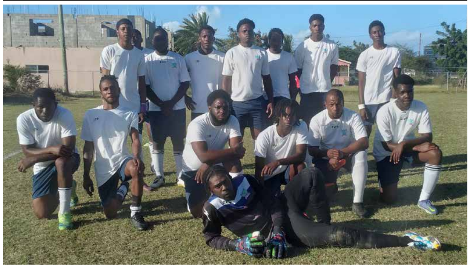
The Fort Road team that claimed their third win in the ABFA's First Division on Thursday, 16th February, 2023.