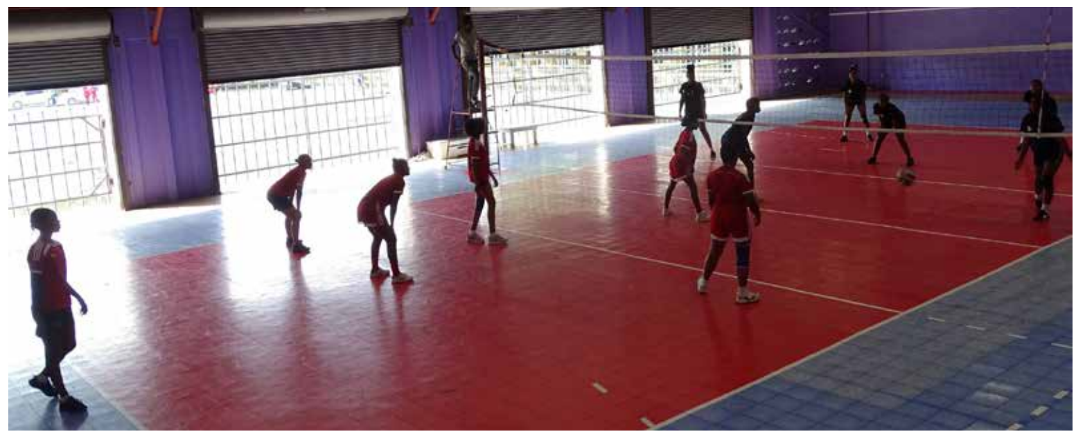
The Ottos Comprehensive School (black uniform) and Jennings Secondary (red uniform) compete in a female division encounter at the indoor volleyball stadium at the YMCA Sports Complex earlier this month. The Ottos Comprehensive team is currently in second place in Zone 2 of the girls' division in the Inter-Schools' Volleyball League competition.