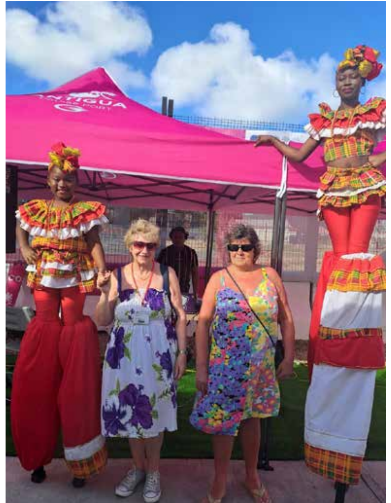
Passengers travelling on the Arvia pose with stilt walkers from RT Performers