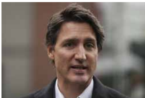
Canadian Prime Minister Justin Trudeau speaks in Vancouver, British Columbia, Sunday, Jan. 22, 2023.

F-22 fighter jets have now taken out three objects in the airspace above the U.S. and Canada over seven days, a stunning development that is raising questions on just what, exactly, is hovering overhead and who has sent them.