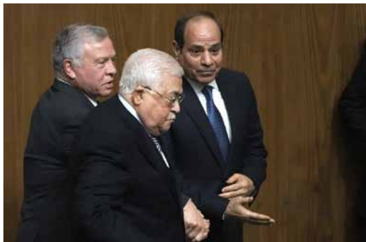
Egyptian President Abdel-Fattah el-Sissi, right, greets Palestinian President Mahmoud Abbas, centre, and King Abdullah II of Jordan, during a conference to support Jerusalem at the Arab League headquarters in Cairo, Egypt, Sunday, Feb. 12, 2023.

There was no immediate comment from Israel's government.