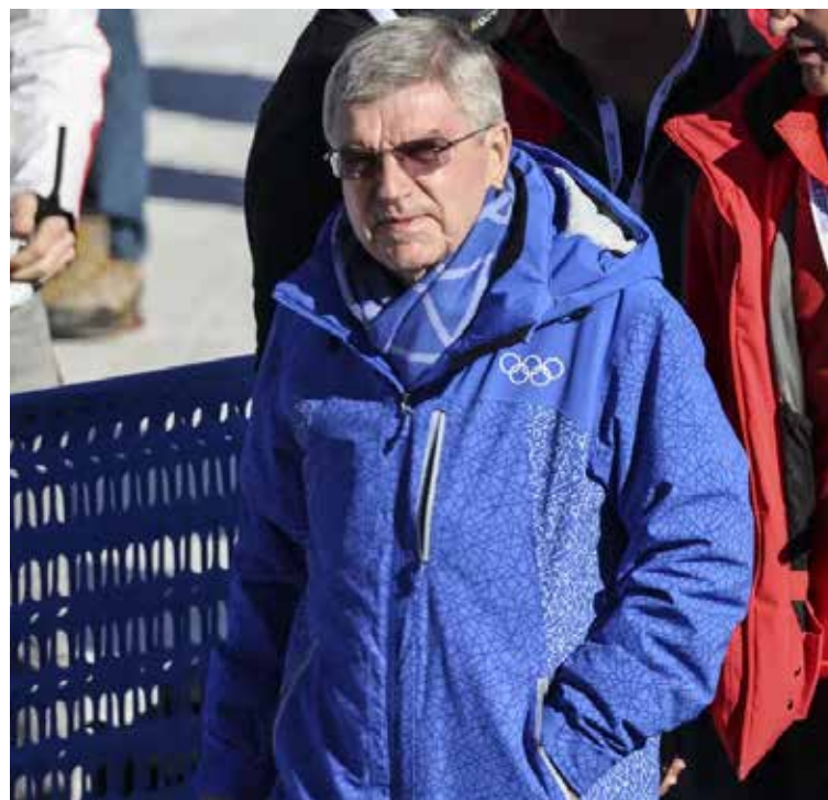
IOC (International Olympic Committee) president Thomas Bach walks in the finish area of the alpine ski, men's World Championship downhill, in Courchevel, France, Sunday, Feb. 12, 2023.

The IOC has cited advice from United Nations human rights experts that banning athletes on the basis of their passport would be discrimination.