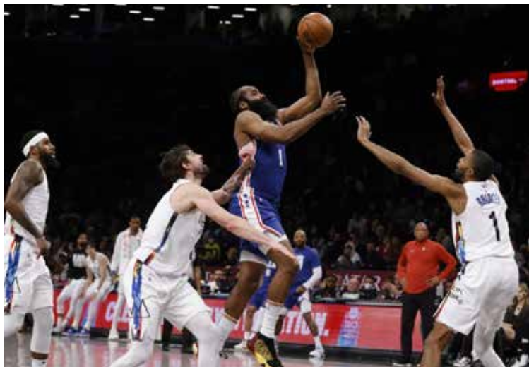
Philadelphia 76ers' James Harden, centre, shoots against Brooklyn Nets' Joe Harris, second from left, and Mikal Bridges, right, during the second quarter of an NBA basketball game Saturday, Feb. 11, 2023, in New York.

"There was just a lot of dysfunction - clearly. There were a lot of internal things that I'm not going to ever just say or put in the media or anything, and that was one of the reasons why I chose to make my decision," Harden said after scoring 29 points in the 76ers' 101-98 victory.