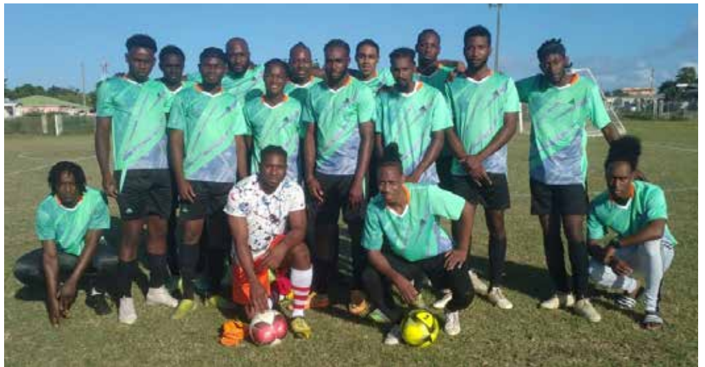
The Potters Tigers team that beat Fort Road in their first division encounter at the Fort Road playing field on Thursday, 9th February, 2023.