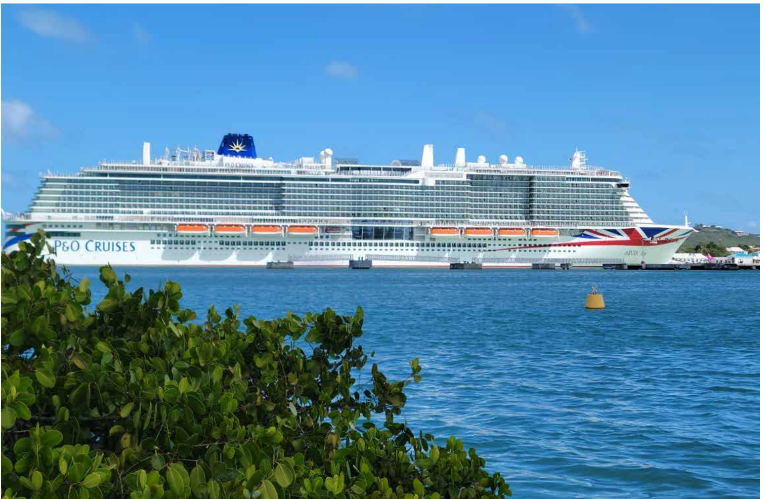
The Arvia made the second of four scheduled calls this season to the St. John's Harbour on Saturday. Story on page 5.