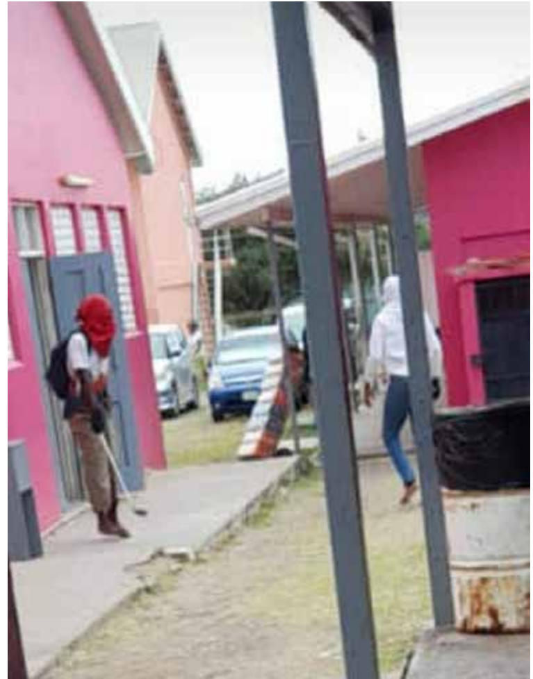
A witness to the attack at CHSS was able to capture this photograph of one of the attackers, seen here wielding a metal golf club, on their mobile phone as they took cover in a nearby classroom.

Some parents and guardians of children who attend CHSS vowed not to