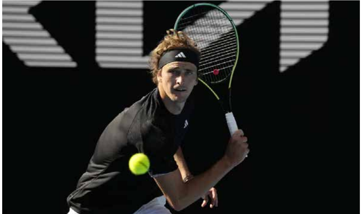
Alexander Zverev of Germany plays a backhand return to Michael Mmoh of the U.S. during their second round match at the Australian Open tennis championship in Melbourne, Australia, Thursday, Jan. 19, 2023.

The 25-year-old Zverev, who won the singles gold medal at the Tokyo Olympics, has always denied the accusations. He is currently ranked 14th.