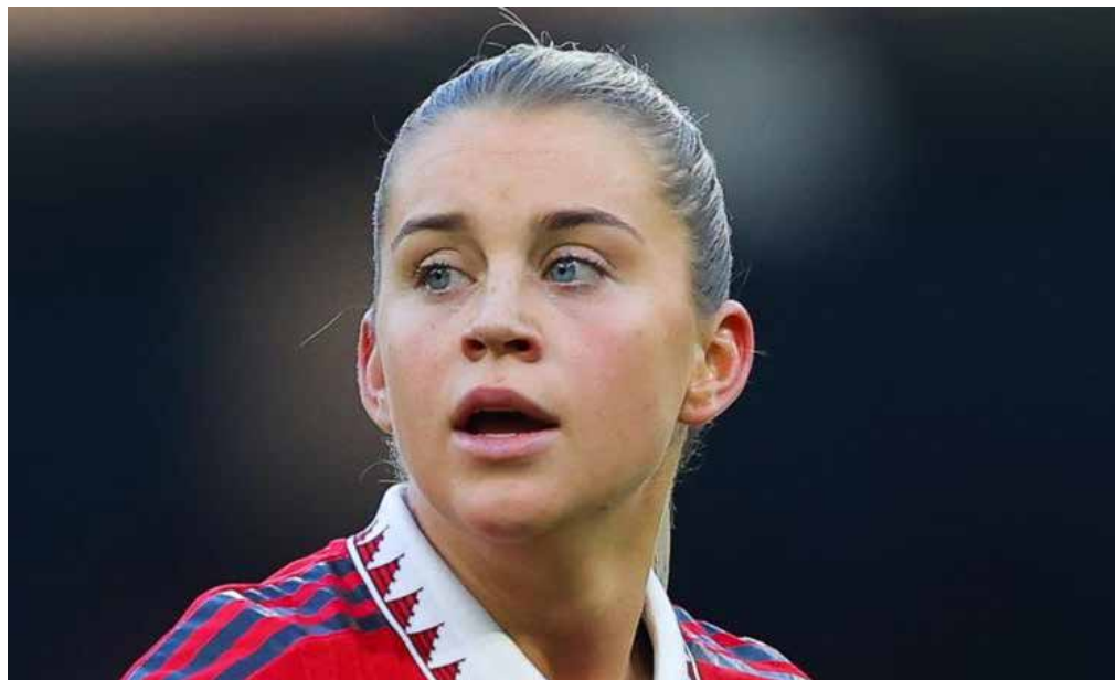
Alessia Russo has scored five times in the WSL this season

WSL appearances this season to take her total to 17 goals in 35 top-flight appearances since joining from North Carolina Tar Heels three years ago.