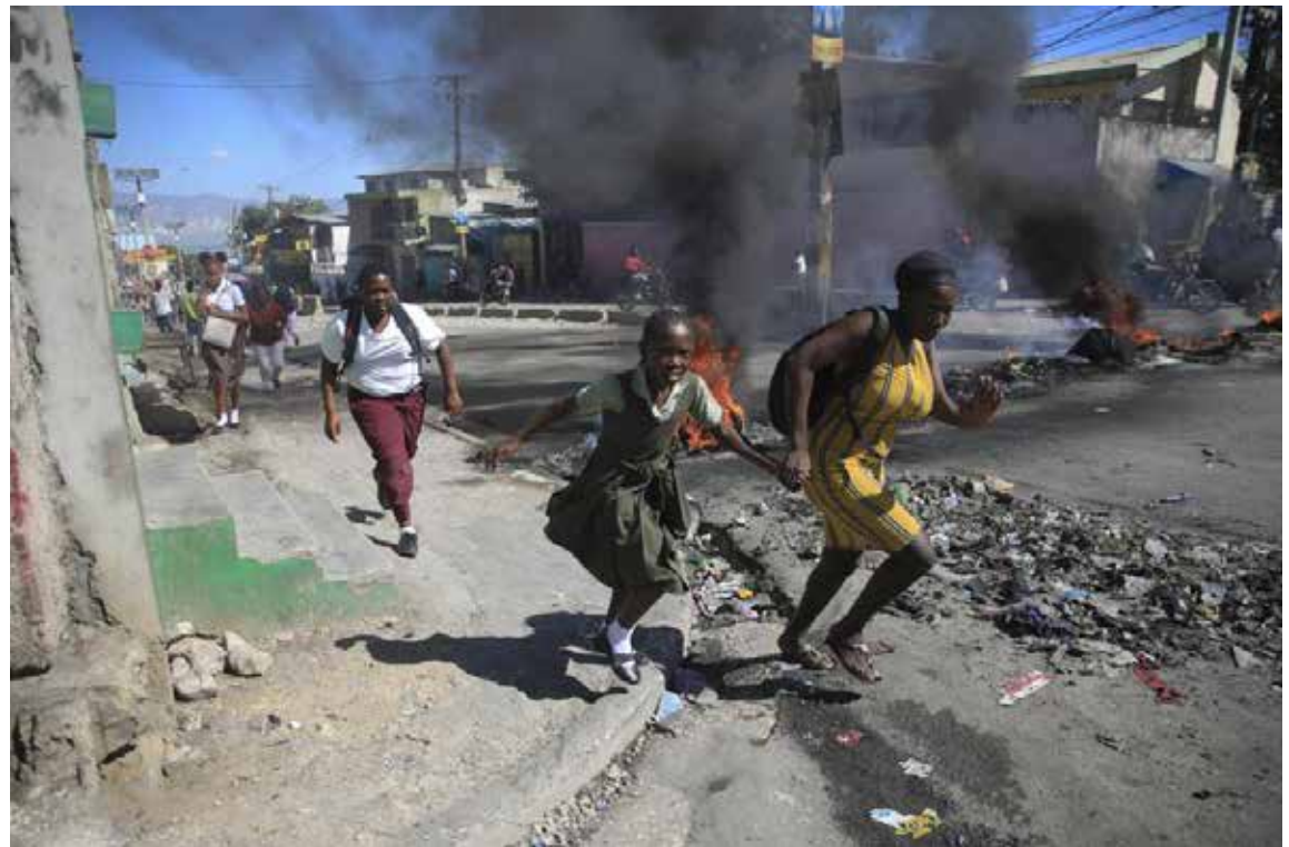
A woman and her daughter run past a barricade that was set up by police protesting bad police governance in Port-au-Prince, Haiti, Jan. 26, 2023.

Following the slaying of six officers, video circulating on social media – likely filmed by gangs – showed six naked bodies stretched out on the dirt with guns on their chests. Another shows two masked men using officers’ dismembered limbs to hold their cigarettes while