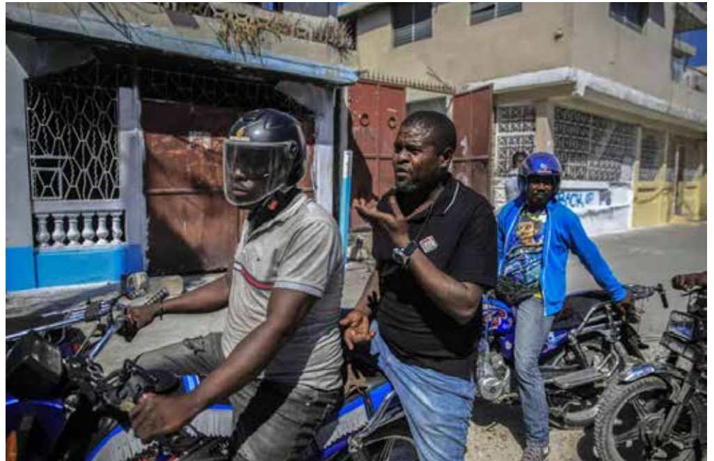
Jimmy Cherizier, the leader of the "G9 et Famille" gang, talks with members of his gang while taking a ride on the back of a motorcycle in his district of Delmas 6 in Port-au-Prince, Haiti, Tuesday, Jan. 24, 2023. Cherizier, best known by his childhood nickname Barbecue, has become the most recognized name in Haiti.

At a time when democracy has withered in Haiti and gang violence has spiralled out of control, it's armed men like Cherizier that are filling the power vacuum left by a crumbling