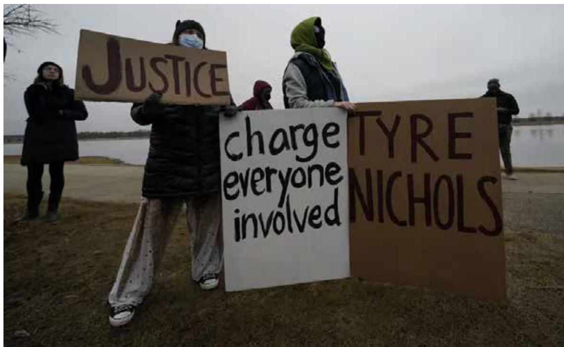
A group of demonstrators gather at dusk in Shelby Farms Park on Monday, Jan. 30, 2023, in Memphis, Tenn., in response to the death of Tyre Nichols, who died after being beaten by Memphis police officers. Nichols, who had a hobby in photography, frequented the park to photograph sunsets.

That brought the total number of Memphis officers who have been disci-