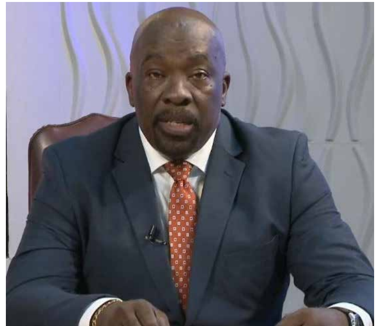
Minister with responsibility for Antigua Public Utilities Authority, Melford Nicholas

“I want to ensure that all of the right equipment is available on both sides and all of the right planning is done, such that when there is a need to go below the surface of the road, we can both notify the public, we execute the work at the appropriate time to minimise the disruption to vehicular