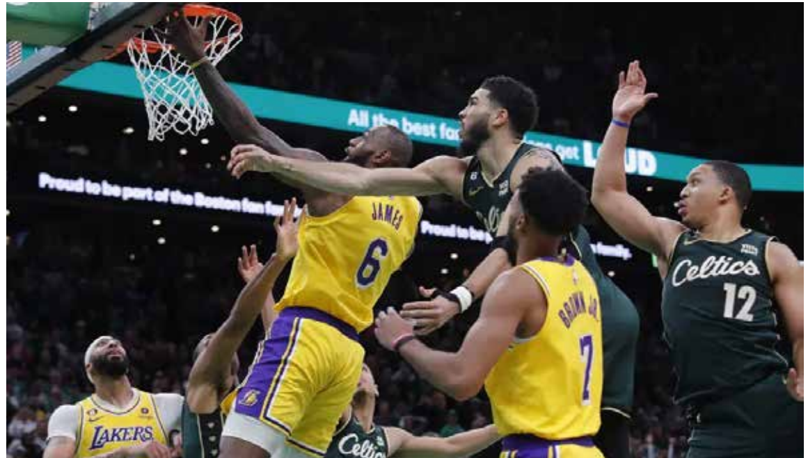
Los Angeles Lakers' LeBron James (6) misses a shot against Boston Celtics' Jayson Tatum, top centre, late in the fourth quarter of an NBA basketball game Saturday, Jan. 28, 2023, in Boston.

"We got cheated tonight, honestly. ... It's unac-