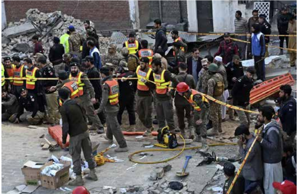
Security officials and rescue workers gather at the site of suicide bombing, in Peshawar, Pakistan, Monday, Jan. 30, 2023. A suicide bomber struck Monday inside a mosque in the northwestern Pakistani city of Peshawar, killing multiple people and wounding scores of worshippers, officials said.