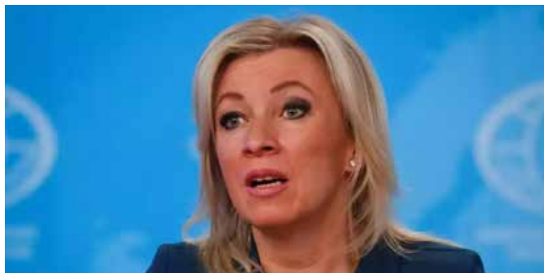
Russian Foreign Ministry spokeswoman Maria Zakharova listens during the annual news conference of Foreign Minister Sergei Lavrov in Moscow, Russia January 18, 2023.

Kyiv said earlier on Friday that Ukraine did not rule out boycotting the Olympic Games if Russian and Belarusian athletes were allowed to compete in the Paris 2024 Games.