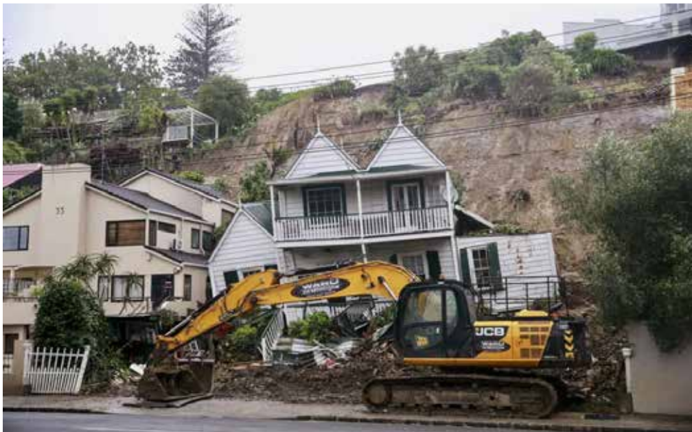
An excavator works at a home badly damaged by flooding and landslides in Auckland, New Zealand, Sunday, Jan. 29, 2023. A dangerous amount of rain is forecast Tuesday for New Zealand's most populous city four days after Auckland had its wettest day on record in a storm that claimed four lives.

"That's nothing like Friday night, but the ground is so saturated and the drains are so full that if anything, it could be more dangerous than even Friday," Brown said.