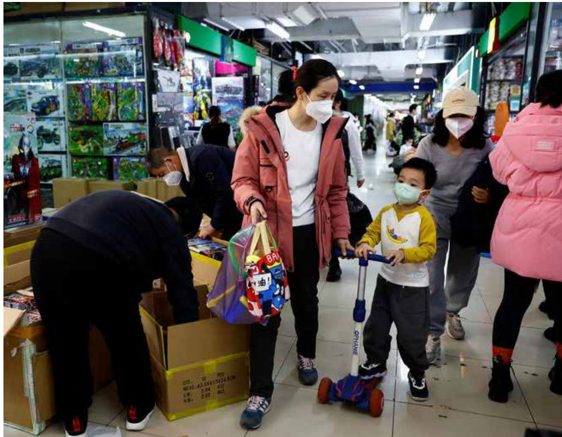
People shop ahead of the Chinese Lunar New Year at an outdoor market in Beijing, China January 13, 2023.

The measure aims to "promote long-term and balanced population development," Sichuan's health commission said in a state-