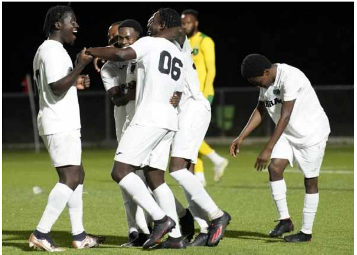
Parham celebrate after scoring a goal against Swetes during their Premier Division encounter at the ABFA Technical Center on Sunday, 29th January, 2023.

Their second win in nine matches lifted Parham to 8 points, while only their second loss in nine encounters ensured that Swetes remained fifth in the standings on 15 points.