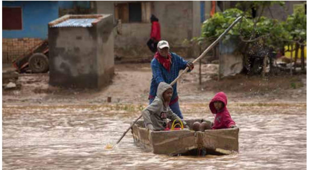
A man steers his boat that is used by residents to move around the street flooded with rain water in Antananarivo, Madagascar, Saturday, Jan. 28, 2023. A tropical storm Cheneso made landfall across north-eastern Madagascar on January 19, bringing strong winds to coastal regions, while heavy rain brought significant flooding to northern parts of the country.

"People have been reacting generally in the right way, but some people have not been taking enough note