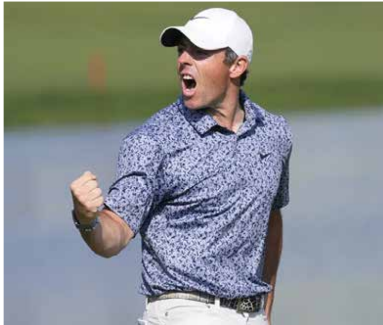
Rory McIlroy of Northern Ireland celebrates after he won the the Dubai Desert Classic, in Dubai, United Arab Emirates, Monday, Jan. 30, 2023.

McIlroy and Reed looked unlikely, with McIlroy starting Monday with a three-shot lead - and four ahead of American. However, he was overtaken on the back nine by Reed, who picked up seven shots in his first 13 holes while McIlroy was playing safety-first golf.