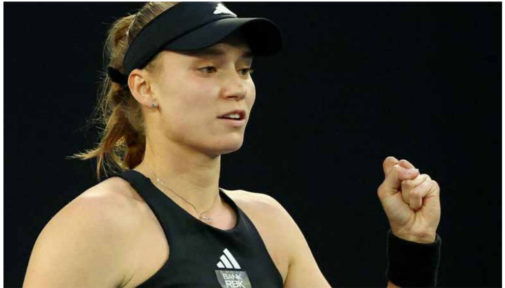
Elena Rybakina has beaten three major champions in a row on her way to a second Grand Slam final

Wimbledon and I want to come on court [for the final] and enjoy the moment."