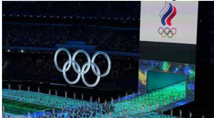
The IOC is working in plans to allow Russian and Belarusian athletes to compete at the 2024 Games under a neutral flag

"We, and many other countries, have been unequivocal on this throughout, and we will now work urgently