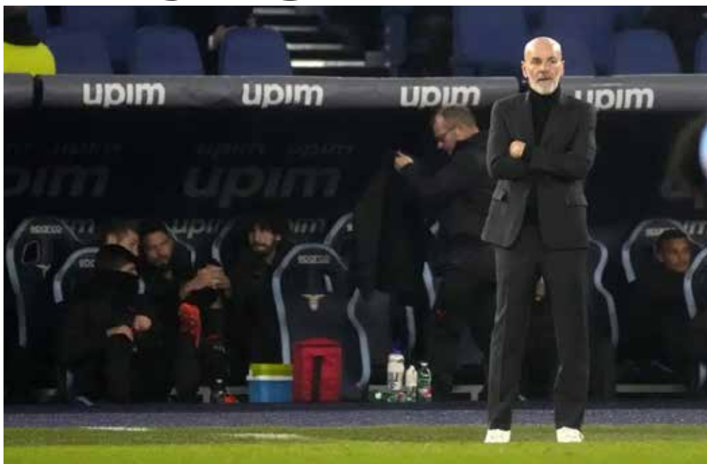
AC Milan's manager Stefano Pioli reacts after the fourth goal against his team during the Italian Serie A soccer match between Lazio and AC Milan at the Olympic Stadium in Rome, Tuesday, Jan. 24, 2023.

conceded 11 goals in three matches. This is a delicate moment," Milan director Paolo Maldini said. "At the same time we're alone in second place, so I don't think it's a massive disaster.