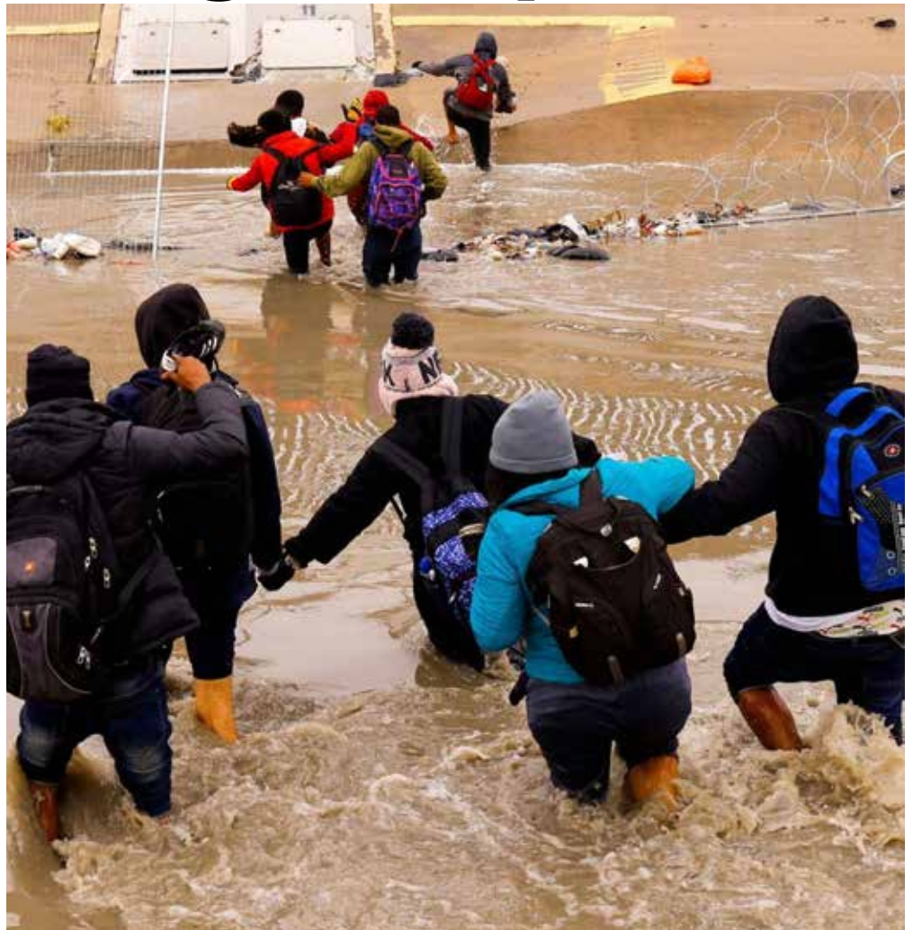
Asylum-seeking migrants cross the Rio Bravo river, the border between the United States and Mexico, to request asylum in El Paso, Texas, U.S., as seen from Ciudad Juarez, Mexico January 2, 2023.

His move to expand the Trump-era program has angered some immigration advocates and Democratic lawmakers who point to his pledge to reverse the Republican's hardline border policies.