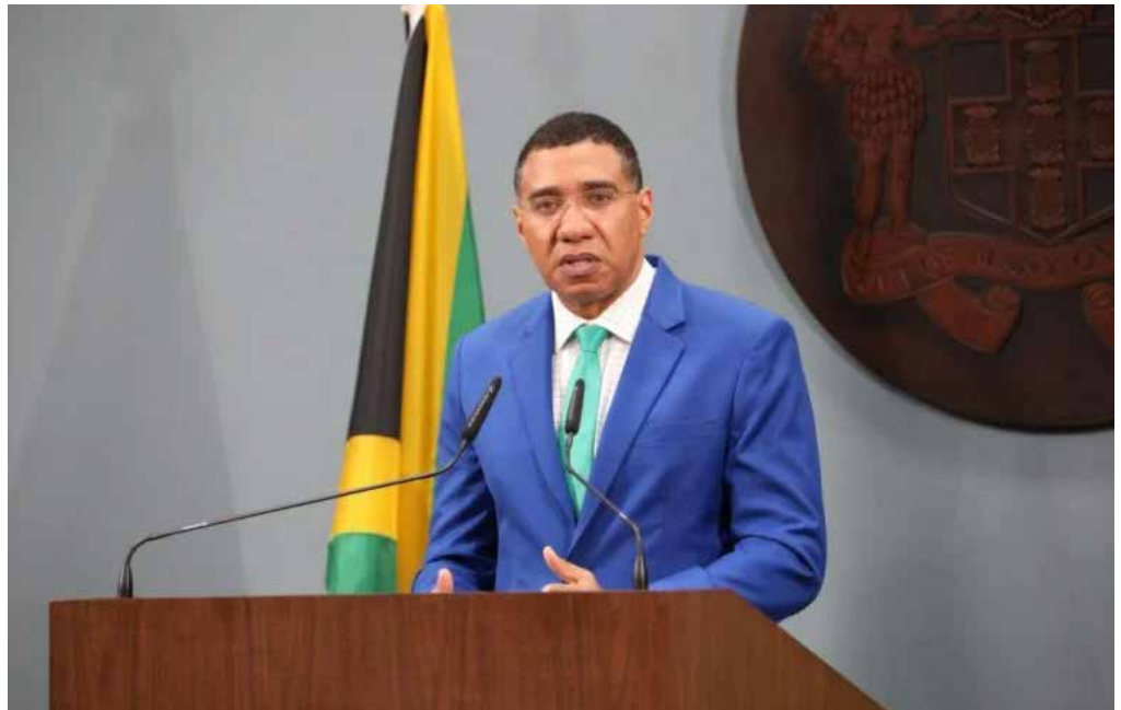
Jamaica's Prime Minister Andrew Holness.

Holness also said there would be "no political interference or political