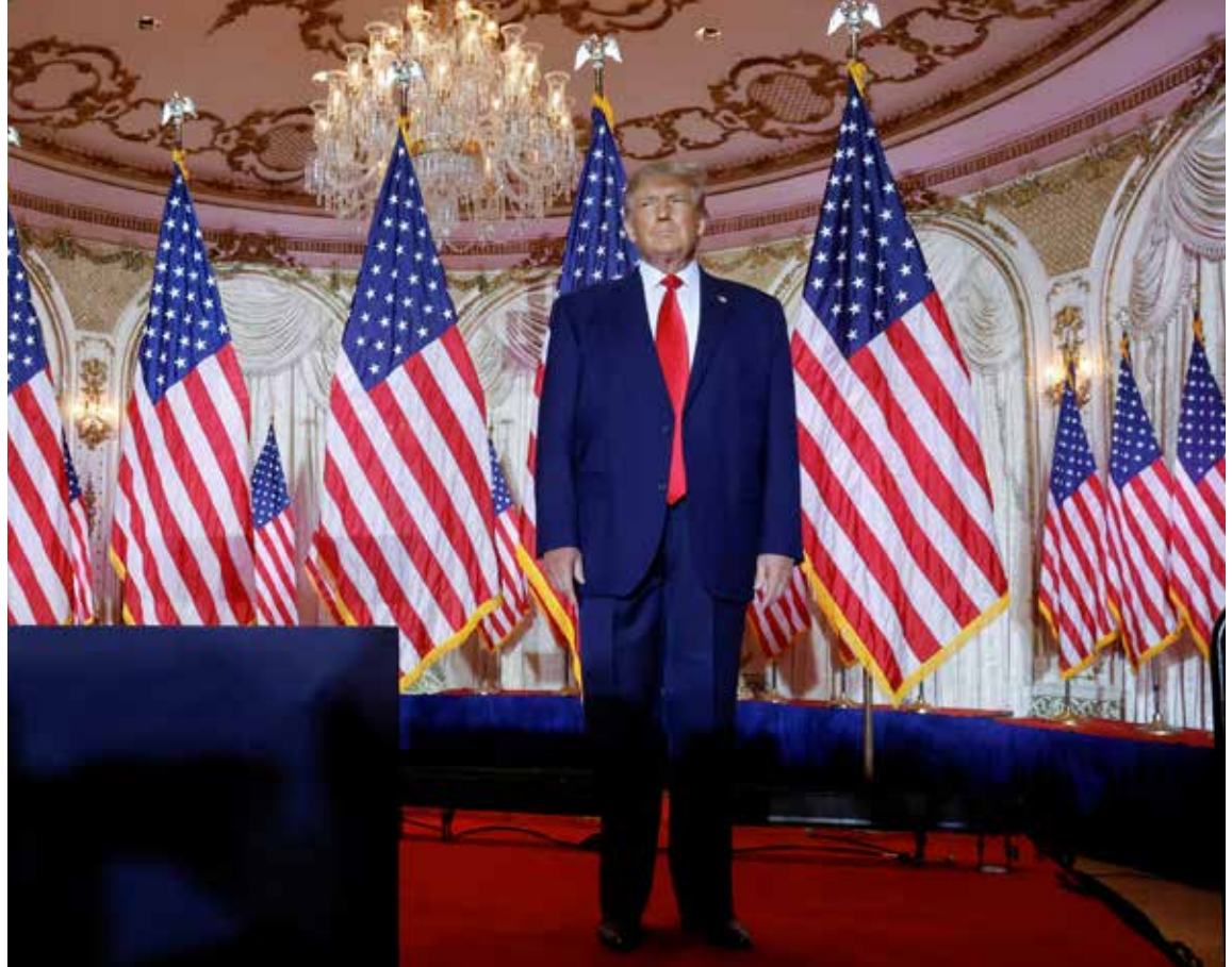
Former U.S. President Donald Trump announced that he will once again run for U.S. president in the 2024 U.S. presidential election during an event at his Mar-a-Lago estate in Palm Beach, Florida, U.S. November 15, 2022.

"In the event that Mr. Trump posts further violating content, the content will be removed and he will be suspended for between one month and two