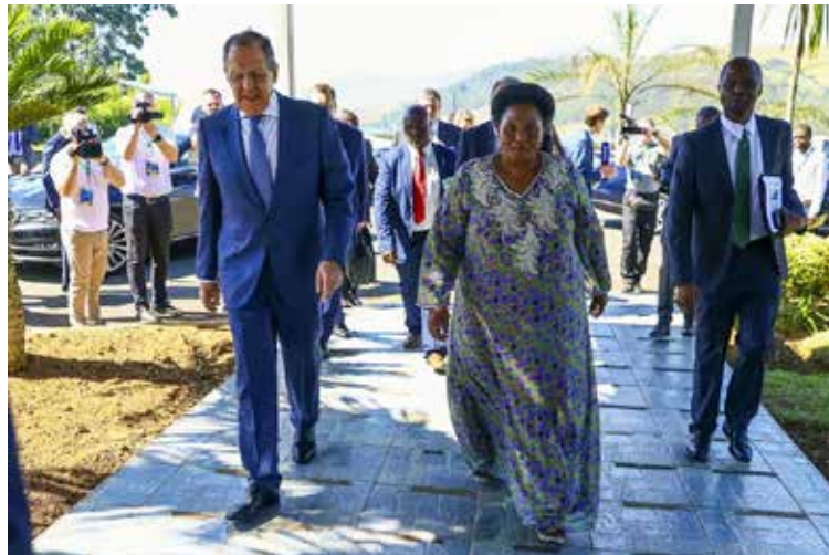
In this photo released by the Russian Foreign Ministry Press Service, Russian Foreign Minister Sergey Lavrov, left, and Eswatini's Minister of Foreign Affairs and International Cooperation Thuli Dladla walk together during their meeting in Mbabane, Eswatini, Tuesday, Jan. 24, 2023.

But an African Union official took offence at what