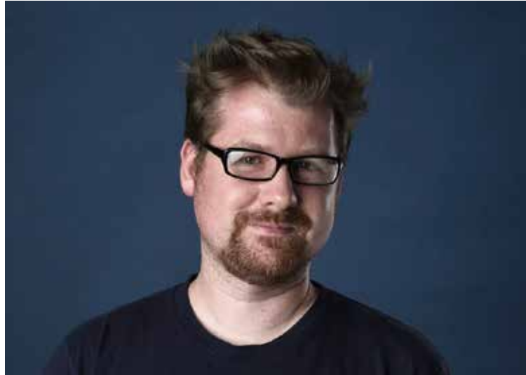
Justin Roiland poses for a portrait to promote the television series "Rick and Morty" on day two of Comic-Con International, July 21, 2017, in San Diego. Roiland, who created the animated series "Rick and Morty" and provides the voices of the two title characters, is awaiting trial on charges of felony domestic violence against a former girlfriend. A criminal complaint obtained Thursday, Jan. 12, 2023, by The Associated Press from prosecutors in Orange County, Calif., detailed the charges against him.

On Tuesday, Cartoon Network's Adult Swim division, home to the animated sci-fi sitcom "Rick and Morty," made the same move, saying in a brief statement that they have