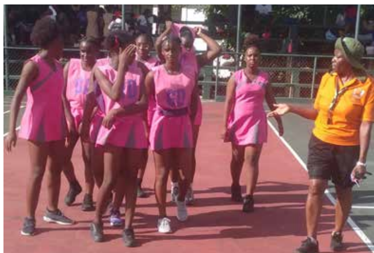
Princess Margaret School won the Under-16 division title in the 2022 Schools' Netball League. (File photo)

The 2023 Cool & Smooth Inter-schools' Netball League will shoot off on Monday, 30th January.