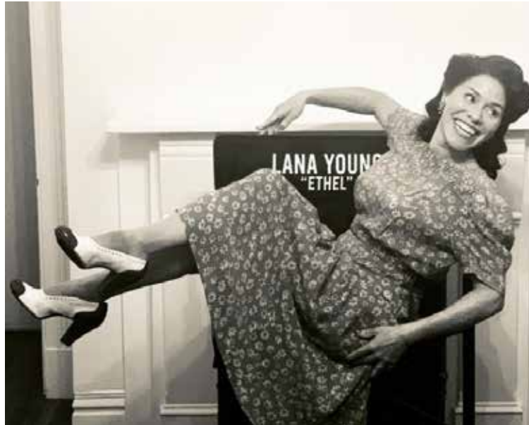
Actress Lana Young.

Netflix says the film tells a "tale of forbidden