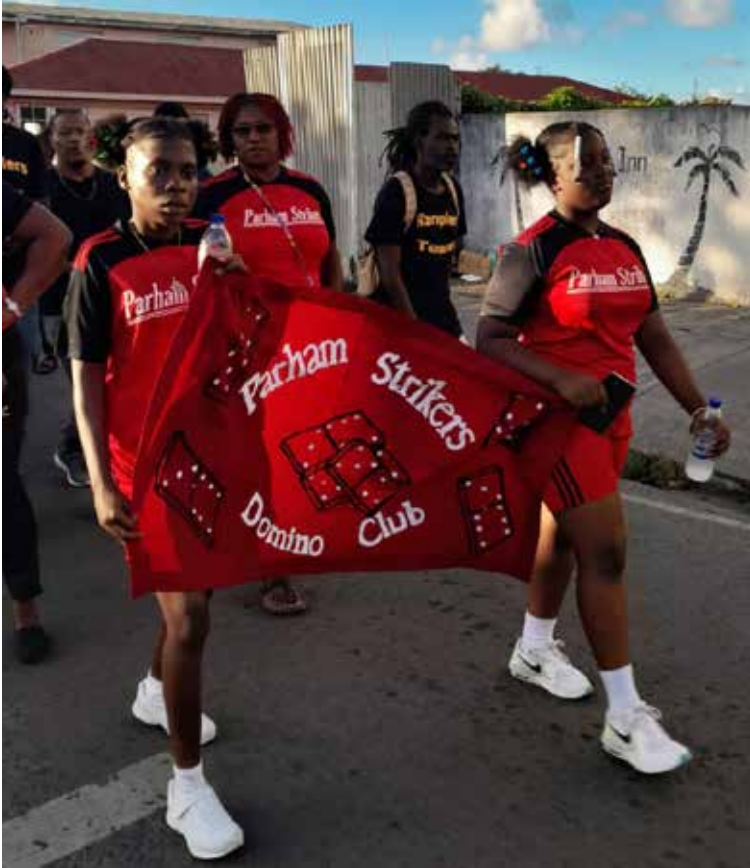
Parham Strikers, seen here during the march past to mark the opening of the 2023 ABNDA season on Saturday, 21st January, 2023, is among teams that will contest the Three-Hand Domino League.

A record number of teams have registered to contest this weekend's start of the Antigua and Barbuda National Domino Association's (ABNDA) 2023 Three-Hand League at the association's headquarters in Ottos.