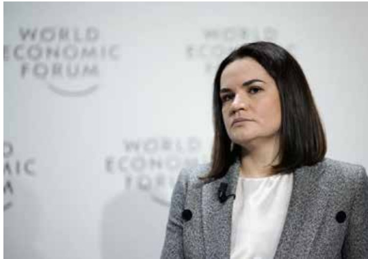
Belarus opposition leader Sviatlana Tsikhanouskaya attends a session at the World Economic Forum in Davos, Switzerland Tuesday, Jan. 17, 2023. The annual meeting of the World Economic Forum is taking place in Davos from Jan. 16 until Jan. 20, 2023.

Tsikhanouskaya said that she learned from media reports about the trial, which is being held behind closed doors, adding that she was unable to reach her lawyer appointed by the Be-