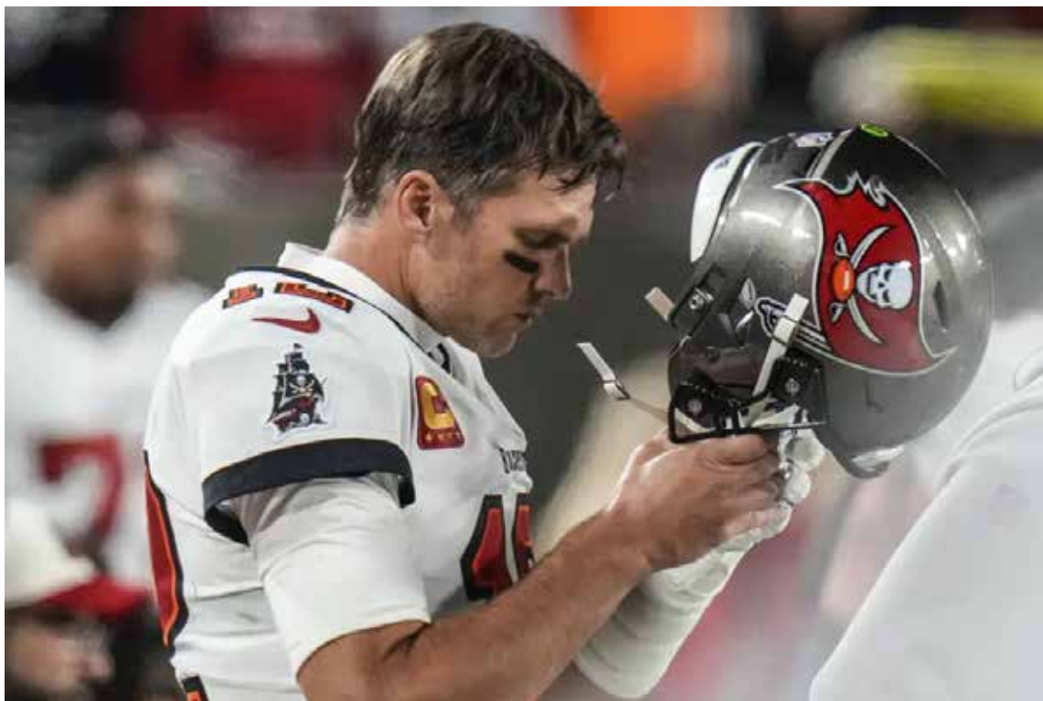
Tampa Bay Buccaneers quarterback Tom Brady (12) walks on the sidelines during the second half of an NFL wild-card football game against the Dallas Cowboys, Monday, Jan. 16, 2023, in Tampa, Fla.

Before leaving the podium, Brady thanked reporters, saying: "Hopefully, you know, I love this organisation. It's a great place to be and thank you everybody for welcoming