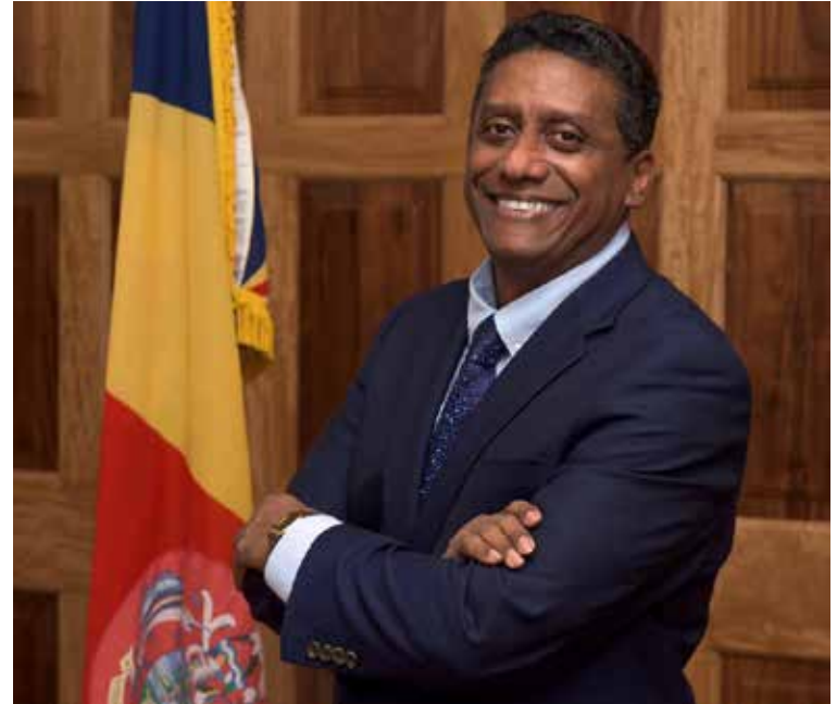
Former president of Seychelles, Danny Faure observers."

"The task we have been given is one we take seriously and will undertake solemnly in compliance with international standards for the conduct of international