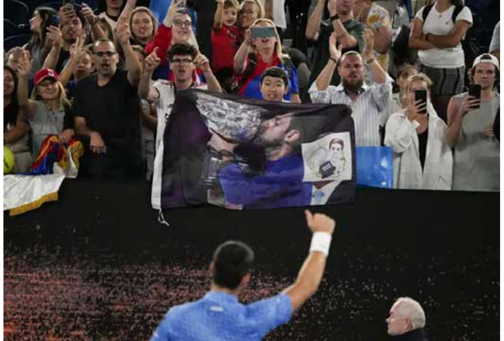
Novak Djokovic of Serbia gestures to his supporters after defeating Roberto Carballes Baena of Spain in their first round match at the Australian Open tennis championship in Melbourne, Australia, Wednesday, Jan. 18, 2023.

Djokovic's participation is one of the chief story lines, perhaps the MAIN one, of the first Grand Slam tournament of 2023. That's because Djokovic never got to play a point last season at the site of nine of his major championships, because his visa was blocked and he was deported from Australia after a legal saga tied to his