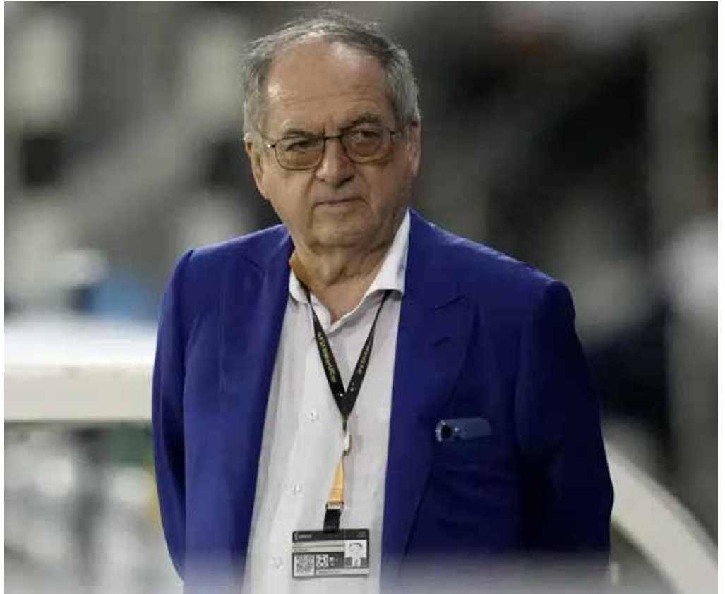
French Football Federation (FFF) president Noel Le Graet attends a training session at the Jassim Bin Hamad stadium in Doha, Qatar, on Nov. 19, 2022. The Paris prosecutor’s office says it has opened an investigation into “sexual harassment” and “moral harassment” targeting French soccer federation president Noel Le Graet. The Paris prosecutor’s office says in a message to The Associated Press that the investigation was opened following a report by the General Inspectorate of Education, Sport and Research.

Oudéa-Castéra ordered an investigation into the federation in September after the body said it would