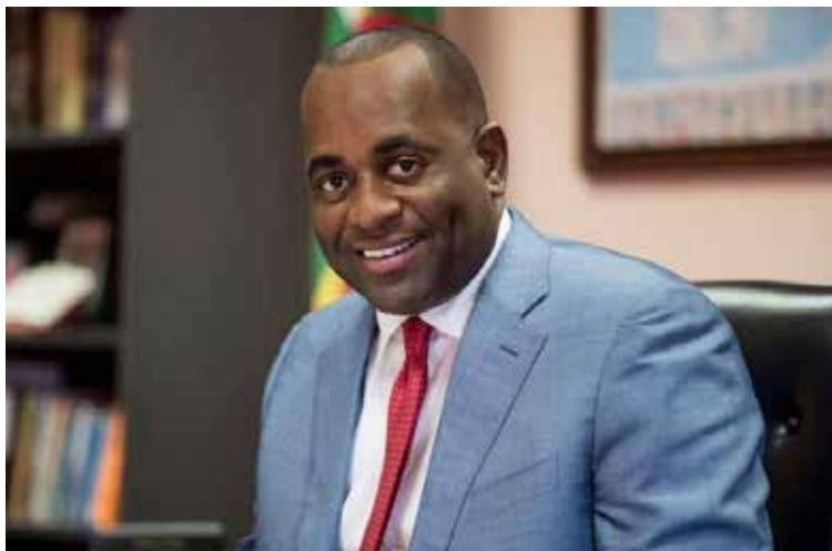
Prime Minister Roosevelt Skerrit

“Especially, with this emerging period of Carnival, where our communities are coming together to enjoy this unique festival, there