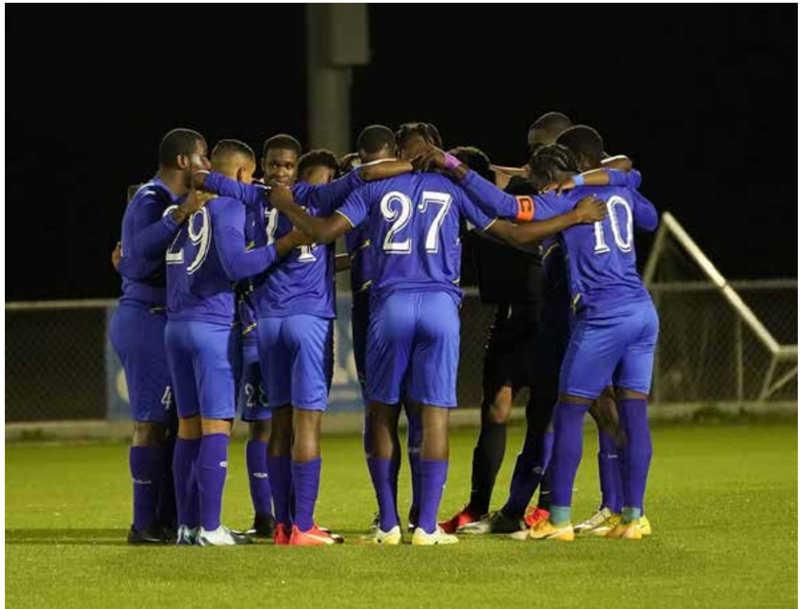
Old Road huddle just before kick off in their Premier Division match against Cedar Grove Blue Jays at the ABFA Technical Center on Monday, 9th January, 2023.

The result allowed Old Road to overtake Villa Lions and move into third place in the 16-team competition. The win lifted Old Road to 13 points, one more than Villa Lions from the same number of appearances.