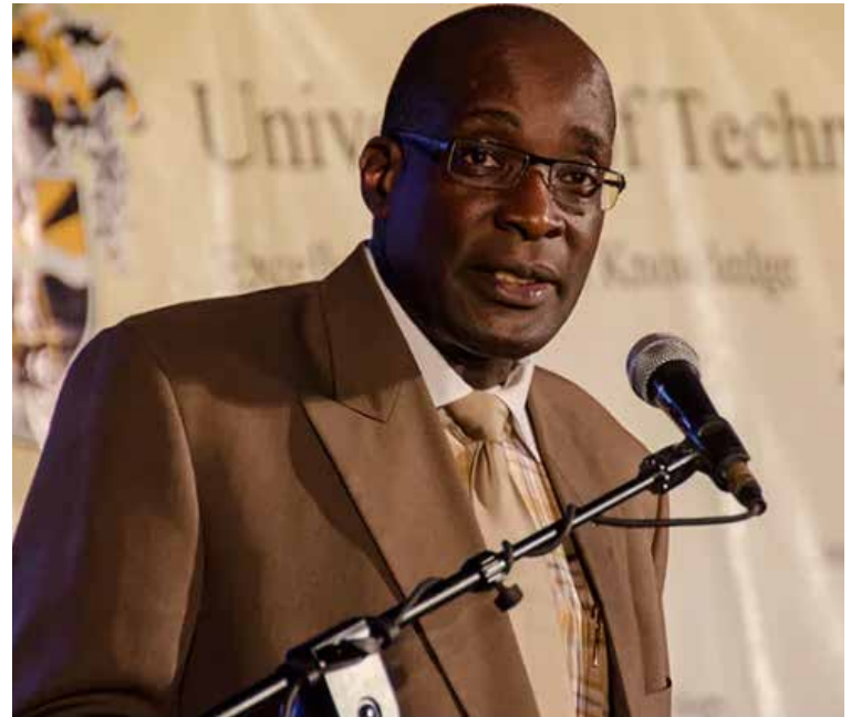
Jamaica's former Education Minister, Ruel Reid.