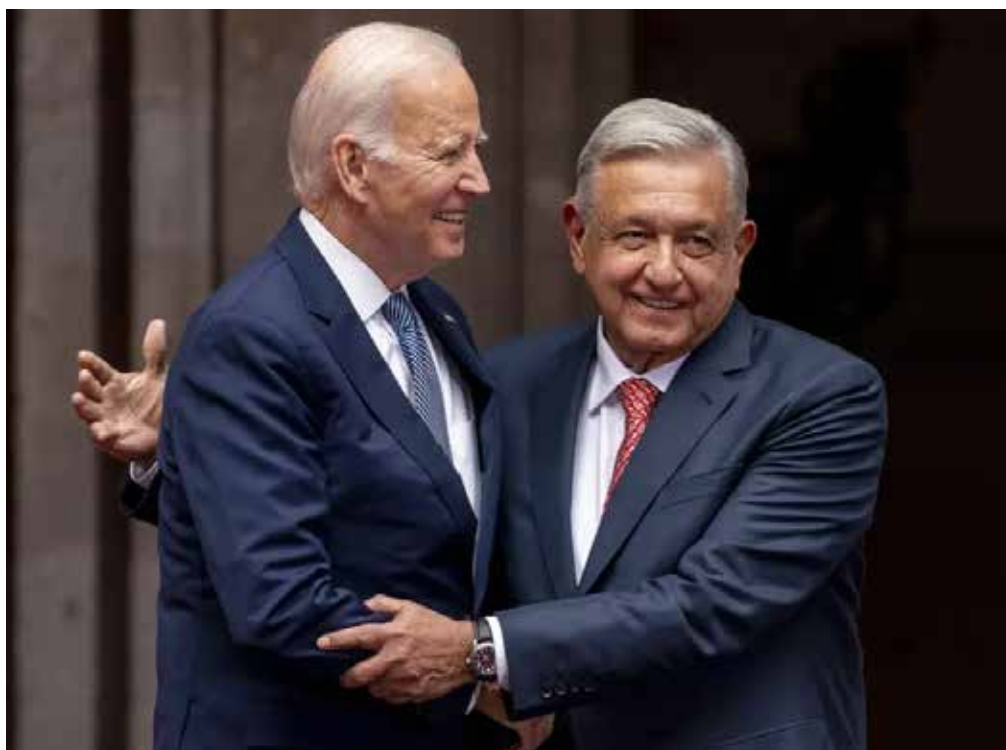
President Joe Biden is greeted by Mexican President Andres Manuel Lopez Obrador as he arrives at the National Palace in Mexico City, Mexico, Monday, Jan. 9, 2023.

The centerpiece of the summit will be hours of talks with all three leaders, but Biden will start Tuesday with a meeting with Trudeau. It's unlikely to