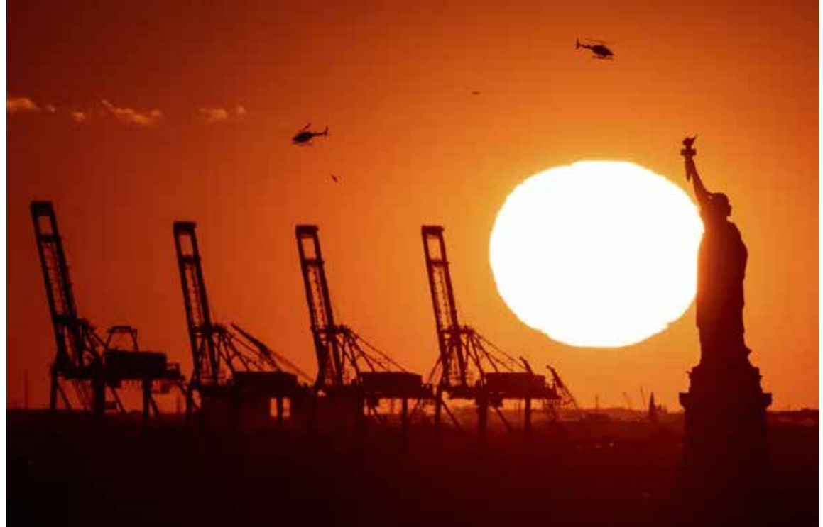
Container cranes at a port in New Jersey appear behind the Statue of Liberty, Sunday, Nov. 20, 2022, in New York. The global economy will come “perilously close” to a recession this year, led by weaker growth in all the world’s top economies - the United States, Europe and China - the World Bank warned Tuesday.

And Europe, long a major exporter to China, will likely suffer from a weaker