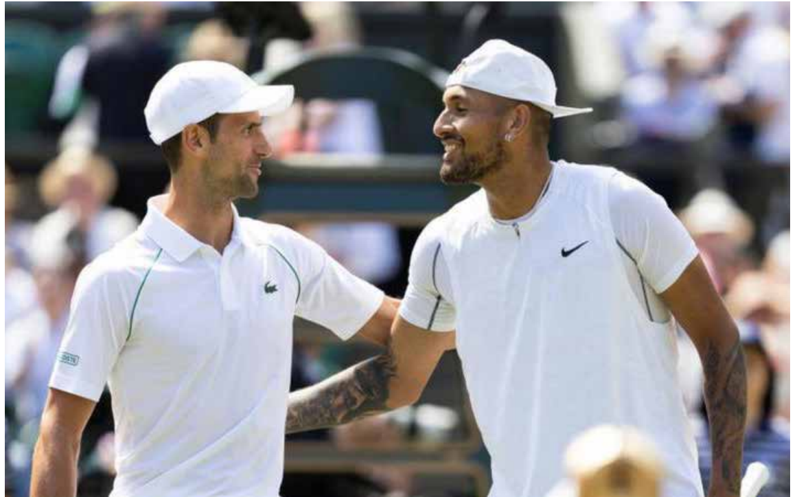
Proceeds from the tickets for Nick Kyrgios' match with Novak Djokovic will go to the Australian Tennis Foundation

of spiralling out of control - drinking every single night," Kyrgios says in the documentary, which is a 10-part series focusing on the next generation of players who are likely to challenge Djokovic and Rafael Nadal. "For four, five years of my career, it was just so chaotic.