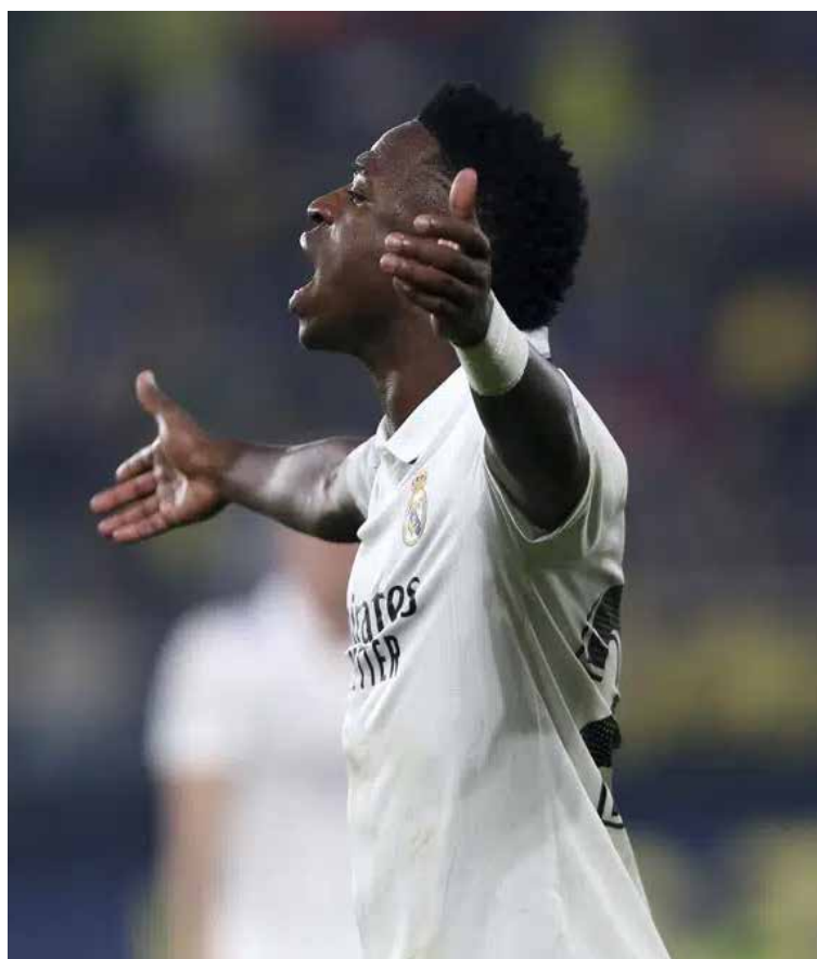
Real Madrid's Vinicius Junior reacts during the Spanish La Liga soccer match between Villarreal and Real Madrid at Estadio De La Ceramica in Villarreal, eastern Spain, Saturday, Jan. 7, 2023.

will be able to count on Robert Lewandowski again after the striker missed the league game against Atlético while serving the first of a three-game suspension. He is allowed to play in the Super Cup, though, and is set to start against Betis.