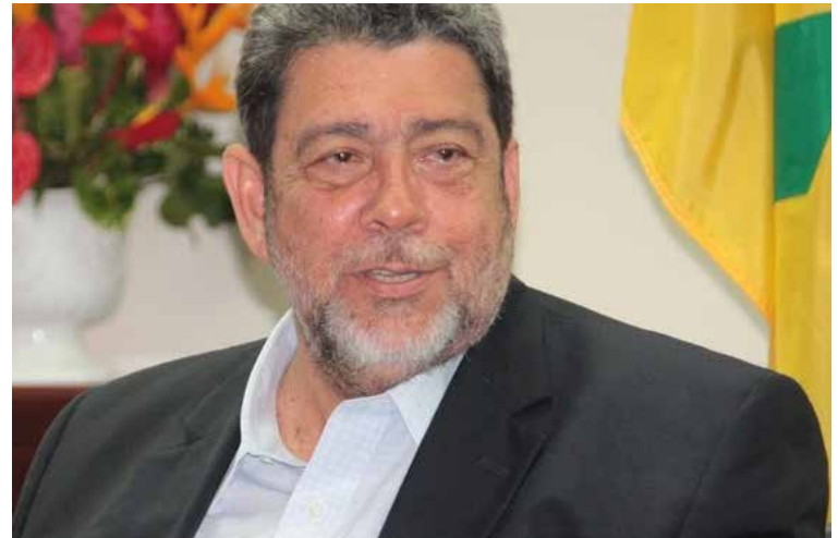
Prime Minister Dr. Ralph Gonsalves

Mexico is also urging the arms industry in the United States to implement