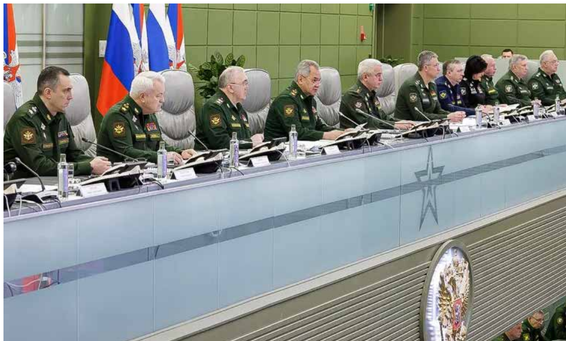
Russian Defence Minister Sergei Shoigu, centre, speaks during a meeting with high-level officers in Moscow

“We need to constantly analyse and systematise the experience of our groups’ actions in Ukraine and Syria, and on that basis to draw up training programmes for personnel and plans for the supply of military equip-