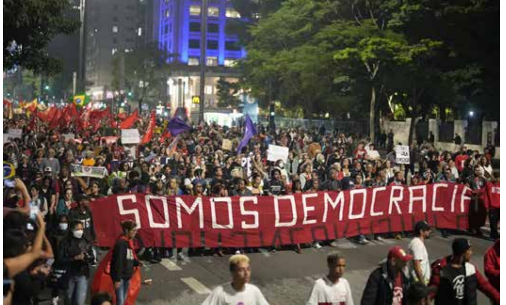
Demonstrators march holding a banner that reads in Portuguese “We are Democracy” during a protest calling for protection of the nation’s democracy in Sao Paulo, Brazil, Monday, Jan. 9, 2023, a day after supporters of former President Jair Bolsonaro stormed government buildings in the capital.

Brazilian police on Monday had already rounded up roughly 1,500 rioters,