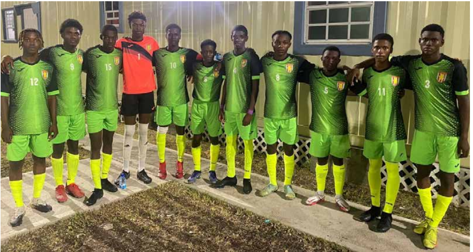
The Villa Lions team just before their opening 2022/23 premier league encounter against Swetes FC at the ABFA's Technical Centre at Paynters on Monday, 28th November, 2022.

Villa Lions and Tryum are the latest teams to make a winning start to their campaigns in this season's Antigua and Barbuda Football Association's (ABFA) Premier Division League.