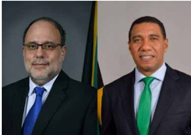
Prime Minister Andrew Holness, right, and Opposition Leader Mark Golding.

The prime minister told supporters that the SOEs have been achieving the purpose, noting that there