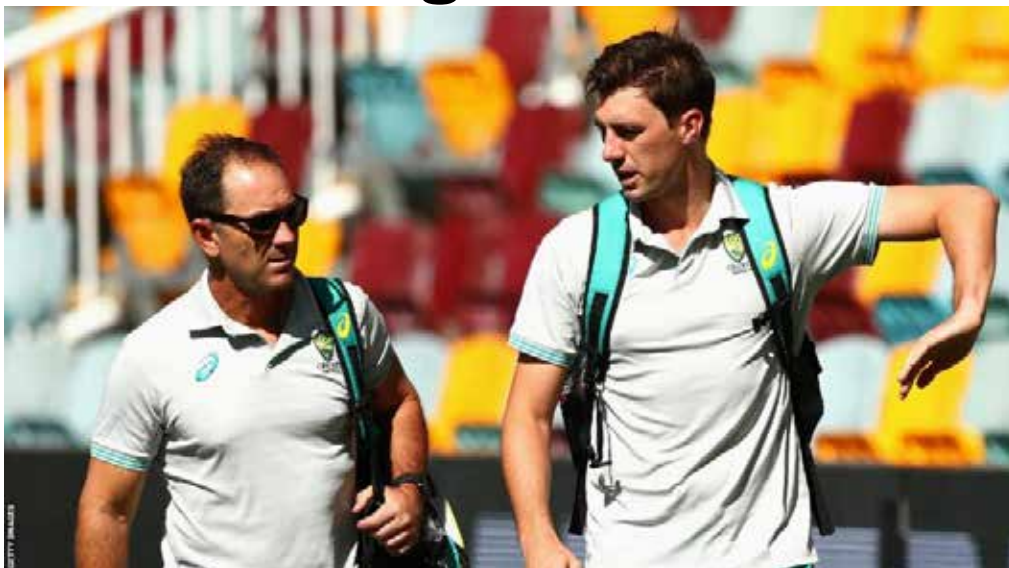
Pat Cummins became Australia captain in November 2021, working alongside Justin Langer until he resigned as head coach in February

Langer moved to distance himself from the furore created by his "cow-