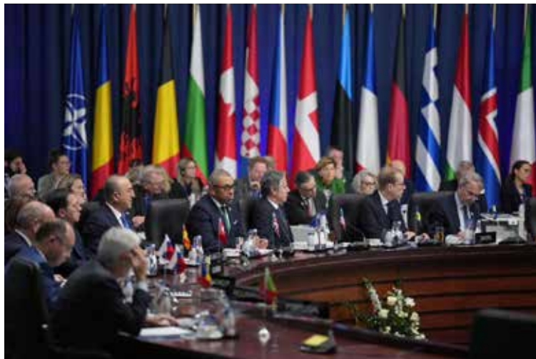
United States Secretary of State Antony Blinken attends the first day of the meeting of NATO Ministers of Foreign Affairs, in Bucharest, Romania, Tuesday, Nov. 29, 2022.

veto" on countries joining, Stoltenberg said. "We stand by that, too, on membership for Ukraine."