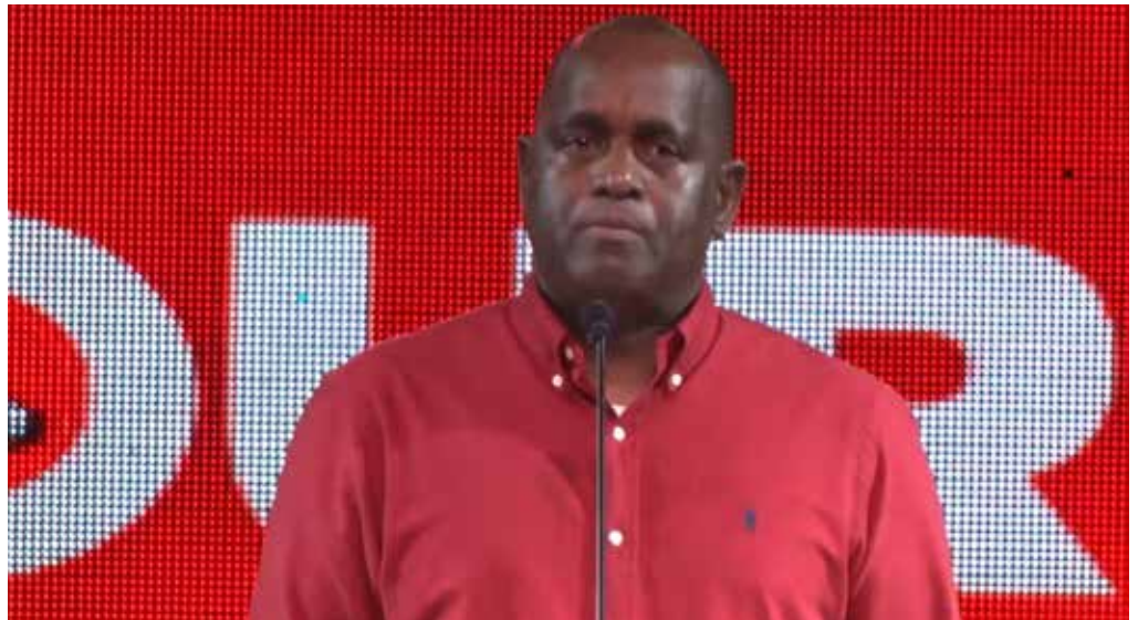
Prime Minister Roosevelt Skerrit