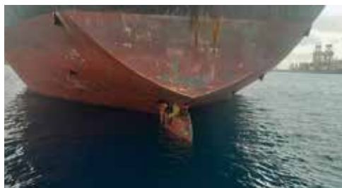
Three people were found perched on the rudder blade on an oil tanker in Spain

A 14 year-old boy who also travelled from Lagos to Gran Canaria in 2020 told the paper El Pais that he spent the entire 15 day journey on the rudder of a huge fuel tanker. He was