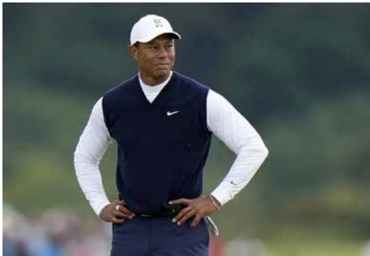
Tiger Woods, of the United States, stands on the 11th hole during the first round of the British Open golf championship on the Old Course at St. Andrews, Scotland, on July 14, 2022. Woods was out before he was officially back, withdrawing Monday, Nov. 28, 2022, from his Hero World Challenge with plantar fasciitis in his right foot.

Phil Mickelson was among 10 players who filed an antitrust lawsuit against the PGA Tour in August, a lawsuit since taken over by LIV Golf. Bryson DeChambeau, Peter Uihlein and Matt