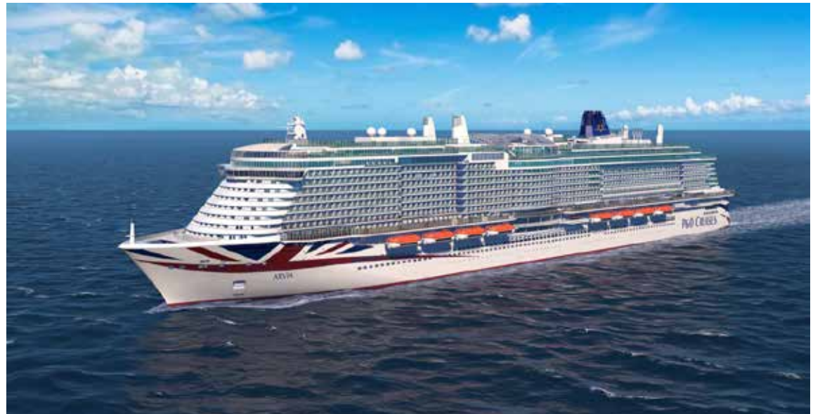
P&O cruise lines' Arvia

"This means the cruise will start and end in Antigua. Passengers will have to come in by air so there is an obvious benefit already. Taxi operators will make money by transporting them from the airport to the quay.