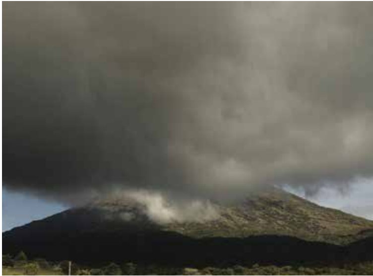
Clouds and gases surround the Chaparrastique volcano in San Jorge, El Salvador, Monday, Nov. 28, 2022. Authorities in El Salvador are warning residents near the Chaparrastique in the eastern part of the country to be alert as the volcano has shown signs of increased activity.

Authorities in El Salvador on Monday warned residents near the Chaparrastique volcano in the country's east to be alert after it began to erupt.