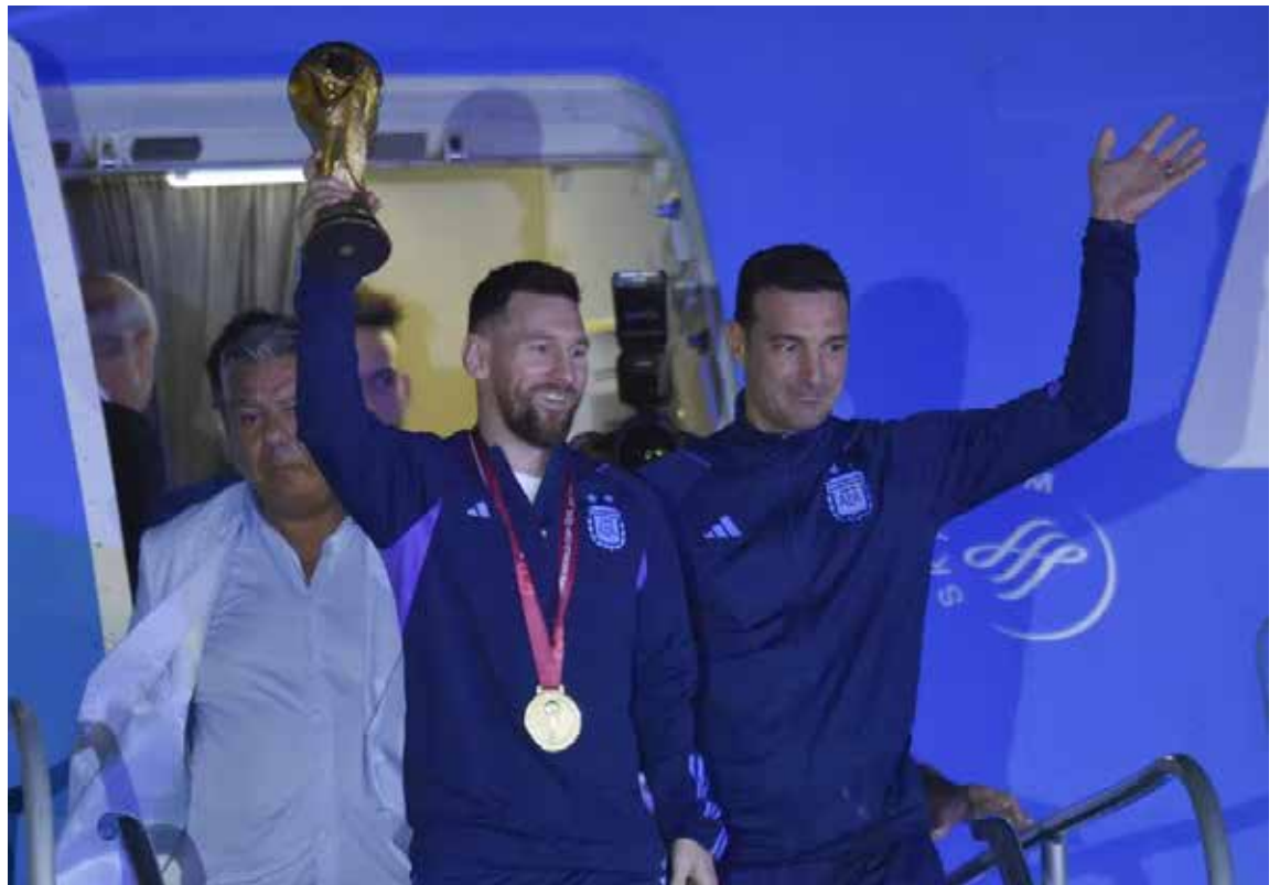
Argentina's Lionel Messi holds the FIFA World Cup trophy as he deplanes, with coach Lionel Scaloni, in Buenos Aires, Argentina, Tuesday, Dec. 20, 2022.

The players were welcomed by rock band La Mosca singing "Muchachos," a song that was written by a fan to the tune of an old song by the band and became a popular unofficial anthem for Argentine fans