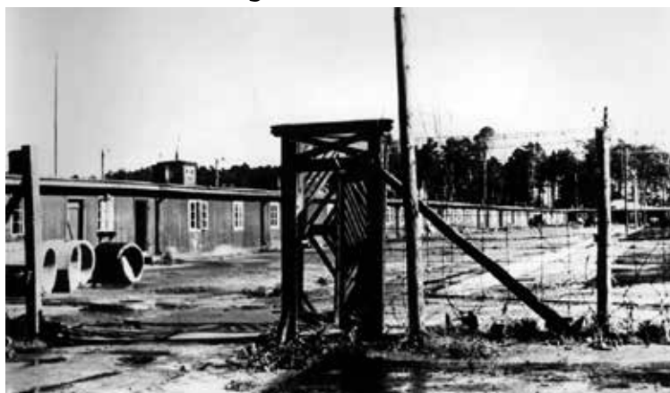
This undated photo from 1945 shows the Nazi concentration camp Stutthof in Sztutowo, Poland. A 97-year-old woman charged with being an accessory to murder for her role as secretary to the SS commander of the Stutthof concentration camp during World War II.

The verdict and sentence were in line with prosecu-