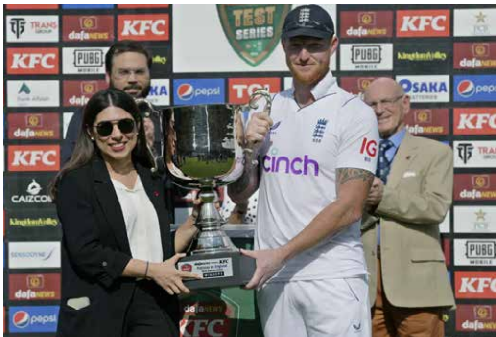
England's skipper Ben Stokes, second right, receives trophy from a representative of KFC after winning the third test and series against Pakistan, in Karachi, Pakistan, Tuesday, Dec. 20, 2022.

"We're definitely comfortable with nine out of 10," McCullum told the Pakistan Cricket Board's digital podcast. "The side is walking in his sort of style now and playing the way that he likes the game to be played, it's been