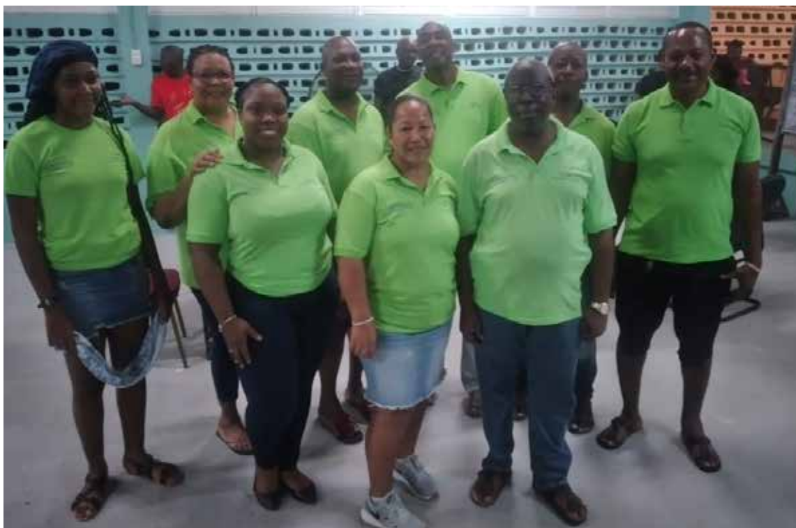
The Dominatrixx team is currently leading the Antigua and Barbuda National Domino Association's Accumulated Three-Hand Competition after the third week of matches at its headquarters in Ottos on Friday, 16th December, 2022.

Double Six boosted their tally by scoring 80 points to finish second in last Friday's fourth match