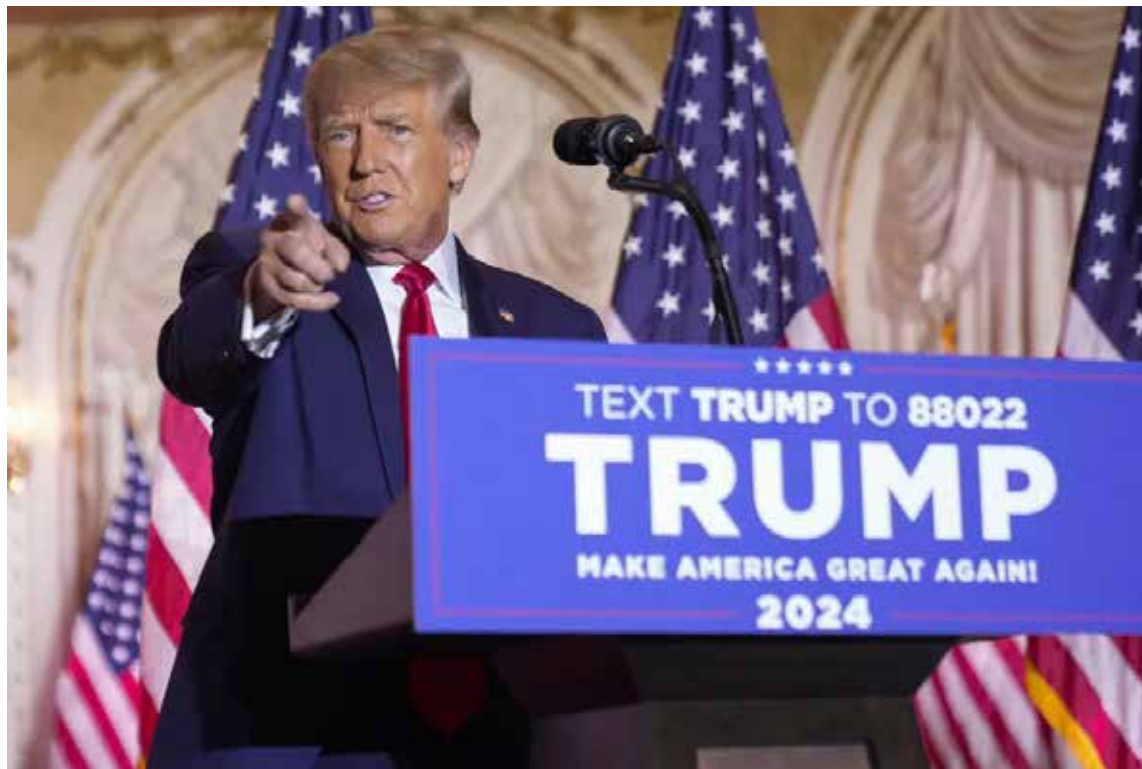
Former President Donald Trump gestures as he announces he is running for president for the third time as he speaks at Mar-a-Lago in Palm Beach, Nov. 15, 2022. Trump is facing a new legal threat, but there is little sign that the Republican Party is defending the former president with the same intensity and urgency that defined his previous legal clashes.

It's a marked change for a party that has been defined, above all, by its