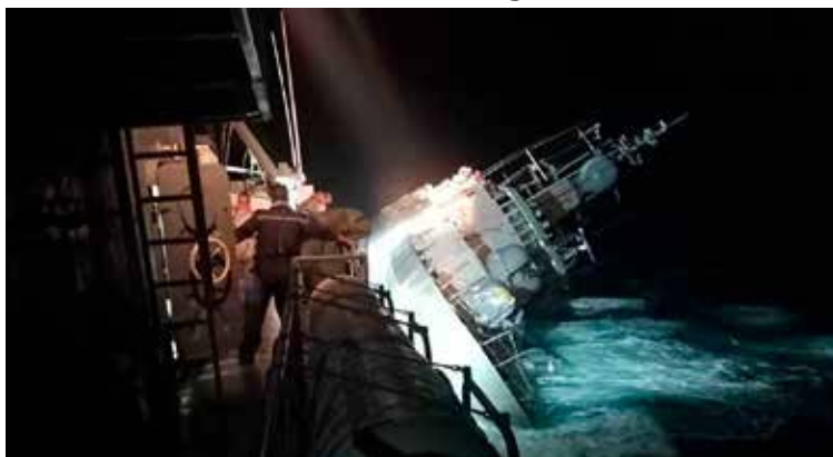
In this photo provided by the Royal Thai Navy, the HTMS Sukhothai corvette warship lists off the coast of Prachuap Khiri Khan province, Thailand, Sunday, Dec. 18, 2022. The Thai navy ship sank in the Gulf of Thailand and ships and helicopters were working Monday to rescue sailors from the water.