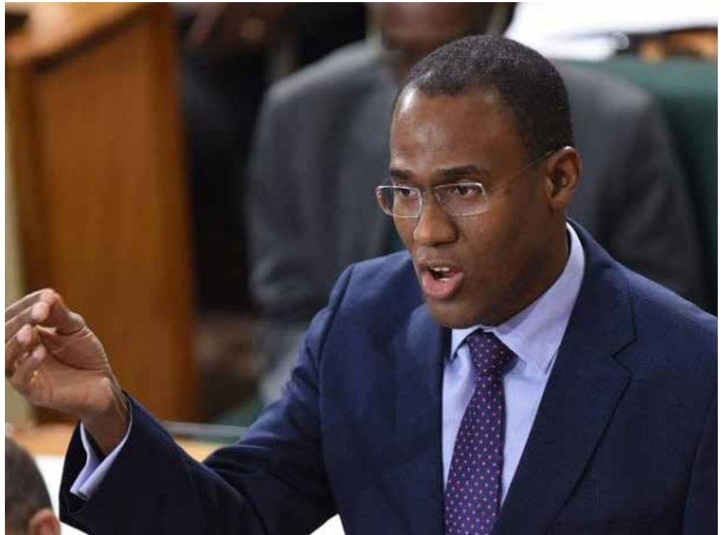
Minister of Finance and the Public Service Dr. Nigel Clarke

Consequently, he said, the administration has instituted a natural disaster strategy, capitalised a national disaster fund, and launched the first