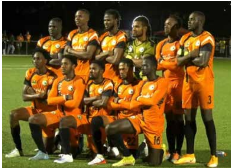
Jennings Grenades returned to their winning form in the Antigua and Barbuda Football Association's Premier Division at the ABFA's Technical Center at Paynters on Saturday, 17th December.

It was Grenades' third win in four matches. After winning their first two encounters, Grenades con-