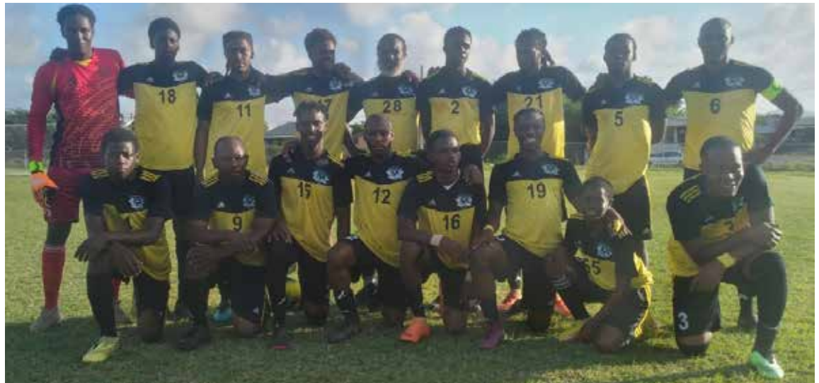
The Garden Stars football squad just before they face Fort Road in their ABFA's First Division encounter at the Fort Road playing field on Thursday, 15th December.

Garden Stars were awarded a penalty after Cornwall was fouled by a