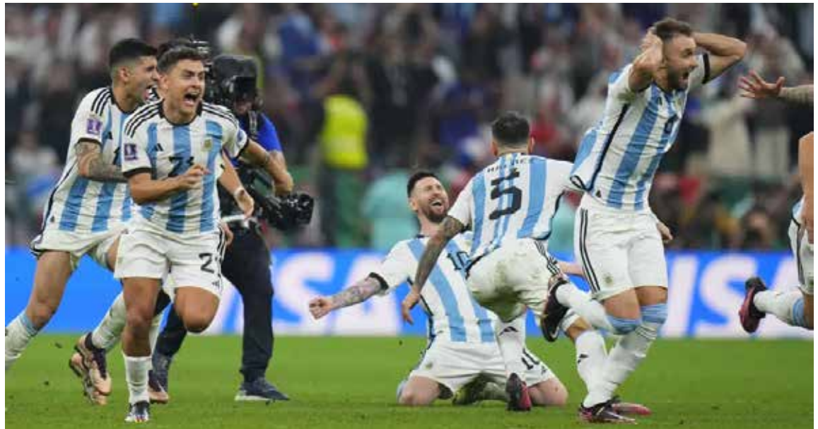
Argentinian players celebrate after winning the penalty shootout during the World Cup final soccer match between Argentina and France at the Lusail Stadium in Lusail, Qatar, Sunday, Dec. 18, 2022.

"Let's go, Argentina!" Messi roared into a microphone on the field in the post-match celebrations after playing in a record 26th