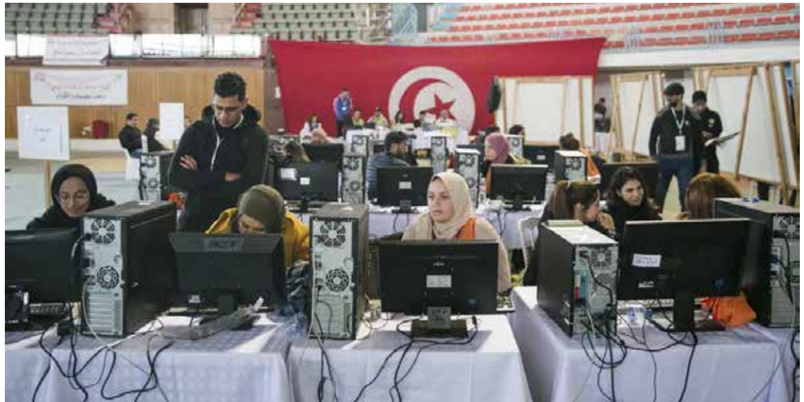
Members of the Independent Higher Authority for Elections count the votes one day after the parliamentary elections in Tunis, Tunisia, Sunday, Dec. 18, 2022.

According to provisional figures announced by the president of the electoral