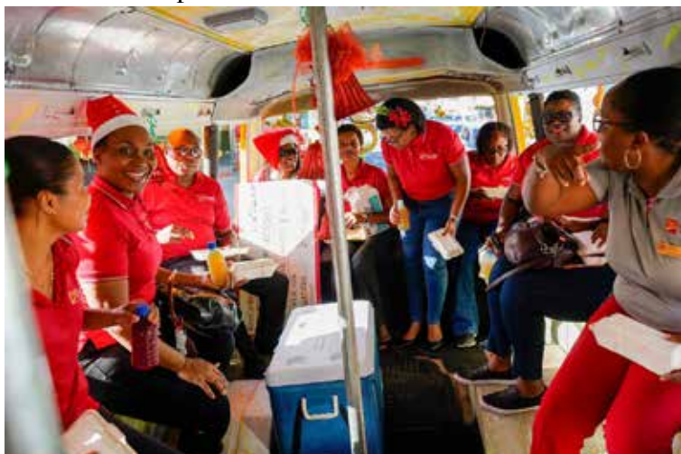
Staff on the Christmas Caravan