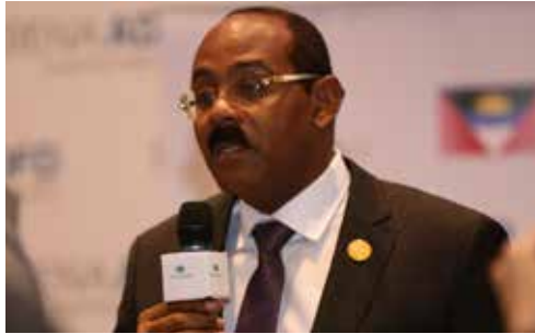
Prime Minister Gaston Browne SIS) of which Prime Minister Browne is a founder and Co-Chair.

The request for an Advisory Opinion was submitted by the Commission of Small Island States on Climate Change and International Law (CO-