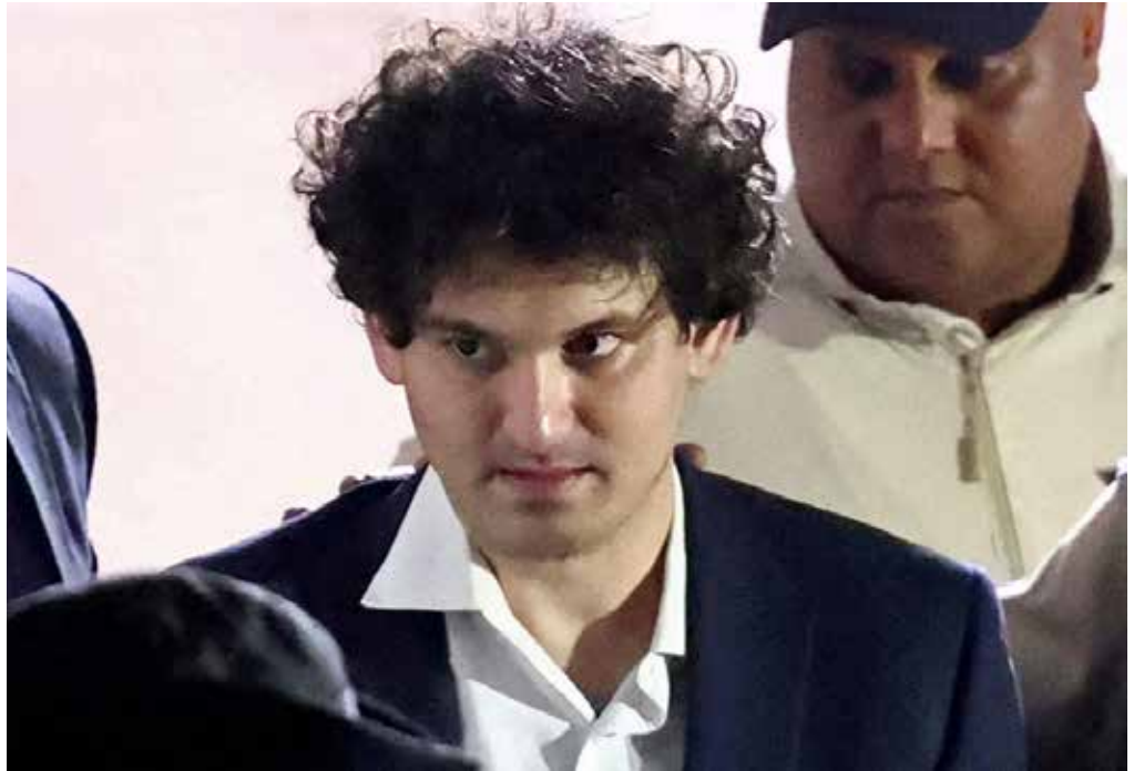
Sam Bankman-Fried, who founded and led FTX until a liquidity crunch forced the cryptocurrency exchange to declare bankruptcy, is escorted out of the Magistrate Court building after his arrest in Nassau, Bahamas December 13, 2022.

"The missing money gives prosecutors strong arguments that he is a