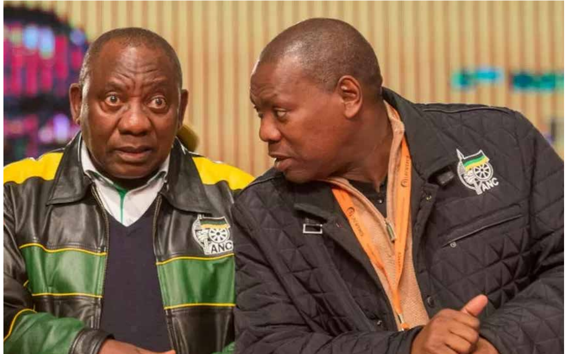
Ramaphosa (L) was seen as favourite ahead of Mkhize (R)

An independent report commissioned by the speaker of parliament said Mr Ramaphosa may have