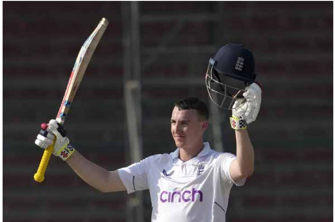
England's Harry Brook celebrates after scoring a century during the second day of the third test cricket match between England and Pakistan, in Karachi, Pakistan, Sunday, Dec. 18, 2022.

Abrar had grabbed an 11-wicket haul in his debut