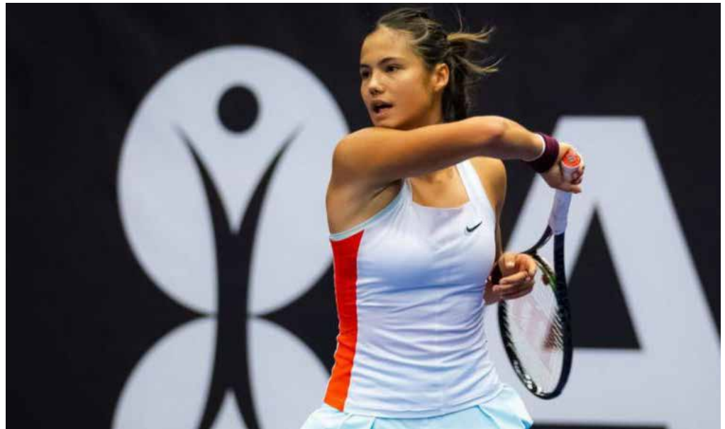
Emma Raducanu lost 5-7 6-3 (10-8) in an exhibition match with Ons Jabeur on her injury return

hard, try to get back on court as much as possible but I could overdo it if I didn't really think it through because I want to be back on court so much," the Briton added.