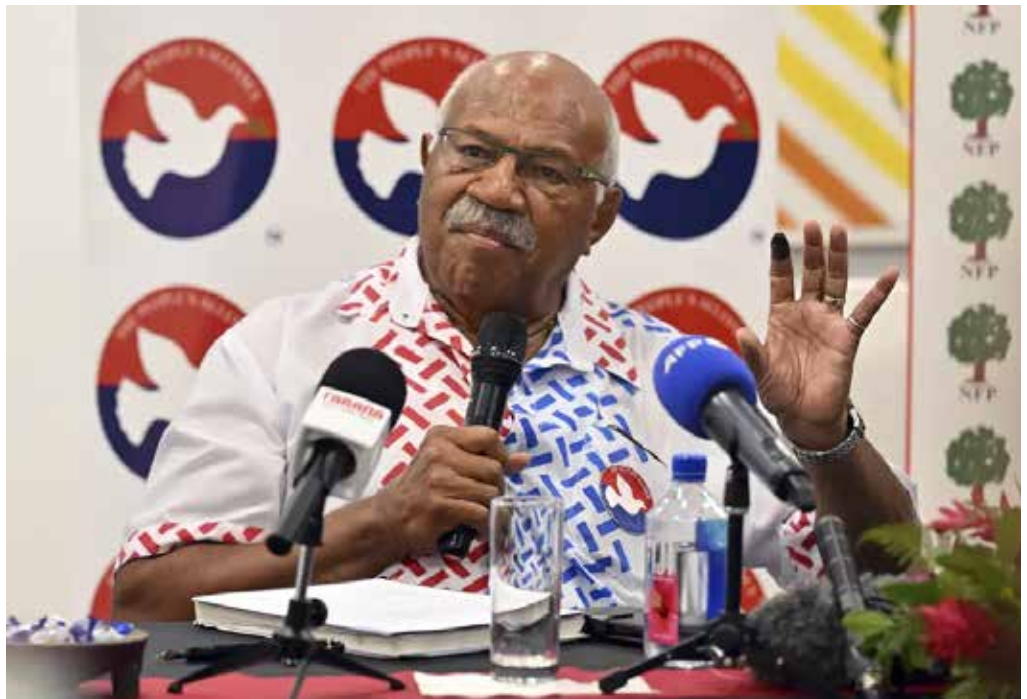
People's Alliance Party leader Sitiveni Rabuka gestures during a press conference while counting resumes after the Fijian election in Suva, Fiji, Saturday, Dec. 17, 2022. Vote counting finished in Fiji's general election Sunday, Dec. 18, 2022 with Rabuka, who led a coup back in 1987 and later served as an elected prime minister in the 1990s, emerged as the main challenger to Prime Minister Frank Bainimarama, who has held power for the past 16 years.

But an international group that monitored the election said Friday it did not observe any voting irregularities and the process was transparent