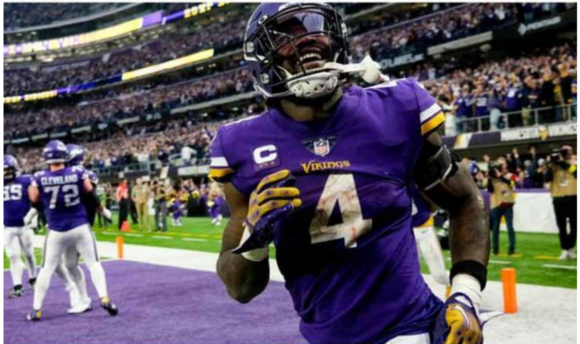
Vikings running back Dalvin Cook had 95 rushing yards, 95 receiving yards and a touchdown in his team's spectacular comeback

Cousins revealed the team believed they could