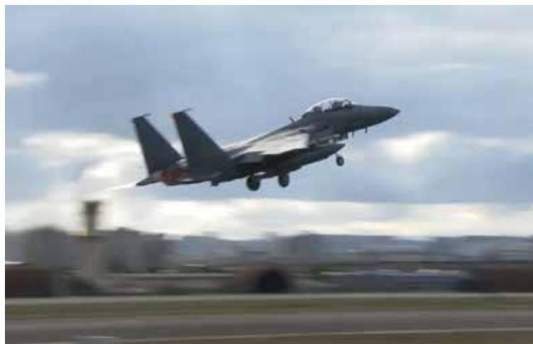
In this image taken from video, South Korean Air Force's F15K fighter jets prepare to take off Tuesday, Oct. 4, 2022, in an undisclosed location in South Korea. South Korea says North Korea flew 12 warplanes near their mutual border on Thursday, Oct. 6, 2022, prompting South Korea to scramble 30 military planes in response.

Earlier Thursday, North Korea launched two short-range ballistic missiles to-