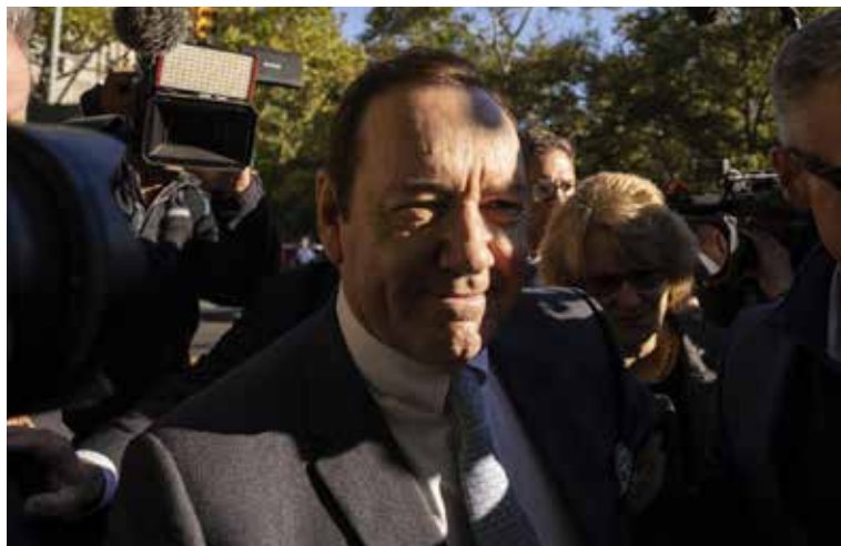
Actor Kevin Spacey arrives at court for the civil lawsuit trial, Thursday, Oct 6, 2022, in New York.

In interviews and the lawsuit, he has said a drunk, swaying Spacey swept him up in his arms, like a groom carrying a bride, then laid him on a bed and climbed