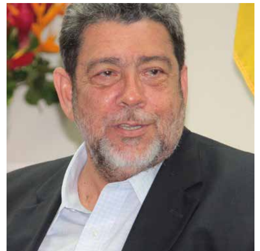
Prime Minister of St. Vincent and the Grenadines, Dr. Ralph Gonsalves.

people in Venezuela who were briefed on the matter had spoken on the condition of anonymity. The news agency said that the Americans included five oil executives held for nearly five years and that the exchange came after months of back-channel diplomacy by senior U.S. officials — secretive talks with a major oil producer that took on greater urgency after sanctions on Russia put pressure on global energy prices.