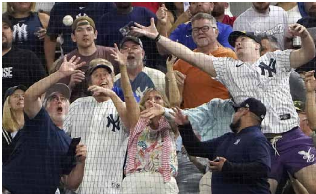
Fans reach for a foul ball by New York Yankees' Aaron Judge during the second inning in the second baseball game of a doubleheader against the Texas Rangers in Arlington, Texas, Tuesday, Oct. 4, 2022.

about it," he said. The record price for a home run ball is $3 million, paid for Mark McGwire's record 70th from the 1998 season.