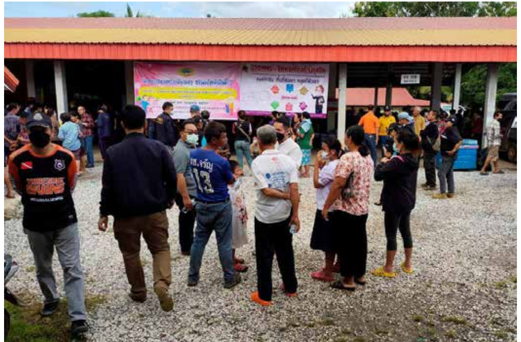
People gather outside of a daycare centre's scene of a mass shooting in the town of Uthai Sawan, 500 km (310 miles) northeast of Bangkok in the province of Nong Bua Lamphu, Thailand October 6, 2022.

"It's really shocking. We were very scared and running to hide once we knew it was shooting. So many children got killed, I've never seen