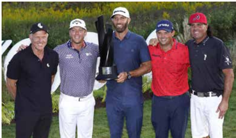
LIV Golf CEO Greg Norman, left, stands with the 4 Aces GC team, from left, Talor Gooch, Captain Dustin Johnson, Patrick Reed and Pat Perez, after winning the team's fourth straight tournament at the LIV Golf Invitational-Chicago tournament Sunday, Sept. 18, 2022, in Sugar Hill, Ill.

The MENA Tour now is aligned with the Asian Development Tour, a step below the Asian Tour. LIV Golf already has invested $300 million in the Asian