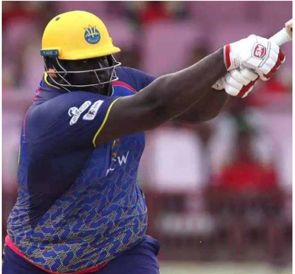
Antiguan and Leeward Islands all-rounder Rahkeem Cornwall, who plays for the West Indies in international cricket, scored an unbeaten double century for Atlanta Fire in the Atlanta Open T20 League on Wednesday, 5th October, 2022.