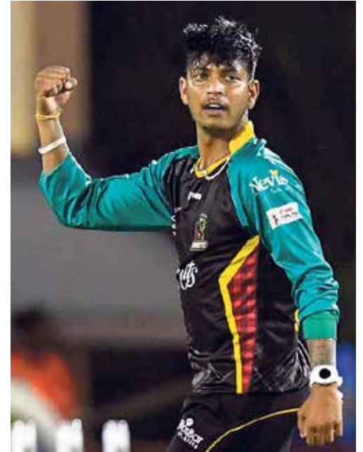
Lamichhane has played 74 times for Nepal in Twenty20 and one-day international cricket. He has played for both the St. Kitts Nevis Patriots and Jamaica Tallawahs in the Hero CPL franchise.

He arrived in Kathmandu on a flight from Doha on Thursday.