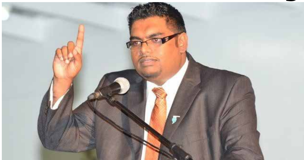
Guyana's president, Dr. Irfaan Ali

The government had said previously it would support a privately developed oil refinery in Guyana but had been receiving numerous proposals for small refineries, including six proposals for a refinery in Berbice.