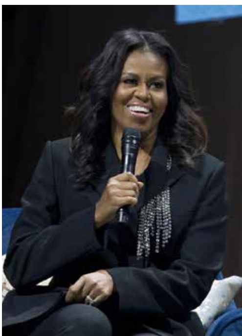
Former first lady Michelle Obama speaks to the crowd as she presents her anticipated memoir “Becoming” during her book tour stop in Washington, on Nov. 17, 2018.