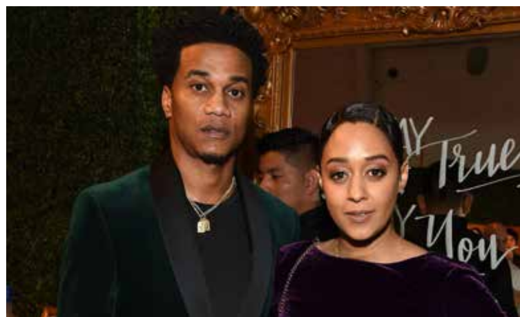
Cory Hardrict and Tia Mowry in 2020

“Sister” costar Tamera Mowry-Housley had words of support for her during an appearance on “Today,” saying “the Mowrys have her back.”