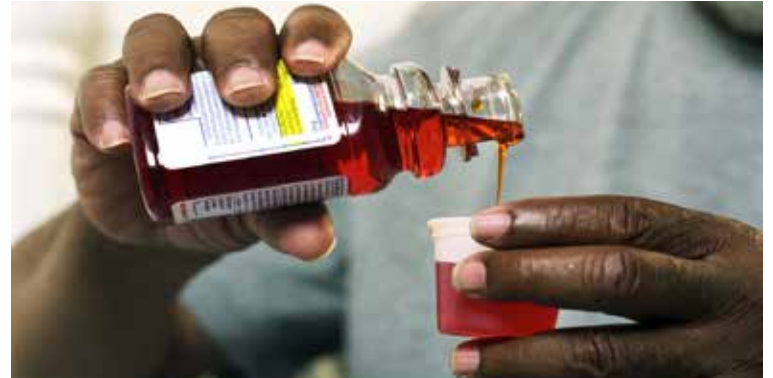
Gambia's Medical Research Council has also issued an alarm.

search Council has also issued an alarm. "Over the last week, we admitted a child with this condition (acute kidney injury) ... and she has unfortunately died. We were able to confirm that she had taken one of the drugs that is suspected to be causing this, prior to her arrival at our clinic. It had been bought at a pharmacy within The Gambia," the council said in a statement. "The drug has been identified as containing a significant amount of a toxin which damages kidneys irreversibly."