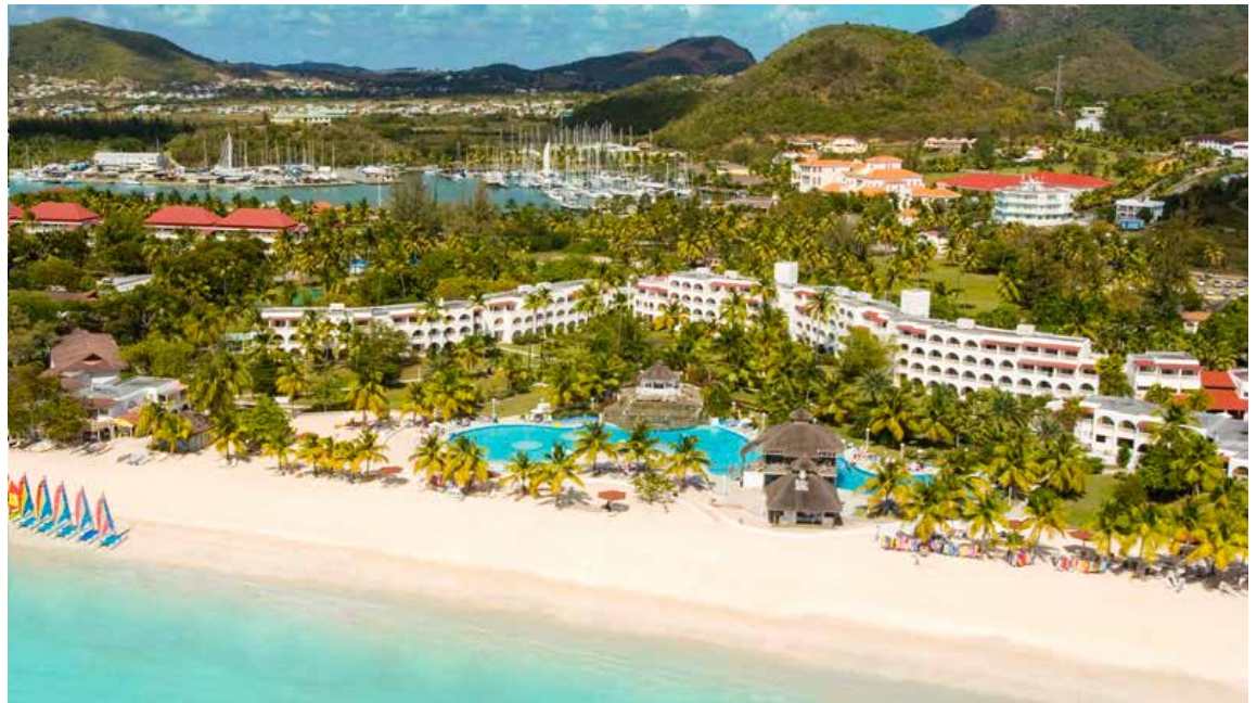
Jolly Beach hotel

"The object is to have several rooms rehabilitated for the winter season and to have the Elite Resorts manage those rooms. The management company will