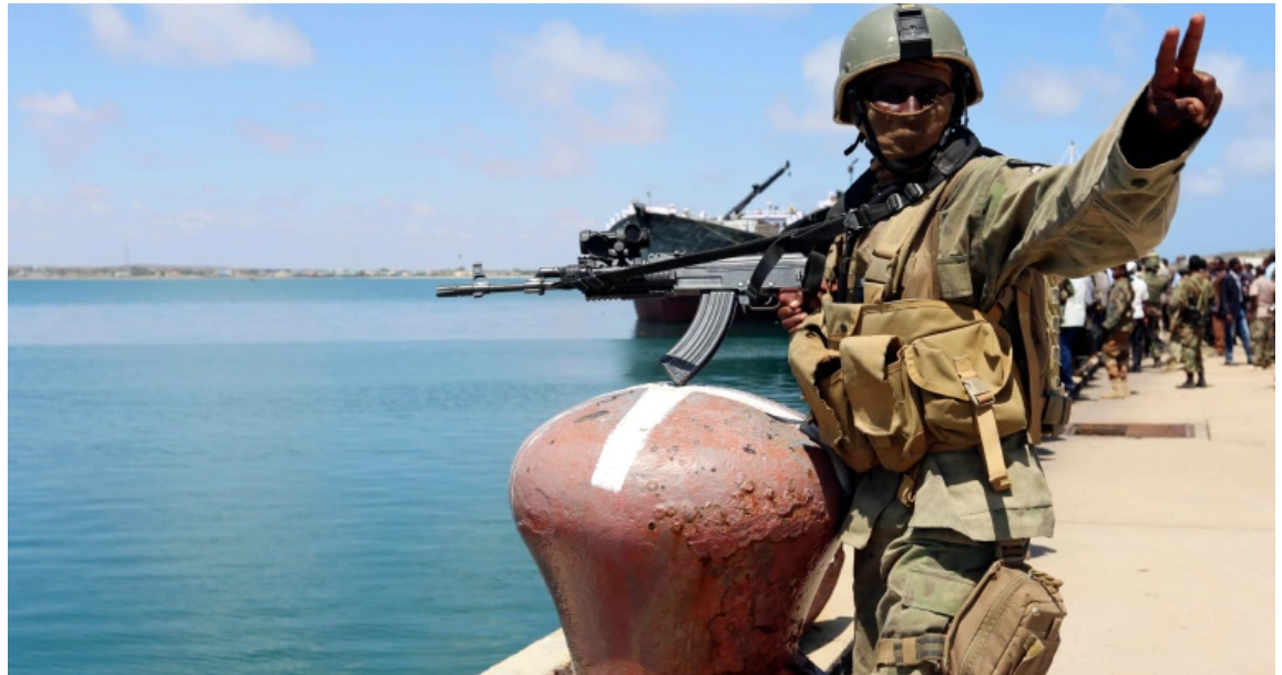
There was no immediate word on casualties

"The security forces have besieged the scene,"