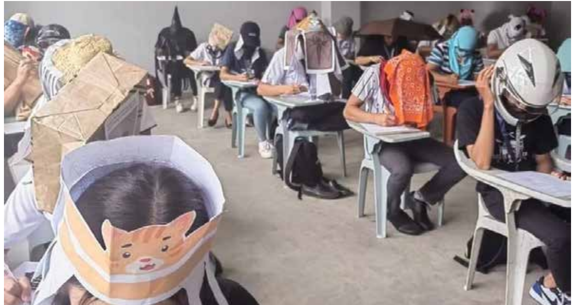
Students were asked to innovate headwear that would block their ability to see their peers' answer papers