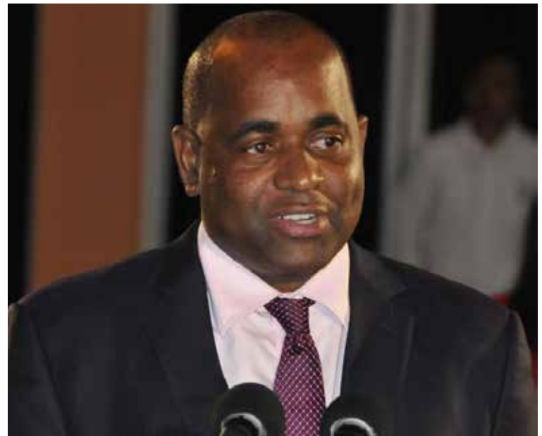
Prime Minister of Dominica, Roosevelt Skerit

world's major polluters are not taking sufficient action to halt global warming beyond 1.5 degrees Celsius, makes it imperative that we accelerate action and our own efforts towards building resilience."