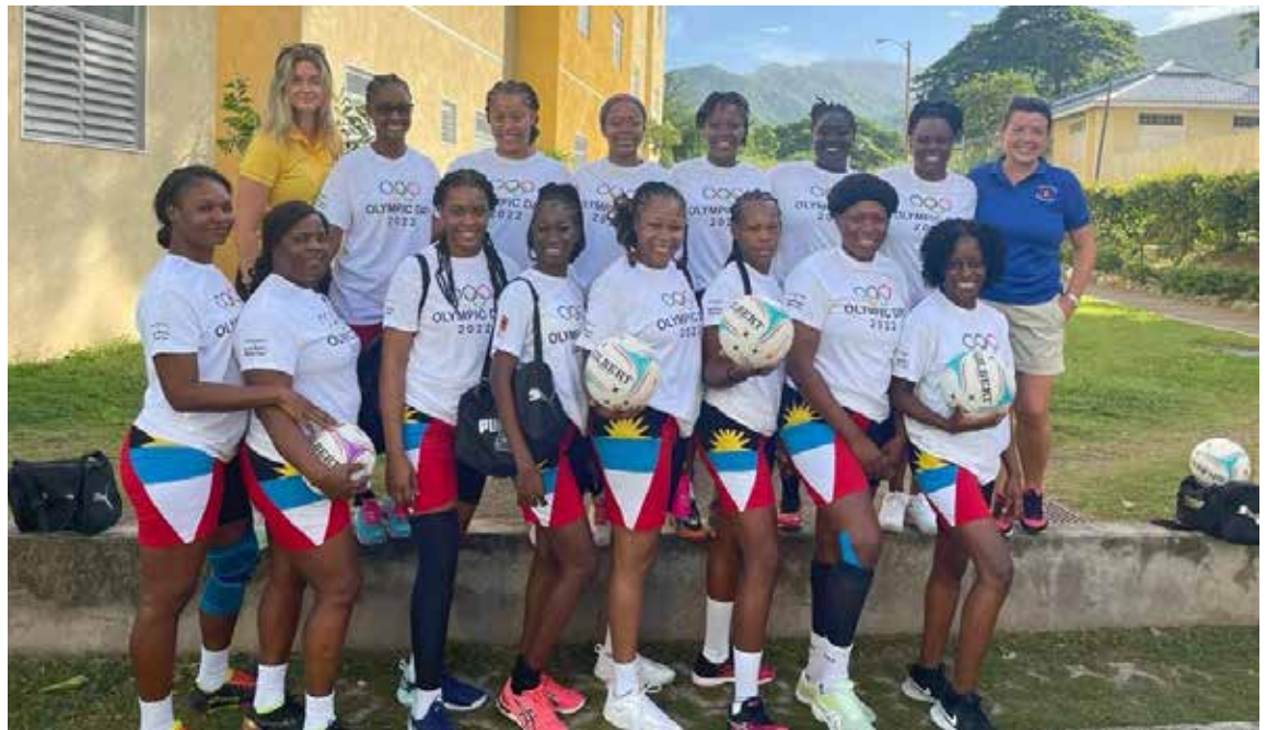
Antigua and Barbuda lost all eight matches at the Americas Netball Qualifier at the National Indoor Sports Centre in Kingston, Jamaica, from Sunday, 16th October, to Saturday, 22nd October, 2022. (File photo)

Saturday, hosts Jamaica Sunshine Girls inflicted a first defeat on Trinidad and Tobago, 69-47, leading 21-11, 38-23 and 57-37 at the end of the first three quarters.