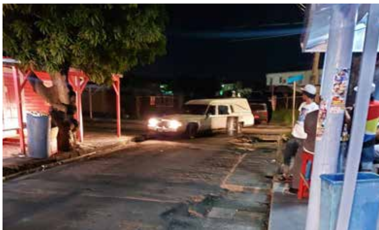
Residents looked on as the hearse arrived to remove the Jamaican woman's body