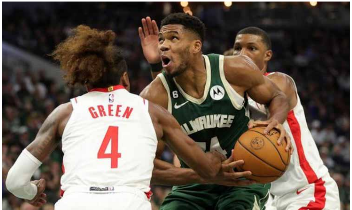
Giannis Antetokounmpo proved a constant threat for the Bucks against the Rockets

Antetokounmpo, who played less than 28 minutes in the game, also made 17 of his 21 shots from the field, including two out of