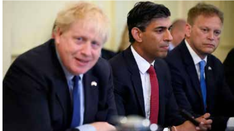
Rishi Sunak listens as Boris Johnson addresses his cabinet, Downing Street, London, June 7, 2022.

Mr Johnson said there was a "very good chance" he would have been suc-