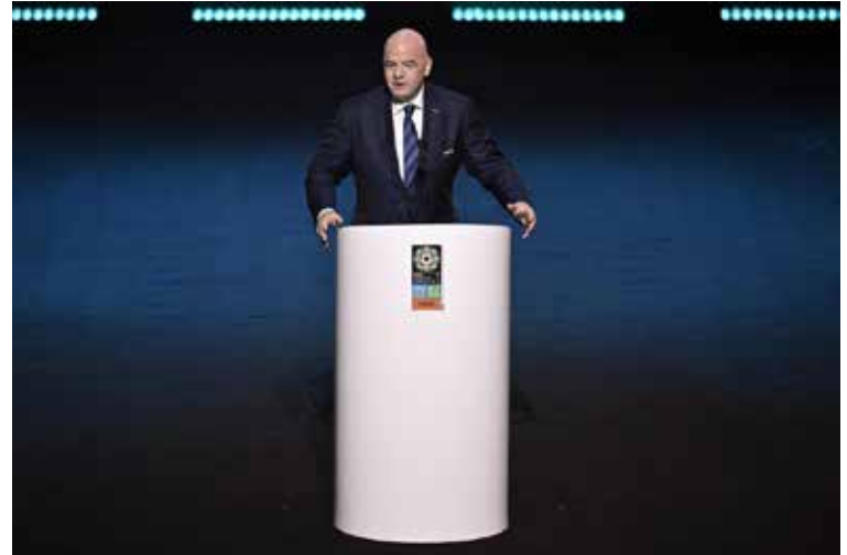
FIFA President Giovanni Infantino speaks during the FIFA Women's World Cup 2023 draw in Auckland, New Zealand, Saturday, 22, 2022.

The 32 teams at the men's World Cup in Qatar will share $440 million in prize money, while a prize fund of $60 million was proposed for the first 32-