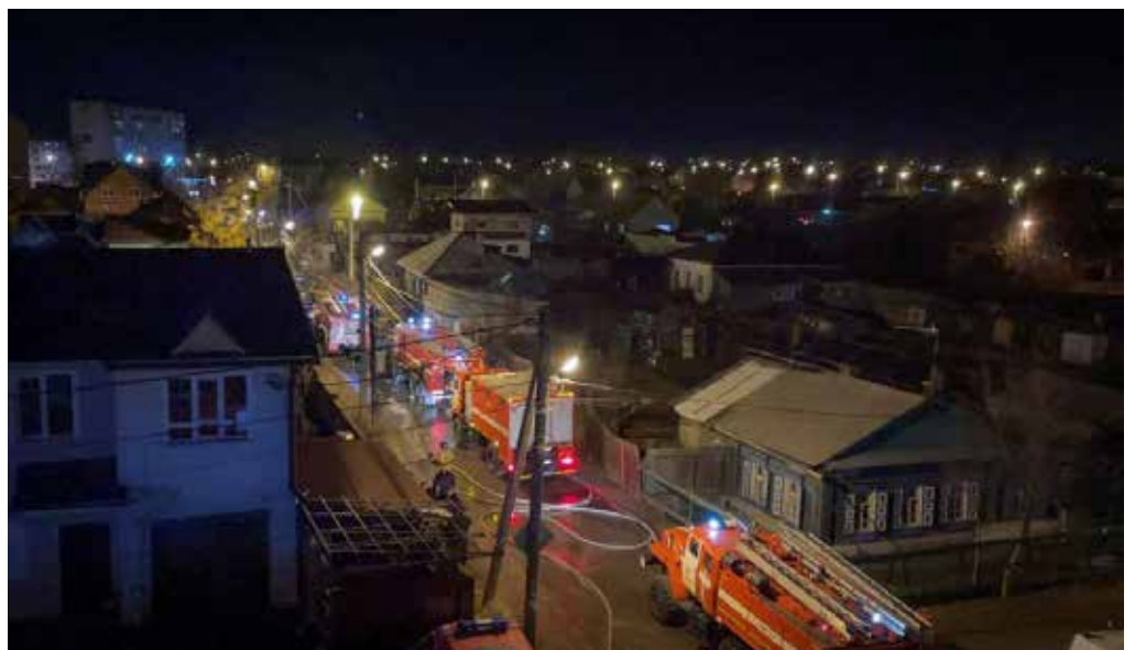
Firefighters work at the site of a plane crash into a residential building in the city of Irkutsk, Russia, October 23, 2022, in this still picture taken from a video.

Authorities said the initial investigation of that disaster - in which the