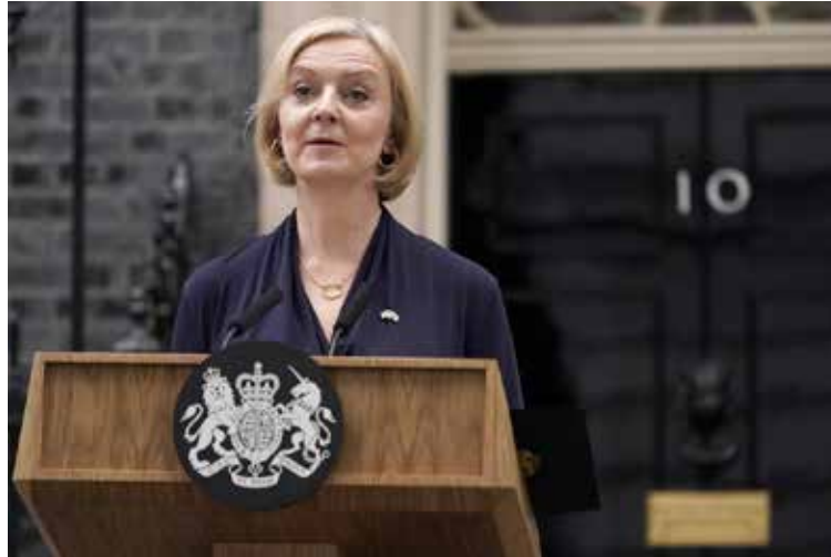
Britain's Prime Minister Liz Truss addresses the media in Downing Street in London, Thursday, Oct. 20, 2022. Truss says she resigns as leader of UK Conservative Party.

While Mr Hunt - who was appointed chancellor last week - will not challenge for the leadership, none of