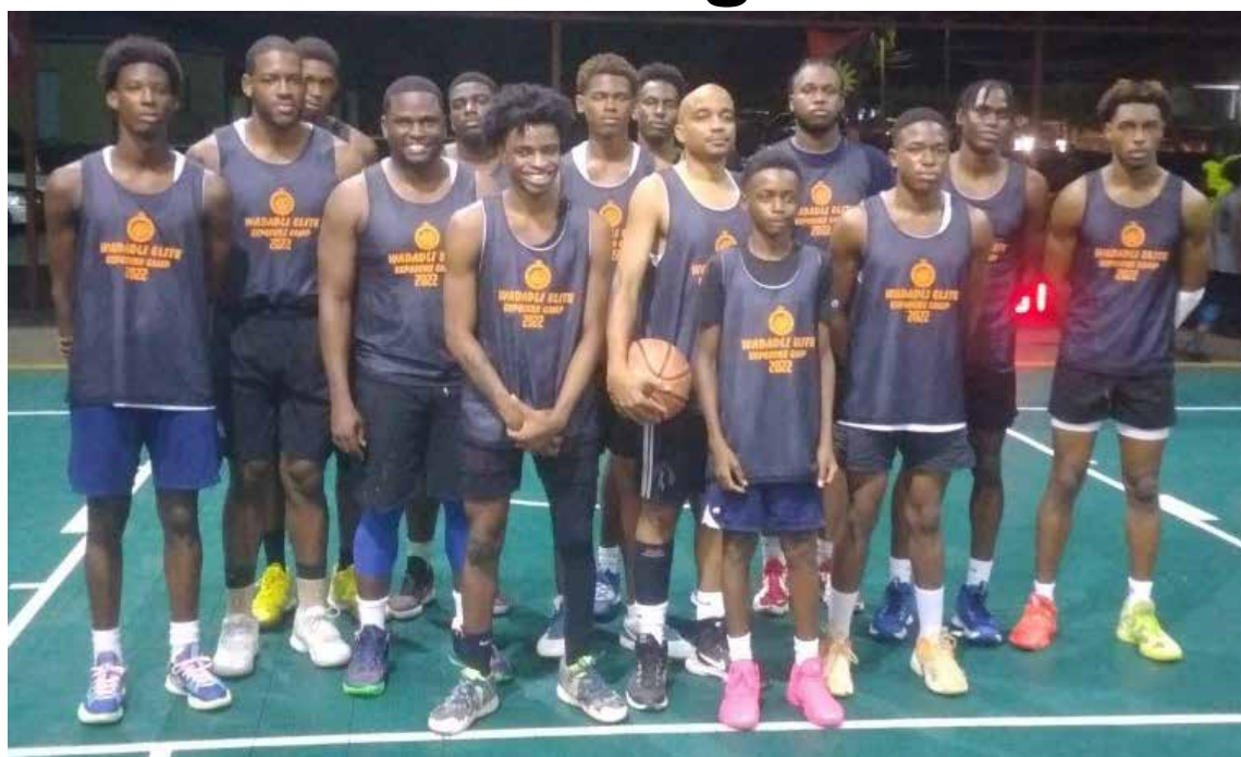
Eye Mobile Antigua Vision Care basketball team. (File photo)

Second seed Anjo Wholesale also eased into