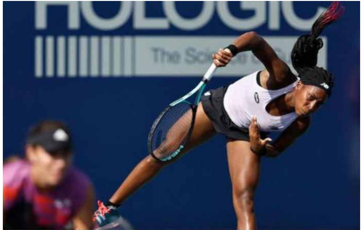
Coco Gauff and Jessica Pegula will play both singles and doubles at the WTA Finals

"Honestly I didn't think about it until I realised how close I was and I think I went maybe a little bit nervous in