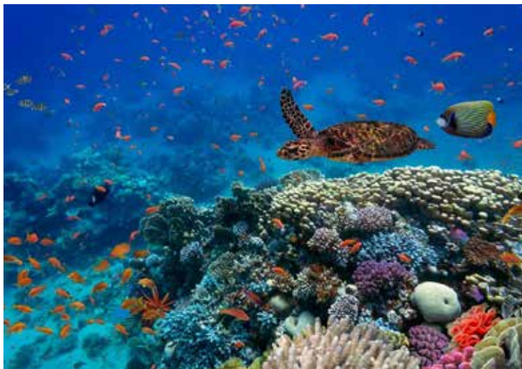
Antigua and Barbuda are an idyllic spot for anyone interested in experiencing abundant turtle life.

Antigua and Barbuda is a turtle's playground, so when visiting the islands, there are many exciting excursions that will bring you up close and personal with the majestic creatures. Snorkelling and diving are among the most popular ways to interact with