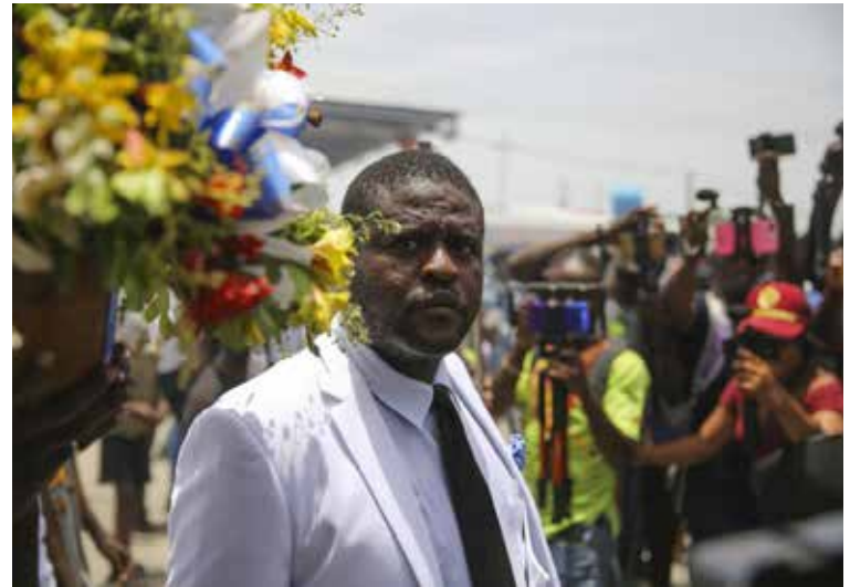
Jimmy Cherizier, alias Barbecue, a former police officer who heads a gang coalition known as "G9 Family and Allies," leads a march to demand justice for slain Haitian President Jovenel Moise in Lower Delmas, a district of Port-au-Prince, Haiti July 26, 2021. The United Nations Security Council is expected to vote Wednesday afternoon, Oct. 19, 2022, on a resolution that would demand an immediate end to violence and criminal activity in Haiti and impose sanctions on influential gang leader Cherizier.

Daily life in Haiti began to spin out of control last month just hours after prime minister Henry said fuel subsidies would be