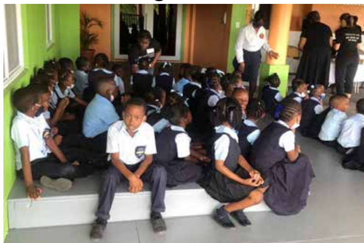
Students waiting to see the specialist at the St. Paul's Eye-Clinic

The programme has been extended to students who attend the neighbouring All Saints Secondary School and the Irene B. Williams School which is in Swetes.