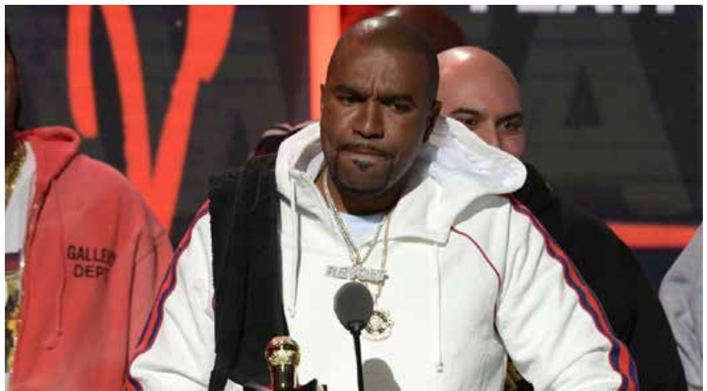
N.O.R.E. on September 30.

During his appearance, West made antisemitic comments and suggested George Floyd was killed by a fentanyl overdose, despite a medical examiner's testimony that fentanyl was not the direct cause of Floyd's death, only a contributing factor when he died after being knelt on by