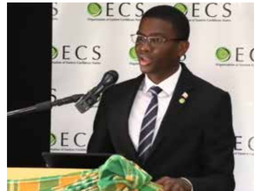
Grenada Prime Minister Dickon Mitchell addressing OECS leaders in Montserrat

Last weekend, Canada and the United States said in a joint statement