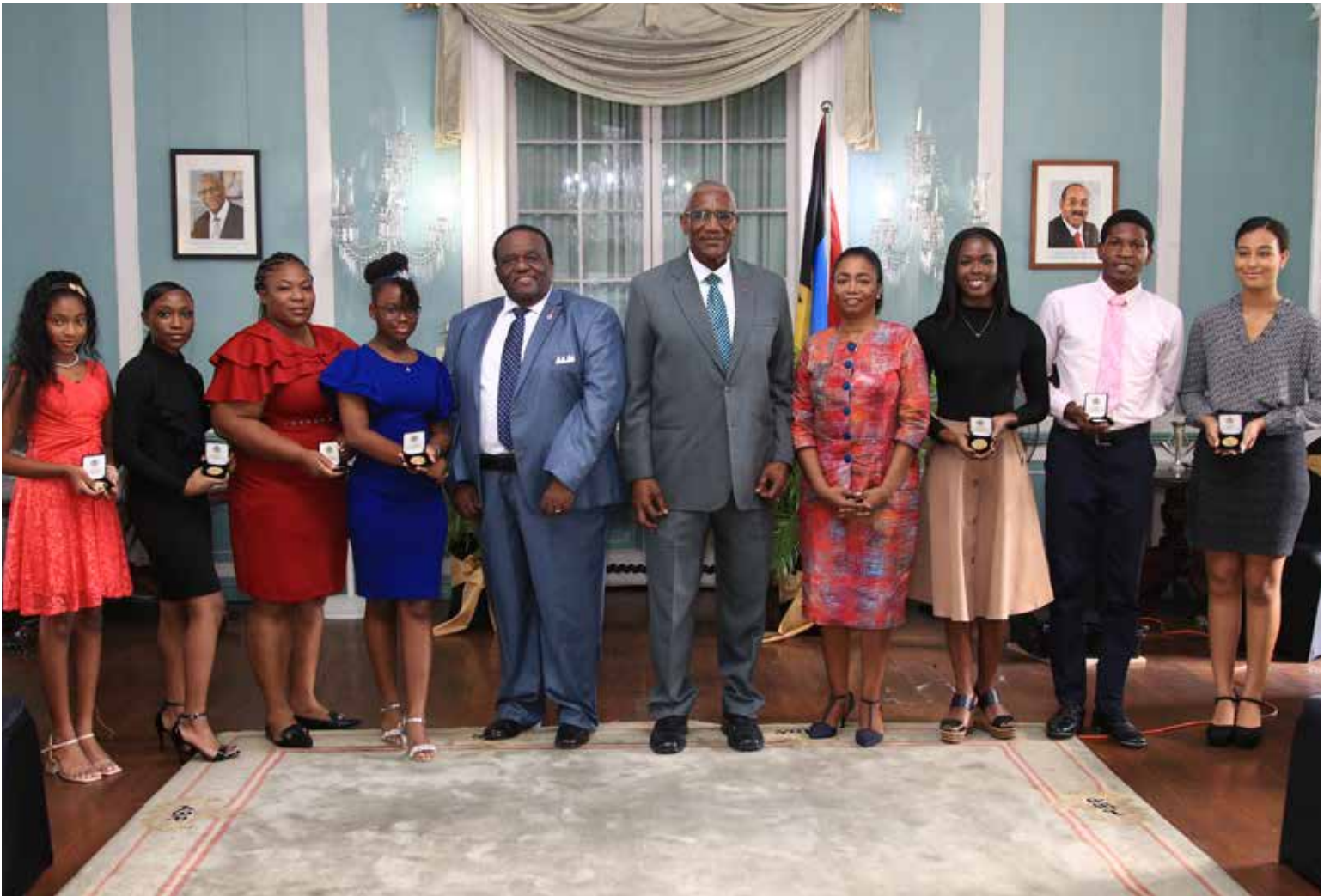
Their Excellencies Sir Rodney and Lady Williams and Acting Prime Minister Steadroy Benjamin are flanked by the National Academic Award recipients. Story on page 6.