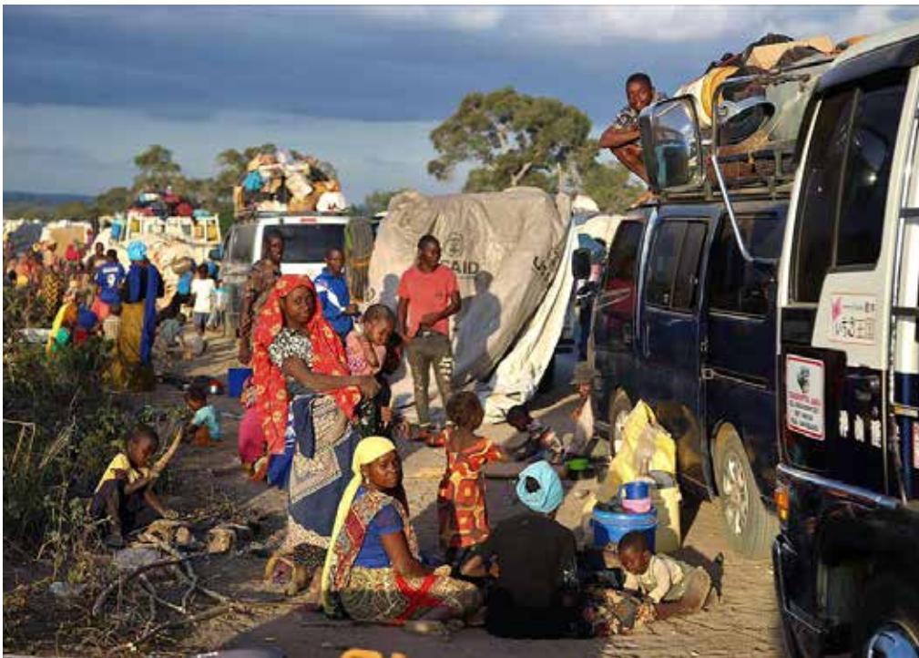
This undated photo provided on Thursday, Oct. 13, 2022 by Doctors Without Borders (MSF) shows people displaced by the conflict in Cabo Delgado Province Mozambique, next to a truck on the outskirts of Mueda, Mozambique, waiting to be transported to reach Palma, a coastal town that was attacked earlier this year and where some people have already gradually returned.

Mozambique's army and police forces, backed up by troops from Rwanda and support from a regional force from the Southern African Development Community, have succeeded in containing the extremist rebellion, officials say.