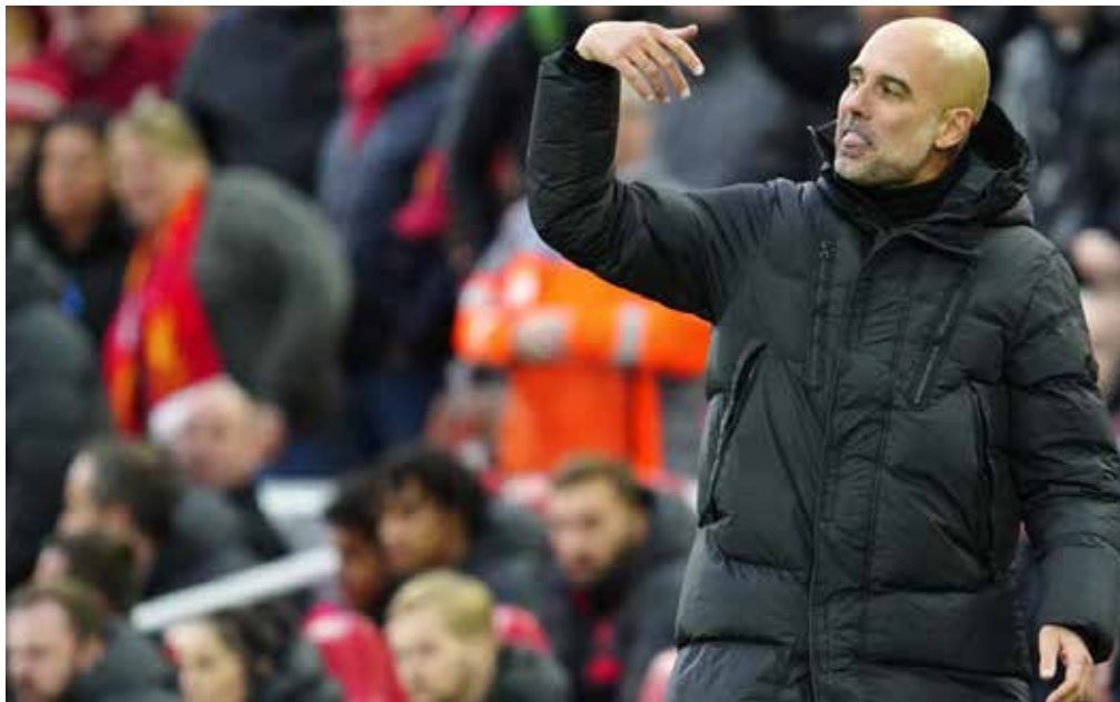
Manchester City's head coach Pep Guardiola reacts during the English Premier League soccer match between Liverpool and Manchester City at Anfield stadium in Liverpool, Sunday, Oct. 16, 2022.

from the home supporters, Guardiola said: "They shout, we shout more."