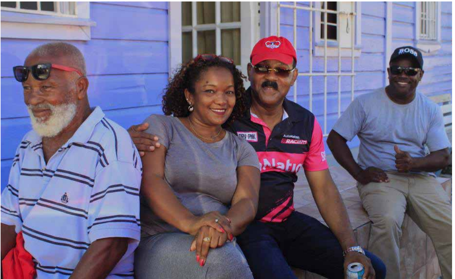
Parliamentary Representative for St. John's City West, Prime Minister Gaston Browne, second right, took to the streets on Saturday during his customary constituency walk through. PM Browne stopped at multiple small businesses in the community to show his support financially.