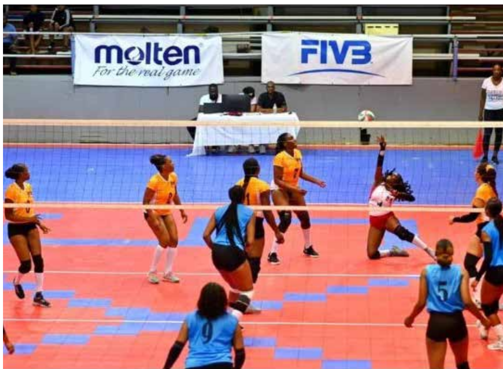
Antigua and Barbuda (Yellow jersey) competes against St. Lucia (Blue jersey) at the Eastern Caribbean Volleyball Association's Senior Women's Championship at the LB Scott Sports Auditorium in Phillipsburg, St. Maarten, on Friday, 14th October, 2022.

"I noticed that Antigua came out on a mission. They wanted to get to final, but we could not allow that. It took us a while to get going, pick up momentum and came out on top,"