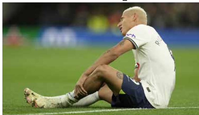
Tottenham's Richarlison sits down on the pitch during the English Premier League soccer match between Tottenham Hotspur and Everton at the Tottenham Hotspur Stadium in London, England, Saturday, Oct. 15, 2022.

"For sure against Manchester United he's out (on Wednesday)," Tottenham manager Antonio Conte