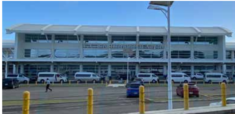
V. C. Bird International Airport stalled the first machine last week as part of the upgrade of equipment at the country’s lone international airport.

Francis also commended the team who successfully in-