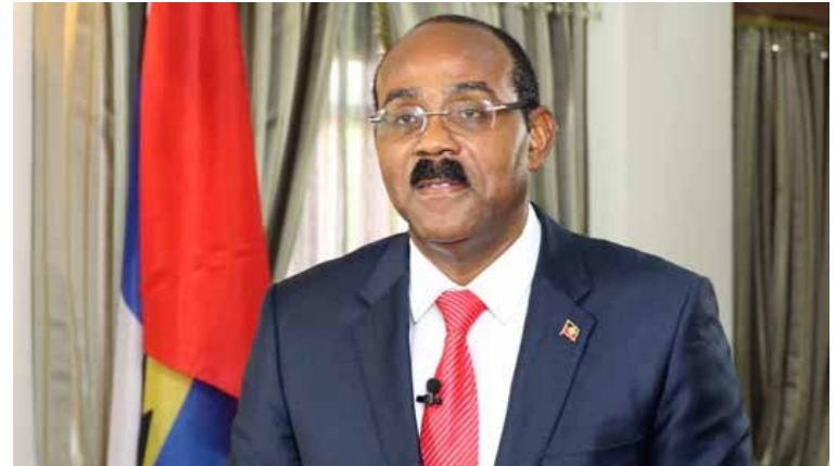
Prime Minister Gaston Browne prior experience, or qualifications in finance and he collapsed the economy.