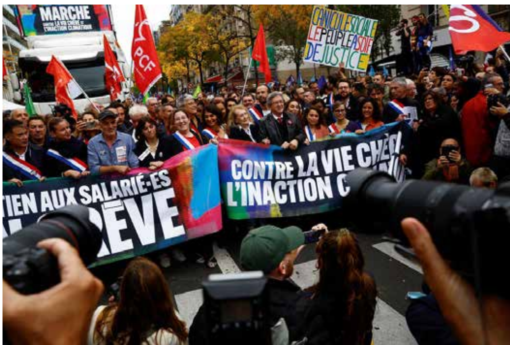
Jean-Luc Melenchon, leader of French far-left opposition party La France Insoumise (France Unbowed), and leader of the New Ecologic and Social People's Union (NUPES), takes part in a protest against soaring inflation and what they call a lack of government action to fight climate change, in Paris, France October 16, 2022.

the NUPES parliamentary coalition, which hopes to turn the page on domestic violence accusations that have recently dogged senior members.