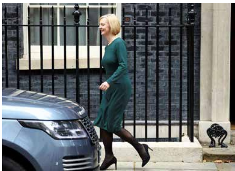
British Prime Minister Liz Truss walks outside Number 10 Downing Street, in London, Britain, October 12, 2022.

Earlier on Saturday Britain's new finance min-