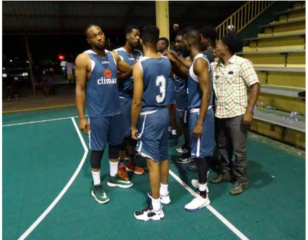
The Anjo's Wholesale team in a huddle just before tip-off of their game against Graphic Impact Shooters in the Business League at the JSC Sports Complex on Thursday, 13th October, 2022.

Sandals Antigua had trounced the Board of Education 81-45 on Thursday night and now holds the league's