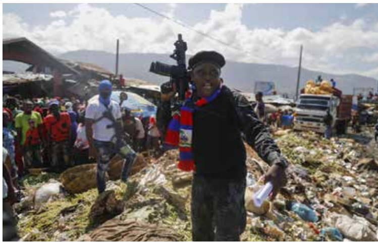
Barbecue, the leader of the “G9 and Family” gang, stands next to garbage to call attention to the conditions people live in as he leads a march against kidnapping through La Saline neighbourhood in Port-au-Prince, Haiti, Friday, Oct. 22, 2021.

In a recent video posted on Facebook, G9 and Family leader Jimmy Cherizier, who goes by the nickname “Barbecue,” read a proposed plan