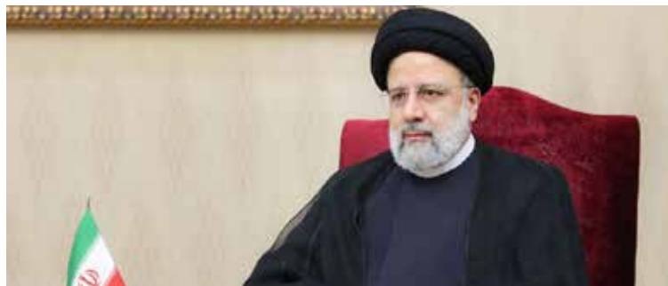
Iranian President Ebrahim Raisi meets with Emir of Qatar Tamim bin Hamad Al Thani (not pictured) on the sidelines of the Cica Summit in Astana, Kazakhstan, October 13, 2022.

"Iran has to end the violence against its own citizens simply exercising their fundamental rights," U.S. President Joe Biden said on Saturday.