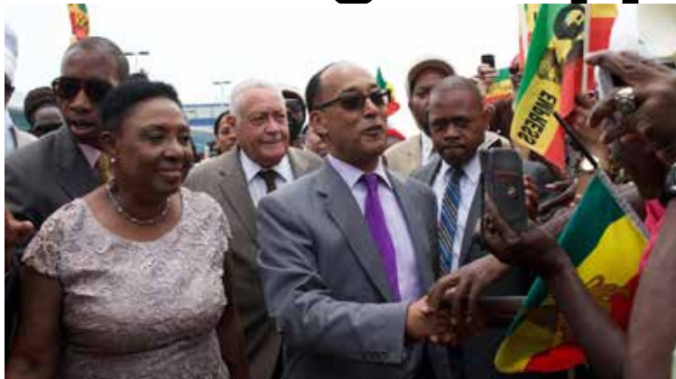
His Imperial Highness, Prince Ermias Sahle-Selassie, (centre) is in Jamaica for a nine-day visit.

"Jamaica is a vibrant democracy. Democracies evolve, and the Jamaican experiment of different people, one nation is something that will resonate in any nation