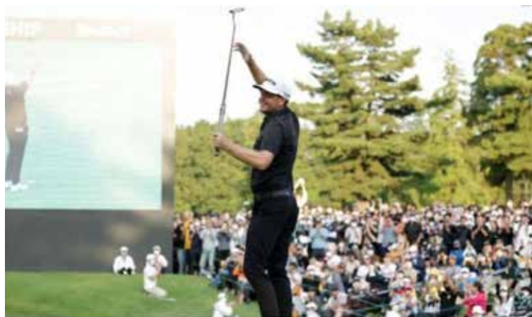
Keegan Bradley now has five PGA Tour titles to his name

"This is what I want to do - I want to win tourna-