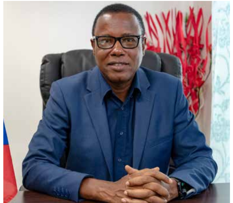
Minister of Social Transformation Dean Jonas

Child Protection Act is adequate in its current form, there has been acknowledgement of the need to raise public awareness about the laws relating to the abuse of minors and the penalties that can be applied to those who violate them.