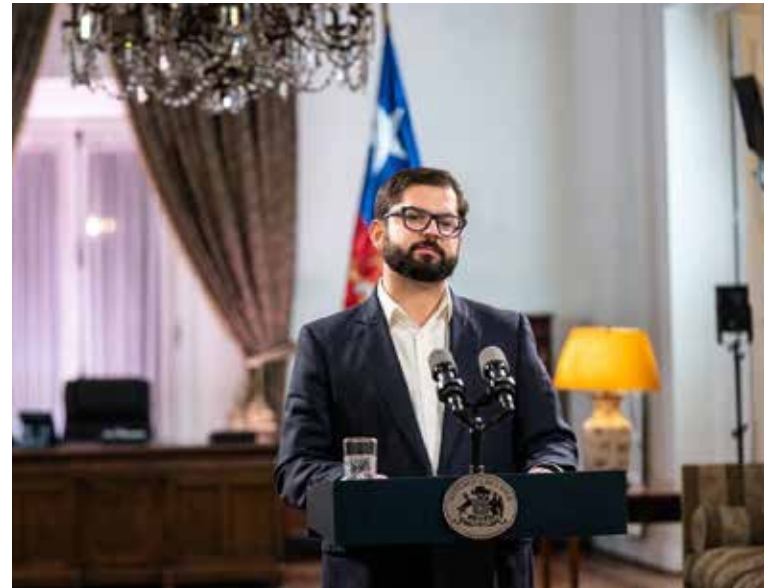
Chile's President Gabriel Boric speaks about the results of the referendum at the government palace La Moneda in Santiago, Chile September 4, 2022.

Siches, a doctor by trade who gained popularity during the pandemic,