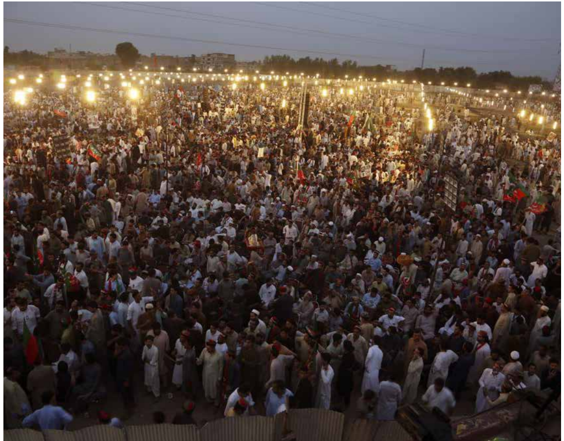
Supporters of Pakistani opposition leader Imran Khan's Tehreek-e-Insaf party attend a rally, in Peshawar, Pakistan, Tuesday, Sept. 6, 2022. Since he was toppled by parliament five months ago, former Prime Minister Imran Khan has demonstrated his popularity with rallies that have drawn huge crowds and signalled to his rivals that he remains a considerable political force.

As during previous rallies, Tuesday's speech was not shown live by TV stations on instructions from the country's media regulatory agency. The regulators have banned broadcasting his live speeches, purported-