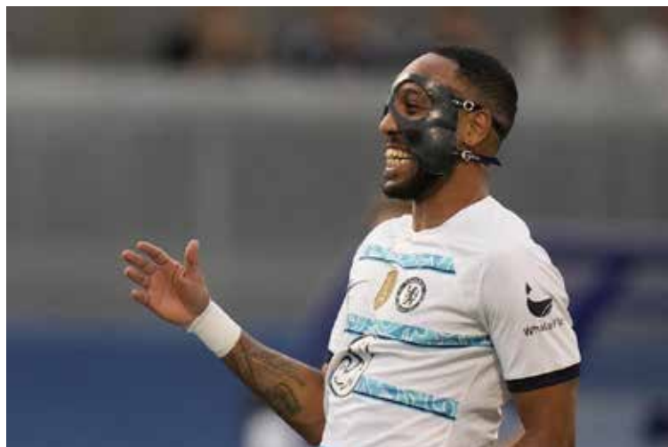
Chelsea's Pierre-Emerick Aubameyang laughs during the Champions League group E soccer match between Dinamo Zagreb and Chelsea at the Maksimir stadium in Zagreb, Croatia, Tuesday, Sept. 6, 2022.

and-grab win was earned thanks to the early goal by Oršić, who met a headed flick-on by Bruno Petković in midfield by chesting the ball forward inside his own half past Chelsea defender Wesley Fofana and racing clear of the newly signed French defender toward goalkeeper Kepa Arrizabalaga.