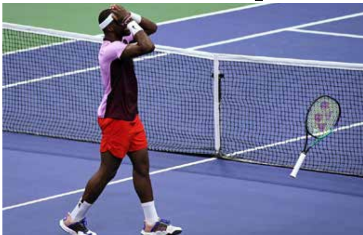
Frances Tiafoe, of the United States, celebrates after defeating Rafael Nadal, of Spain, during the fourth round of the U.S. Open tennis championships, Monday, Sept. 5, 2022, in New York.

"Bro," Tiafoe said, "I was going crazy."