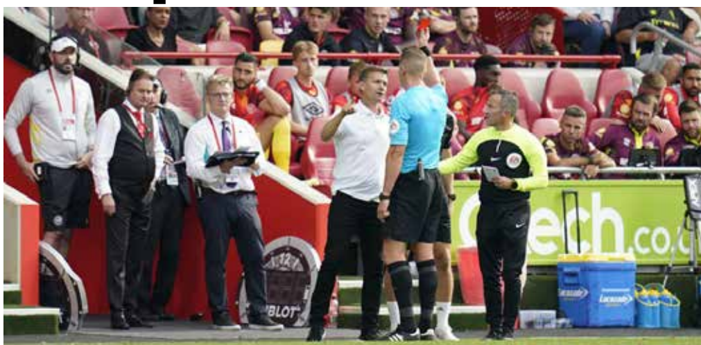
Leeds United manager Jesse Marsch is shown a red card during their English Premier League soccer match against Brentford at the Gtech Community Stadium, London, Saturday, Sept. 3, 2022.

Marsch said he was incensed because Brentford was awarded a penalty after a video review in the first half