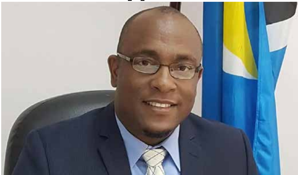
St. Lucia's Minister of St. Lucia's Education, Sustainable Development, Innovation, Science, Technology and Vocational Training, Shawn Edward

CMC – The Barbados-based Caribbean Disaster Emergency Management Agency (CDEMA) says St. Lucia's Education, Sustainable Development, Innovation, Science, Technology and Vocational Training Minister, Shawn Edward, has been appointed chairman of the regional disaster agency.