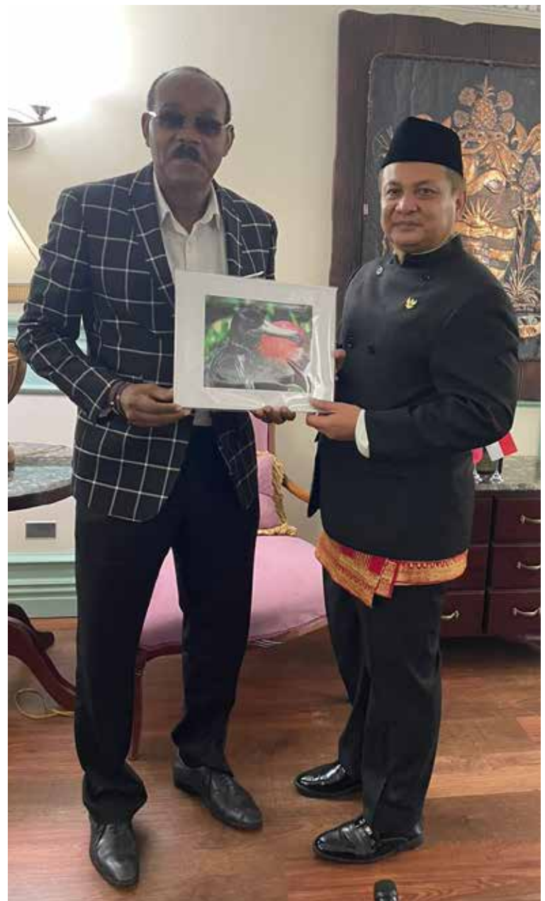
Prime Minister Gaston Browne received a courtesy call from the new ambassador of the Republic of Indonesia to Antigua and Barbuda, Tatang Razak, on Tuesday

On matters closer to home, the prime minister noted that while the rela-