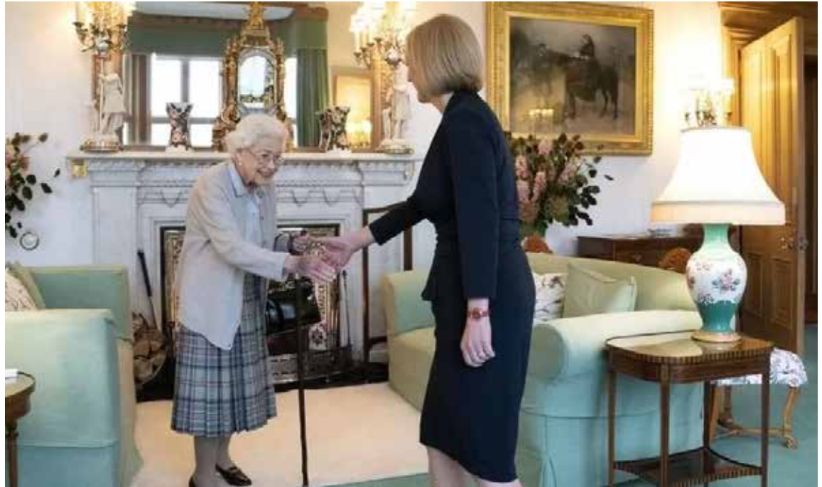
The Queen met her new prime minister at Balmoral

Simon Clarke, who backed Ms Truss for the leadership and is tipped to become levelling up secretary, told the BBC he was anticipating "a major intervention" on energy bills.