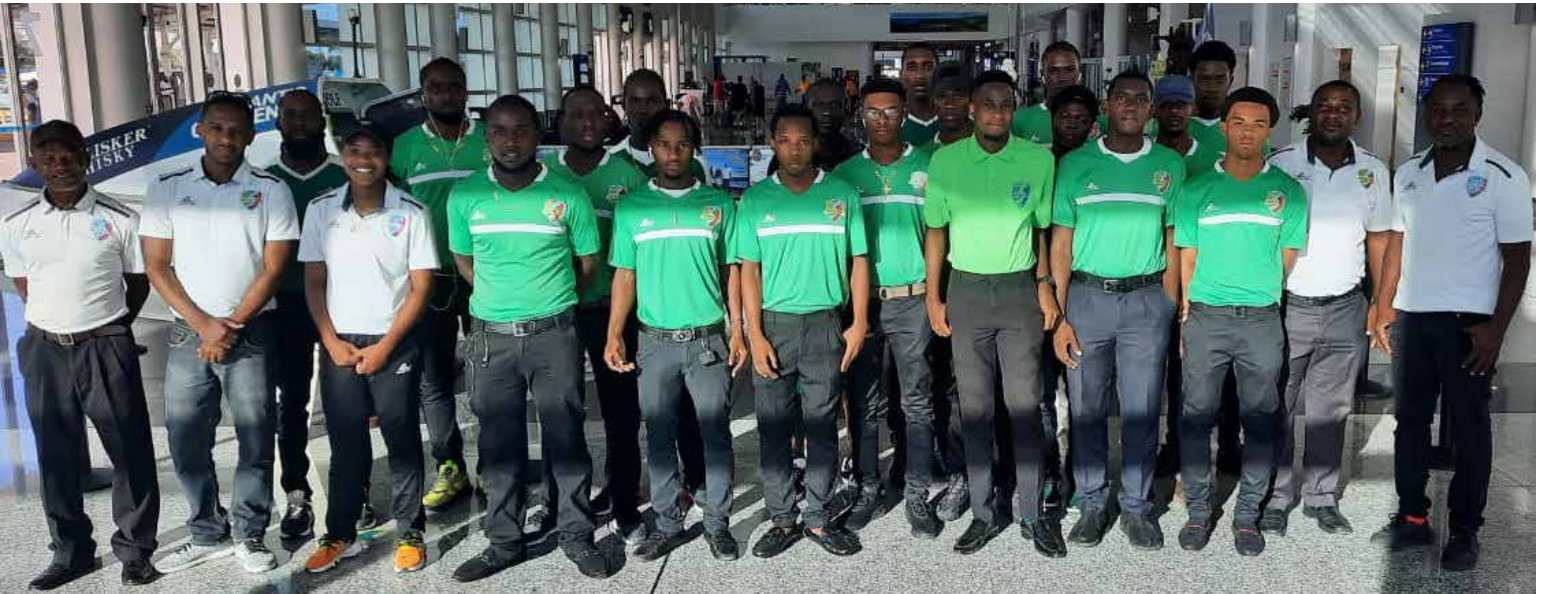
The Bath United Football Club of Nevis on arrival at the V.C Bird International Airport in Antigua and Barbuda on Friday, 23rd September, for their participation in the Antigua-Nevis Cup football tournament.

Nevisian visitors Bath United underlined their intent to capture the inaugural Antigua-Nevis Cup football tournament when they came from behind to overcome hosts Young Warriors 3-1 to claim their second win in as many matches at the Pigotts Playing Field on Saturday evening.