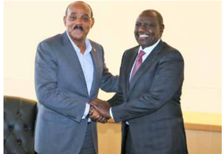
Prime Minister Gaston Browne (left) and Dr. William Suto, President of Kenya

Both leaders participated in the inaugural Africa-CARICOM Summit on 7th September 2021, under the theme, "Unity across continents and oceans: opportunities for deepening integra-