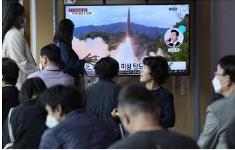
People watch a news programme showing a file image of a missile launch by North Korea at the Seoul Railway Station in Seoul, South Korea, Sunday, Sept. 25, 2022. North Korea fired a short-range ballistic missile Sunday toward its eastern seas, extending a provocative streak in weapons testing as a U.S. aircraft carrier visits South Korea for joint military exercises in response to the North's growing nuclear threat.

The launch came as the nuclear-powered aircraft carrier USS Ronald Reagan and its strike group arrived in South Korea for the two countries' joint military exercises that aim to show their