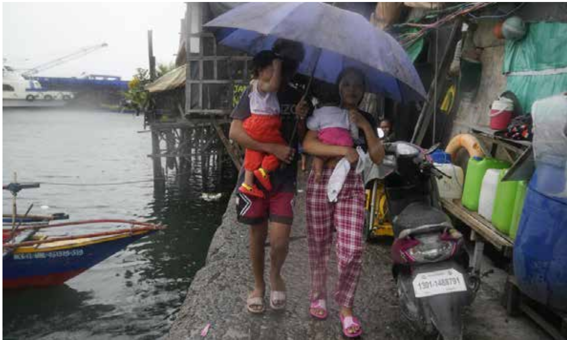
Residents carry their children as they evacuate to safer grounds to prepare for the coming of Typhoon Noru at the seaside slum district of Tondo in Manila, Philippines, Sunday, Sept. 25, 2022. The powerful typhoon shifted and abruptly gained strength in an “explosive intensification” Sunday as it blew closer to the north eastern Philippines, prompting evacuations from high-risk villages and even the capital, which could be sideswiped by the storm, officials said.

Thousands of villagers were evacuated — some forcibly — from the typhoon’s path, as well as from mountainside villages prone to landslides and flash