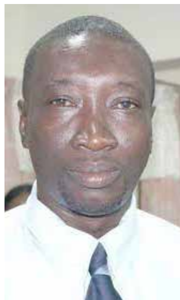
Ambassador Keith George

"The Government of Suriname also proposed the conclusion of a Fisheries Agreement between the two countries which would also address the granting of licences. Guyana continued