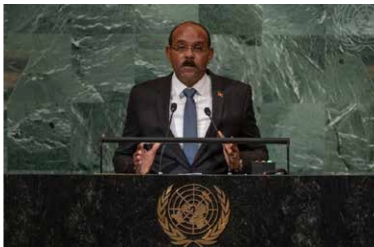
Prime Minister Gaston Browne

Browne said that the five victorious nations of the Second World War assigned to themselves, permanent membership of the UN Security Council, assuming responsibility to implement the promises of the Charter not only in their own interests, but also on behalf of the many nations, “which