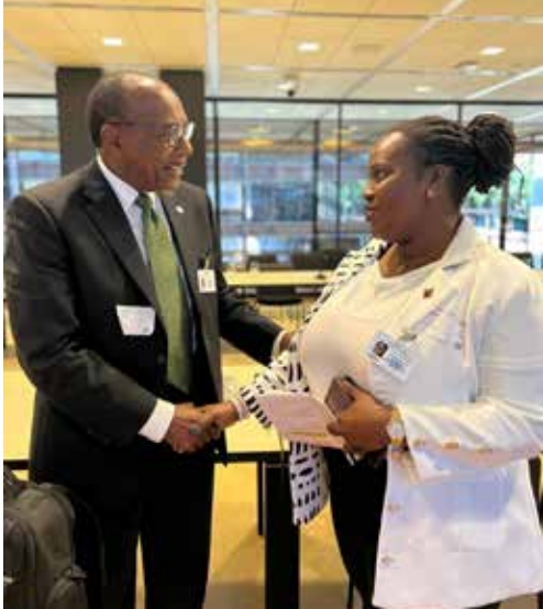
Minister of Health, Wellness and Environment, Sir Molywn Joseph with St. Kitts and Nevis' Minister of Energy and Climate Action, Dr. Joyelle Clarke

St. Kitts and Nevis is moving closer towards addressing climate-related challenges, as Antigua and Barbuda has given a commitment to supporting its neighbour's accreditation bid for Green Climate Funding (GCF) and its efforts to address plastic pollution.