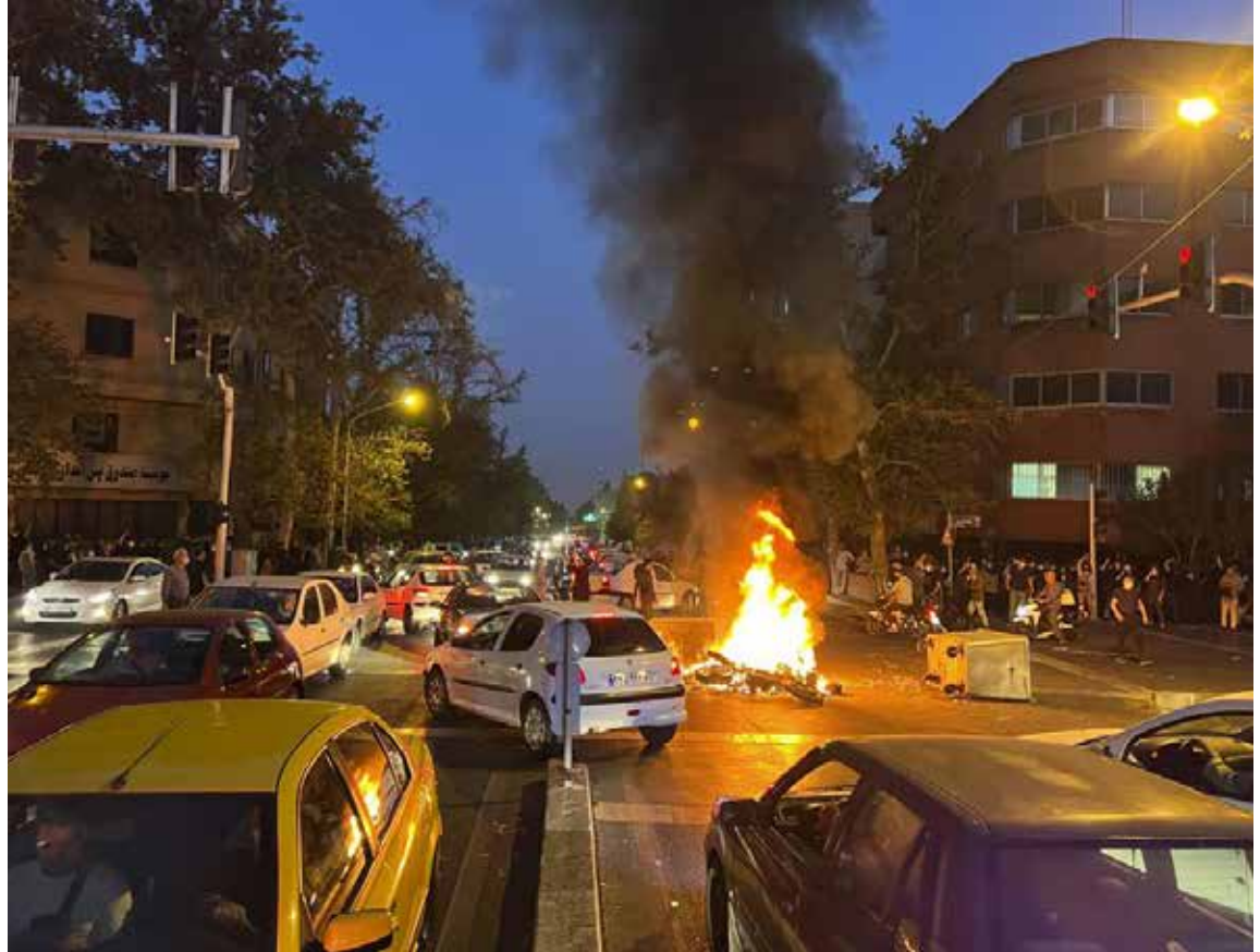
In this Sept. 19, 2022, photo taken by an individual not employed by the Associated Press and obtained by the AP outside Iran, a police motorcycle burns during a protest over the death of a young woman who had been detained for violating the country's conservative dress code, in downtown Tehran, Iran. Iran's Foreign Ministry said Sunday, Sept. 25, 2022, that it summoned Britain's ambassador to protest what it described as a hostile atmosphere created by London-based Farsi language media outlets, amid violent unrest in Iran triggered by the death of the young woman in police custody. (AP Photo, File)

Running clashes between demonstrators and security forces have continued to erupt. A member of the Basij, a volunteer force with Iran's Guards, was killed by protesters last night in Teh-