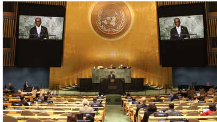
St. Lucia's Prime Minister Phillip J. Pierre

“Instead, we have mostly witnessed declines in the demand for our primary com-