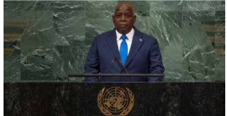
Prime Minister of the Bahamas, Philip Davis KC, at the UN General Assembly.

"Why is it that European States that operate frameworks akin to that of blacklisted countries are not even being [considered] eligible for inclusion on this list? Why are all the countries being targeted, small