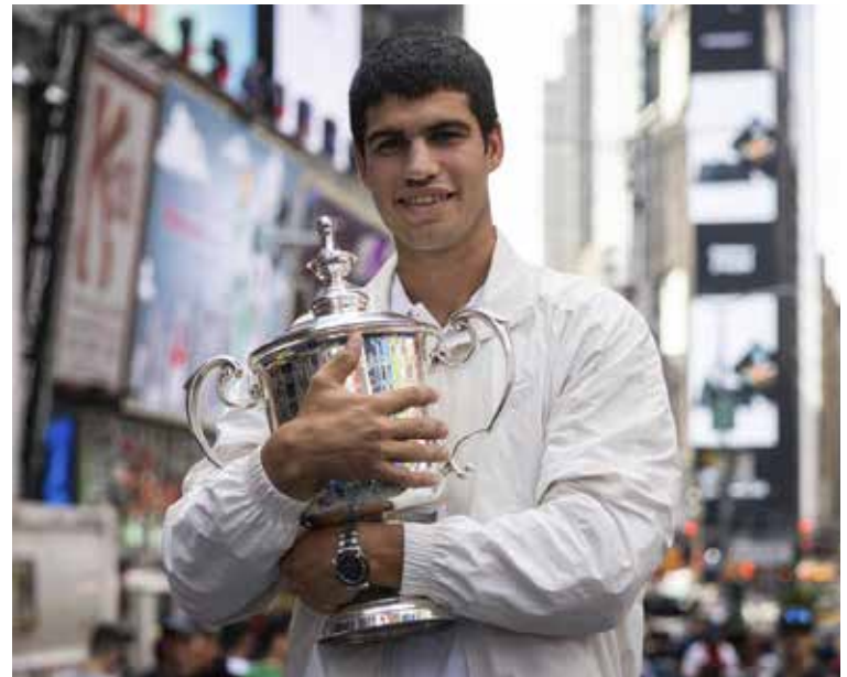
U.S. Open men's singles tennis champion Carlos Alcaraz poses in Times Square, Monday, Sept. 12, 2022, in New York.

Many expected Alcaraz to skip the Davis Cup after