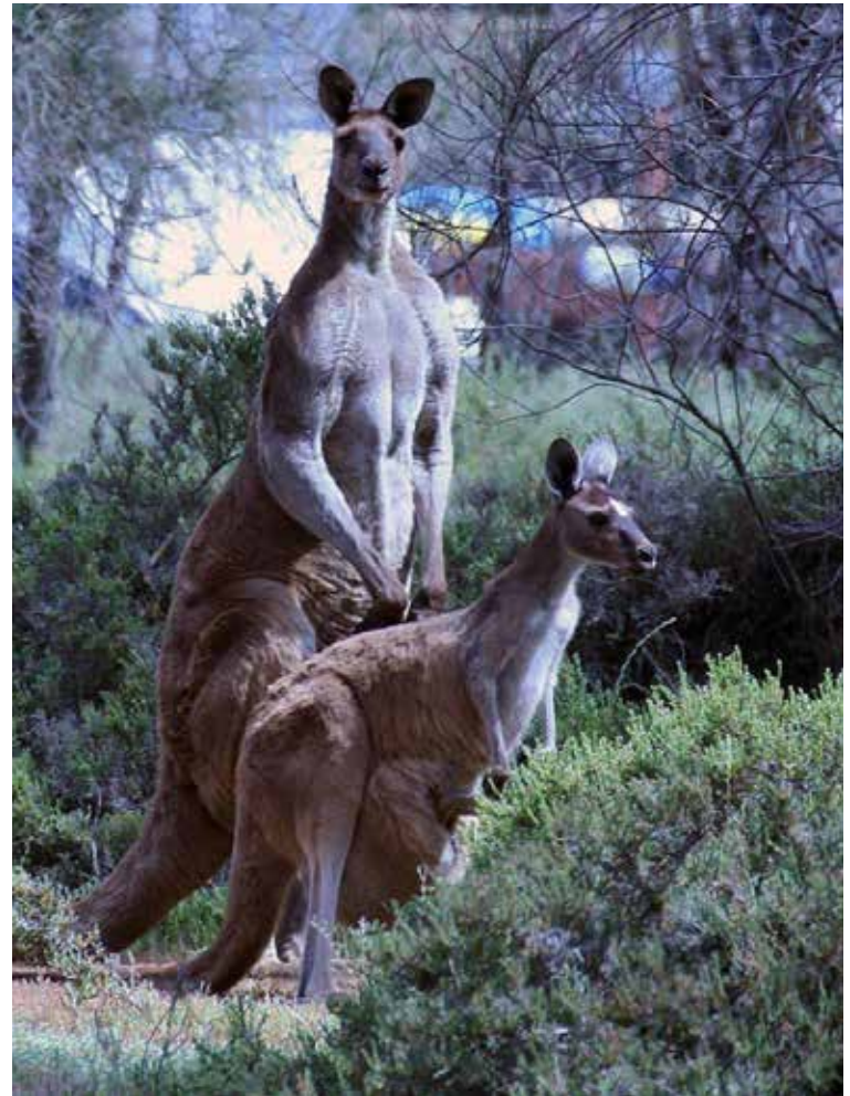
Male kangaroos can grow to become as tall as 7 feet and weigh in excess of 200 pounds

permit to be able to do that. I don’t believe they really give them out very often unless you’re a wildlife centre with trained people who know what they’re doing,” she said.