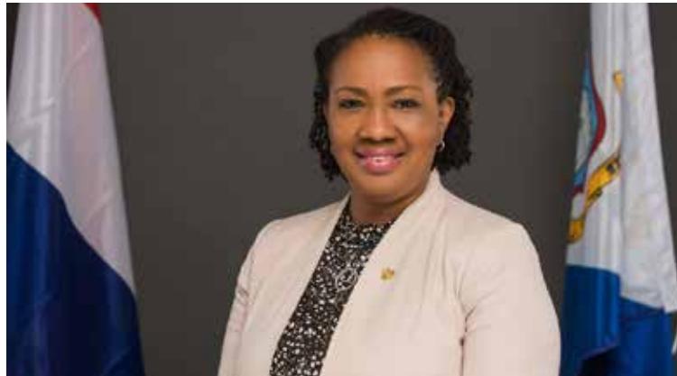
Prime Minister and Minister of General Affairs Silveria Jacobs, also leader of the National Alliance party

“After many discussions regarding support for the sit-