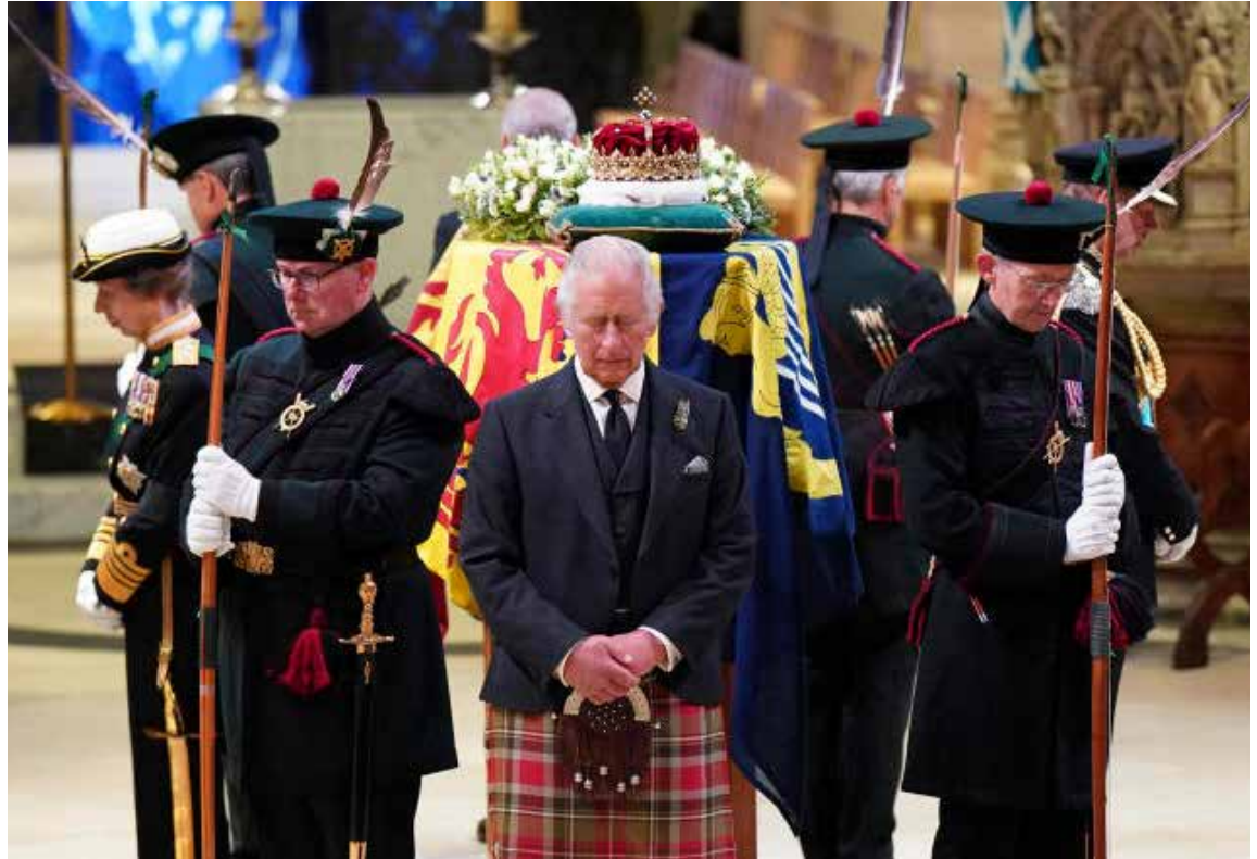
King Charles led his brothers, Princes Andrew and Edward, and sister, Anne, the Princess Royal, in the 20-minute Vigil of the Princes on Monday. It was the first time in the history of the British Monarchy that a woman, Princess Anne, the Queen's only daughter, participated in the ceremonial vigil which was last held in 2002 on the death of Queen Elizabeth The Queen Mother.

The last day of the period of national mourning will be marked by the holiday, according to King Charles, which "will allow