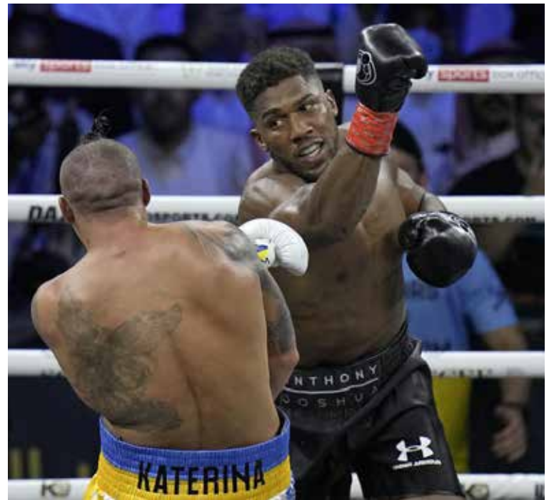
Britain's Anthony Joshua, right, launches a blow at Ukraine's Oleksandr Usyk during their world heavyweight title fight at King Abdullah Sports City in Jeddah, Saudi Arabia, Sunday, Aug. 21, 2022.

The unbeaten Fury appears to have gone back on his decision to retire in the wake of beating another British fighter, Dillian Whyte, in front of around 90,000 spectators at Wembley Stadium in April.