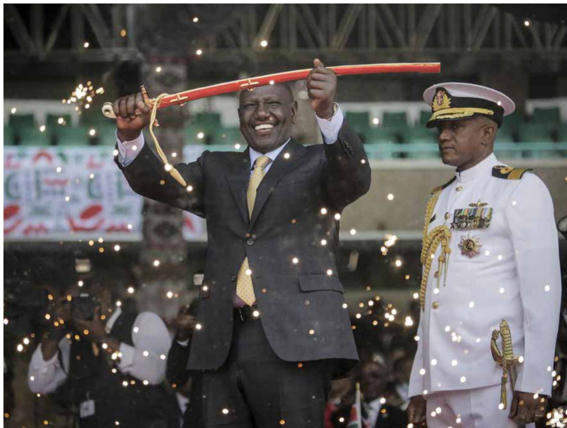
Kenya's new president William Ruto holds up a ceremonial sword as he is sworn into office at a ceremony held at Kasarani stadium in Nairobi, Kenya Tuesday, Sept. 13, 2022. William Ruto was sworn in as Kenya's president on Tuesday after narrowly winning the Aug. 9 election and after the Supreme Court last week rejected a challenge to the official results by losing candidate Raila Odinga.

In his first tweet as president, the evangelical Christian quoted Psalms: "This is