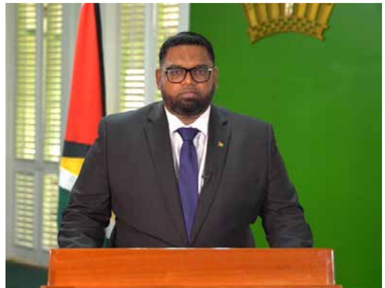
President Irfaan Ali

Meanwhile, the President has been asked to