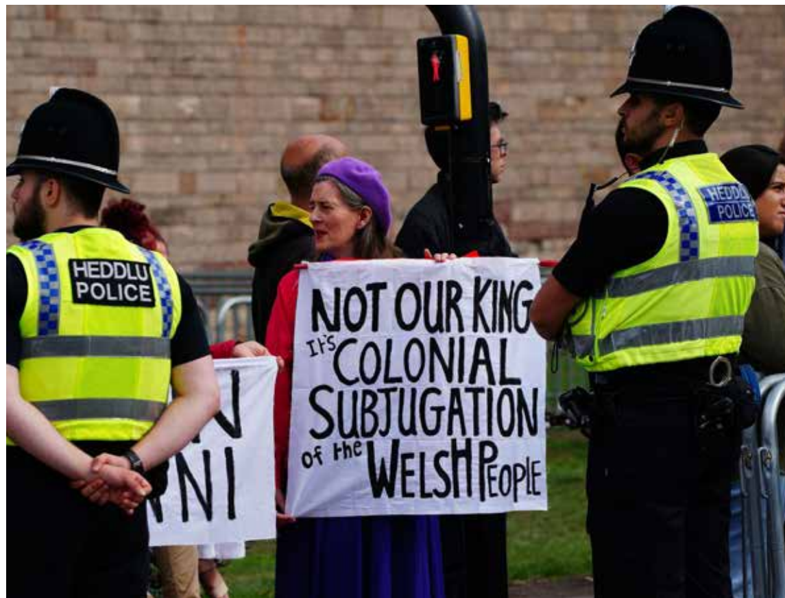
People protest ahead of the Accession Proclamation Ceremony at Cardiff Castle, Wales, publicly proclaiming King Charles III as the new monarch, Sunday Sept. 11, 2022.

“The police abused their powers to arrest someone who voiced some mild op-