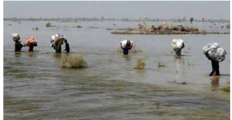
Victims of heavy flooding from monsoon rains crowd carry relief aid through flood water in the Qambar Shahdadkot district of Sindh Province, Pakistan, Sept. 9, 2022. The United Nations says weather disasters costing $200 million a day and irreversible climate catastrophe looming show the world is “heading in the wrong direction.”

U.N. Secretary-General Antonio Guterres cited the floods in Pakistan, heat waves in Europe, droughts in places such as China, the Horn of Africa, and the United States – and pointed the finger at fossil fuels.