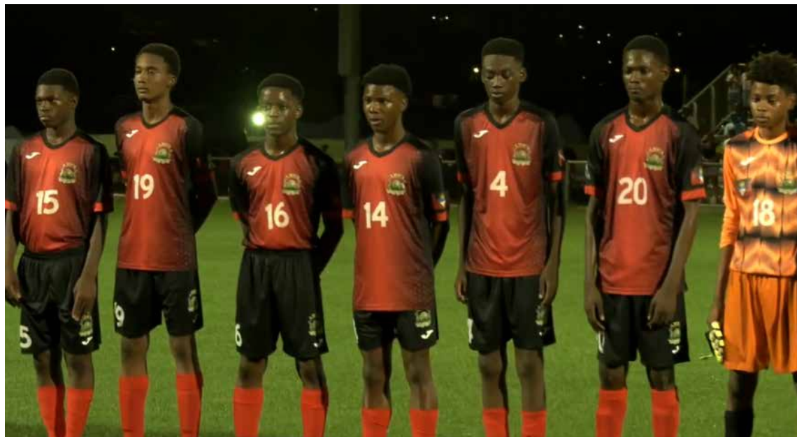
Members of the Antigua and Barbuda team during the playing of their national anthem prior to the start of their game against Grenada in the Pride of the Caribbean Under-17 Boys Competition at the ABFA's Technical Centre at Paynters on Wednesday, 24th August, 2022.

The win gave Antigua and Barbuda a good chance of reaching the final of the