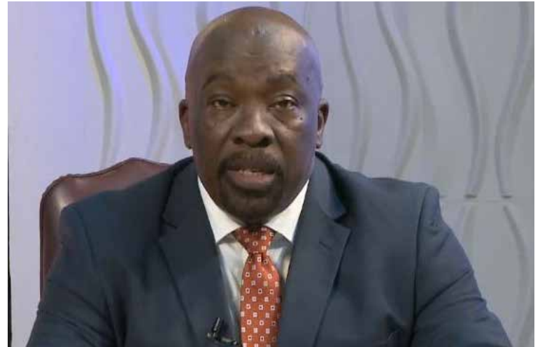
Minister of Information, Melford Nicholas

"Additionally, it is important that we have the right complement of hotel rooms to match the number