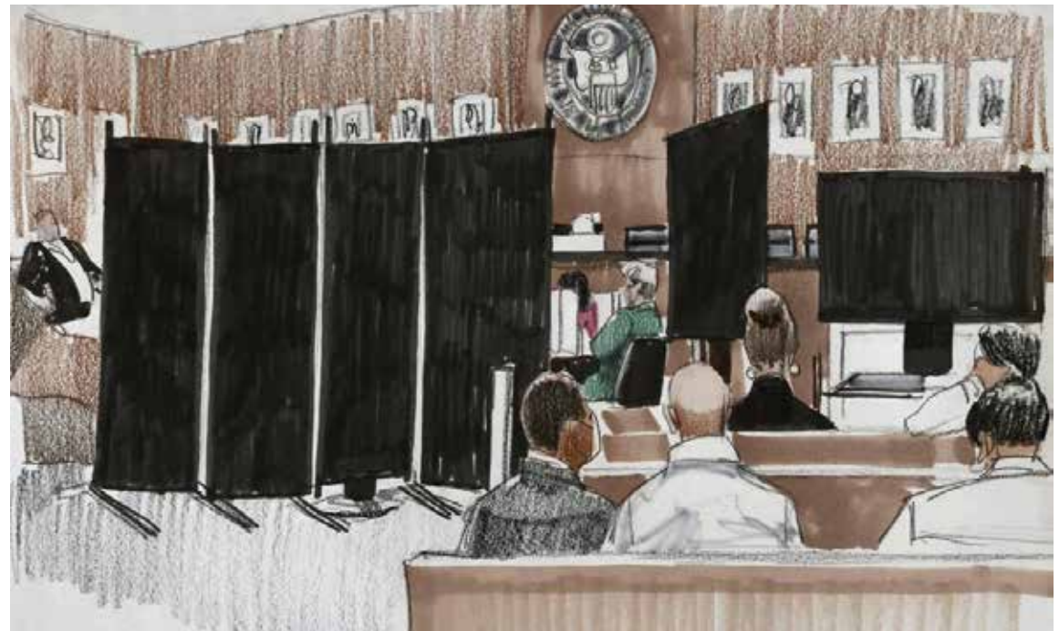
In this courtroom sketch, the front of the courtroom is blocked off as a sexually graphic video clip is played for the jury during R. Kelly's trial in federal court, Friday, Aug. 19, 2022, in Chicago.