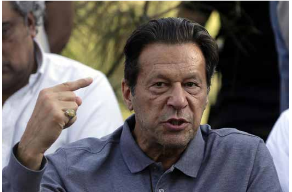
Former Pakistan's Prime Minister Imran Khan speaks during a news conference in Islamabad on April 23, 2022. A Pakistani court on Thursday, Aug. 25, 2022 barred police from arresting Khan through the end of the month, officials said.

Hundreds of Khan's supporters gathered outside the court building, chanting slogans against Sharif's gov-