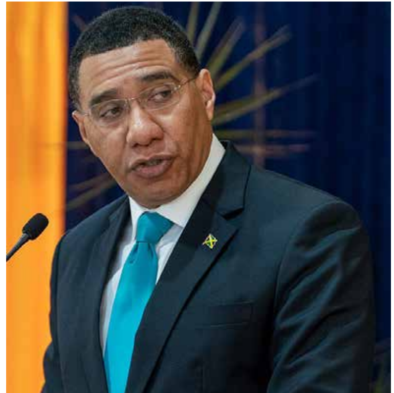
Prime Minister of Jamaica, Andrew Holness retired teachers.

However, he welcomed the Ministry of Education and Youth's remedies that were presented to the public on Monday, which are aimed at mitigating the effects of teacher resignations, one of which is hiring