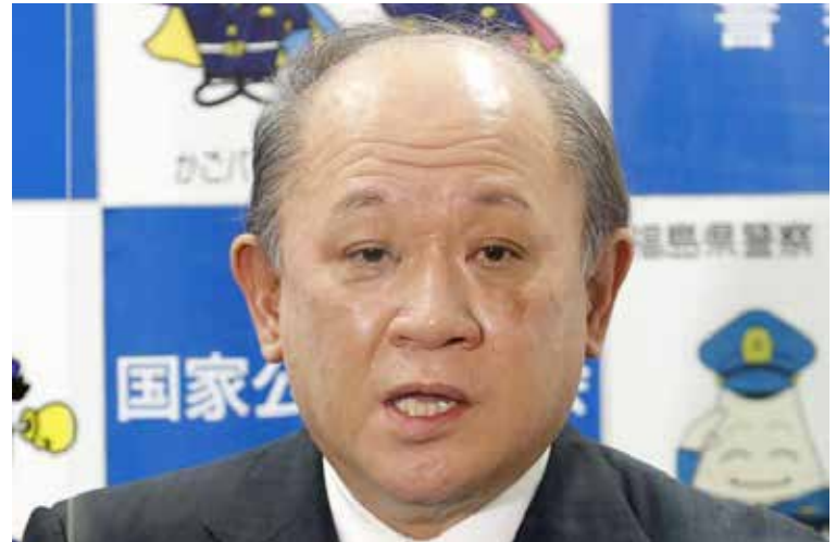
Japan's police chief, Itaru Nakamura, says he will resign for failing to save former Prime Minister Shinzo Abe from assassination

"In the process of verifying our new security plan, we have come to realise that our security duties would need a fresh start," Mr Nakamura told a news conference as he an-