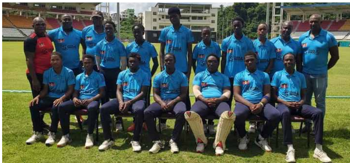
The Antigua and Barbuda Combined Schools squad on their current tour to the Nature Isle of the Caribbean.

snapped up three wickets for 23 runs, off-spinner Demetri Lucas claimed one wicket for 17 runs and Ajahrie Joseph captured one wicket for 27 runs.