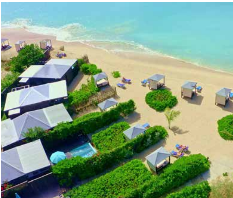
Keyonna Beach Resort

That’s one of the strongest tourism recoveries in the Caribbean since the onset of the pandemic. (Caribbean Journal)