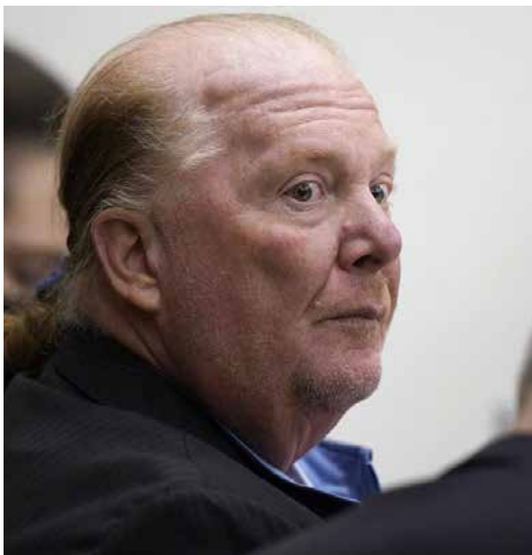
Celebrity chef Mario Batali, centre, is seated at Boston Municipal Court during the first day of his pandemic-delayed trial, Monday, May 9, 2022, in Boston. Batali pleaded not guilty to a charge of indecent assault and battery in 2019, stemming from accusations that he forcibly kissed and groped a woman after taking a selfie with her at a Boston restaurant in 2017. Now, Batali has agreed to settle two Massachusetts lawsuits that accused the celebrity chef of sexual assault, attorneys for the women said on Wednesday, Aug. 24, 2022.

The women alleged that Batali had sexually