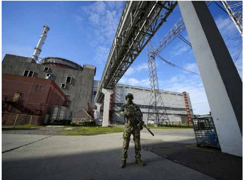
A Russian serviceman guards an area of the Zaporizhzhia Nuclear Power Station in territory under Russian military control, south eastern Ukraine, May 1, 2022. Ukrainians are once again anxious and alarmed about the fate of a nuclear power plant in a land that was home to the world's worst atomic accident in 1986 at Chernobyl. The Zaporizhzhia nuclear plant, Europe's largest, has been occupied by Russian forces and continued fighting nearby has heightened fears of a catastrophe that could affect nearby towns in southern Ukraine or beyond.