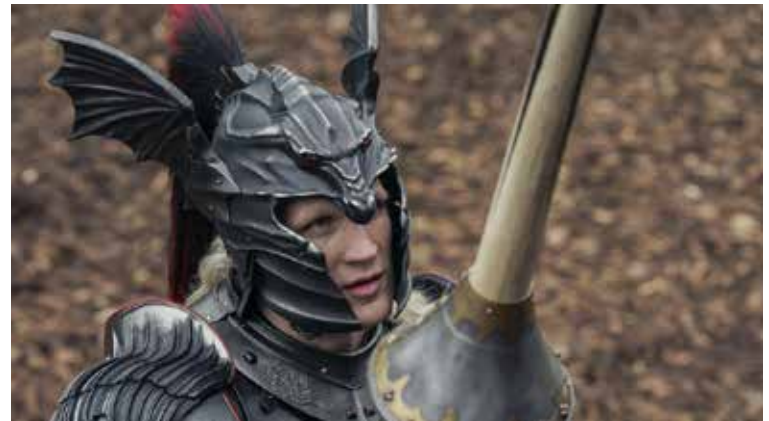
This image released by HBO Max shows Matt Smith as Prince Daemon Targaryen in a scene from "House of the Dragon," a prequel to "Game of Thrones."

The challenge — and opportunity — for HBO lies cont'd on pg 17