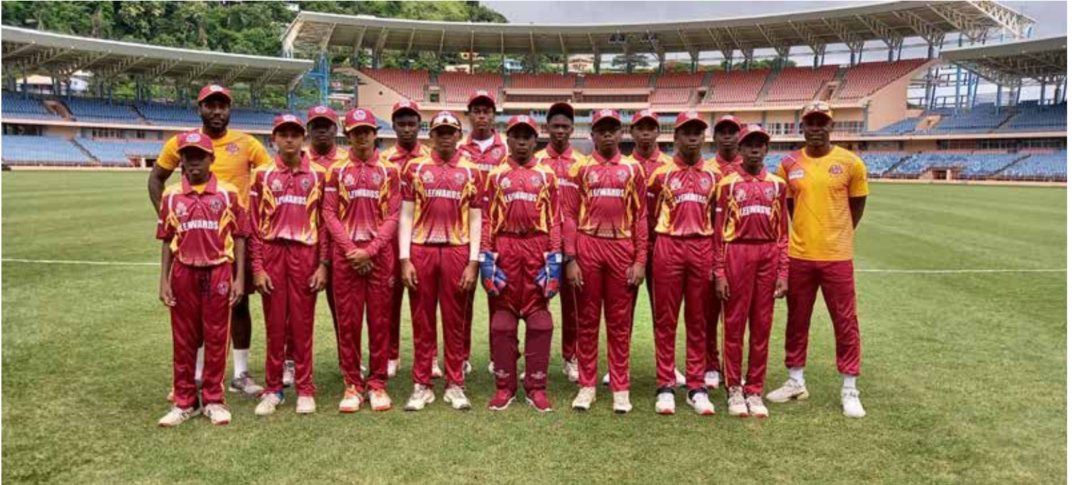
The Leeward Islands squad at the CWI Rising Stars Under-15 Boys Championship in Grenada. (File photo)

The Leeward Islands recorded their second win in the rain affected Cricket West Indies (CWI) Rising Stars Under-15 Boys Championship in Grenada yesterday (Thursday).