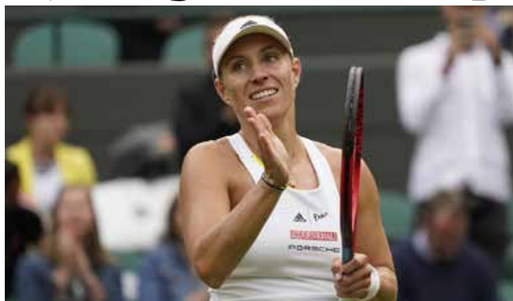
Germany's Angelique Kerber waves after defeating France's Kristina Mladenovic during their women's singles tennis match on day one of the Wimbledon tennis championships in London, Monday, June 27, 2022.

She also won the Australian Open that year and