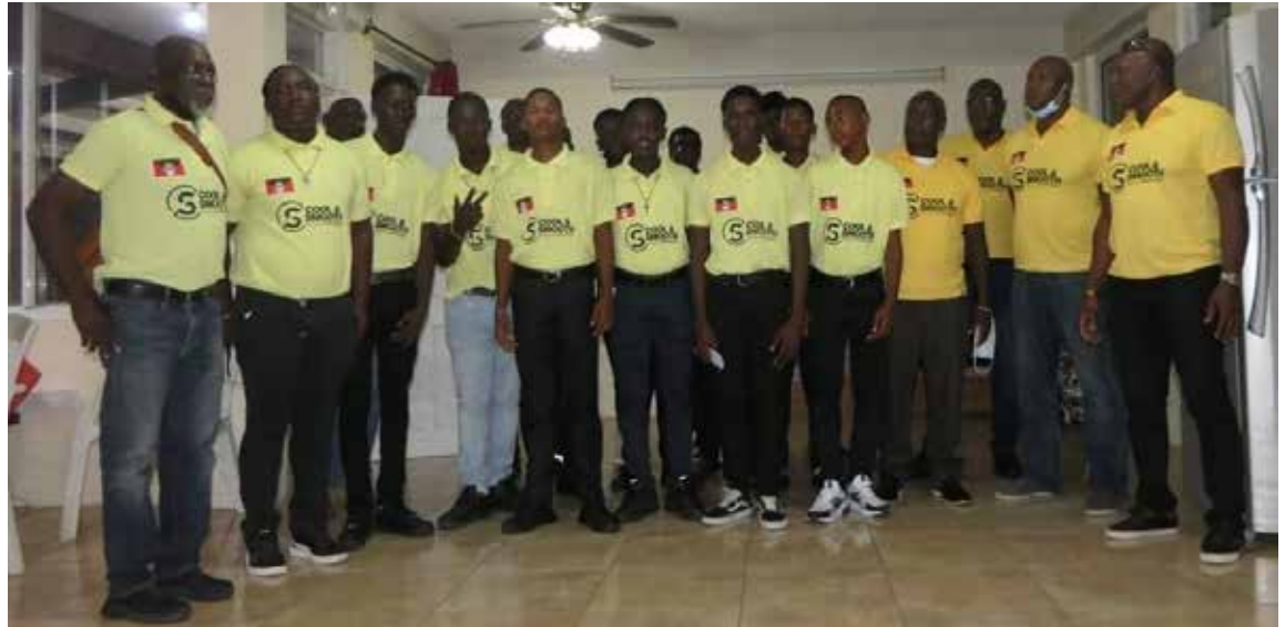
The Antigua and Barbuda Combined Schools squad on their current tour to the Nature Isle of the Caribbean.