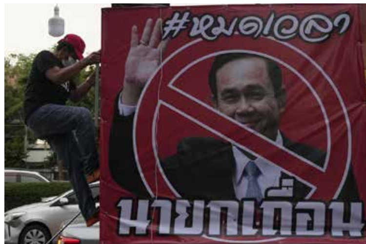
An anti-government protester climbs on a car beside a poster of Prime Minister Prayuth Chan-ocha in Bangkok, Thailand, Wednesday, Aug. 24, 2022.

Since then, Thaksin, a telecoms billionaire whose populist appeal threatened the traditional power structure, has remained at the centre of the country’s politics, as his supporters and opponents fought for power both at the ballot box and in the streets, some-