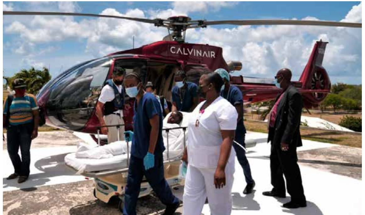
The Calvin Ayre Foundation has supported similar emergency medical evacuation exercises in the past. In early June 2021, a Barbudan teen, pictured here, was airlifted off the island for emergency treatment at the Sir Lester Bird Medical Centre in Antigua.

A Computed Tomography, or CT scan, revealed she had suffered an aneurysm, which doctors confirmed required medical attention outside of Antigua and Barbuda.