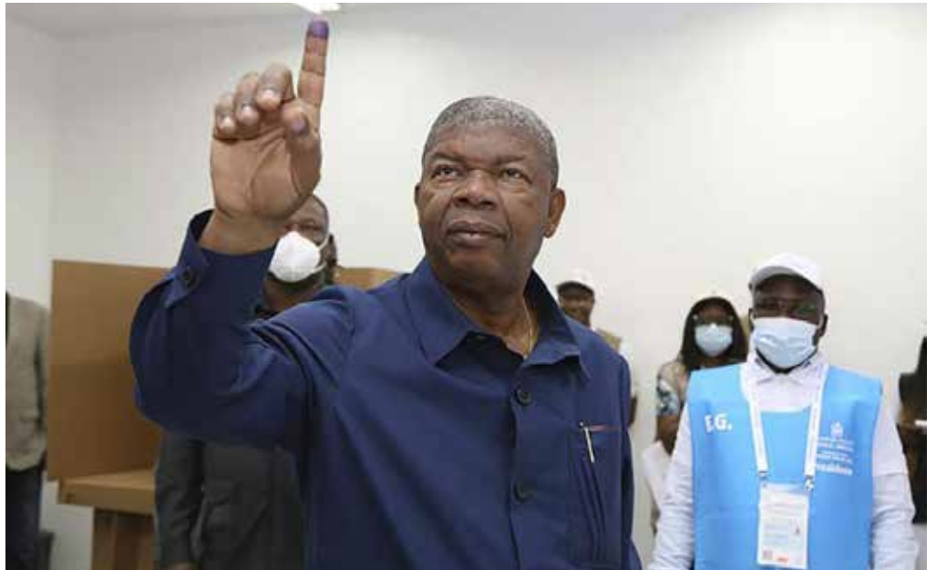
Angola President Joao Lourenco shows his marked finger during the voting process at a polling station in Luanda, Angola, Wednesday, Aug. 24, 2022. President Joao Lourenco is running for a second five-year term while his party, the Peoples' Movement for the Liberation of Angola, known by its Portuguese acronym MPLA, is campaigning to extend its 47-year run as the country's ruling party.

At the more than 26,400 polling stations across the country and abroad, the country's ruling party, the Peoples Movement for the Liberation of Angola, has 53,000 repre-