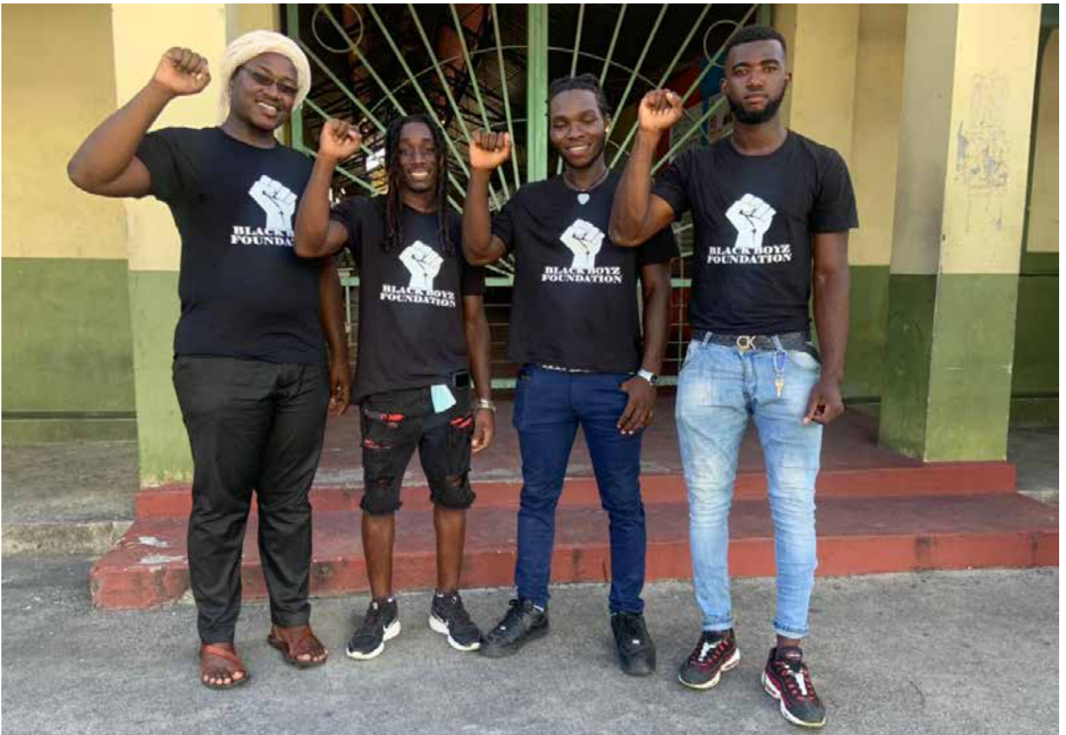
Members of Black Boyz Foundation have made it their mission to support the less fortunate and unsheltered in the community by providing breakfast and free haircuts to those in need. Story on page 5