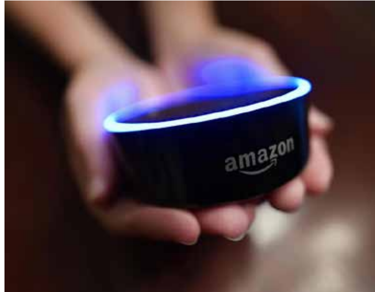
In this Aug. 16, 2018, file photo a child holds his Amazon Echo Dot in Kennesaw, Ga.