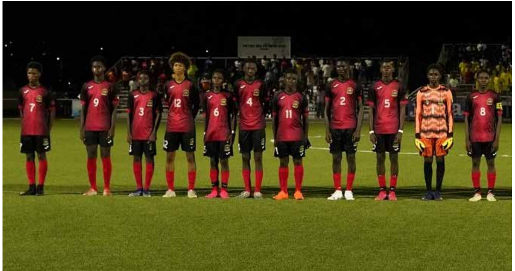
The Antigua and Barbuda Under-17 team during the playing of the national anthem prior to the start of their opening encounter against St. Vincent and the Grenadines in the Pride of the Caribbean Tournament at the ABFA Technical Centre at Paynters on Tuesday, 23rd August, 2022.

Earlier on Tuesday, in the first match of a double-header, St. Lucia and Grenada played to a 1-1 draw in