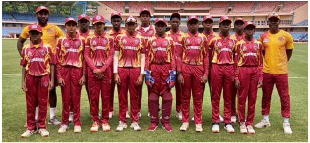
The Leeward Islands squad at the CWI Rising Stars Under-15 Boys Championship in Grenada.