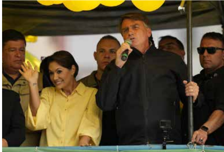
Brazilian President who is running for reelection, Jair Bolsonaro, speaks during a campaign rally as his wife Michelle waves, in Juiz de Fora, Minas Gerais state, Brazil, Tuesday, Aug. 16, 2022. Bolsonaro formally began his campaign for re-election in this town where he was stabbed during his 2018 campaign. General elections are set for Oct. 2.

Many of the comments were speculative and appeared to reflect personal opinion rather than a coordinated effort to undermine Brazilian democracy. However, they fed into national