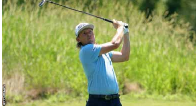
PGA Tour advocate Rory McIlroy has spoken to Open champion Cameron Smith, who has been linked with joining LIV Golf

"For most of them, they've made multi-year commitments. As I've been clear throughout, every