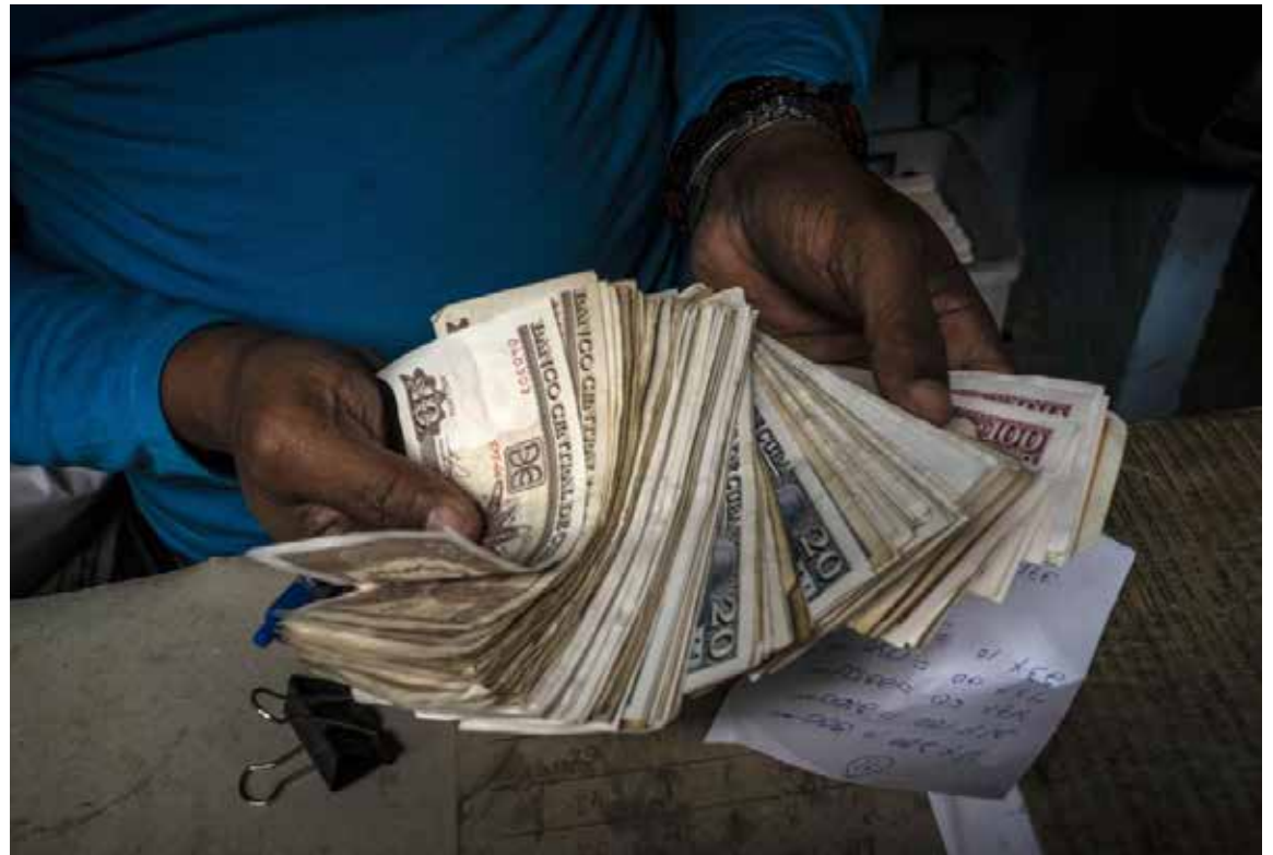
A worker shows a wad of Cuban pesos in Havana, Cuba, Dec. 11, 2020. The government announced on Aug. 1, 2022 that it will start buying U.S. dollars at an exchange rate five times higher than the official rate, at 110 Cuban pesos per dollar after commission, in an attempt to capture more foreign currency and at the same time combat the informal market.