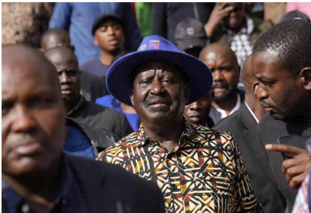
Kenyan presidential candidate Raila Odinga, centre, departs after delivering an address to the nation at his campaign headquarters in downtown Nairobi, Kenya, Tuesday, Aug. 16, 2022. Kenya is calm a day after Deputy President William Ruto was declared the winner of the narrow presidential election over longtime opposition figure Raila Odinga.

"What we saw yesterday was a travesty and blatant disregard of the constitution," Odinga said, calling the election results "null and void."