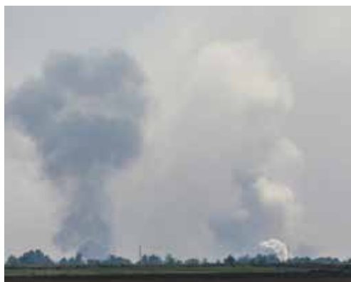
Smoke rises following an explosion in the village of Mayskoye in the Dzhankoi district of Crimea on August 16, 2022

State-owned news agency TASS cited the Russian Defence ministry as saying that civilian infrastructure had been damaged as a result of the "sab-