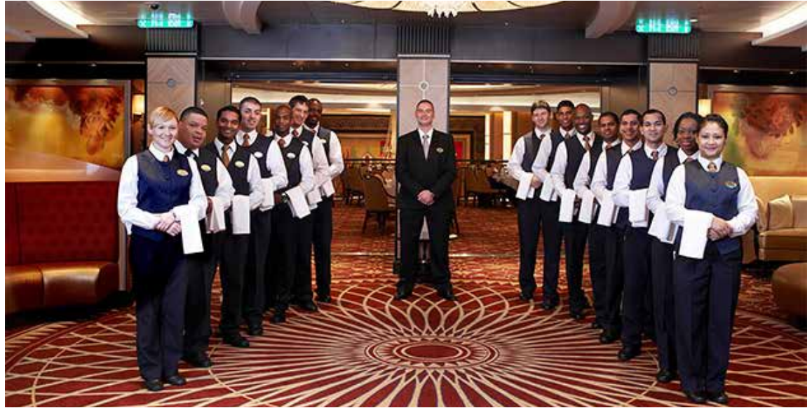
sidered for employment by MSC Cruise Line.

Of that total, one hundred and fifty eight were interviewed and the local selection team made recommendations for one hundred and forty-four to be con-