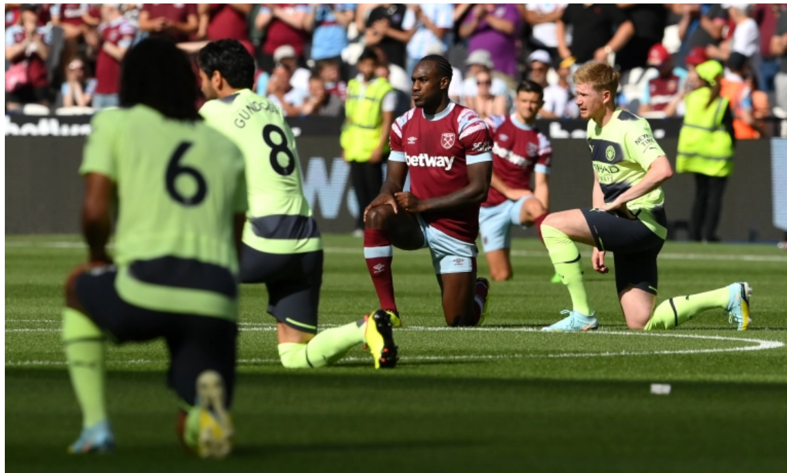
Premier League players, seen here taking the knee earlier this month, will limit the symbolic protest against racism to select games this season.

On the one hand are players like England-born Ivory Coast international Wilfred Zaha, who stopped taking the knee last year in the Premier League, where he plays for Crystal Pal-