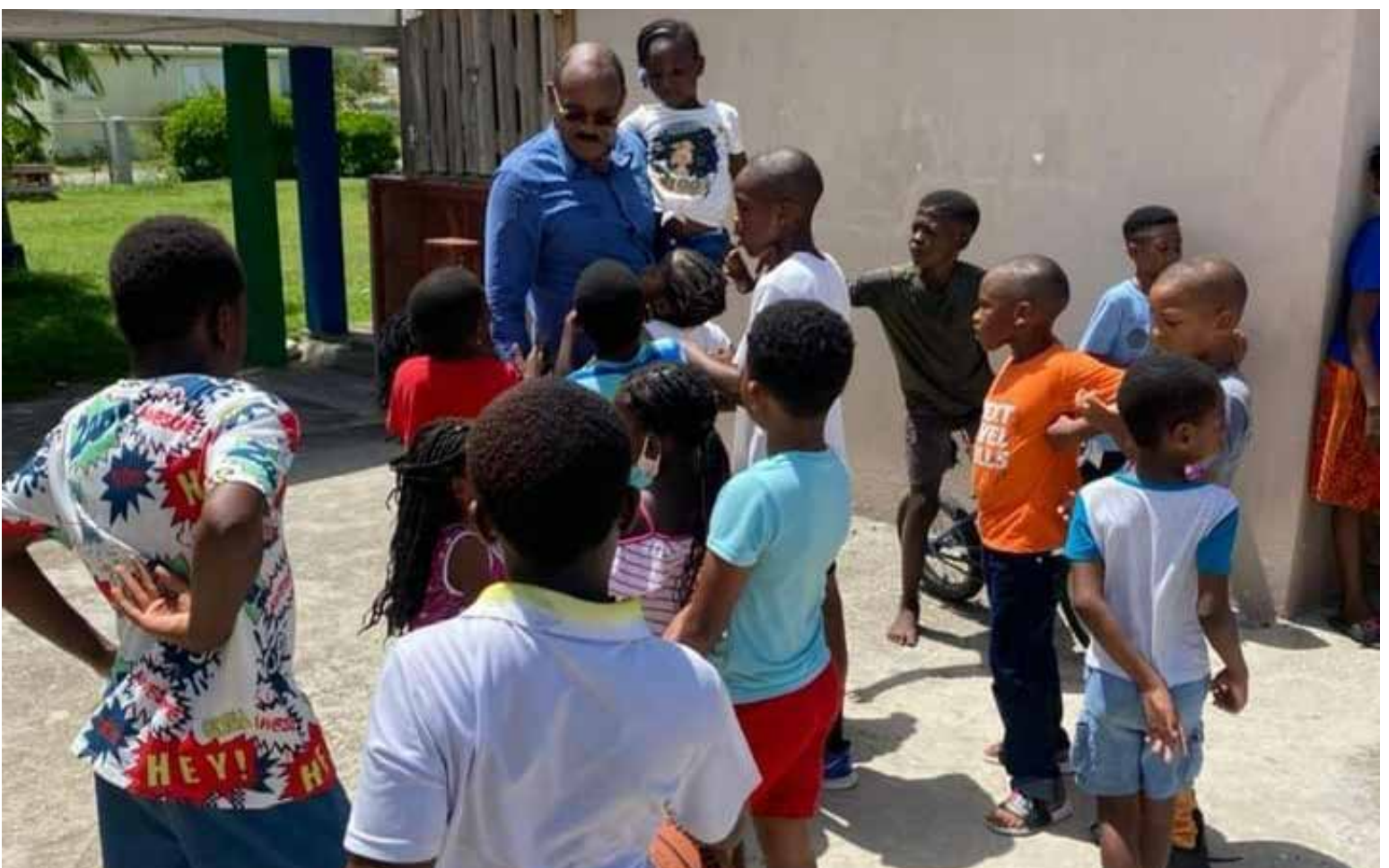
Prime Minister Gaston Browne dedicated his afternoon on Tuesday to the children attending his annual summer camp at the Villa Primary School. Over 75 children are enjoying a week-long, fun, adventurous, educational and engaging summer programme sponsored by PM Browne and Team City West.