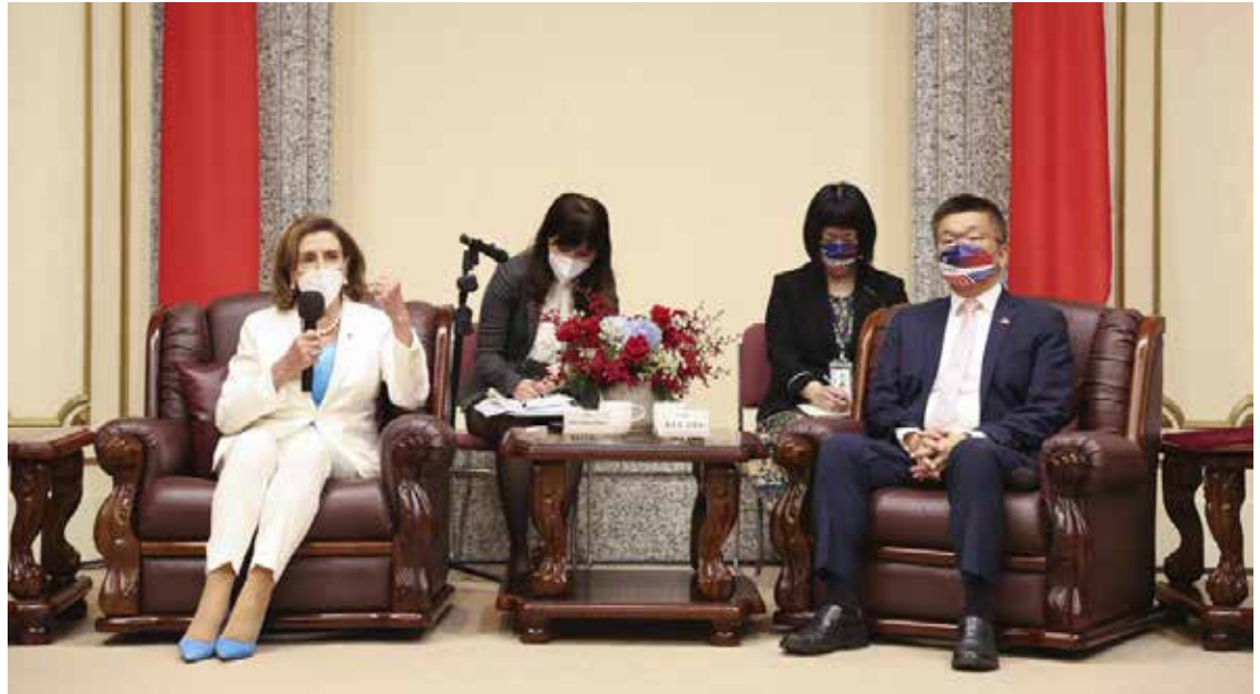
In this photo released by the Taiwan Legislative Yuan, U.S. House Speaker Nancy Pelosi, left, speaks during a meeting with Legislative Yuan Deputy Speaker Tsai Chi-chang in Taipei, Taiwan, Wednesday, Aug. 3, 2022. China announced Tuesday, Aug. 16, 2022, is imposing visa bans and other sanctions on a number of Taiwanese political figures including Tsai over their promotion of the self-governing island democracy's independence from Beijing.

Pelosi’s visit was followed by nearly two weeks of threatening Chinese military exercises that included the firing of missiles over the island and incursions by navy ships and warplanes across the midline of the