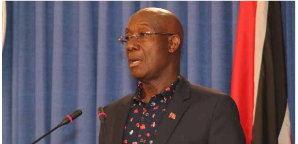
Prime Minister of Trinidad and Tobago, Dr. Keith Rowley