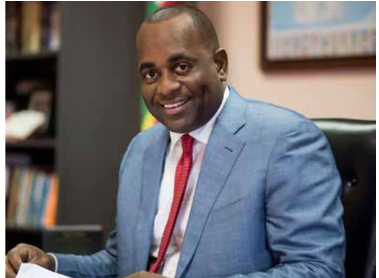
Prime Minister of Dominica, Roosevelt Skerrit

"The Caribbean as a region will need more than US$40 billion to finance adaptation efforts and disaster recovery. Over the last few years, many of our countries have not fared well. Small ocean economies gain in negotiating strength and influence when we work effec-