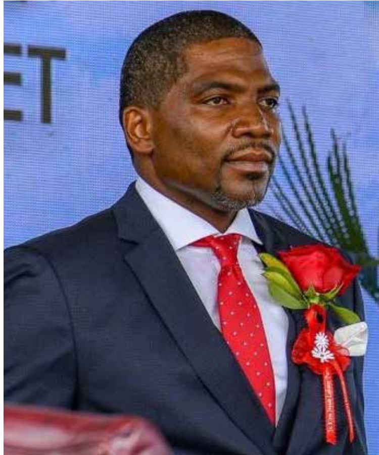
Prime Minister of St. Kitts and Nevis, Dr. Terrance Drew

During the meeting one police officer said that his mental health has been affected since he was denied promotion based on the