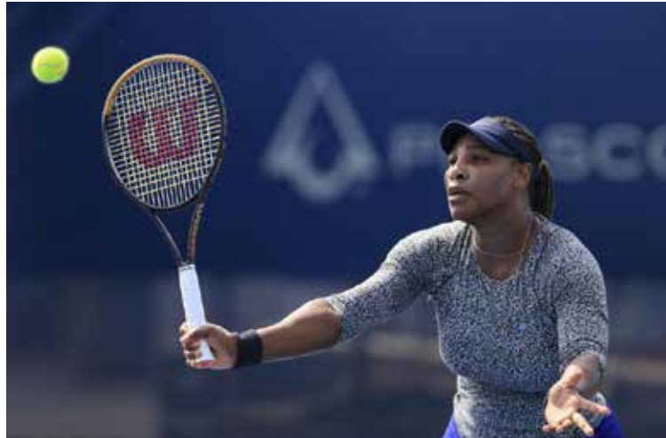
Serena Williams plays a return during a practice session ahead of the Western & Southern Open tennis tournament, Monday, Aug. 15, 2022, in Mason, Ohio.

The marquee match scheduled for Tuesday night at this hard-court U.S. Open tuneup was Serena Williams against Emma Radu-