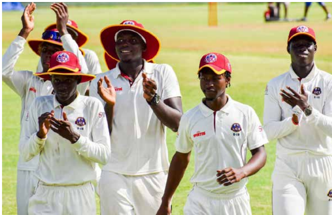
The Leeward Islands players leave the field at the lunch break during their CWI Rising Stars Under-19 Championship opening round match against the Windward Islands at Arnos Vale playing field in St Vincent on 11th August, 2022.