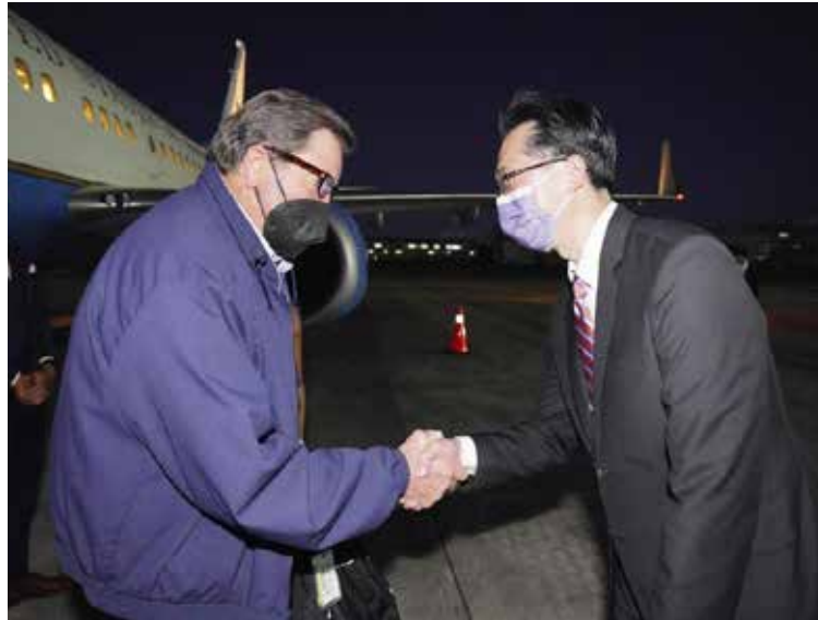
In this photo released by the Taiwan Ministry of Foreign Affairs, from left, U.S. Democratic House members John Garamendi shakes hands with Donald Yu-Tien Hsu, Director-General, dept. of North American Affairs, Taiwan's Ministry of Foreign Affairs after arriving on a U.S. government plane at Songshan airport in Taipei, Taiwan on Sunday, Aug 14, 2022. The delegation of American lawmakers is visiting Taiwan just 12 days after a visit by U.S. House Speaker Nancy Pelosi that angered China.

A Taiwanese broadcaster showed video of a U.S. government plane landing about 7 p.m. Sunday at Songshan Airport in Taipei, the Taiwanese capital. Four members of the delegation were on the plane. Markey