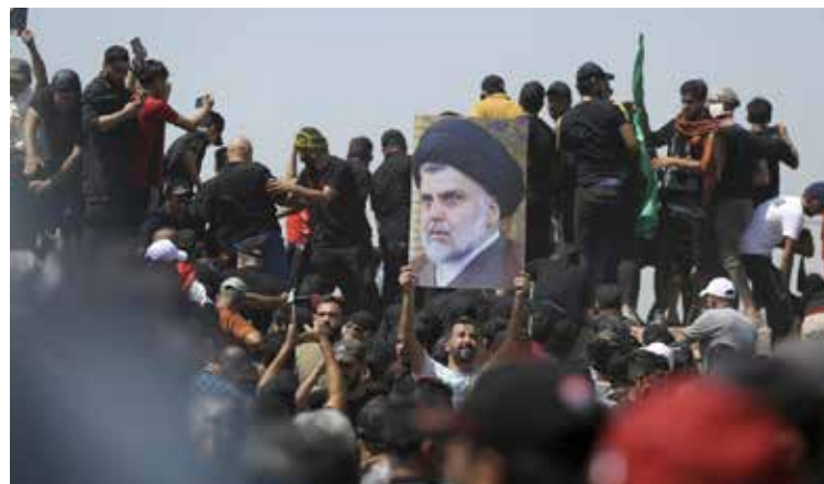
A protester holds a poster depicting Shiite cleric Muqtada al-Sadr on a bridge leading towards the Green Zone area in Baghdad, Iraq, Saturday, July 30, 2022 — days after hundreds breached Baghdad's parliament Wednesday chanting anti-Iran curses in a demonstration against a nominee for prime minister by Iran-backed parties.

emboldened by the silence of the 92-year-old al-Sistani, a revered spiritual figure whose word holds enormous sway among leaders and ordinary Iraqis.