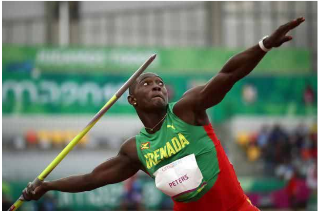
Grenadian javelin champion, Anderson Peters

“The facts are still unknown, but the persons involved are currently assisting the police with the investigation, which we expect will be swift. As a government, we unequivocally condemn the violence of any kind and call on all citizens and visitors to maintain