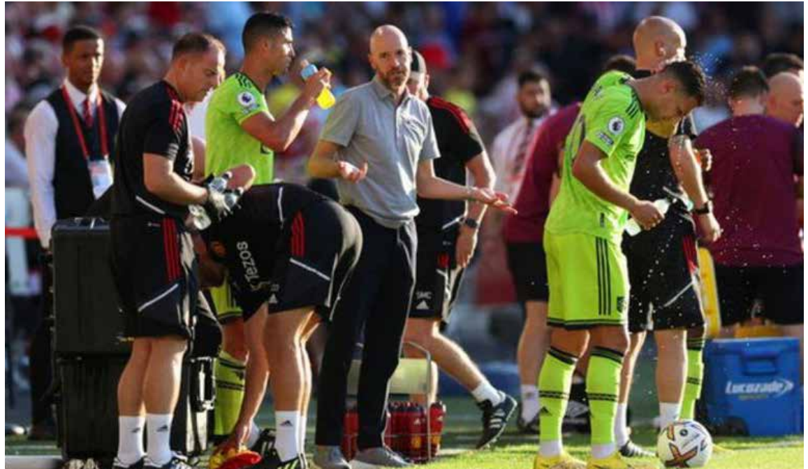
Erik ten Hag's Manchester United enjoyed 67% of the possession against Brentford but still lost 4-0

They continue to try and bring in the new players that Ten Hag feels are essential to his rebuild and