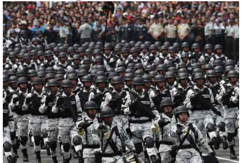
Members of Mexico's National Guard march in the Independence Day military parade, in the capital's main plaza, the Zócalo, in Mexico City, Sept. 16, 2019. Mexico's President Andres Manuel Lopez Obrador has begun exploring plans to side-step congress to hand formal control of the National Guard to the army. That has raised concerns, because Lopez Obrador won approval for creating the force in 2019 by pledging in the constitution that it would be under nominal civilian control and that the army would be off the streets by 2024.

Mexico's army has been deeply involved in policing since the start of the 2006 drug war. But its presence