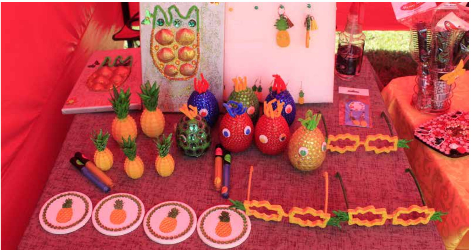
A beautiful display at this year's PiAngo Festival. The pineapple and mango festival, which was held on Saturday and Sunday at Cades Bay near Urlings, heralded the successful return of the popular event which was well attended by both vendors and patrons. Story on page 4