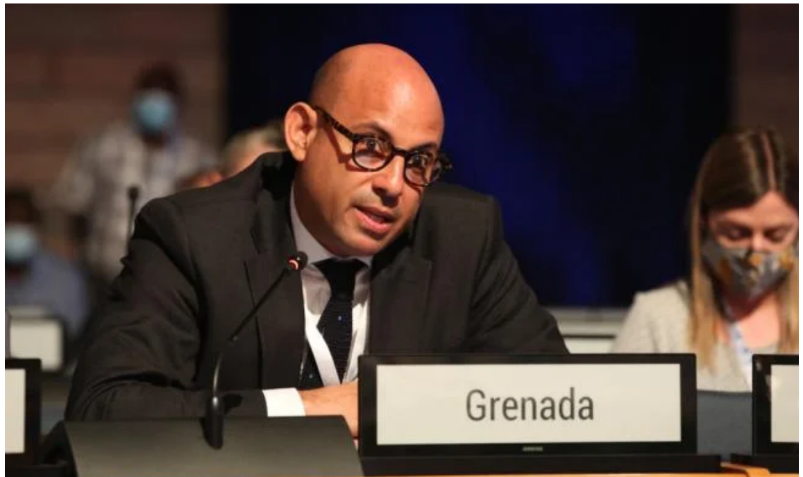
Grenada's former environment minister Simon Stiell is set to head the United Nations Framework Convention on Climate Change.

The UNFCCC has declined to comment, but many media outlets including Reuters and Climate Home News, said Stiell, who was appointed to Gre-