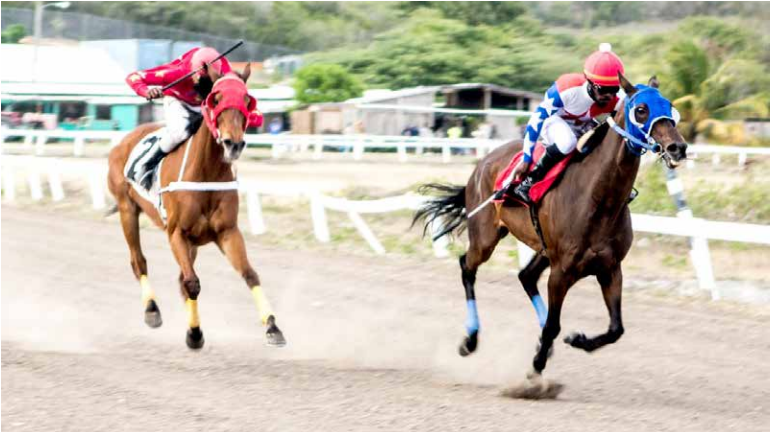
Lynn's Image, right, was one of the horses that journeyed from Antigua to Barbuda for the Whit weekend Caribana festivities. (File Photo)

Four of the horses based in Antigua recorded wins on the sister isle during a horse racing meet that was held as part of Barbuda's Caribana festivities over the recent Whit weekend.