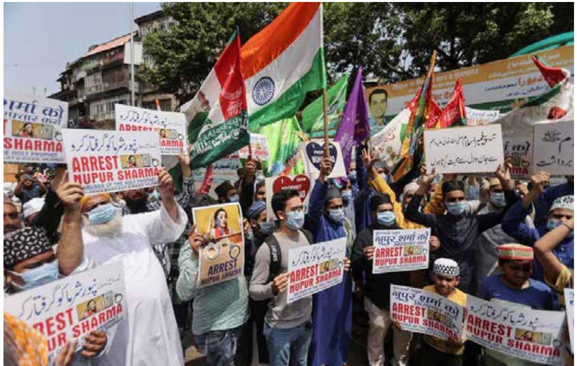
People holding placards shout slogans demanding the arrest of Bharatiya Janata Party (BJP) member Nupur Sharma for her blasphemous comments on Prophet Mohammed, on a street in Mumbai, India, June 6, 2022.

With about 110 million members, mainly Hindus, the BJP is the world's largest political party, while Muslims comprise around 13% of India's 1.35 billion popu-