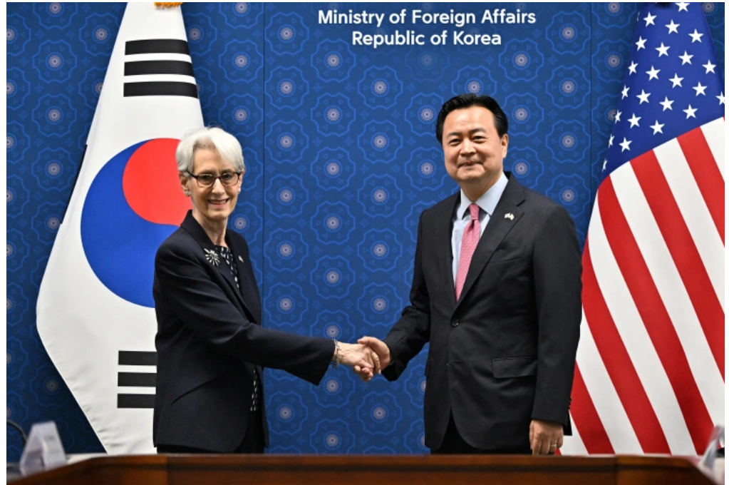
US Deputy Secretary of State Wendy Sherman (left) has warned of a ‘forceful’ response if N Korea tests a nuclear weapon

annex to the reported Centrifuge Enrichment Facility, so the annex is now externally complete. Near the light water reactor (LWR), we have observed that the new building that had been under construction since April 2021 has been completed, and construction has started on two adjacent buildings,” IAEA Chief Rafael Grossi said in his quarterly statement to the Board on Monday.