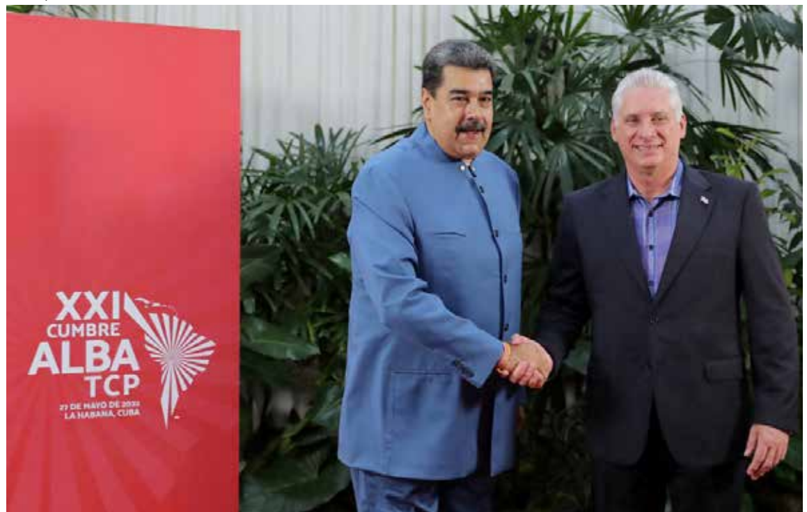
Venezuelan President Nicolas Maduro shakes hands with his Cuban counterpart Miguel Diaz-Canel during the ALBA group meeting in Havana, Cuba, May 27, 2022.

The boycott by Mexican President Andres Manuel Lopez Obrador and some other leaders could diminish the relevance of the summit in Los Angeles, where the United States aims to address regional migration and economic challenges. President Joe Biden, a Democrat, hopes to repair Latin America relations damaged under his Republican predecessor, Donald Trump, reassert U.S. influence and counter China's inroads.