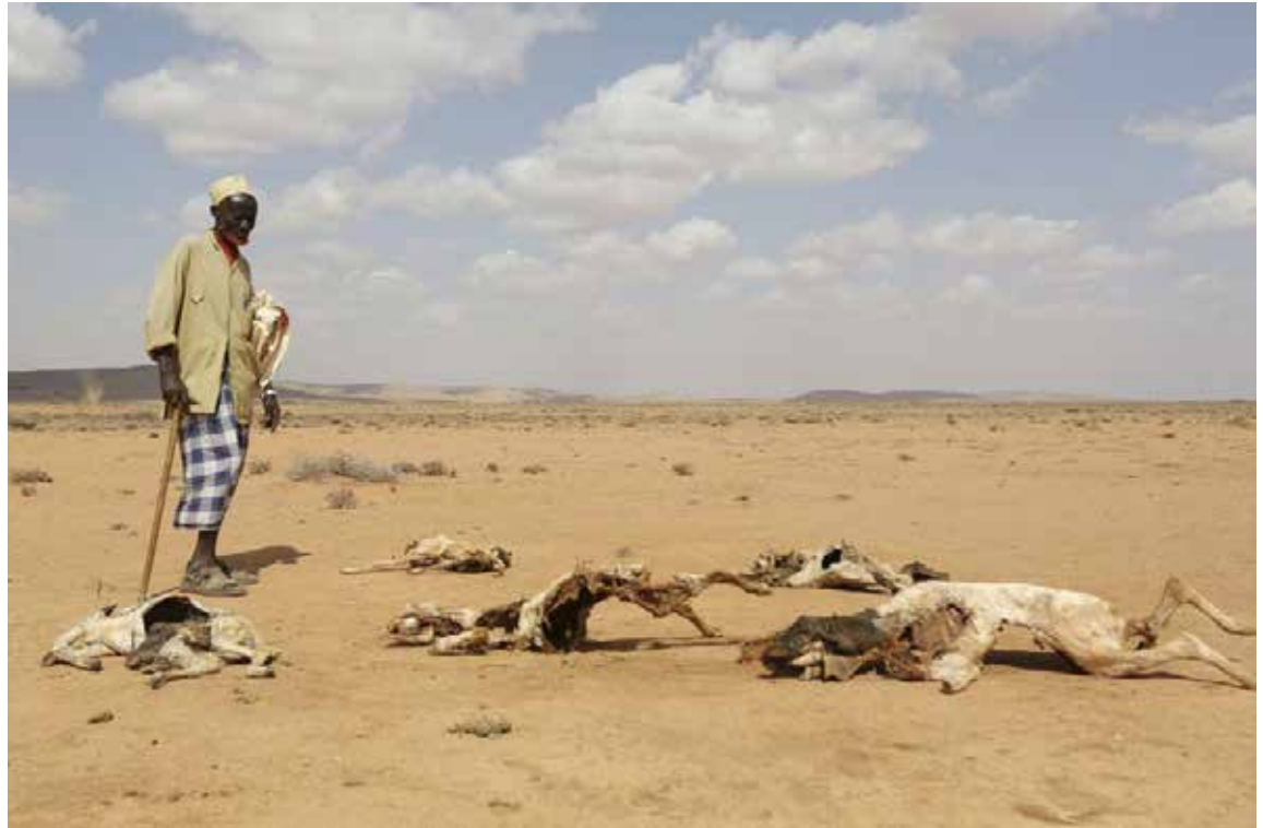
A man looks at the carcasses of animals that died due to the El Nino-related drought in Marodijeex town of southern Hargeysa, in northern Somalia's semi-autonomous Somaliland region, April 7, 2016. Picture taken April 7, 2016.

Somalia has 386,000 children in urgent need of treatment for life-threatening malnutrition, numbers that are already higher than the 340,000 children who needed treatment in 2011,