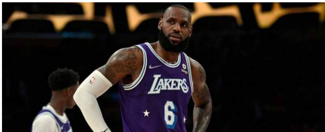
LeBron James has won four NBA titles, including one with the Los Angeles Lakers in 2020

“The best comparison that I can use for the modern reader is to imagine