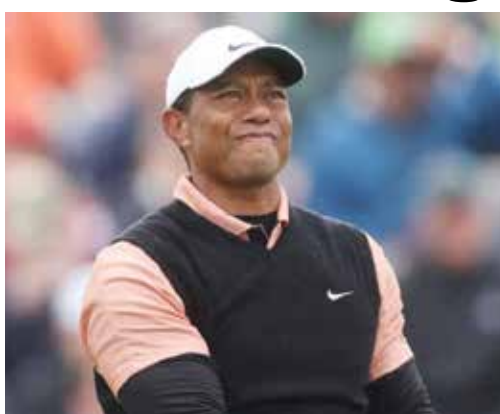
Tiger Woods has won 15 majors during his career

Woods added: “I do hope and plan to be ready to play in Ireland at the JP McManus Pro-Am and at The Open next month. I’m excited to get back out there soon.”