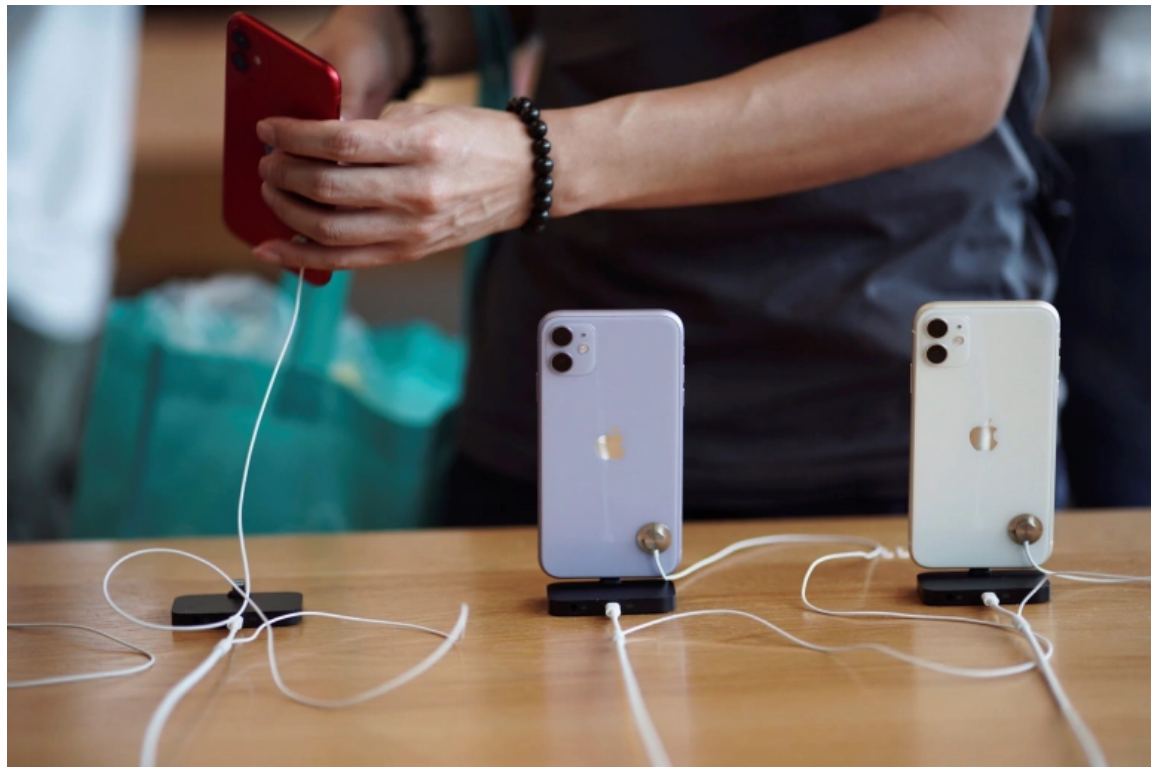
The EU's move is a blow to Apple, whose iPhones are charged with Lightning cables

with mobile phones in 2018 had a USB micro-B connector, while 29 percent had a USB-C connector and 21 percent a Lightning connector, according to a 2019 study by the European Commission, the EU's executive arm.