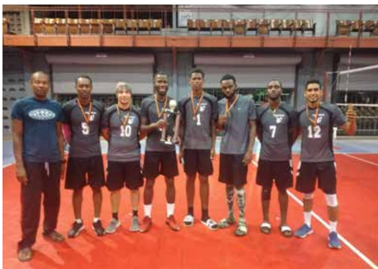
Stoneville pose with their trophy after retaining their men's volleyball championship.