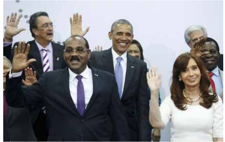
Antigua and Barbuda's Prime Minister Gaston Browne (front left), former US President Barack Obama (centre) and Argentina's former President Cristina Fernandez de Kirchner (front right), wave during a group photo at the first plenary session of the Summit of the Americas in Panama City, Panama April 11, 2015.

Regarding Venezuela, the US appears willing to allow Venezuelan oil into the US, especially now that