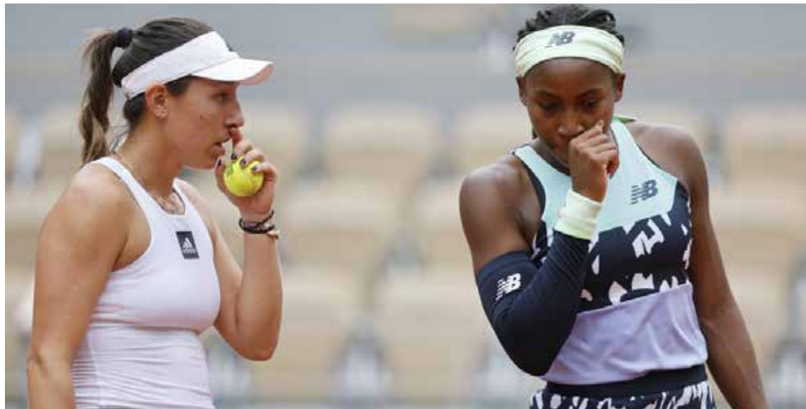
Coco Gauff of the U.S., right, and Jessica Pegula of the U.S. talk as they play France's Caroline Garcia and France's Kristina Mladenovic during their women's doubles final match of the French Open tennis tournament at the Roland Garros stadium Sunday, June 5, 2022 in Paris.

Last year's French Open champion in singles and doubles, Barbora Krejickova, lost in the first round of singles this time — only the third woman in the professional era to exit in the first