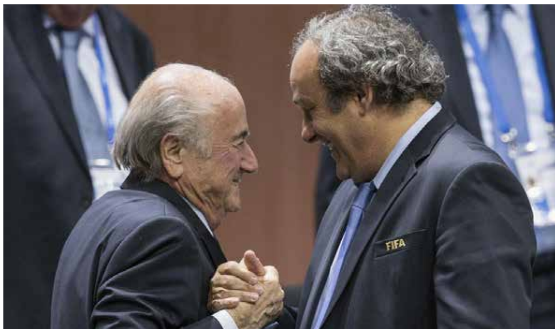
FIFA president Sepp Blatter is greeted by UEFA President Michel Platini, right, after Blatter's re-election as president at the Hallenstadion in Zurich, Switzerland, on May 29, 2015. Sepp Blatter and Michel Platini enter a criminal court Wednesday charged with defrauding world soccer body FIFA. It's an 11-day trial of two men, once the most powerful in the world's favourite sport.

Both have long denied wrongdoing and claim they had a verbal deal in 1998. That defence first failed with judges at the FIFA ethics committee, which banned them from soccer,