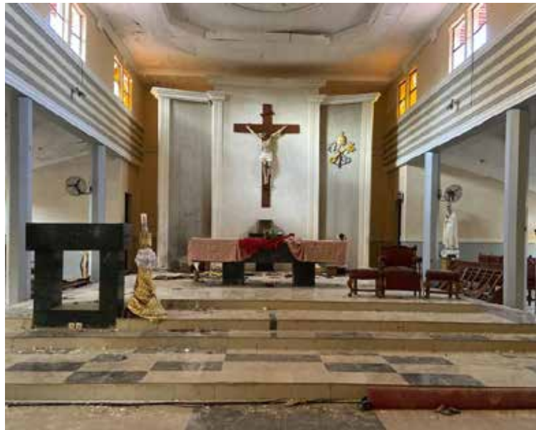
A view of the St. Francis Catholic Church in Owo Nigeria, Sunday, June 5, 2022. Lawmakers in southwestern Nigeria say more than 50 people are feared dead after gunmen opened fire and detonated explosives at a church. Ogunmolasyi Oluwole with the Ondo State House of Assembly said the gunmen targeted the St Francis Catholic Church in Ondo state on Sunday morning just as the worshippers gathered for the weekly Mass.

"The attack is undoubtedly terrorist in nature, and the scale and brutality suggests it was carefully planned rather than impulsive," said Eric Humphery-Smith, senior Africa an-