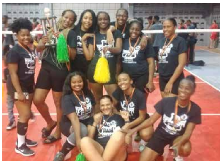
Cool & Smooth Da Squad celebrate after winning their first national women's volleyball at the YMCA Sports Complex on Saturday, 4th June.

Meanwhile, Stoneville recovered from a poor start to overcome Michael Free-land Enforcers 3-2 in the keenly contested final to capture their fifth men's division title.