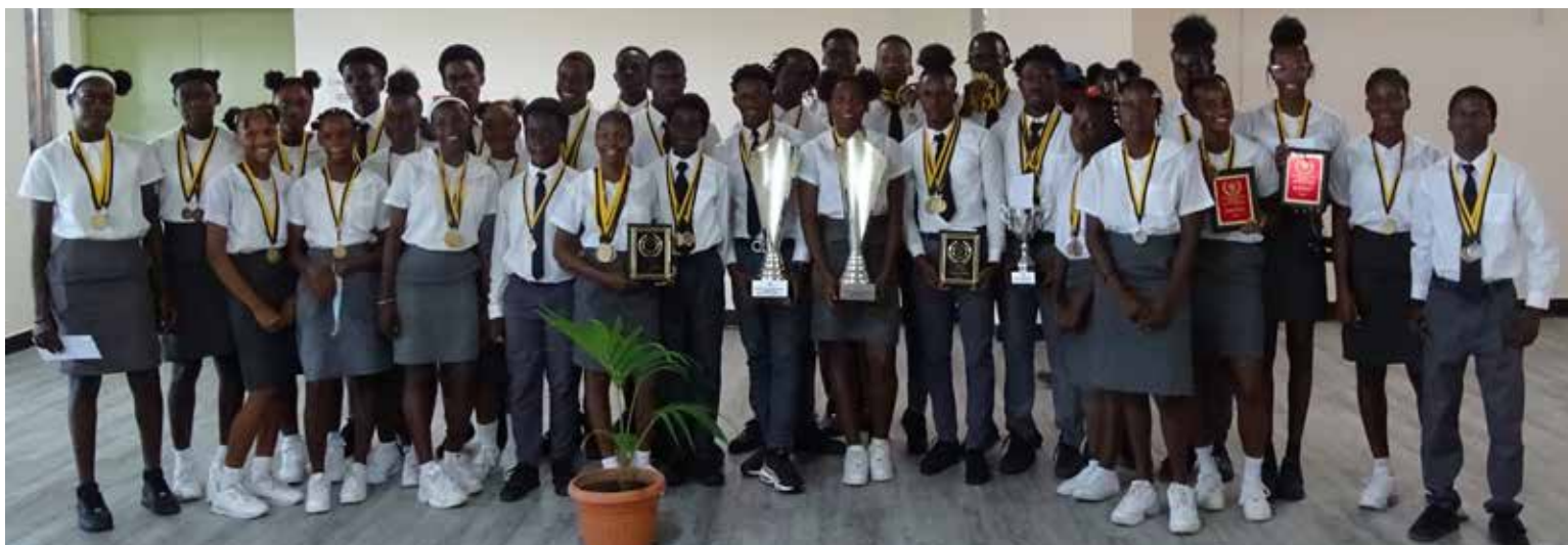
Princess Margaret School celebrates during the 2022 Interschool Athletics Championships Awards Ceremony in the Presidential Suite at the Sir Vivian Richards Stadium on Saturday, 4th June.