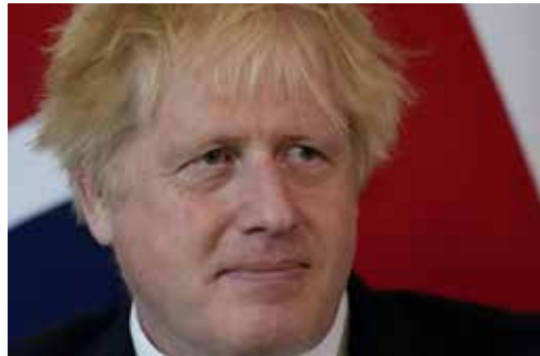
British Prime Minister Boris Johnson listens to the Emir of Qatar Sheikh Tamim bin Hamad Al Thani speak at the start of their meeting inside 10 Downing Street, in London, Tuesday, May 24, 2022.

The vote share in support of Mr Johnson was lower than the 63% re-