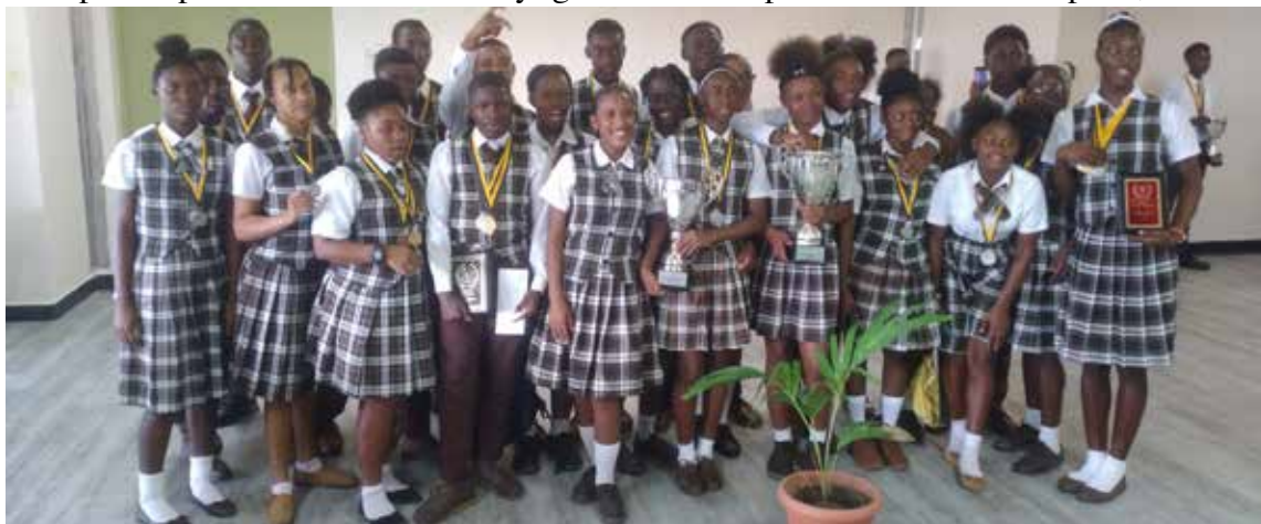
Ottos Comprehensive School at the 2022 Interschool Athletics Championships Awards Ceremony.