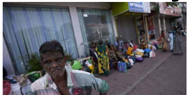
People wait expecting to buy kerosine oil outside a fuel station in Colombo, Sri Lanka, Sunday, June 5, 2022.

"The next couple of months will be the most difficult ones of our lives," he told the nation fed up with long lines, sky-rocketing inflation and daily protests that seem to be getting out of control.