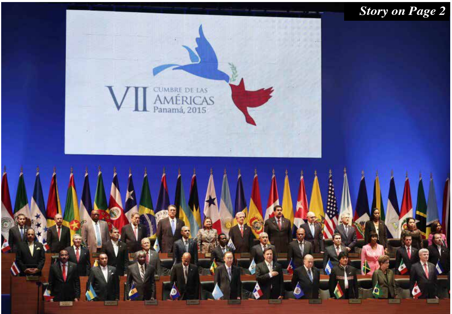
PM Gaston Browne (front row, extreme left) at the 2015 Summit of the Americas in Panama.