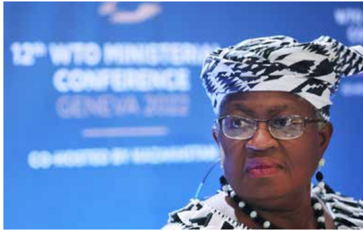
World Trade Organization (WTO) Director-General Ngozi Okonjo-Iweala attends a news conference ahead of the Ministerial Conference (MC12) in Geneva, Switzerland, June 12, 2022.

“I wish I could say for better. It has certainly become more complex,” she told a news conference before the meeting, listing the