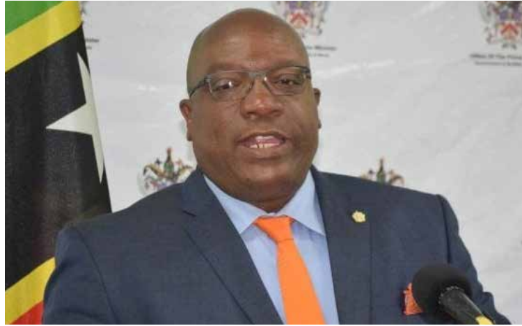
St. Kitts and Nevis' Prime Minister, Dr. Timothy Harris

The letter was sent by the St. Kitts Christian Council; the St. Kitts Evangelical Association; the Nevis Christian Council; the Nevis Evangelical Association; The St. Kitts