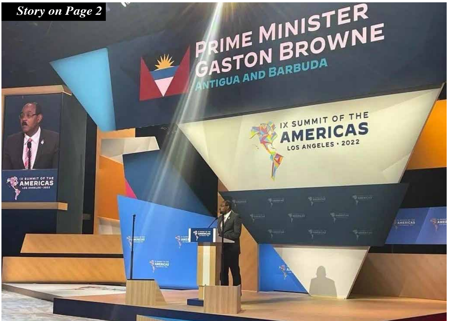
Prime Minister Gaston Browne during his address to the just concluded Summit of Americas in Los Angeles, California.