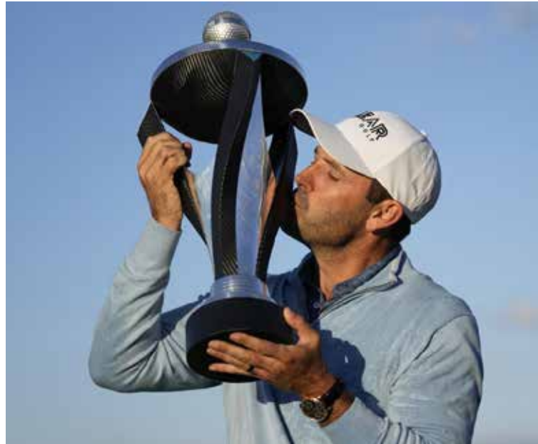
Charles Schwartzel of South Africa kisses the trophy as he poses for the media after he won the inaugural LIV Golf Invitational at the Centurion Club in St Albans, England, Saturday, June 11, 2022.

"Never in my wildest dreams did I think we could