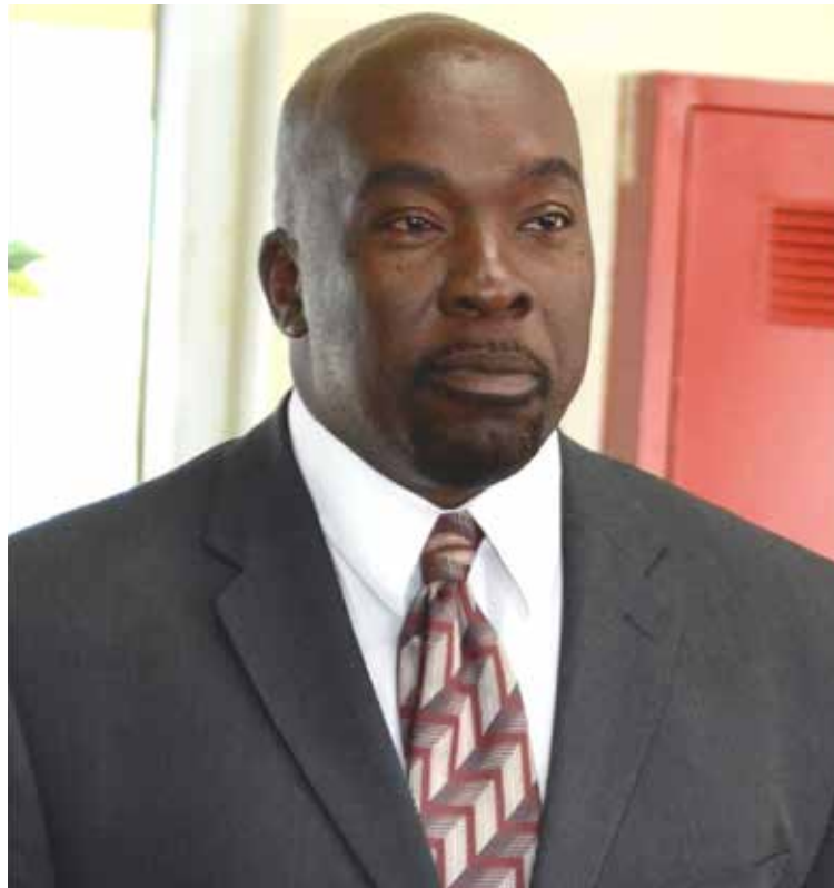
Information Minister Melford Nicholas

"It is incredulous for the opposition to have ignored the recommendations to