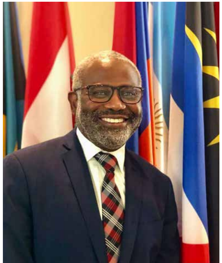
Ambassador Conrod Hunte