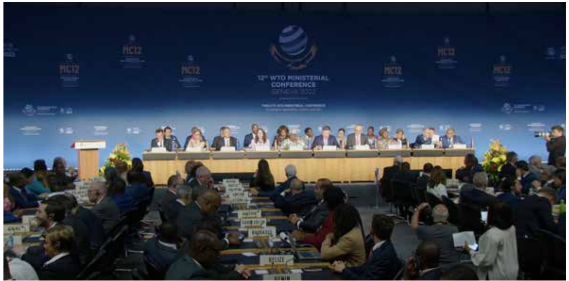
The World Trade Organization's 12th Ministerial Conference in Geneva, Switzerland, June 12, 2022.