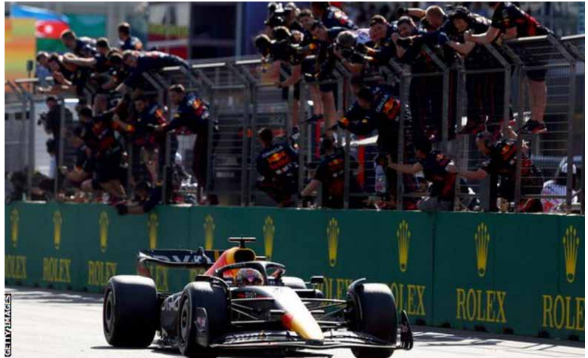
Verstappen won the 25th race of his career

under pressure from Verstappen, but was able to hold the Dutchman off until a virtual safety car period on lap nine caused by Sainz parking up in a run-off area.